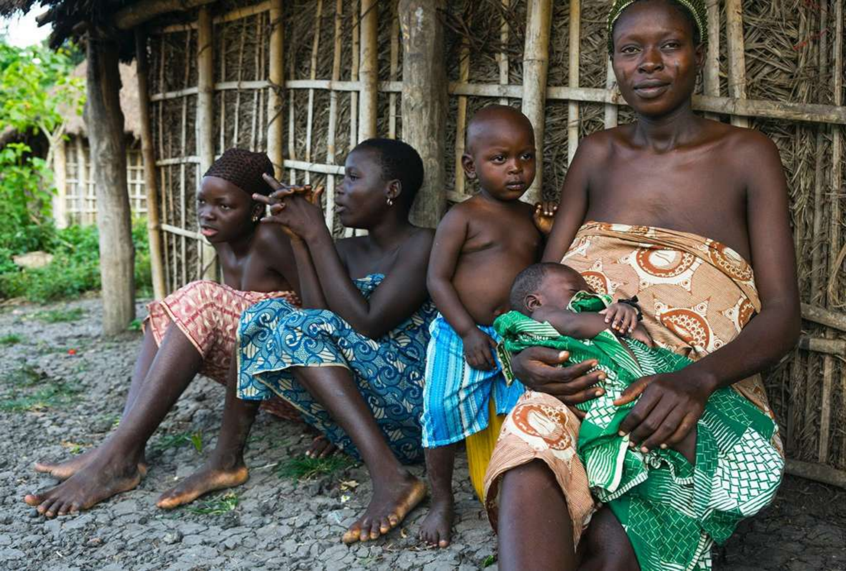
Giving babies scars is also a way to communicate an important message to them: the world they are born into is tough and they must be ready to suffer.