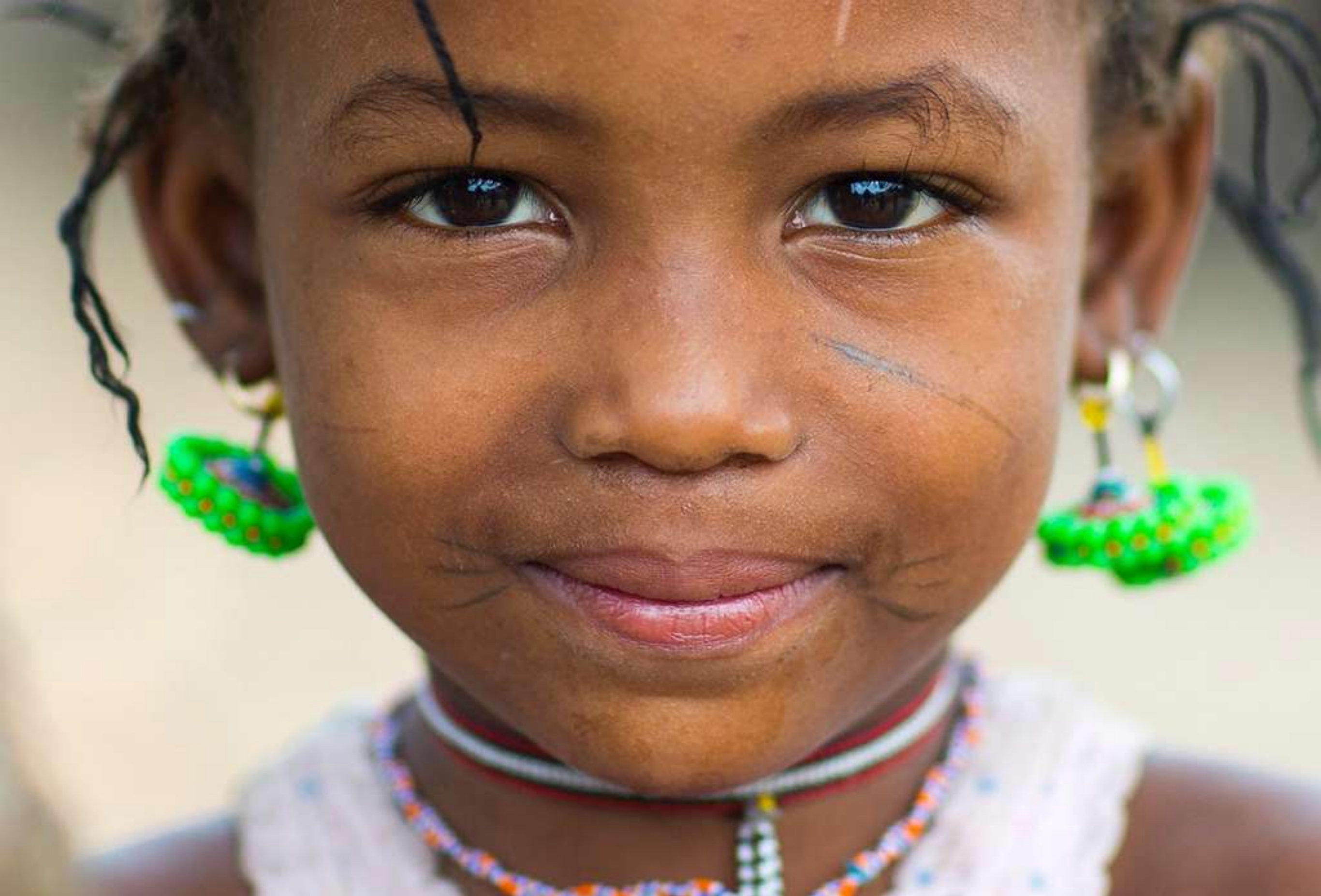
During a sort of Fulani baptism, a girl receives her first scars. They are just around her mouth and make her resemble a little cat.