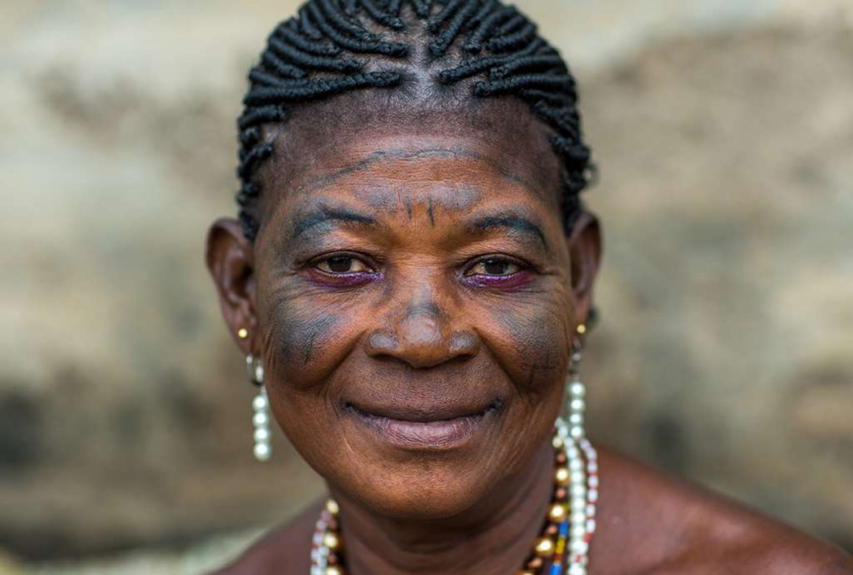
In the Fon tribe, whose members actively practice voodoo as their primary religion, these markings signify a voodoo priestess.