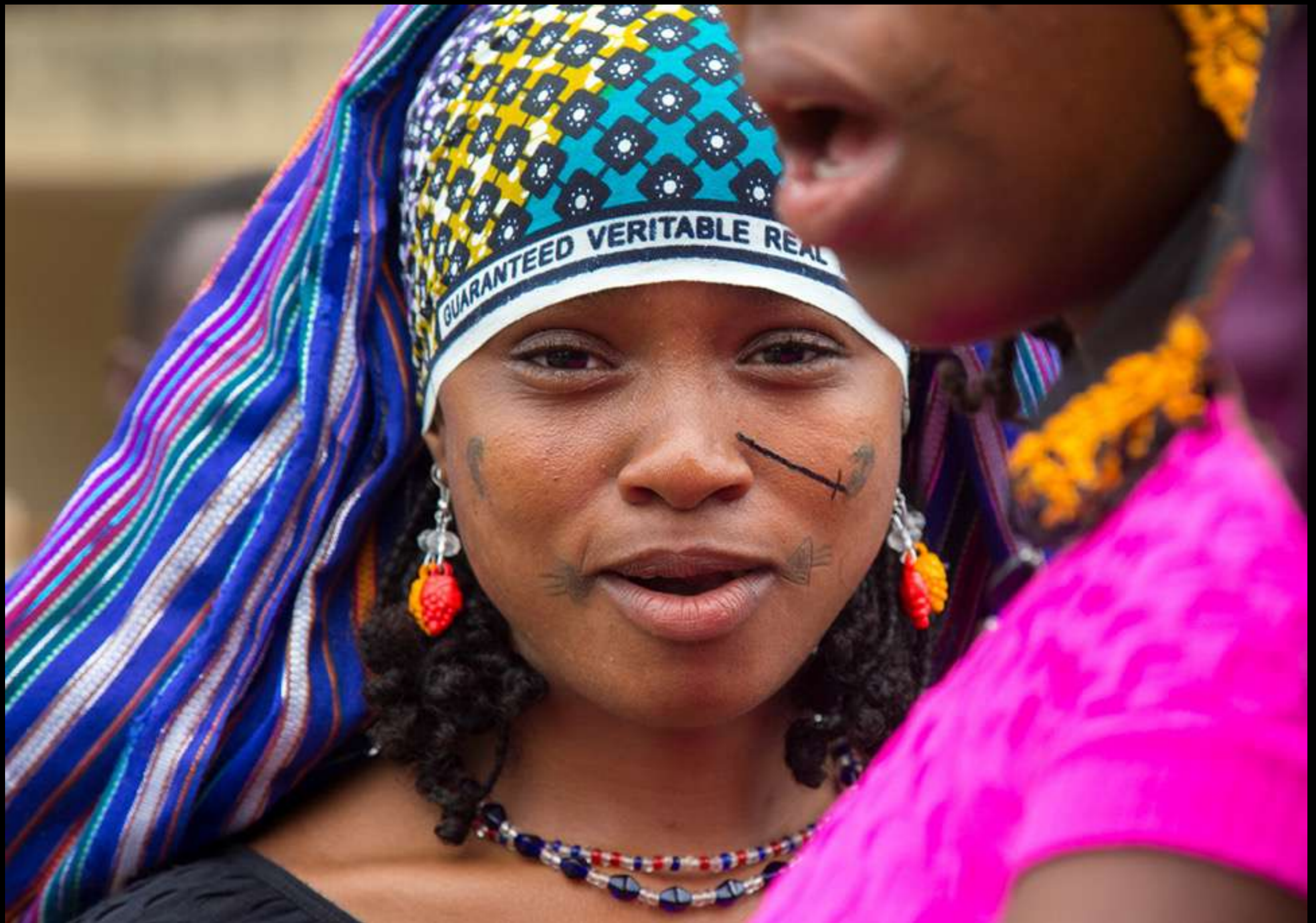
The Fulani are a subset of the Peul people, nomadic cattle herders who inhabit many countries across Africa. In Benin, they are famous for the tattoos the women wear on the month corners.