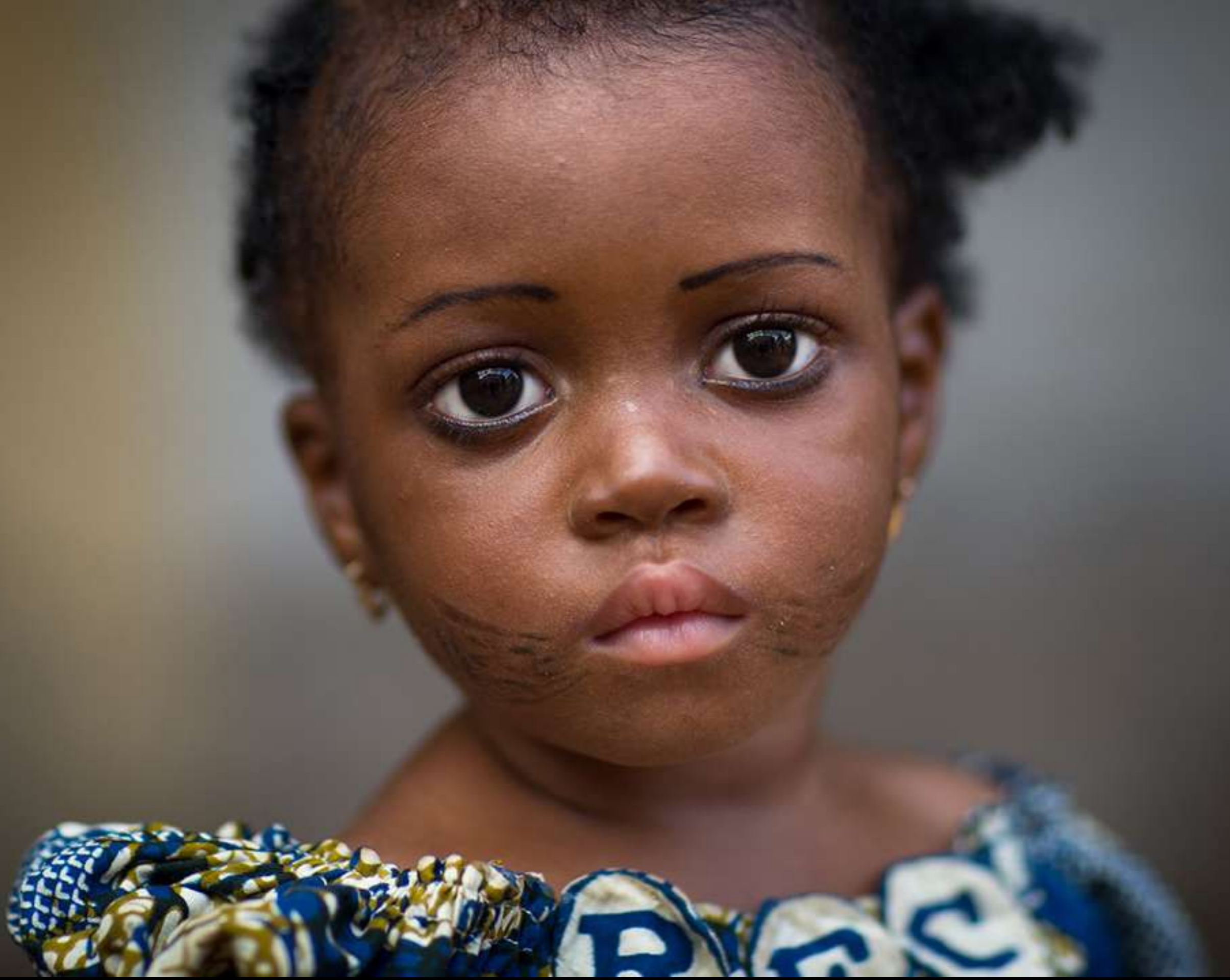
The Bariba ethnic group gives their 2 year-old girls facial scars around the mouth.