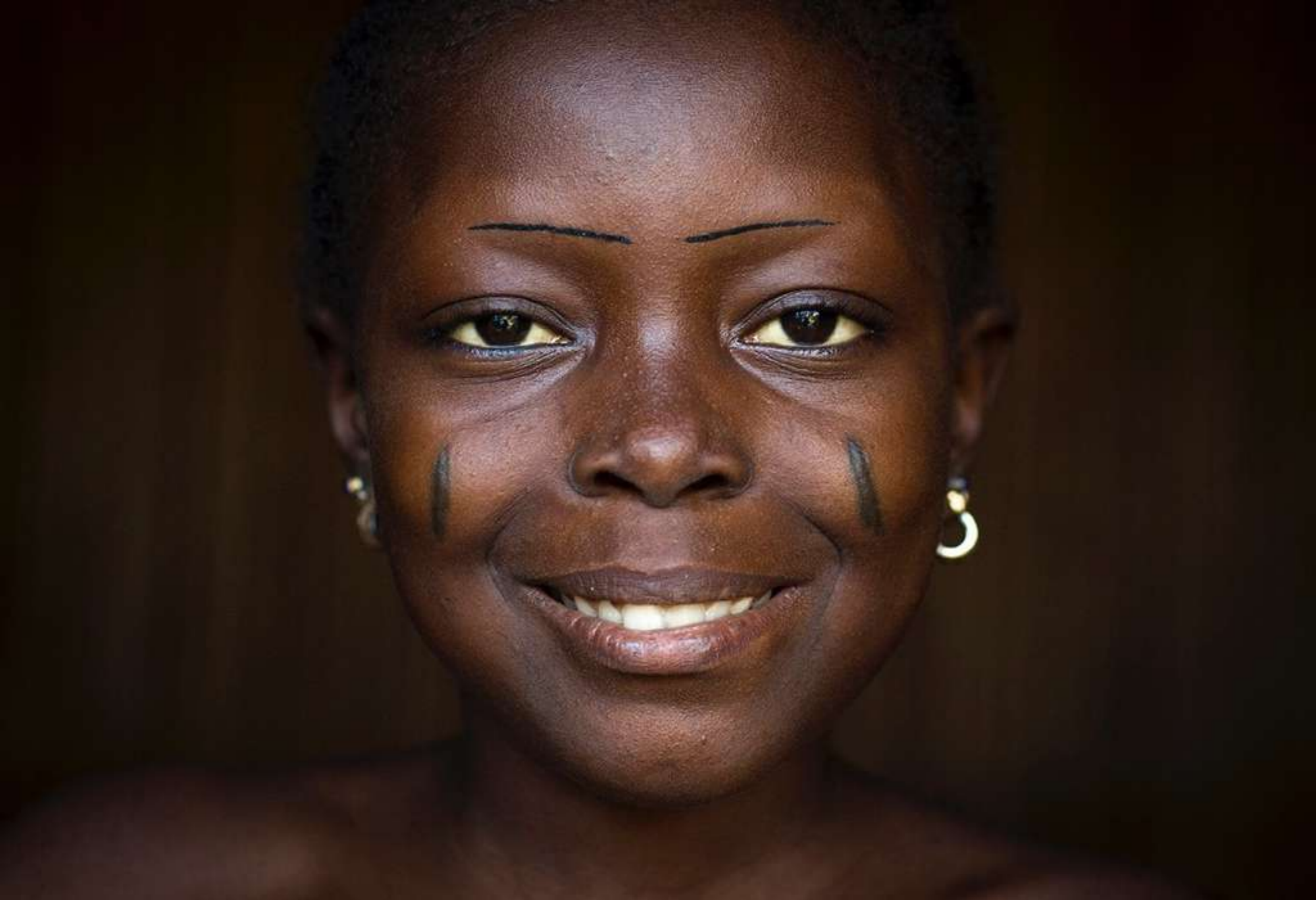
The Holi women often fill their scars with black powder. These dyed tattoos are usually on their cheeks and eyebrows which they sometimes shave. These scars have become a sort of makeup.