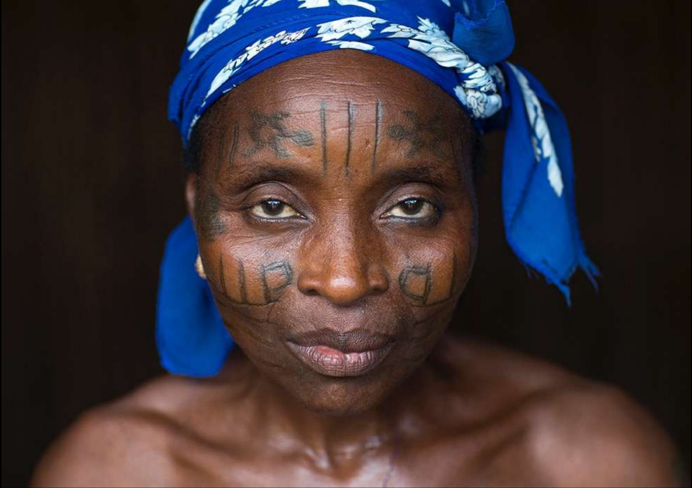
Scarification is also seen as a way to connect a woman to her ancestors and receive their protection in Holi tribe.