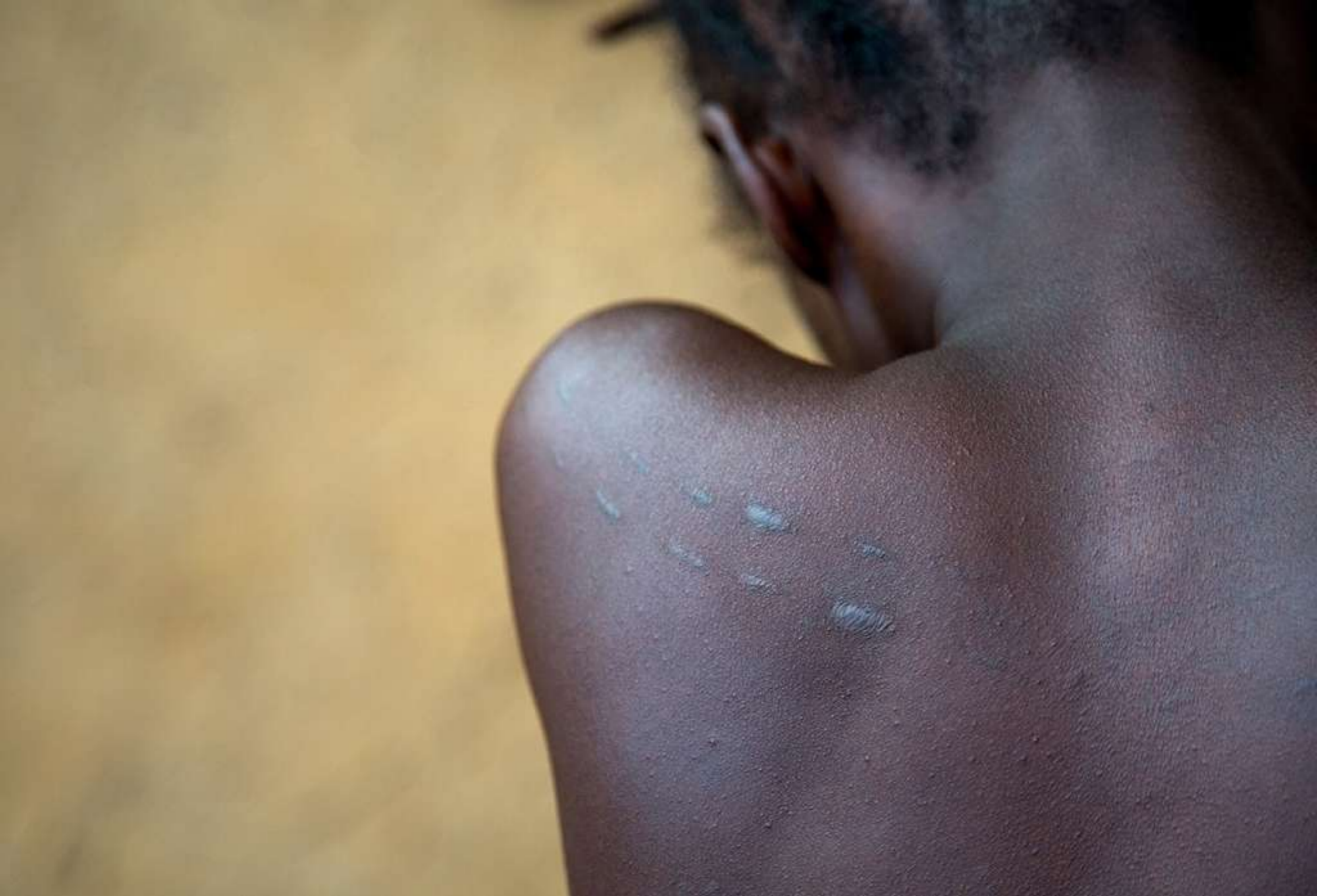
Pregnant Otammari women are given additional scarifications on their backs that are said to bring them good luck and health.