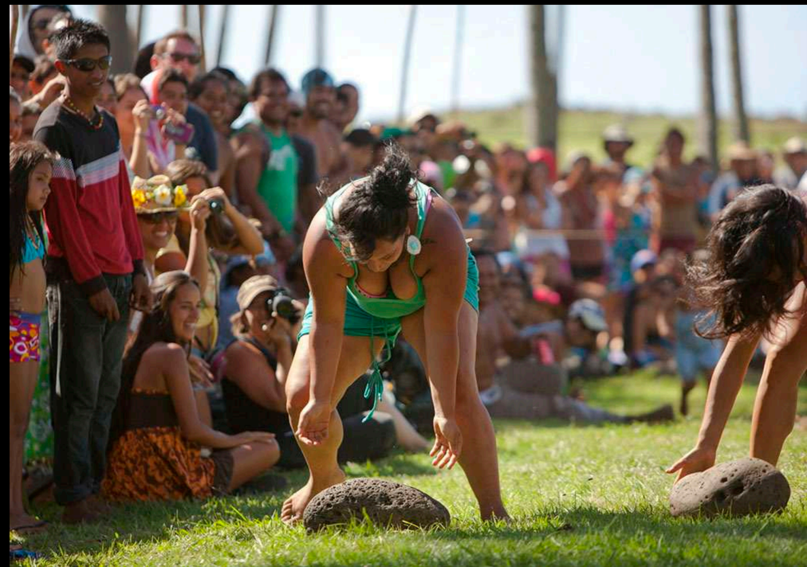
On the Anakena beach, while the men take part in a heavy rock-lifting contest, the women take part in races during which they have to stones in front of themselves. Each point counts, and the competition is ferocious.