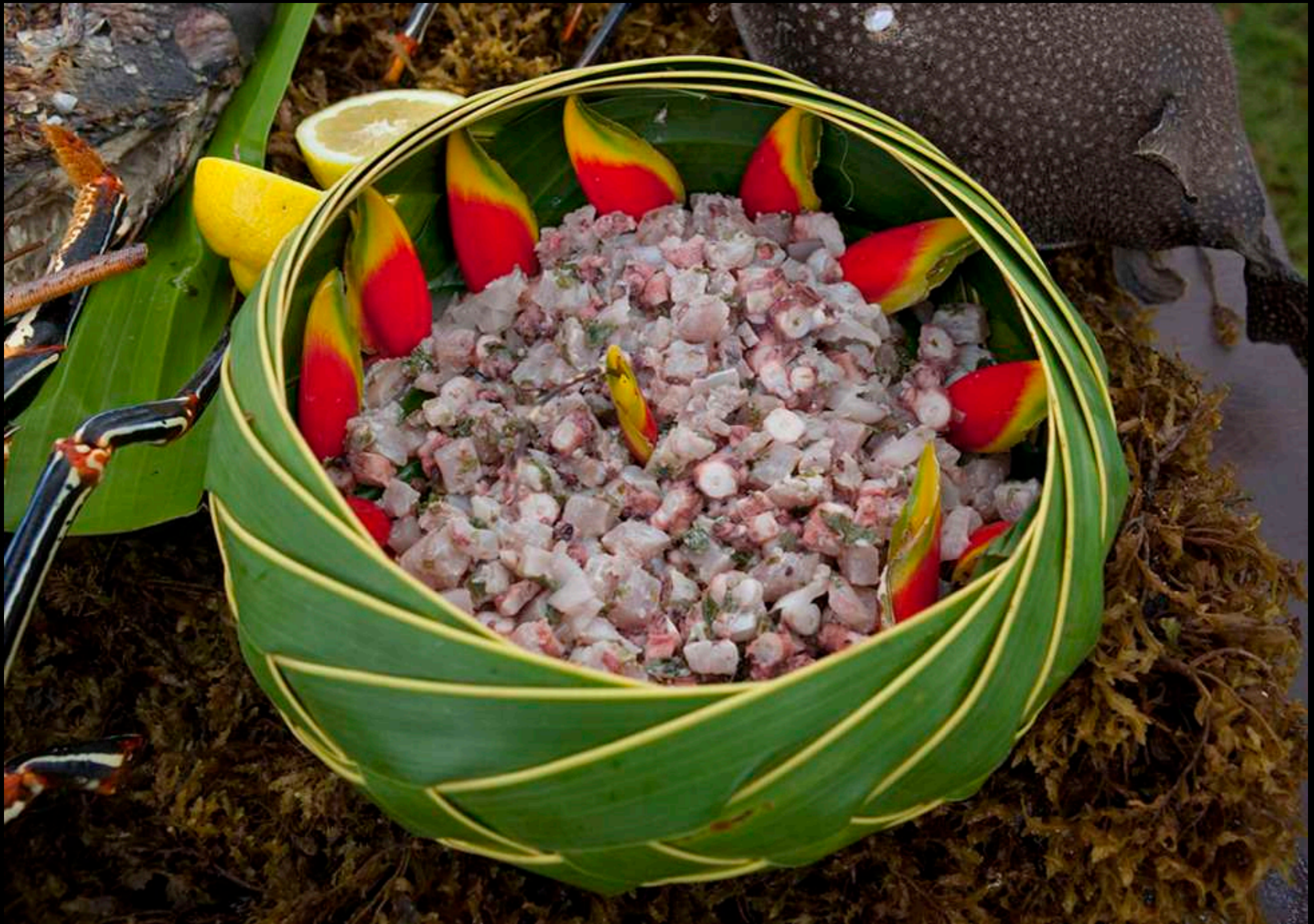
One of the events consists of presenting traditional dishes to the jury. Here you can see a Ceviche, an Easter Island specialty: a raw fish marinade to which is added tomatoes, avocados, and onions... Appearance is everything, the jury doesn't taste anything!