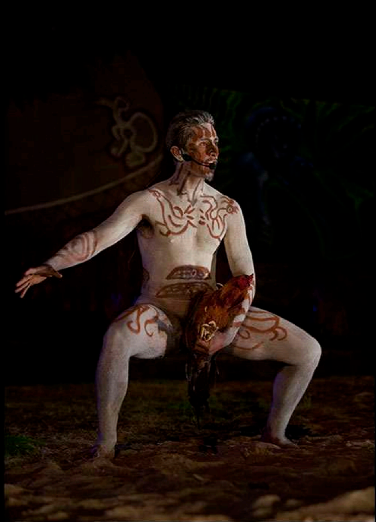
The Takona: body paintings require a long preparation behind the scenes. In a quasi-religious silence and in dimness, the warriors get ready, then bound onto the stage to tell the stories about their ancestors' feats.