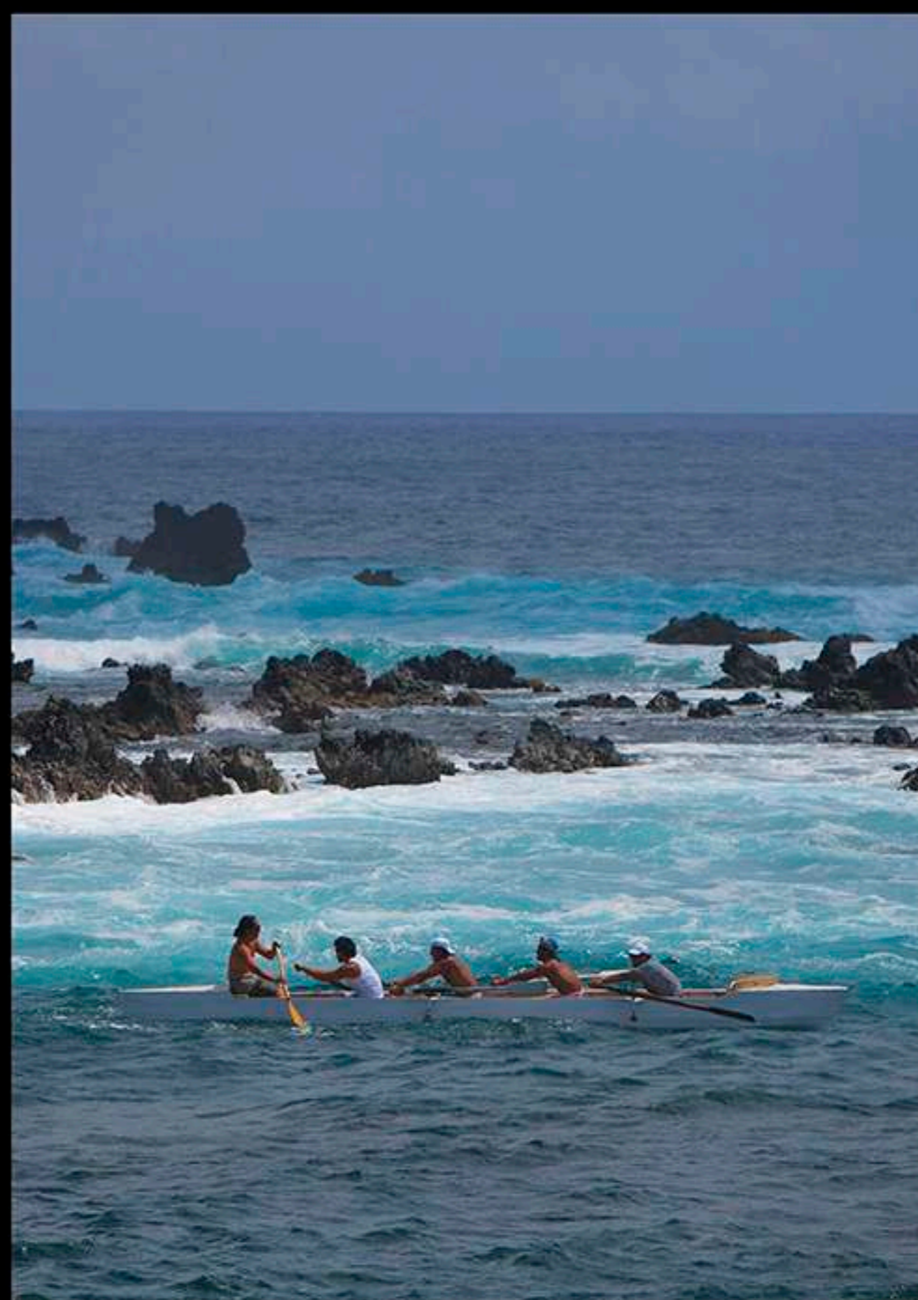
The participants will dance, sing, surf, swim, lift rocks, throw javelins, sculpt and even row along the Hanga Roa coast. Tattoos are a part of Easter Island's culture and many tourists give in to the appeal of a permanent souvenir of their stay.