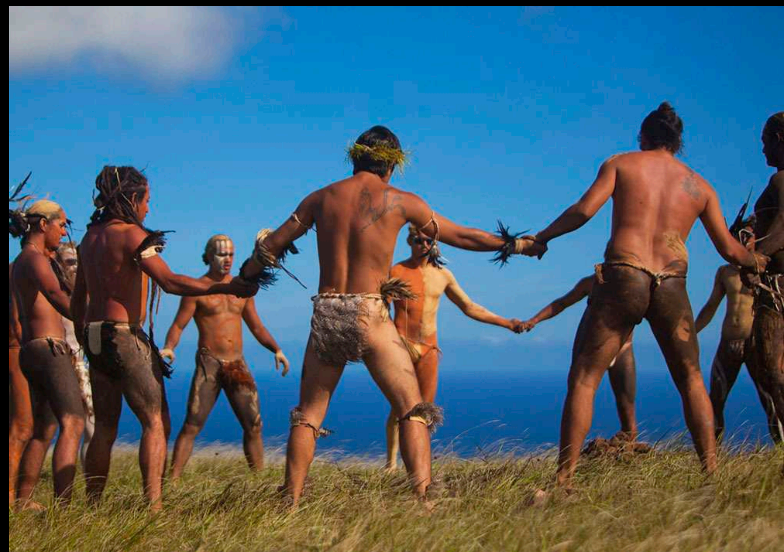
After covering themselves in tribal illustrations, the participants gather at the summit of the Maunga Pu'i volcano to get ready before the descent. The main aim is to arrive safe and sound at the bottom. Accidents aren't uncommon.