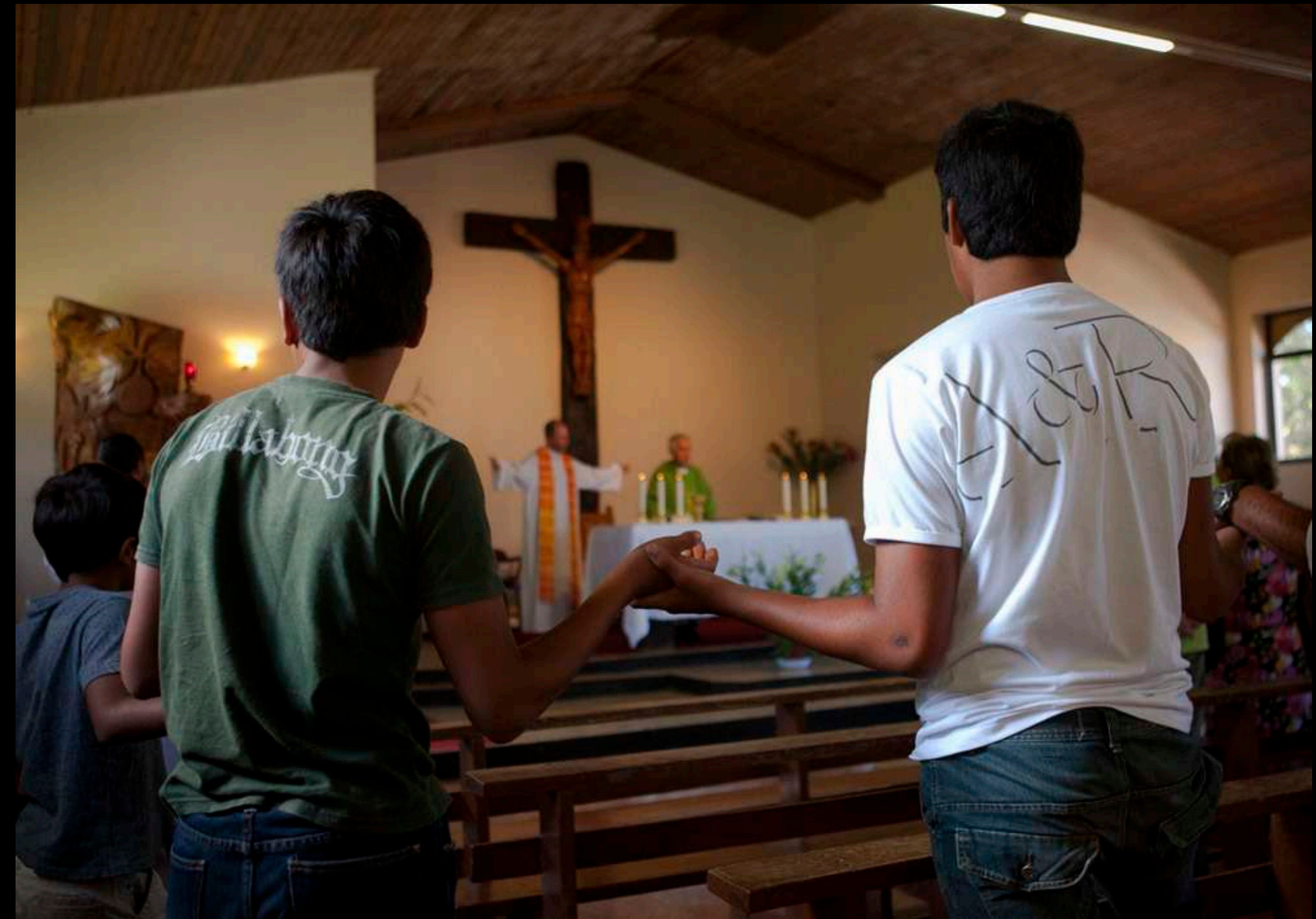
The most dangerous competition is the Haka Pei: plunging down a hill at 80 km/h on banana tree trunks. The year's novices say an obligatory prayer the day before...