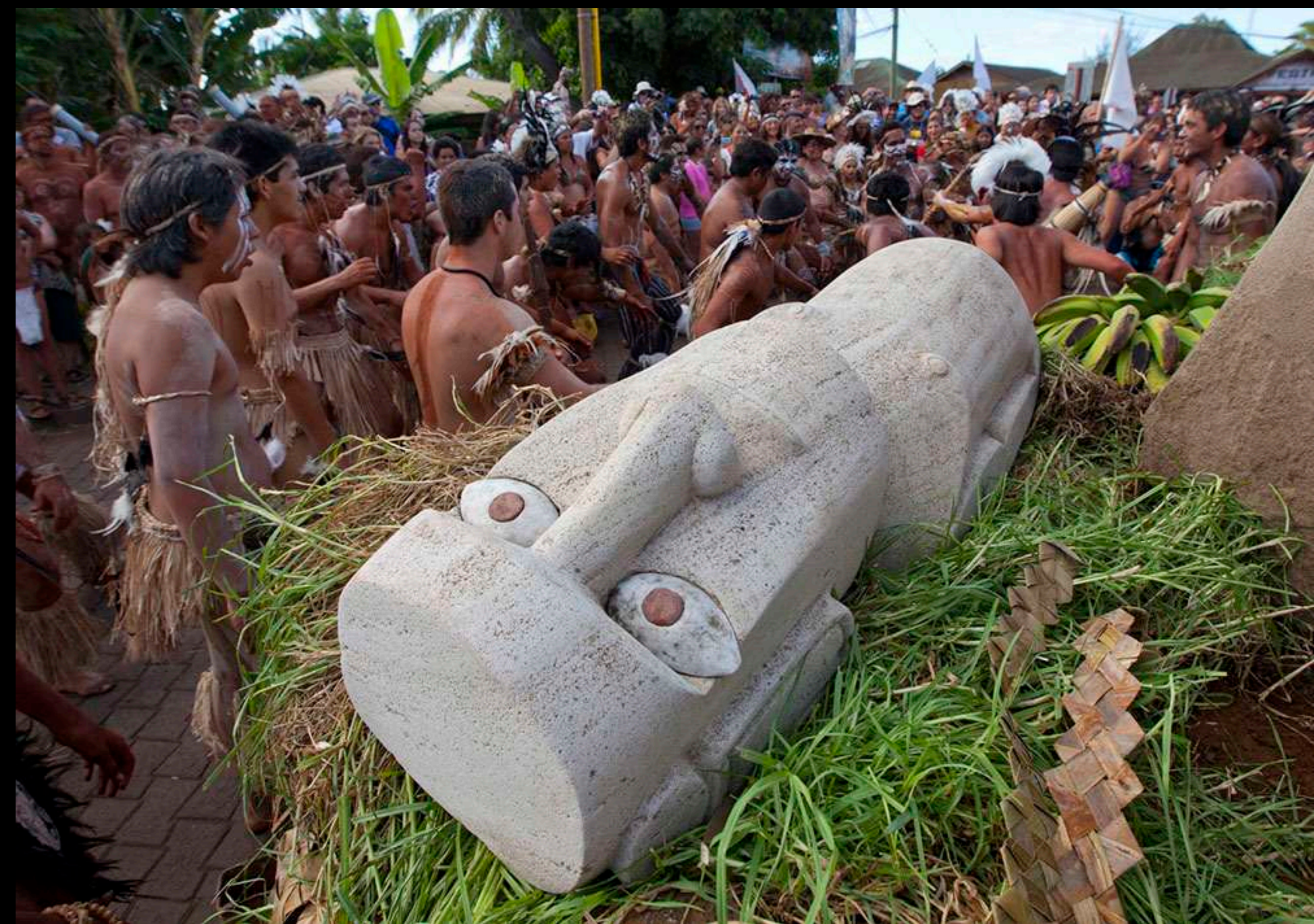
The carnival roams the streets of Hanga Roas, lead by warriors who perform a Haka while citing phrases from the famed Moais, who draw in 65000 tourists every year to the island.