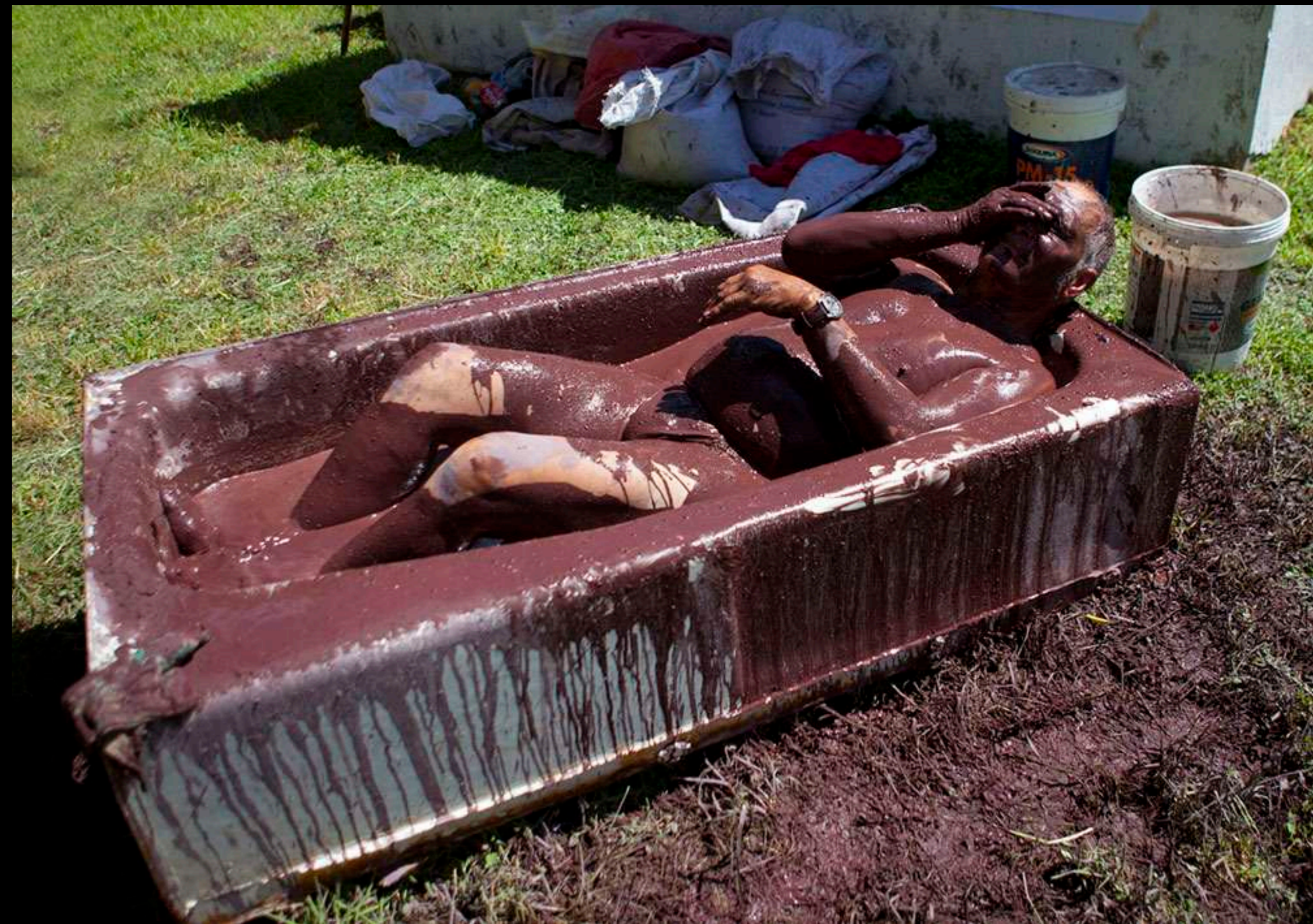
The festival ends with a carnival, which mingles inhabitants and tourists. As per tradition, everyone bathes in a volcanic mud, the Kiea, and a one sized G-string made from foliage is worn to stunning effect.