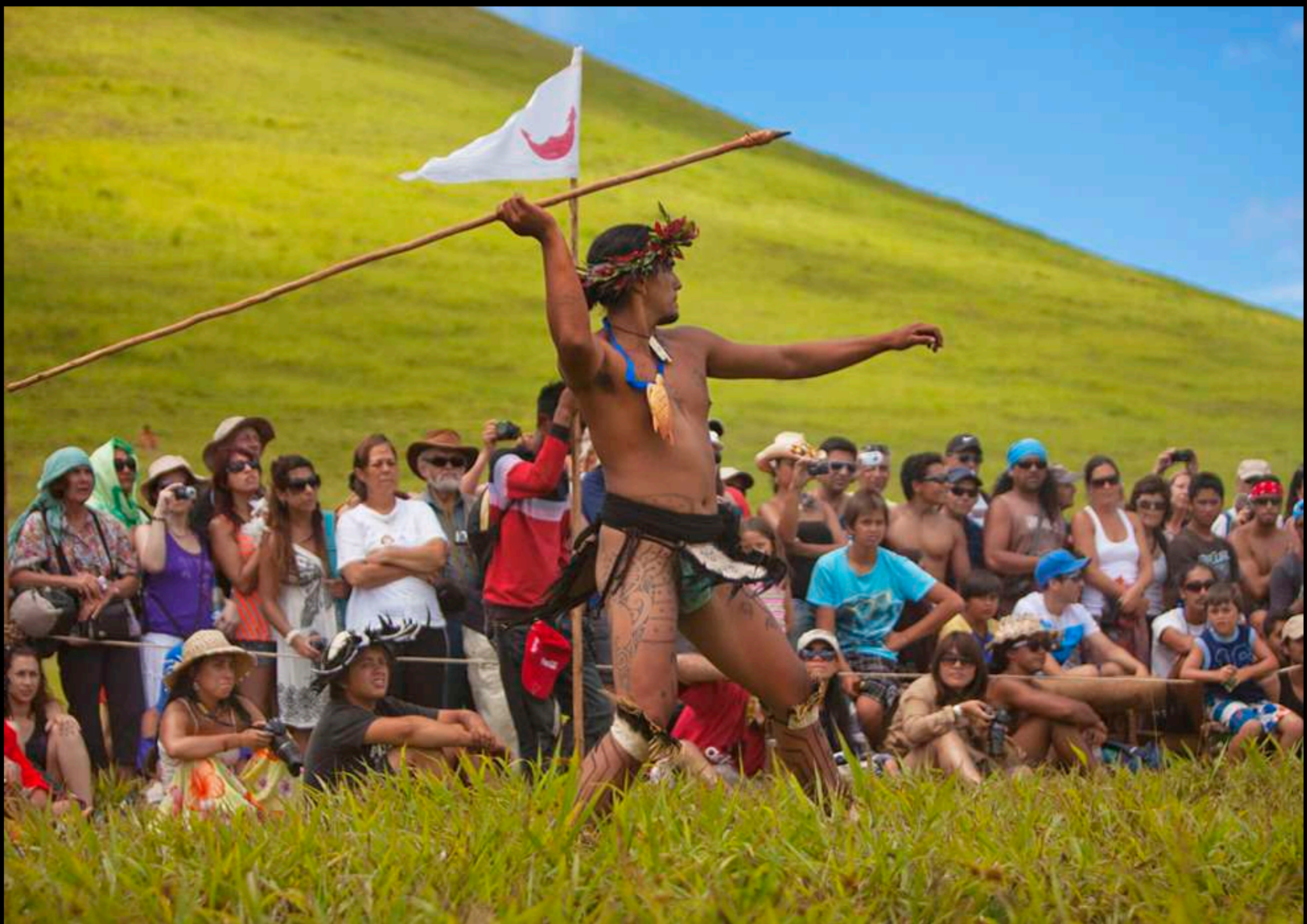
This event consists of planting a spear into a banana tree trunk, which is 20 meters away. Only two competitors will manage it. The athletes are often dancers who perform for tourists at Hanga Roa, and who every year take part in a sexy calendar, which enjoys a great success with the female tourists.