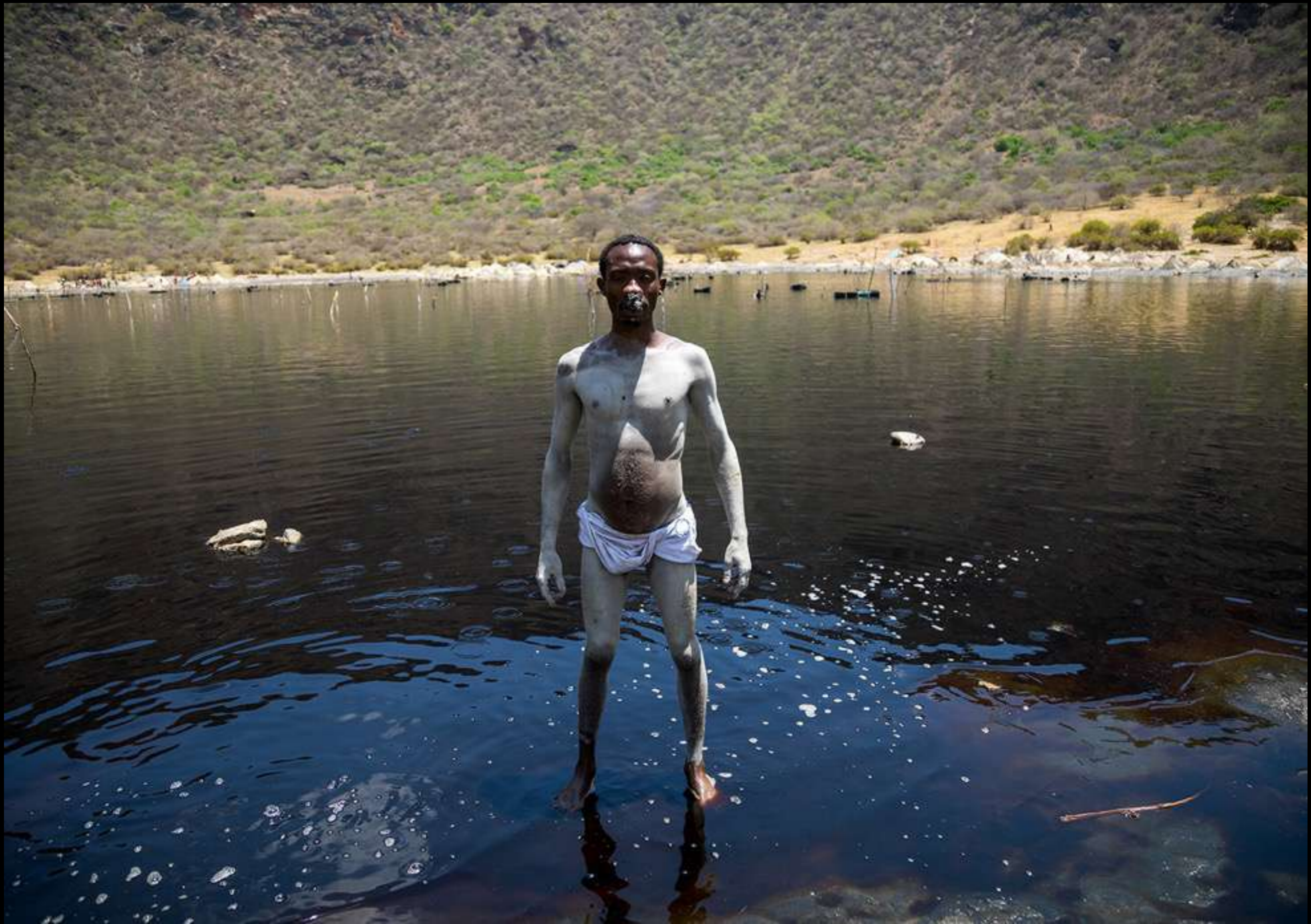
More and more Boranas being muslims, they tend to wear underwear.