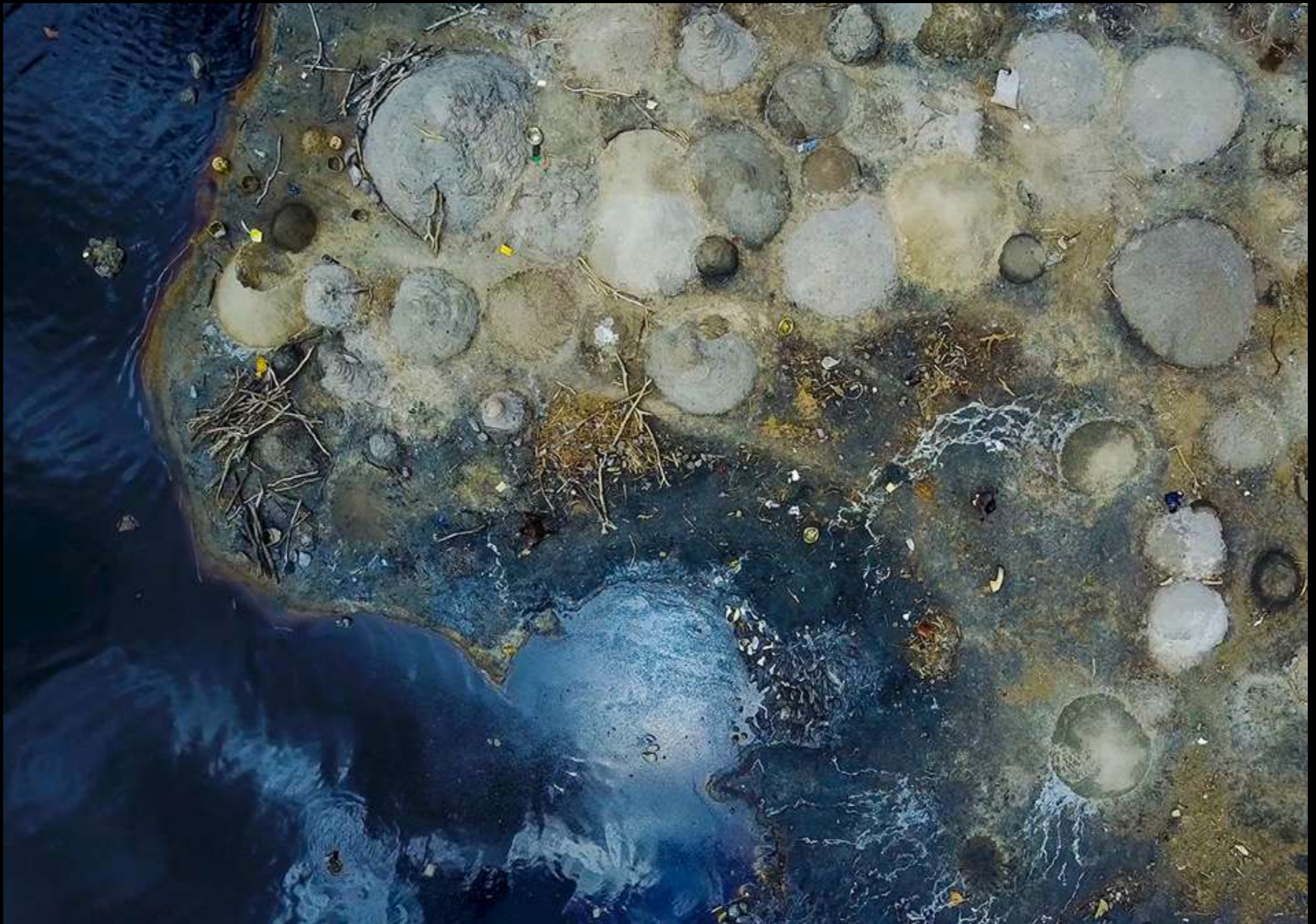
From the sky you can clearly see the salt pyramids. Under the scorching hot sun, the salt in the crater dries in no time at all due to the lack of wind.