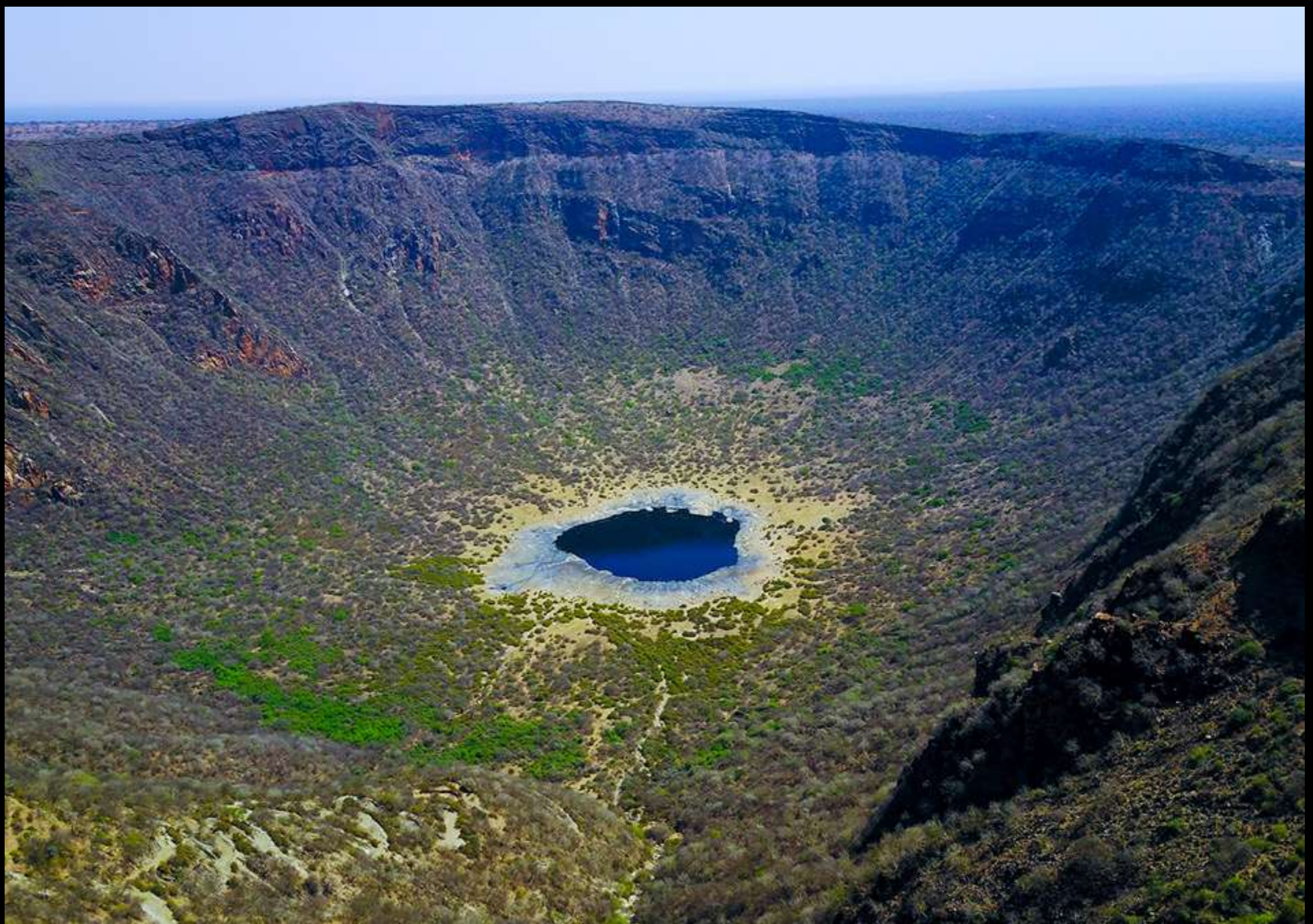
El Sod, the House Of Salt, is a village located 90 km away from Yabelo, the capital of Borana people in South Ethiopia. It stands on the edge of an extinct volcano with a diameter of 1.8 km and a salt lake in the crater. For centuries, men dive into the lake to collect the salt and sell it across Ethiopia, Somalia and Kenya.