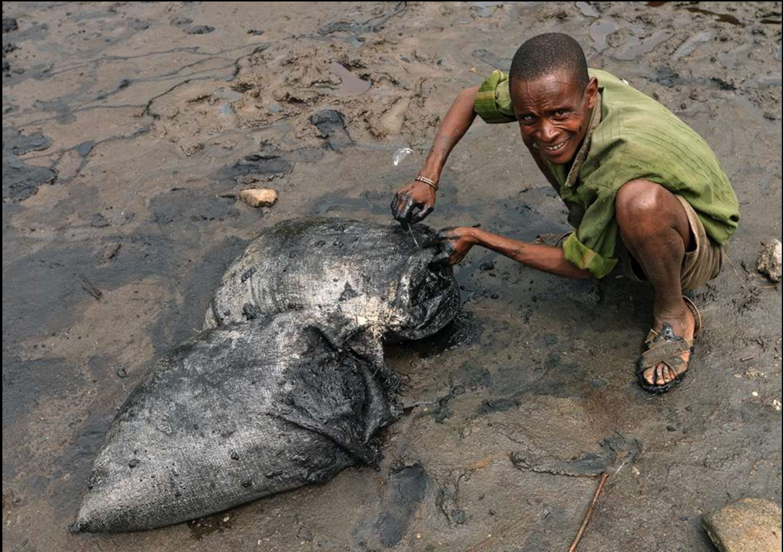
Only Borana people get access to the salt in the volcano. Conflicts raise whenever another tribe tries to enter the area.