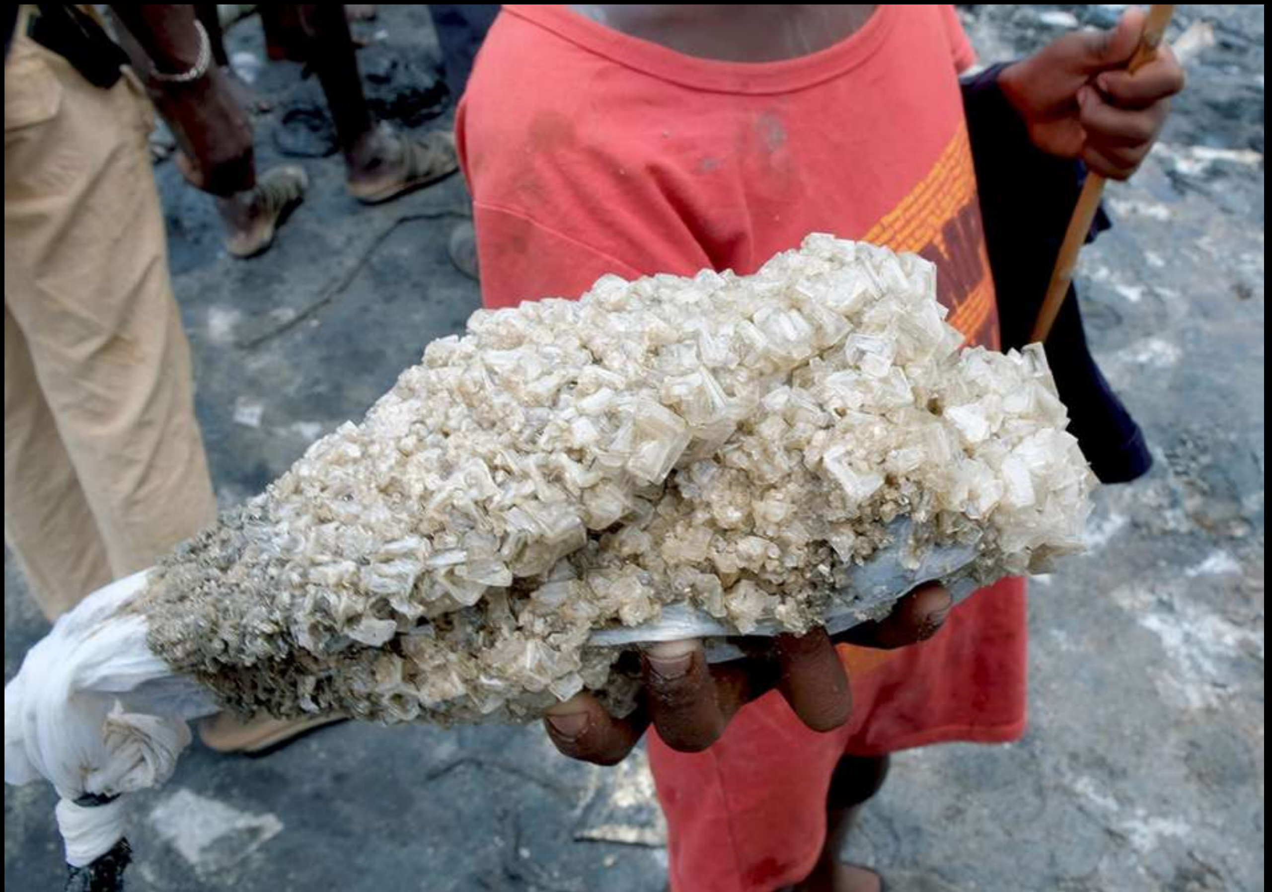
Three kinds of salt can be found in the lake: the black salt for animals, the white salt for the people, and crystals which can be sold at a high price.