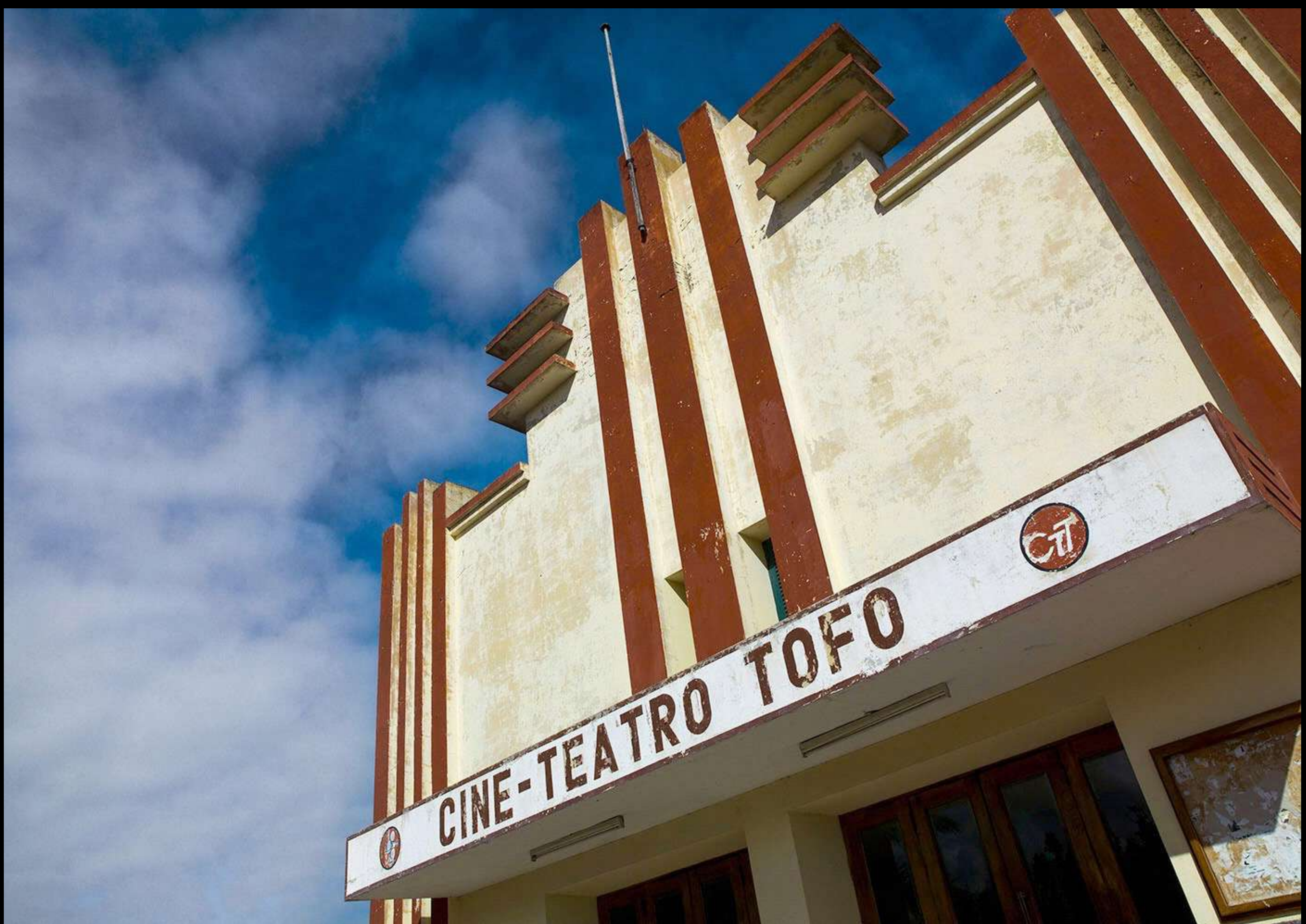
The well designed Tofo portuguese Cinema in Inhambane