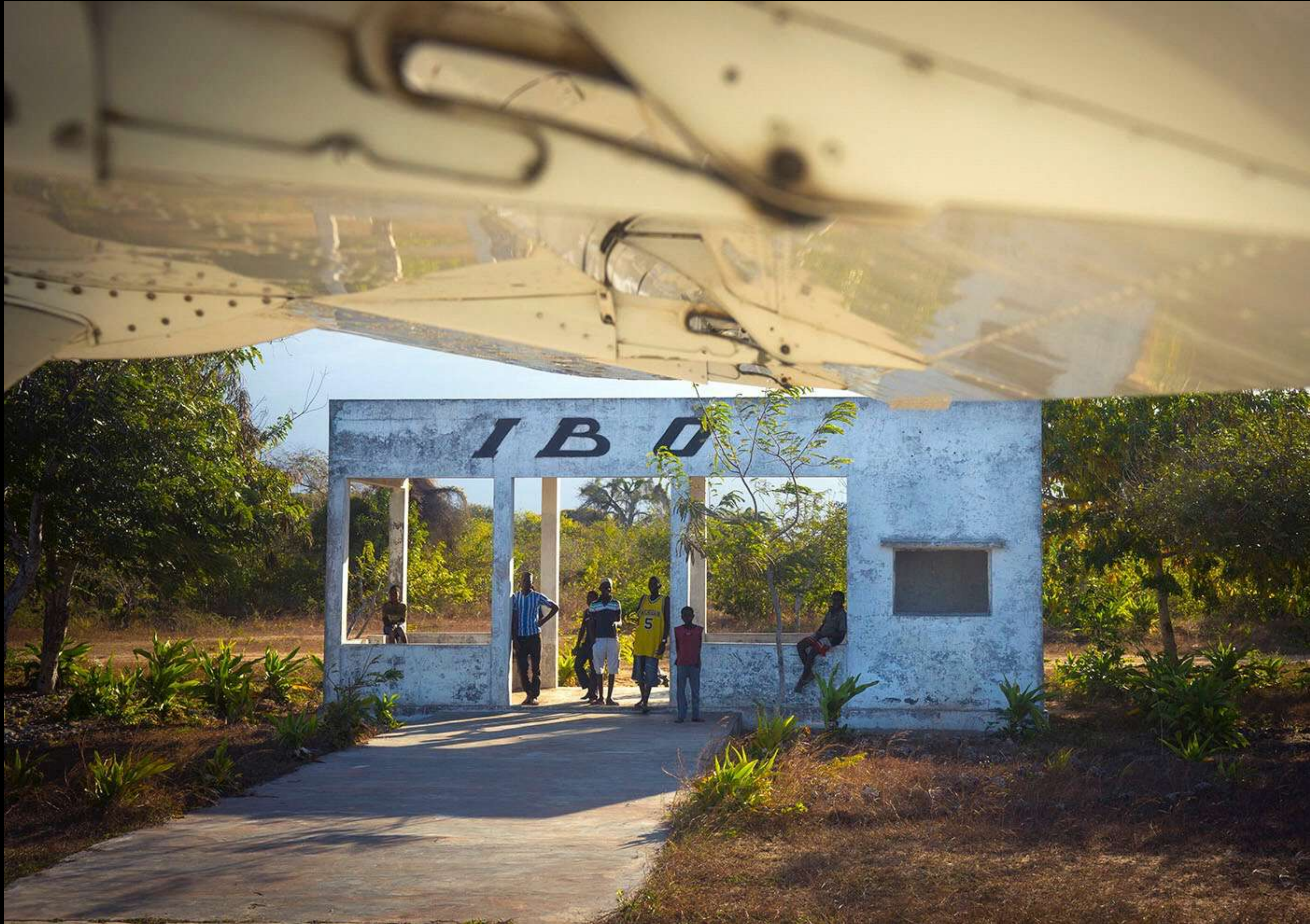
Arriving in Ibo, I am the only passenger on the flight from Pemba