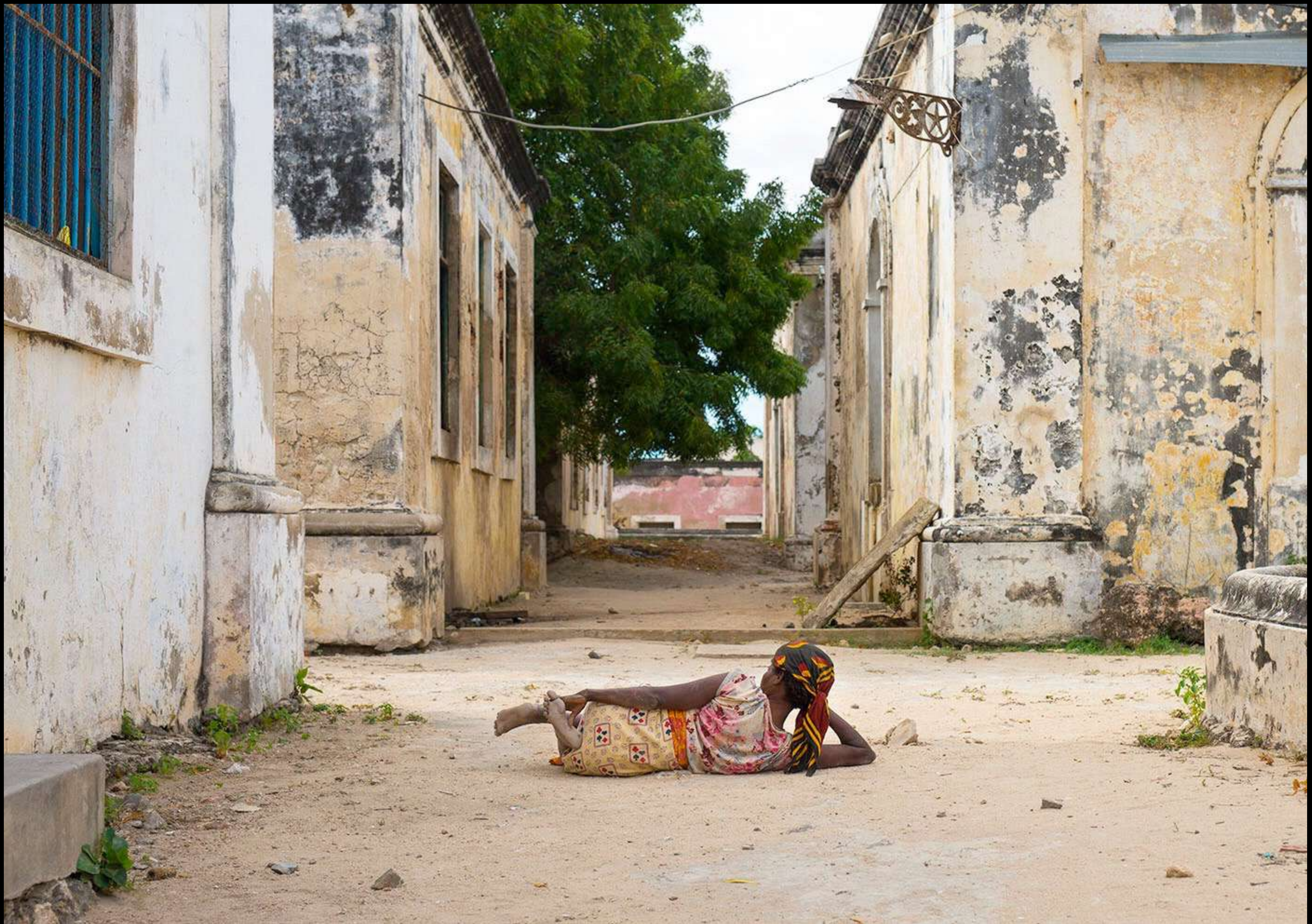
Ilha Mozambique old portuguese hopsital