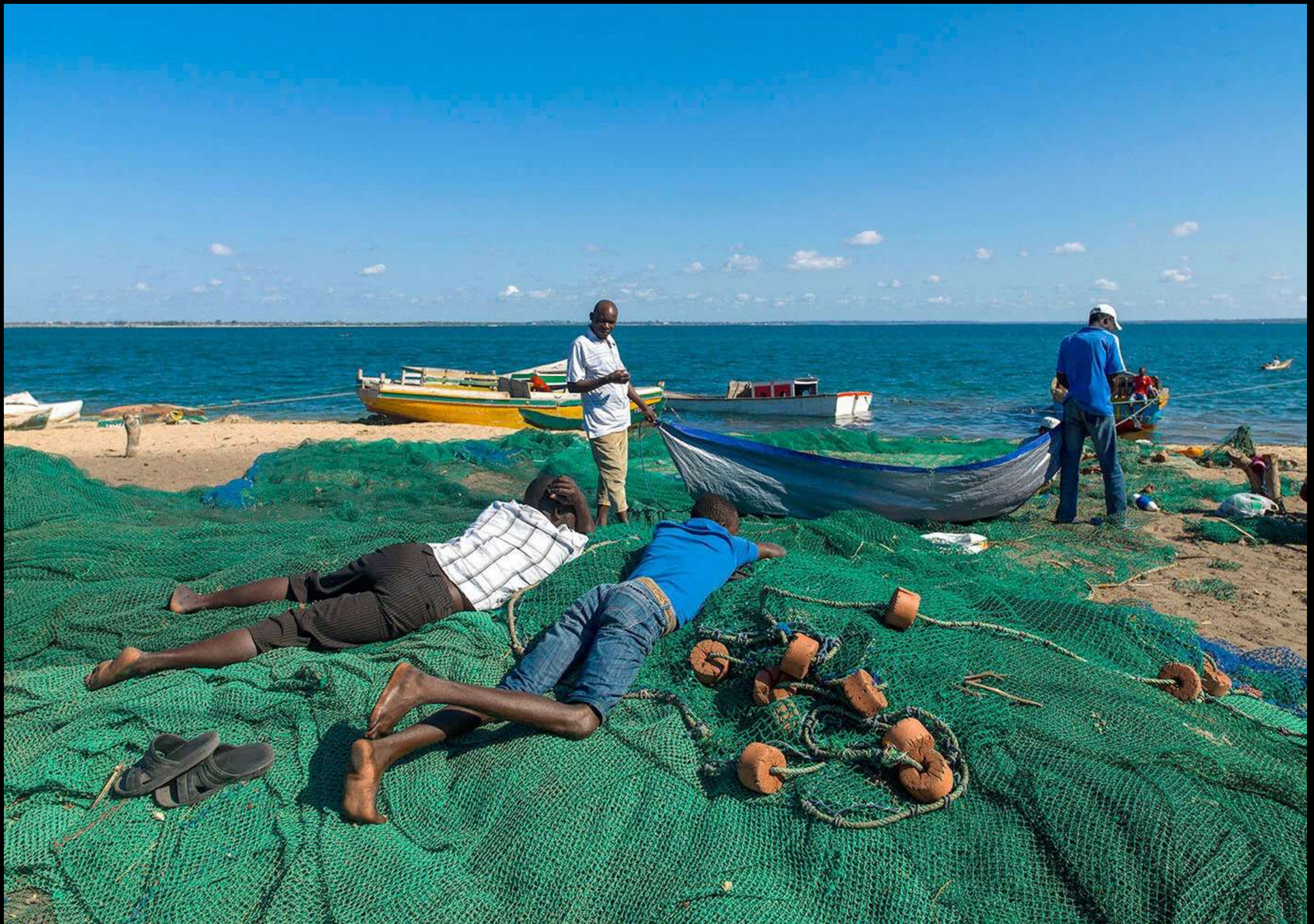
Island Of Mozambique