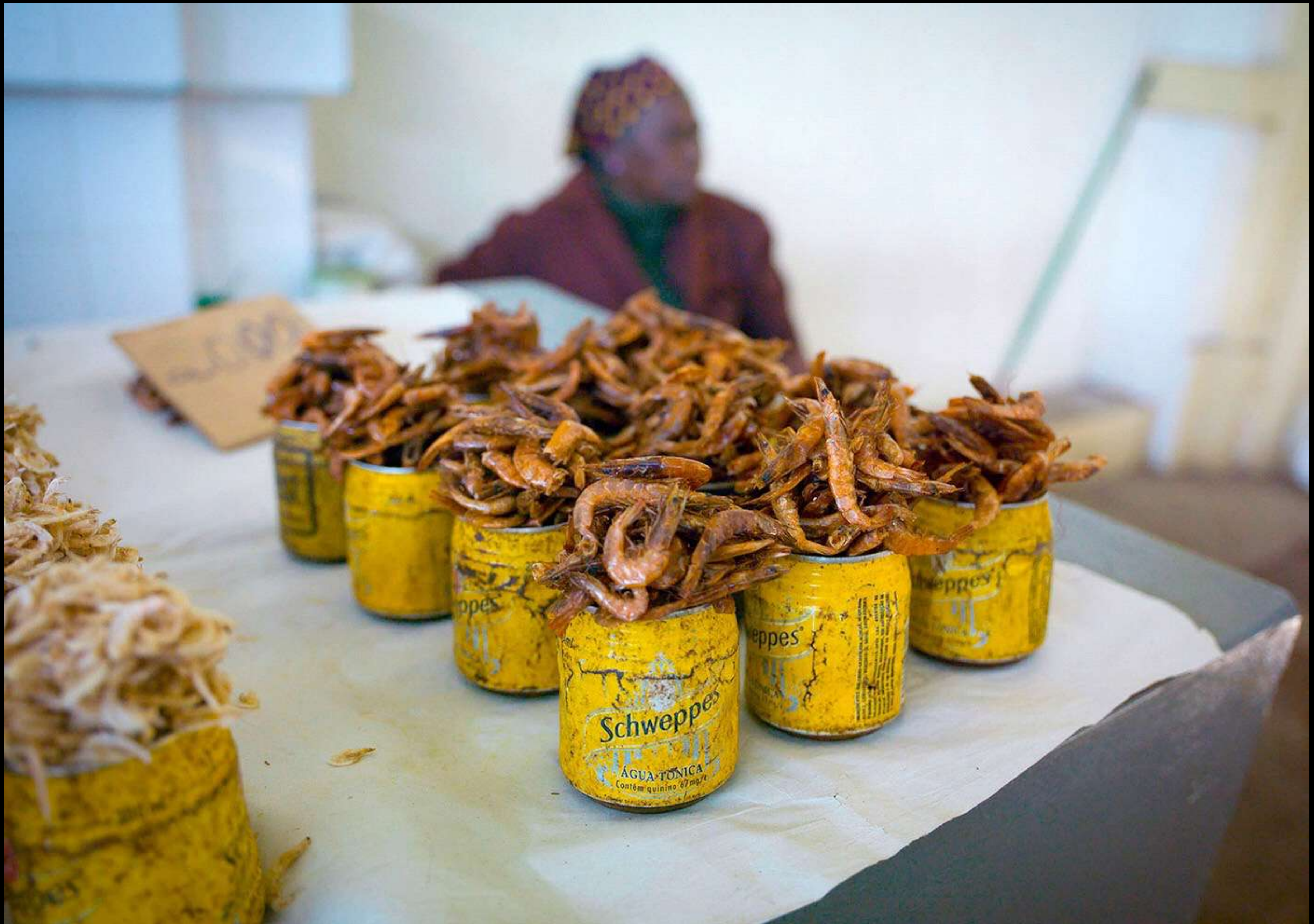
Dried shrimp in old Schweppes in Maputo mercado