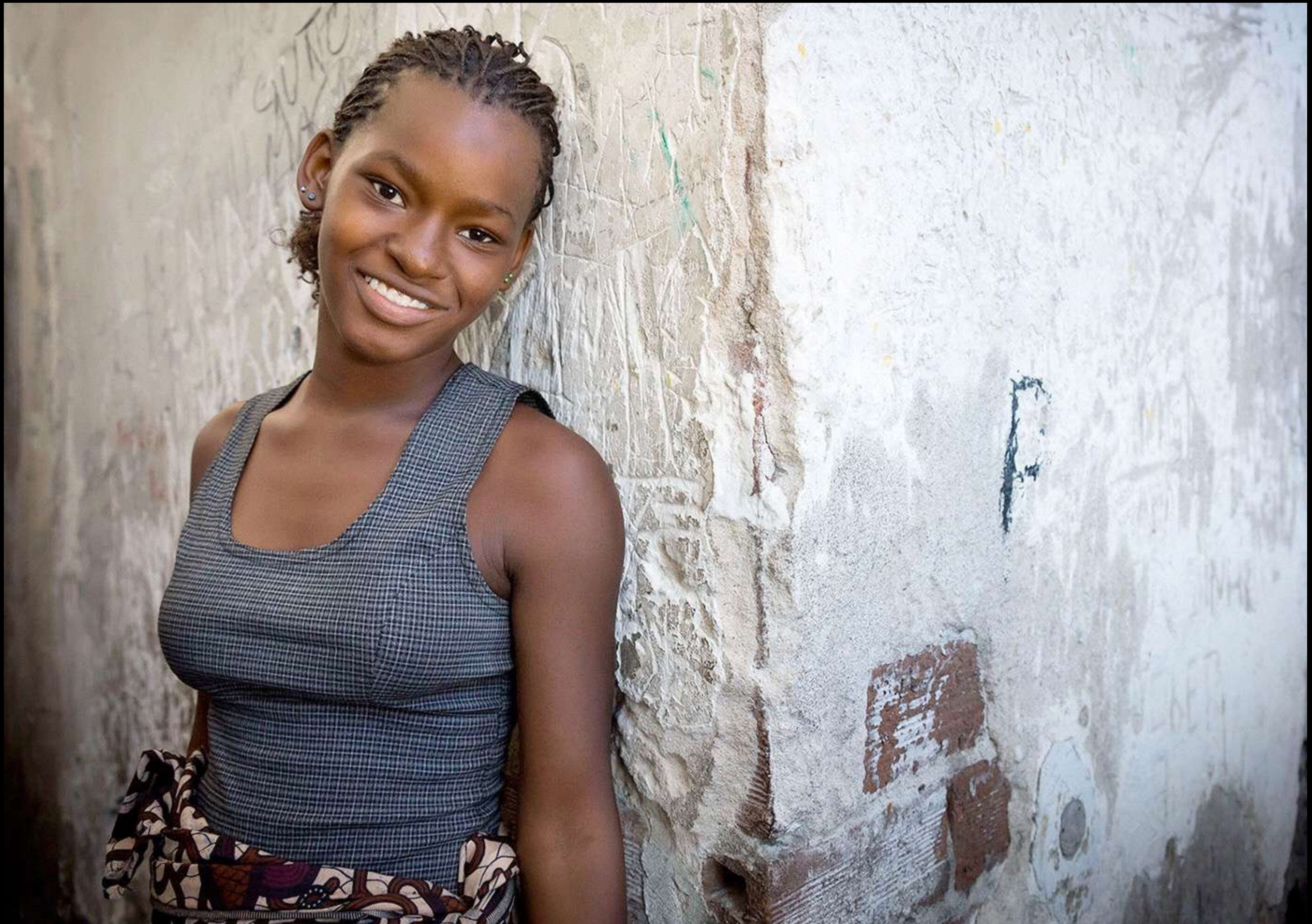
3,500 impoverished people like her now crowd the Beira Grande Hotel