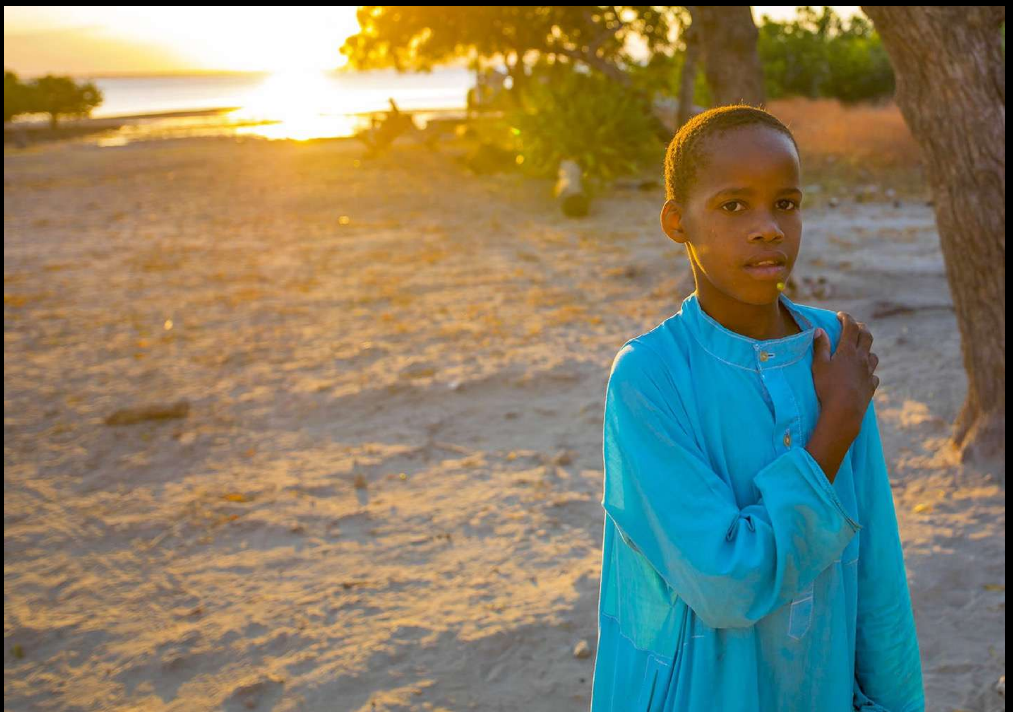
Sunset at 5:30... Time to go to mosque...