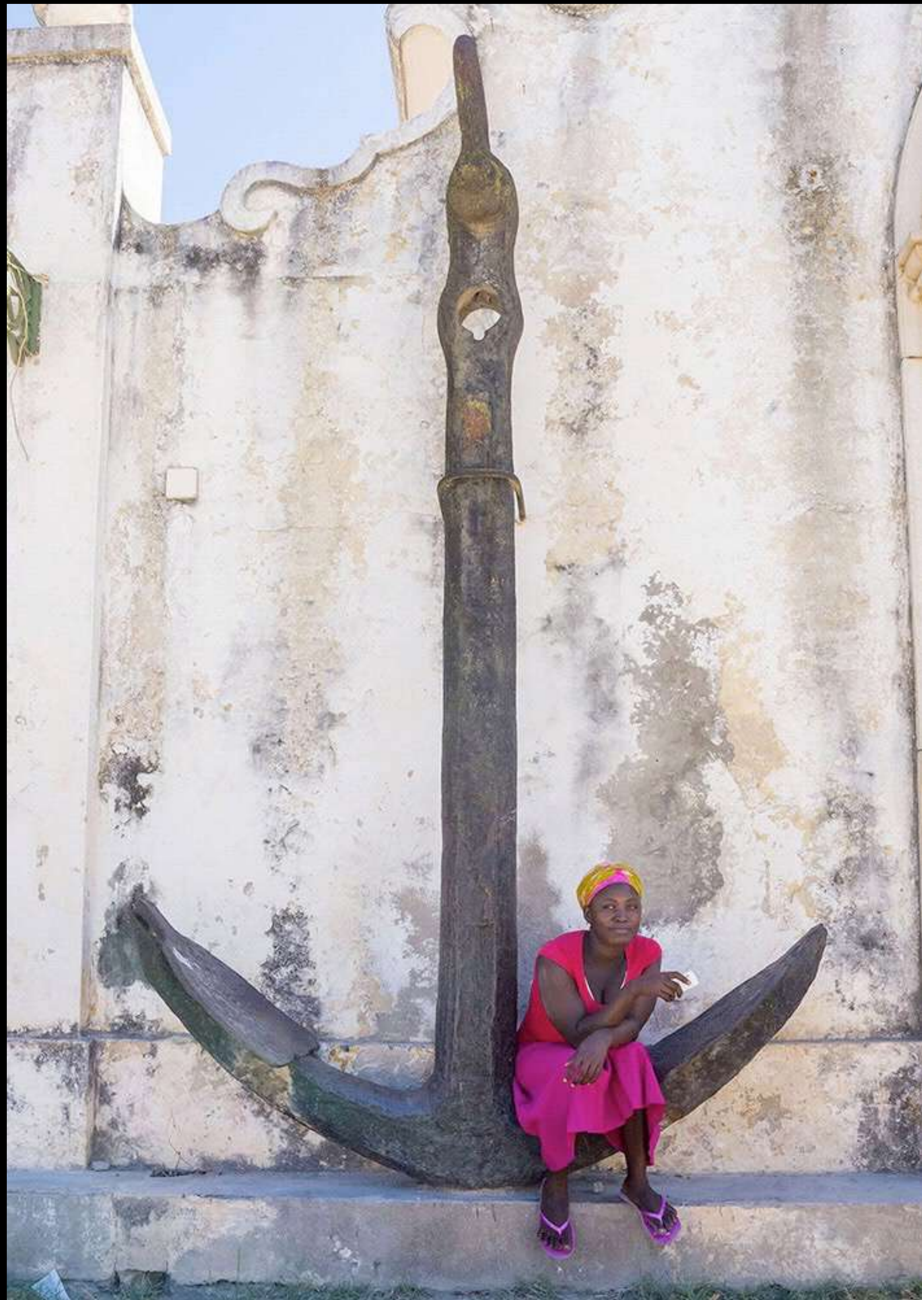
Ilha Mozambique old costumes and museum