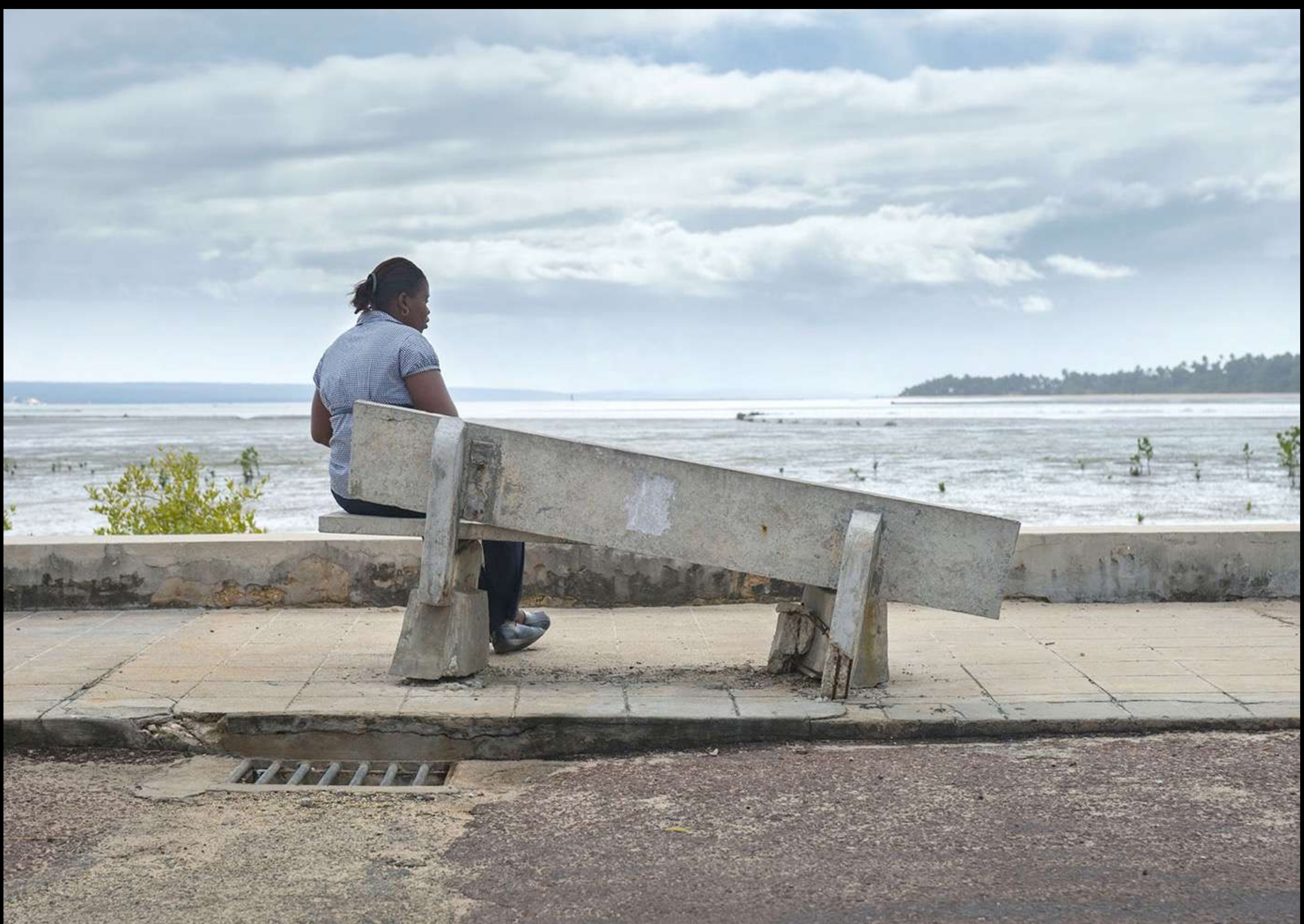
Along the Inhambane cornice a woman sit on a broken concrete bench, watching the wind blow through the mangrove.