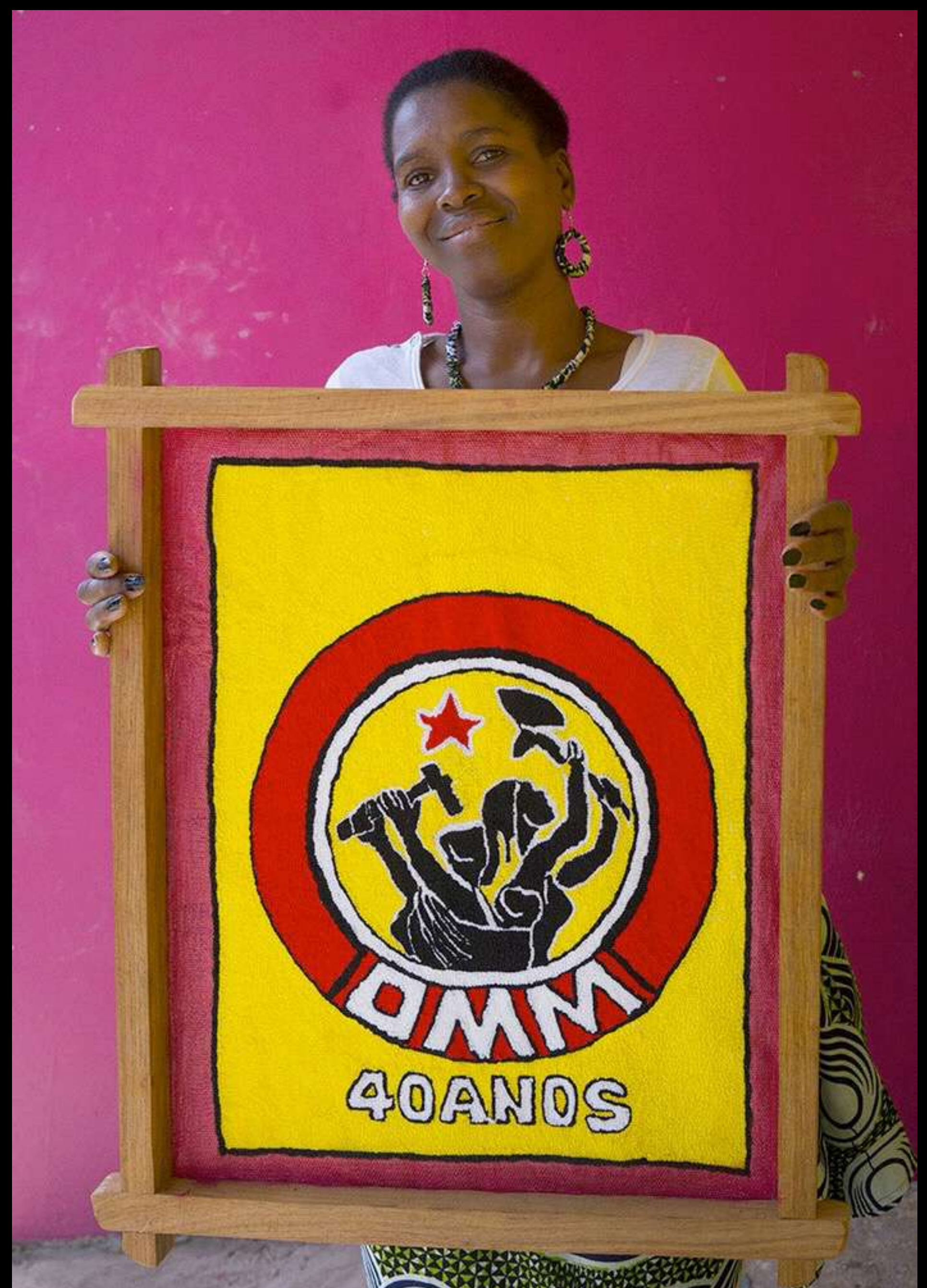
Mozambique Women's Organisation