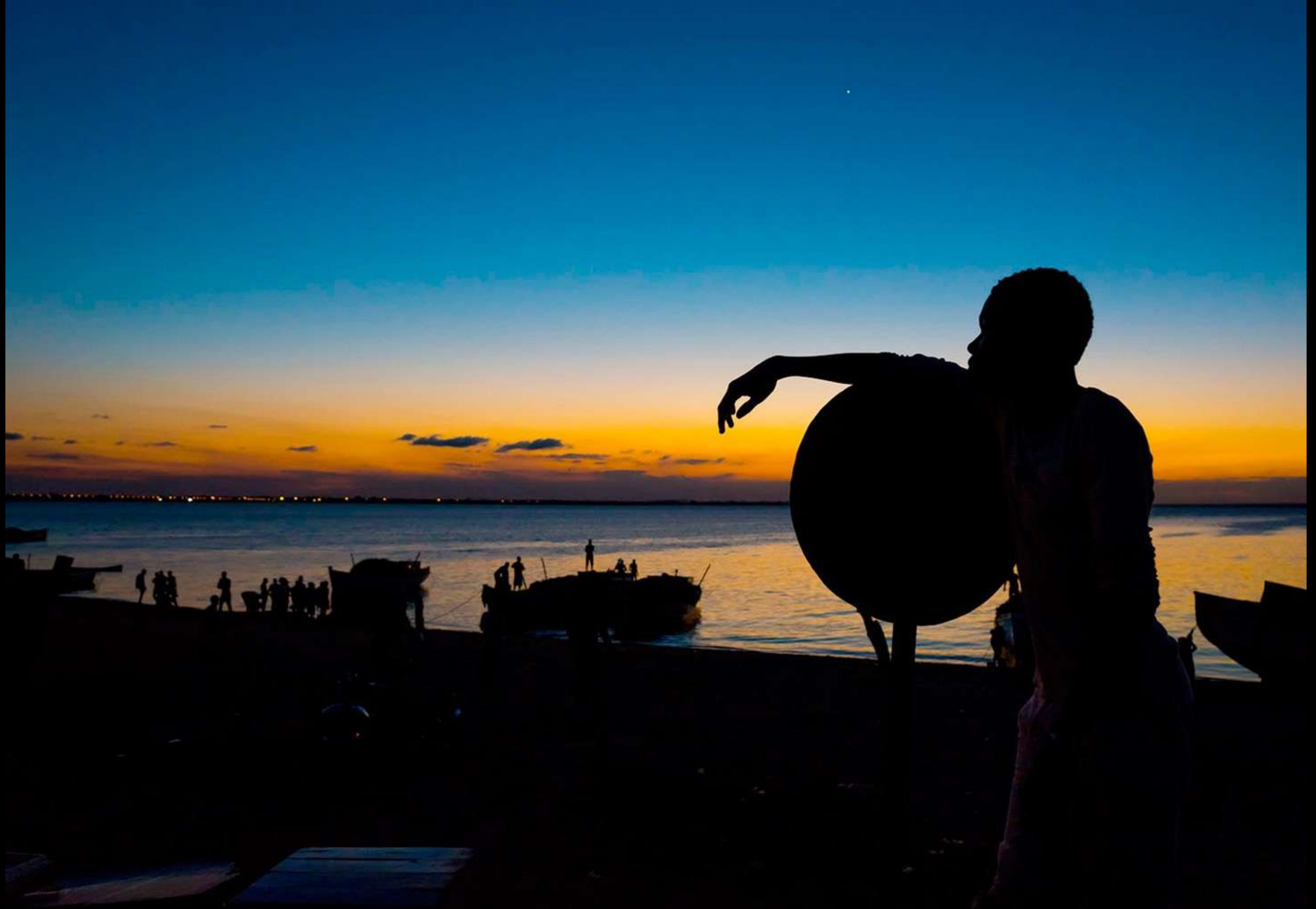
Fishermen return, Island Of Mozambique