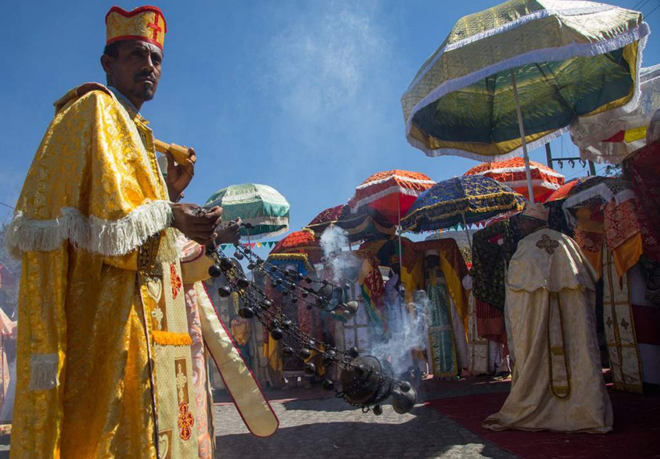
The eve of Timket is called Ketera. This is when the Tabots of each church are carried out in procession. The Tabot symbolizes the Ark of the Covenant and the tablets of the Law, which Moses received on Mount Sinai.