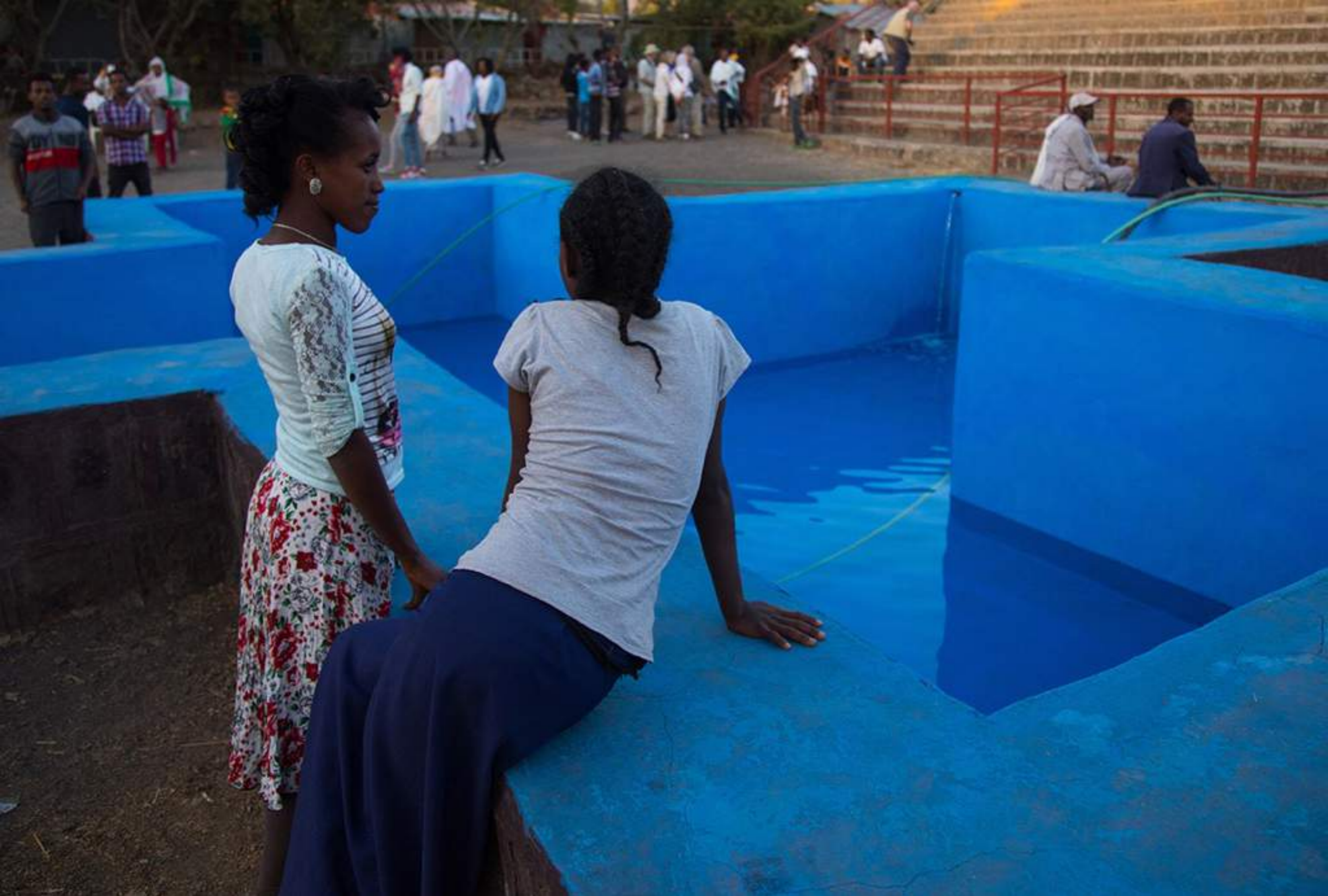
The night before Timkat, people like to come and see the pool that will be used for the ceremony, as tomorrow, the place will be overcrowded...