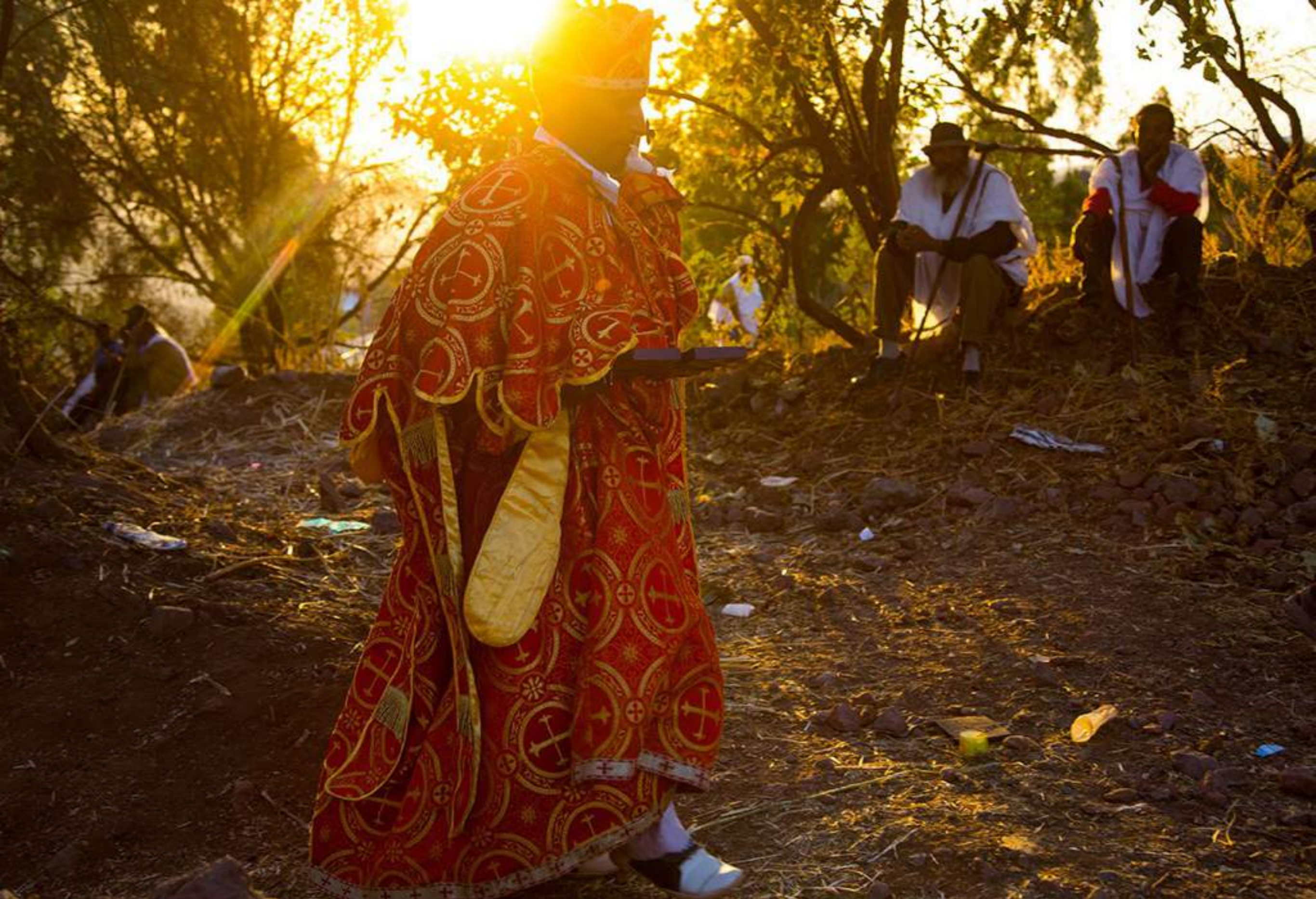
Timkat is over, the priests go back to their churches while many pilgrims will go home by feet, walking all day long...