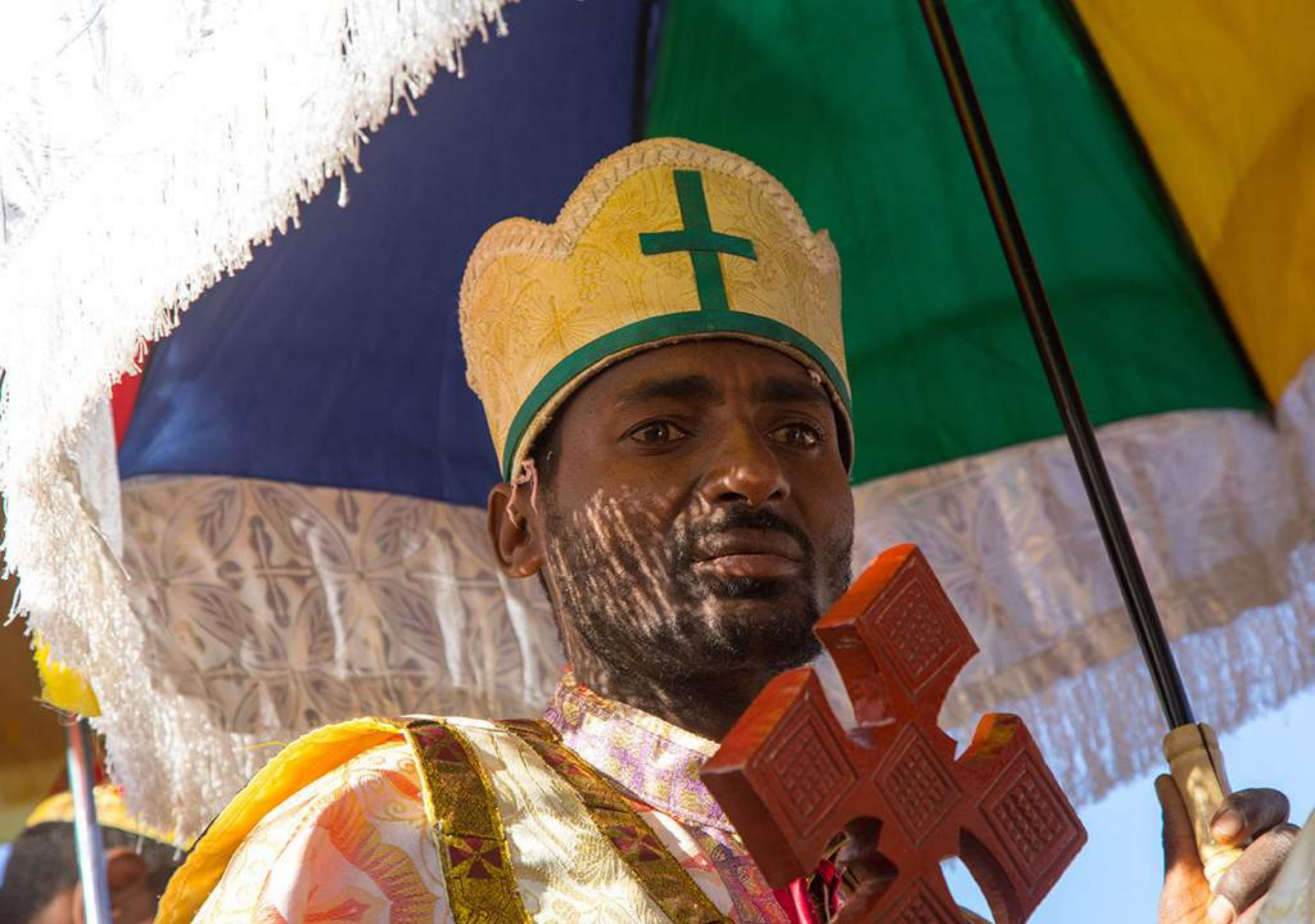
The priests are protecting from the sun with colorful umbrellas and carry crosses.