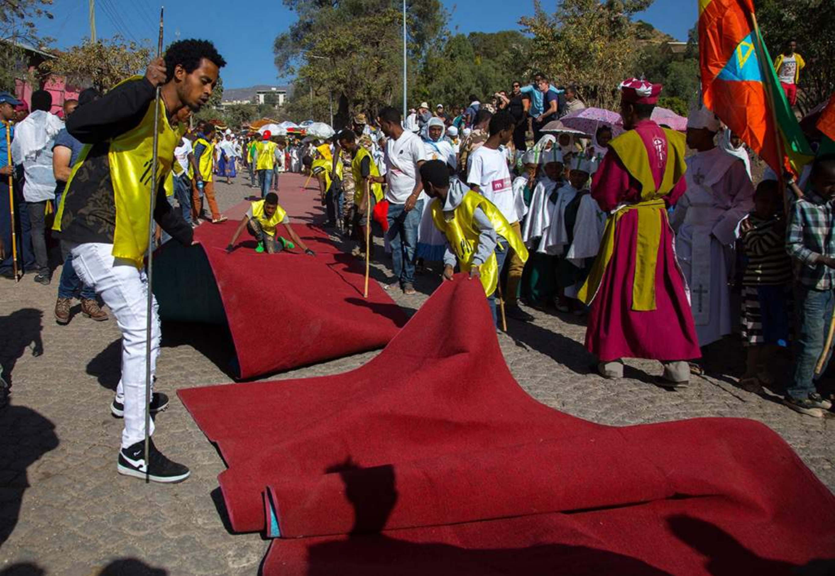
Some volunteers put red carpets on the path of the priests. Once they walked on it, they roll the carpets, run in front of the priests, and put them again and again.