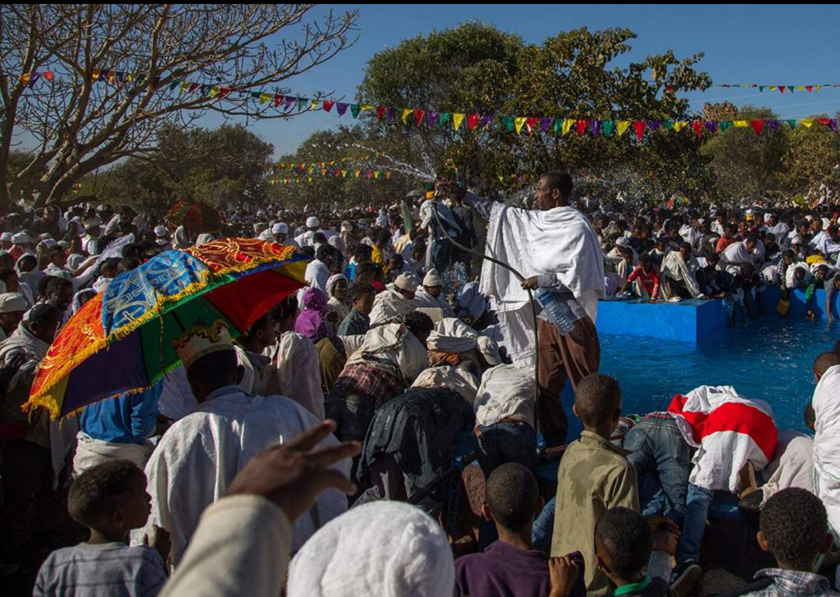
The priests spray the holy water on the crowd in commemoration of Christ's baptism....