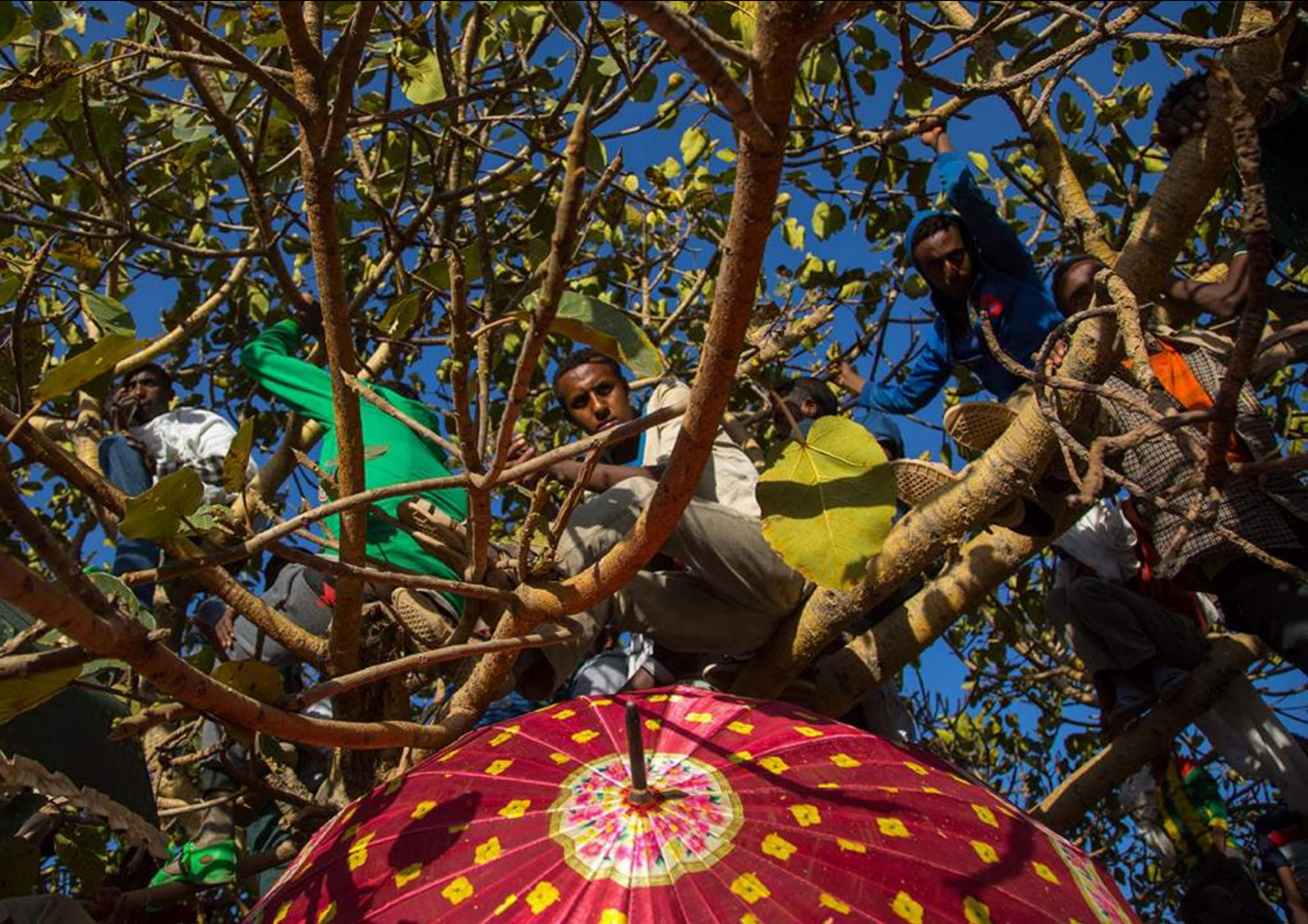
Everybody wants to see the priests blessing the water...