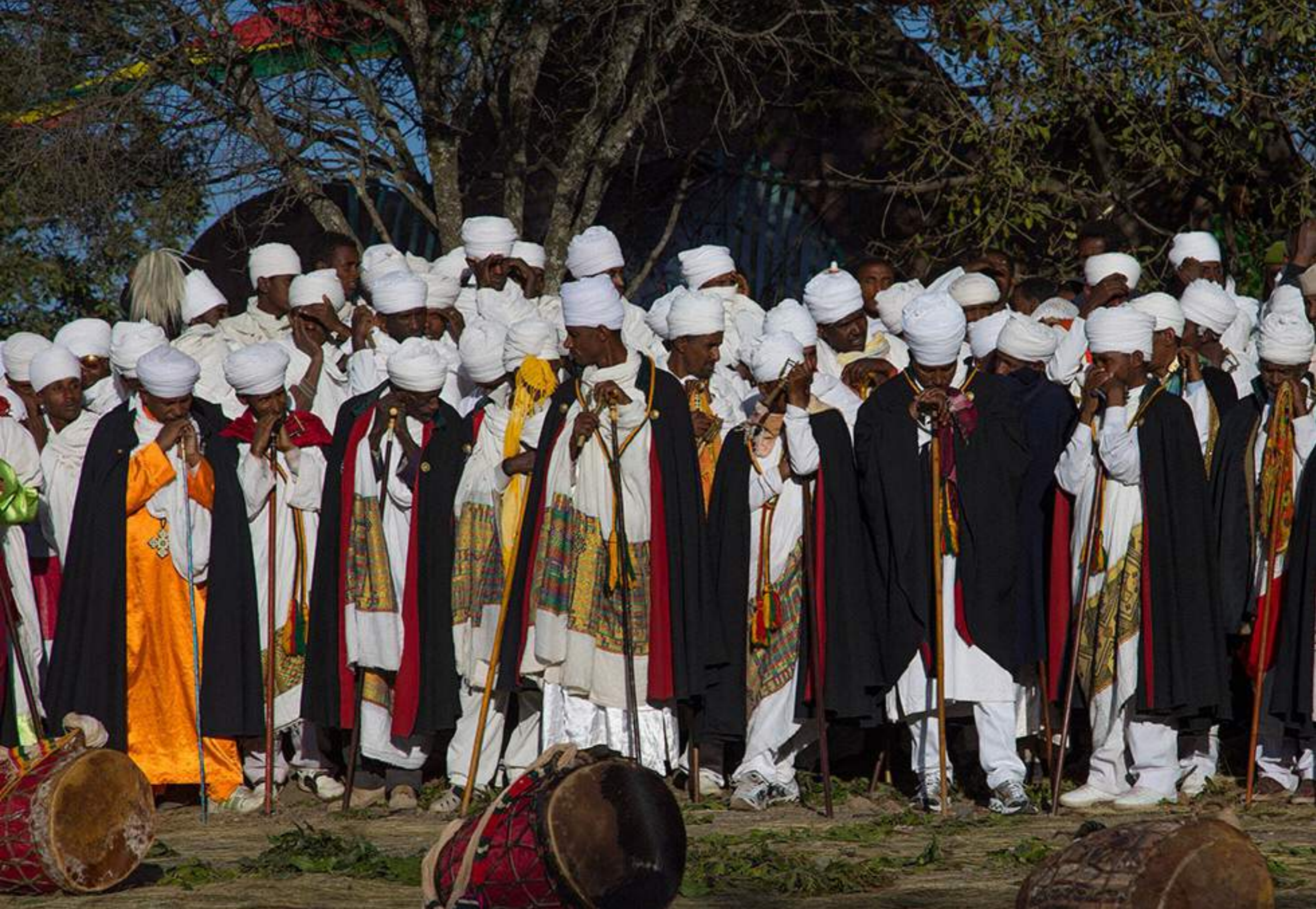
On the day of Timkat, all the priests gather to the pool and pray together. As many tourists attend the ceremony, a priest also takes the microphone to explain the process.