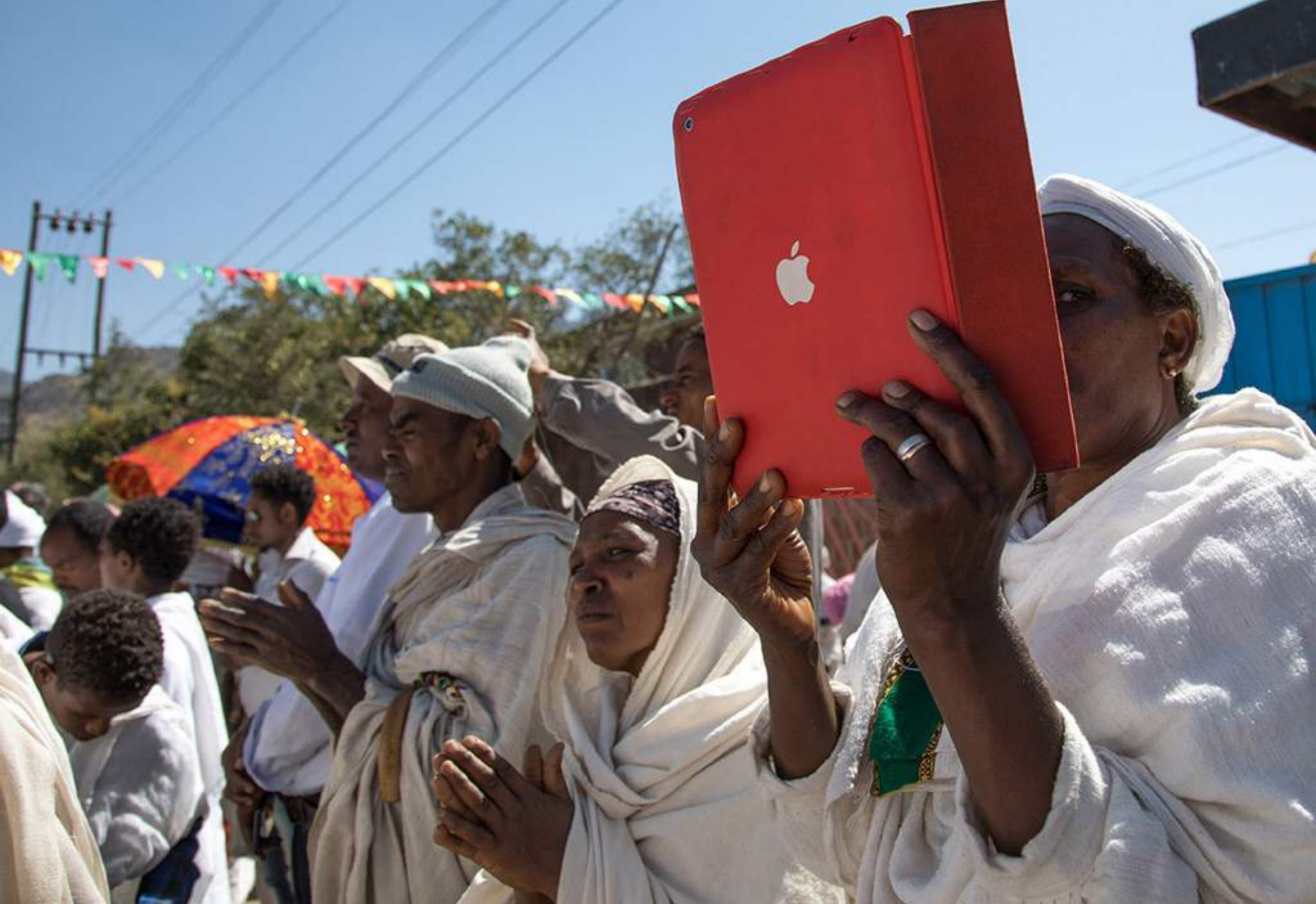
The crowd is dressed in white and come from all over the country. It is also a good time for ethiopians living abroad to come back in their country to celebrate Timkat.