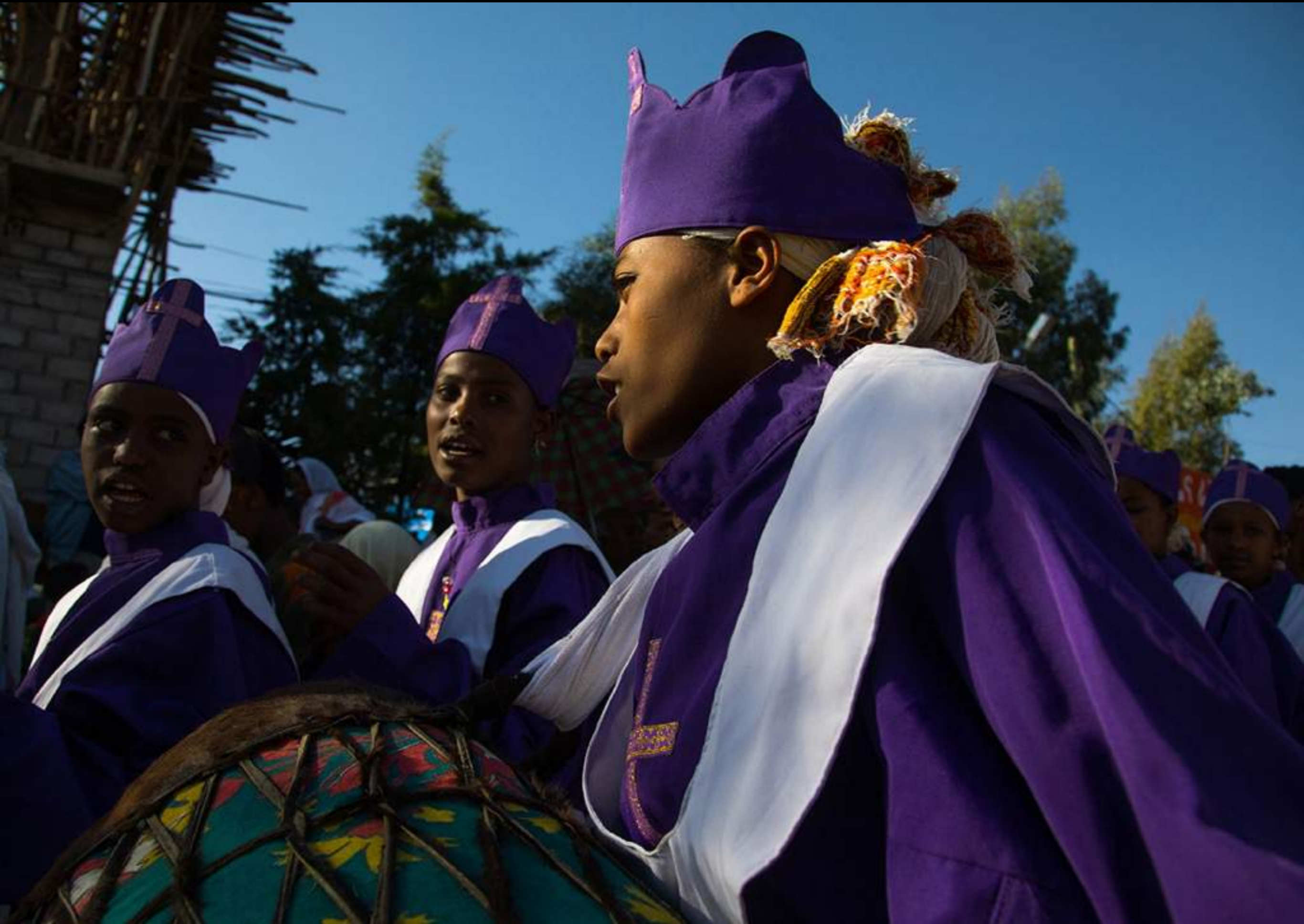
They are accompanied by groups singing and dancing.