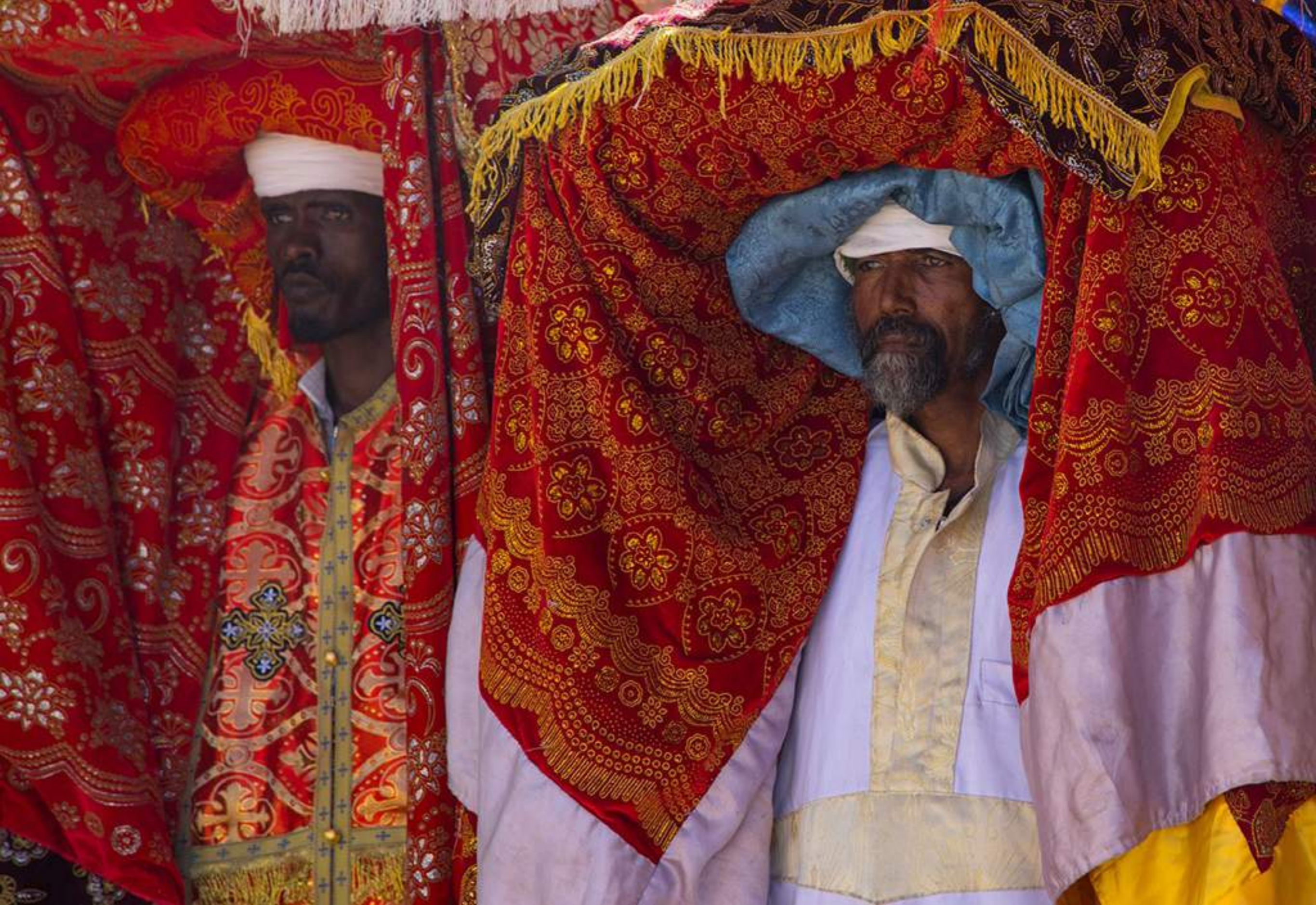
When the Tabots are carried out, they are wrapped in brocades or velvet "like the mantle of Christ" and carried on the head of the priests.