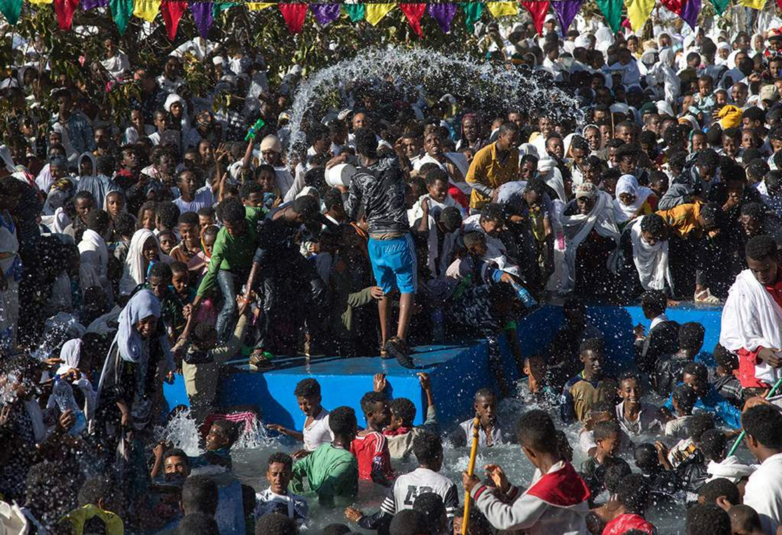
...but the pressure is too high and many of the more fervent leap fully dressed into the water to renew their vows. Some kids also join the celebration, more to enjoy a pool party than a deep religious belief!