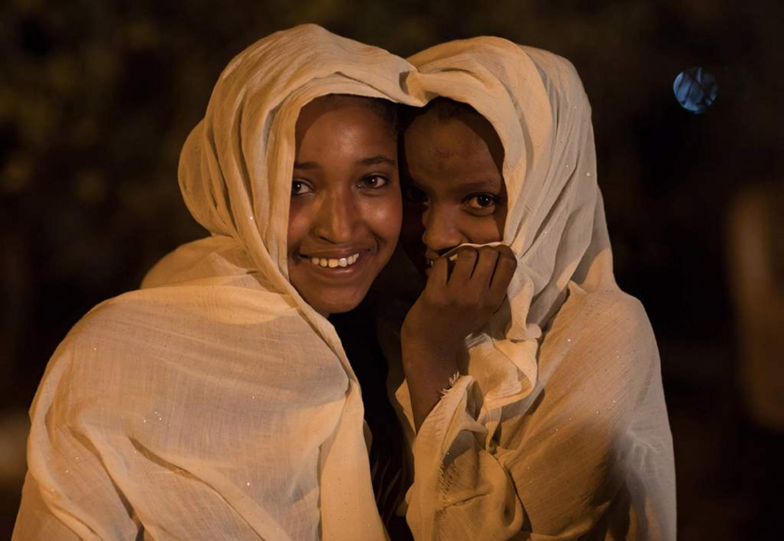
Girls in the night sharing a traditional shawl to protect from the cold, Lalibela is in the highlands of Ethiopia.