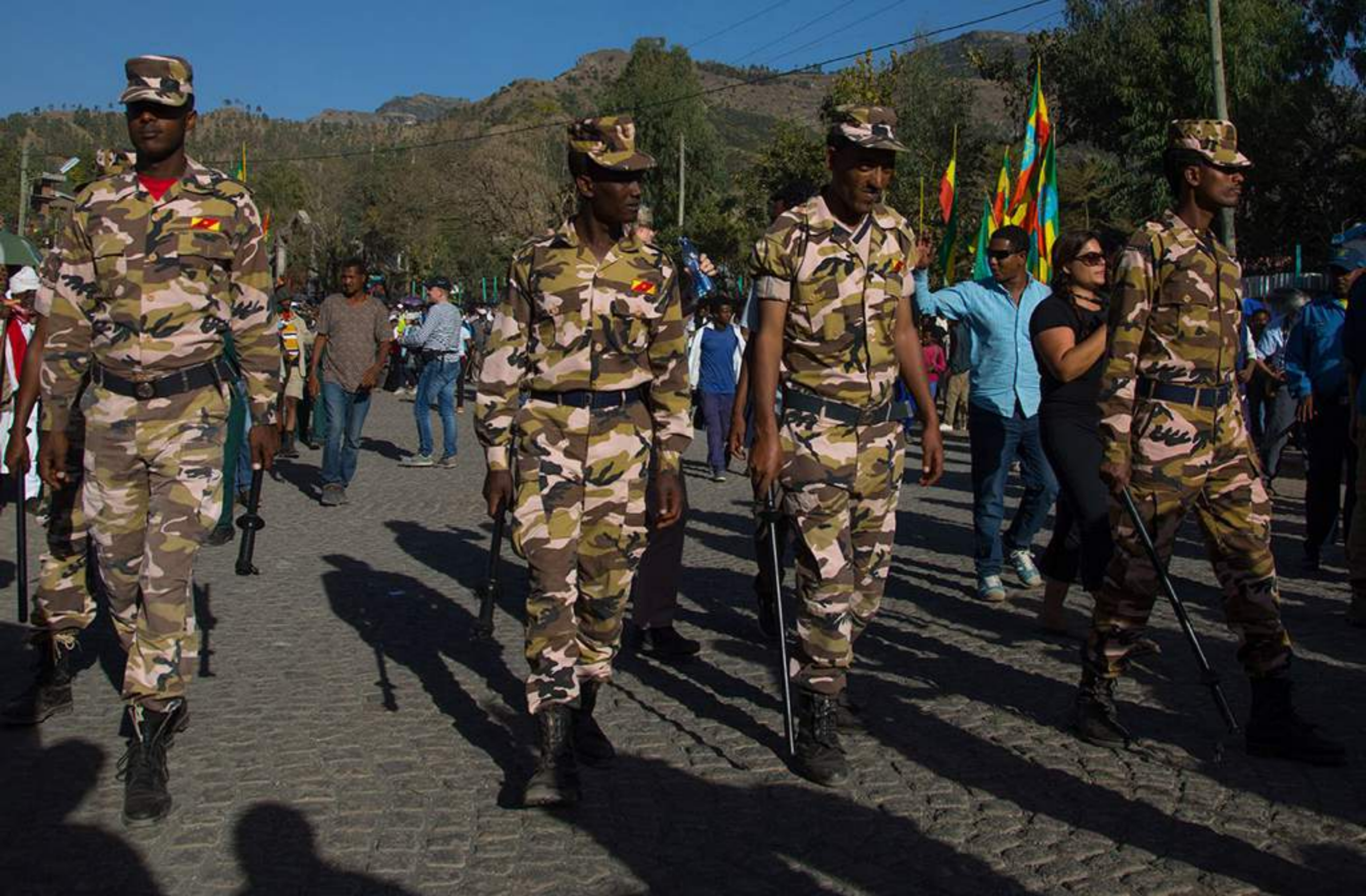
Security was high in Lalibela: demonstrations began in Oromia last november, and have also take place recently in the Amhara region. More than 400 people have been killed in clashes. The Oromos complain that they have been excluded from the political process and the economic development.