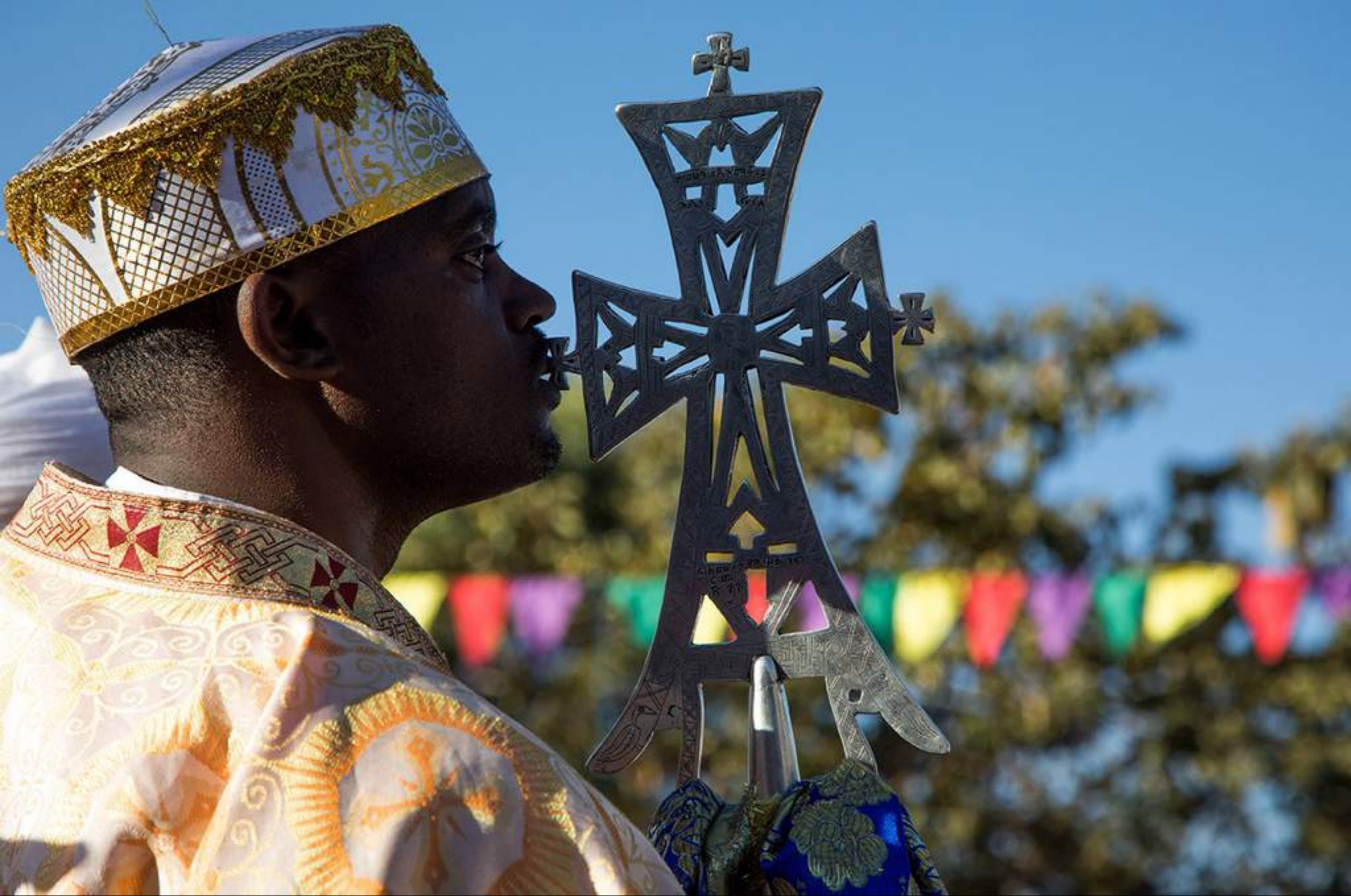
Celebrating the Baptism of Christ, every January, Timkat is the greatest festival of Orthodox Christians in Ethiopia. It celebrates the Baptism of Christ in the river Jordan by John the Baptist. The festivities begin in the 3rd week of January, the day before Epiphany which, according to the Julian calendar, falls on 19th January.