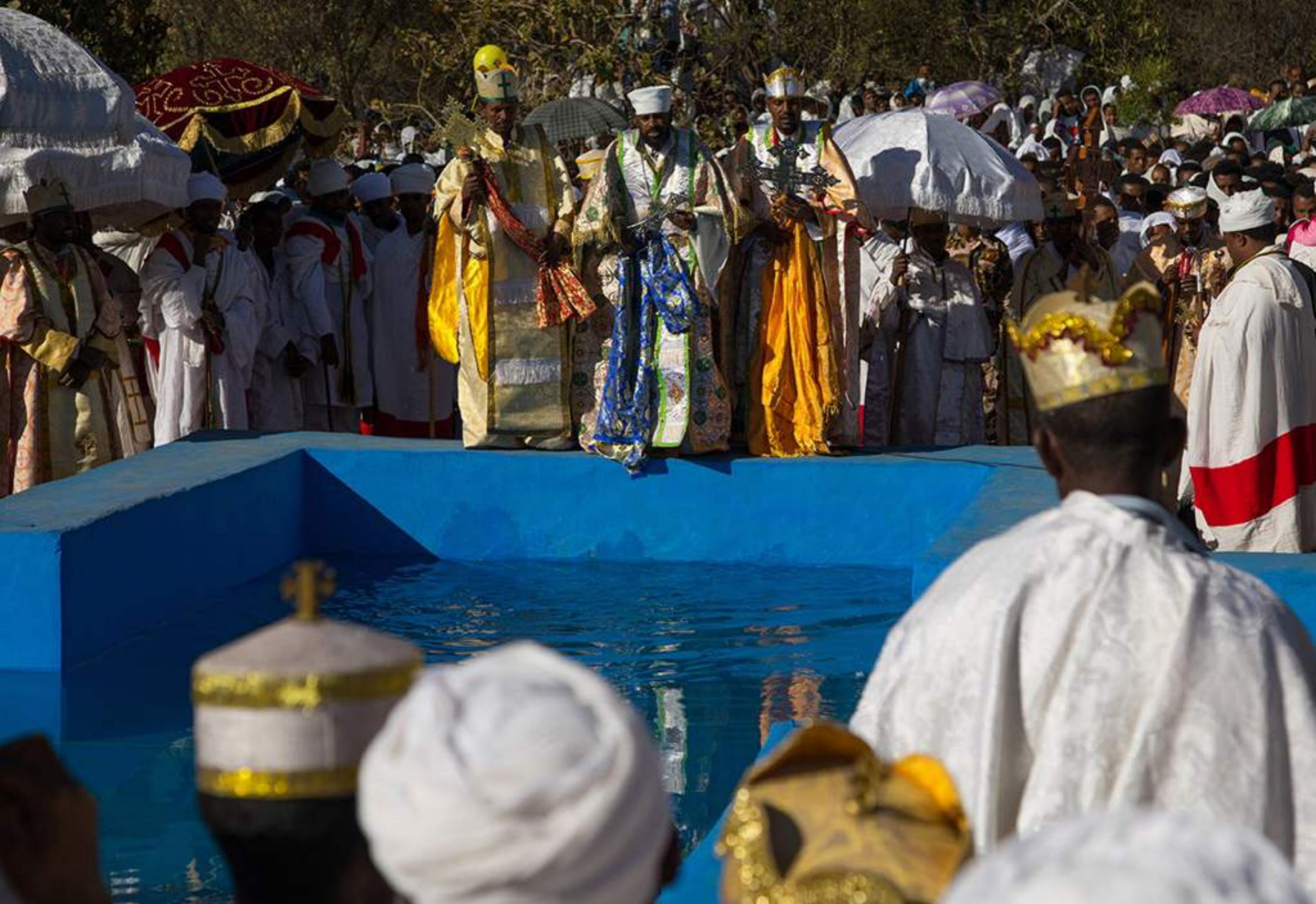
The senior priests use a processional crosses to bless the water of the pool, surrounded by the people who wait for hours for this moment since the dawn.