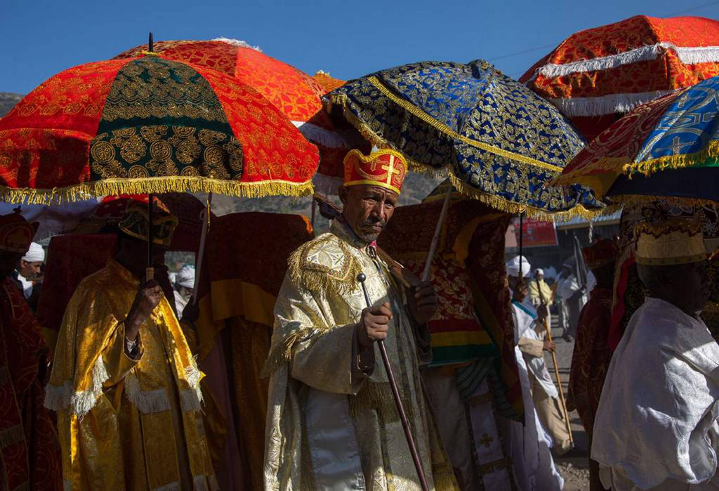
After the baptism, the Tabots of each church start their way back to their respective churches. The priests march solemnly under umbrellas in the street.