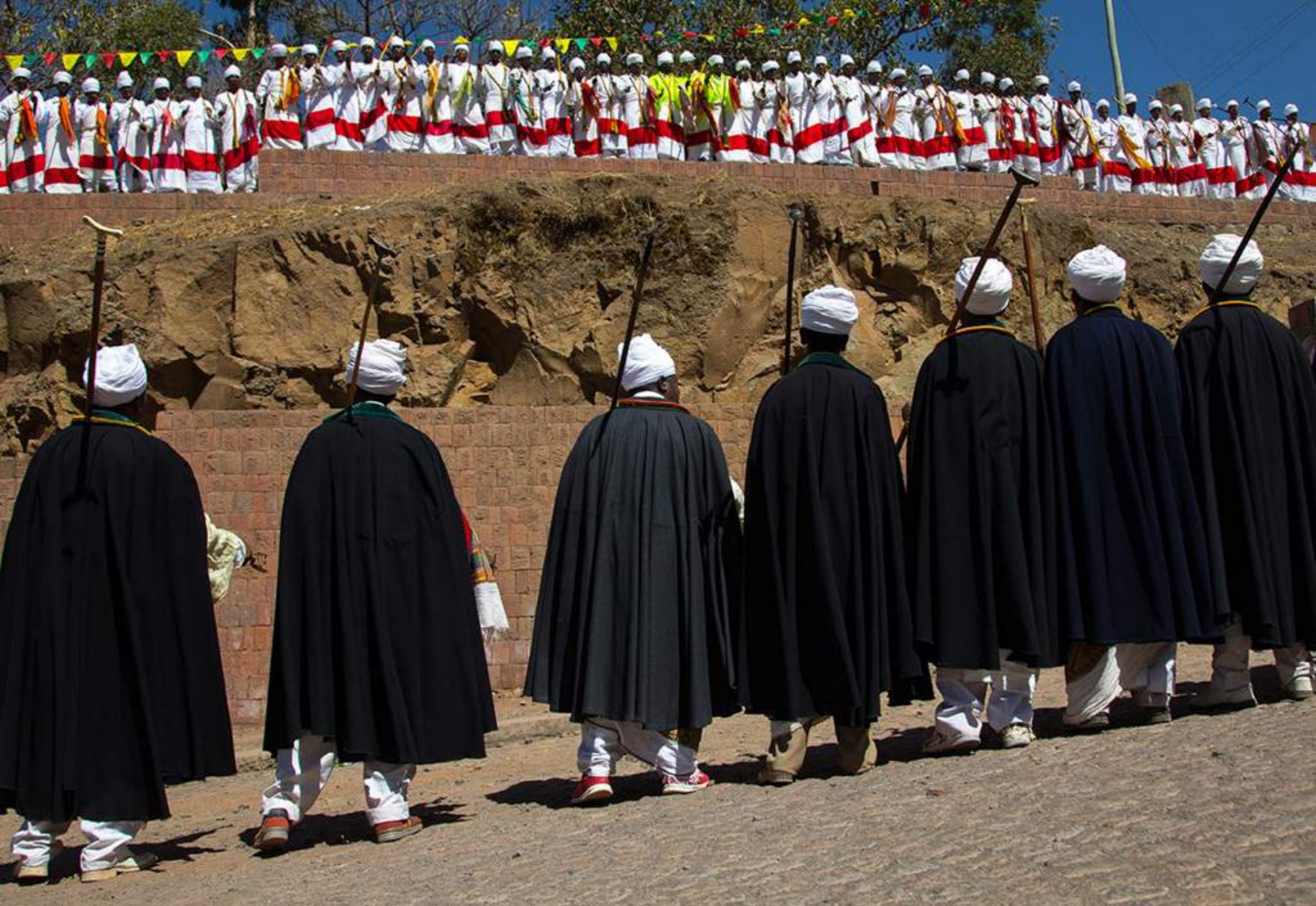
One of the climax of Timkat is when the priests dance face to face in line. This is a special dance with prayer sticks and sisteras and the beating of drums.