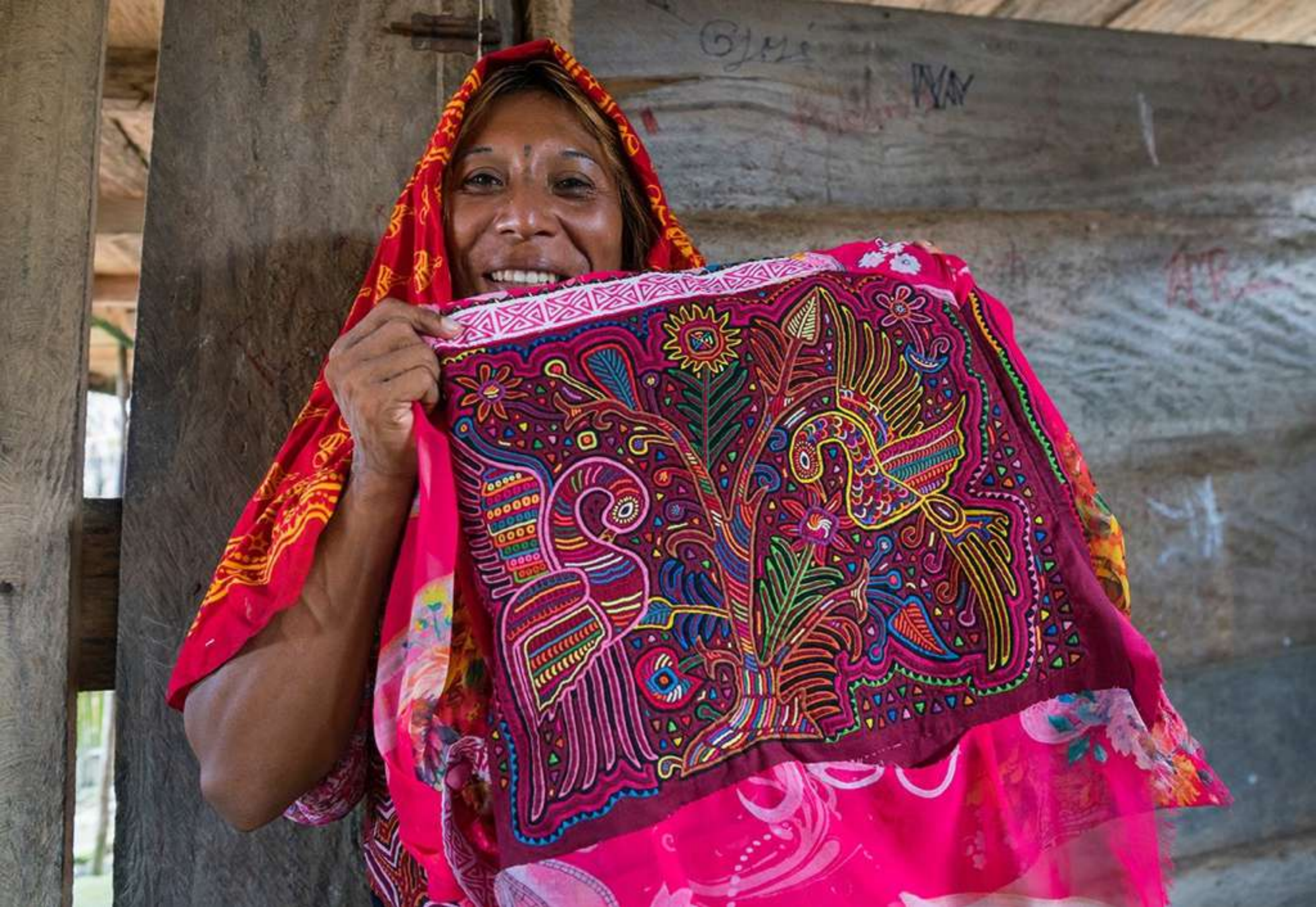
“Mothers in the Kuna community love to have a gay son, since he will help us sew Molas, and bring revenue to the family.”