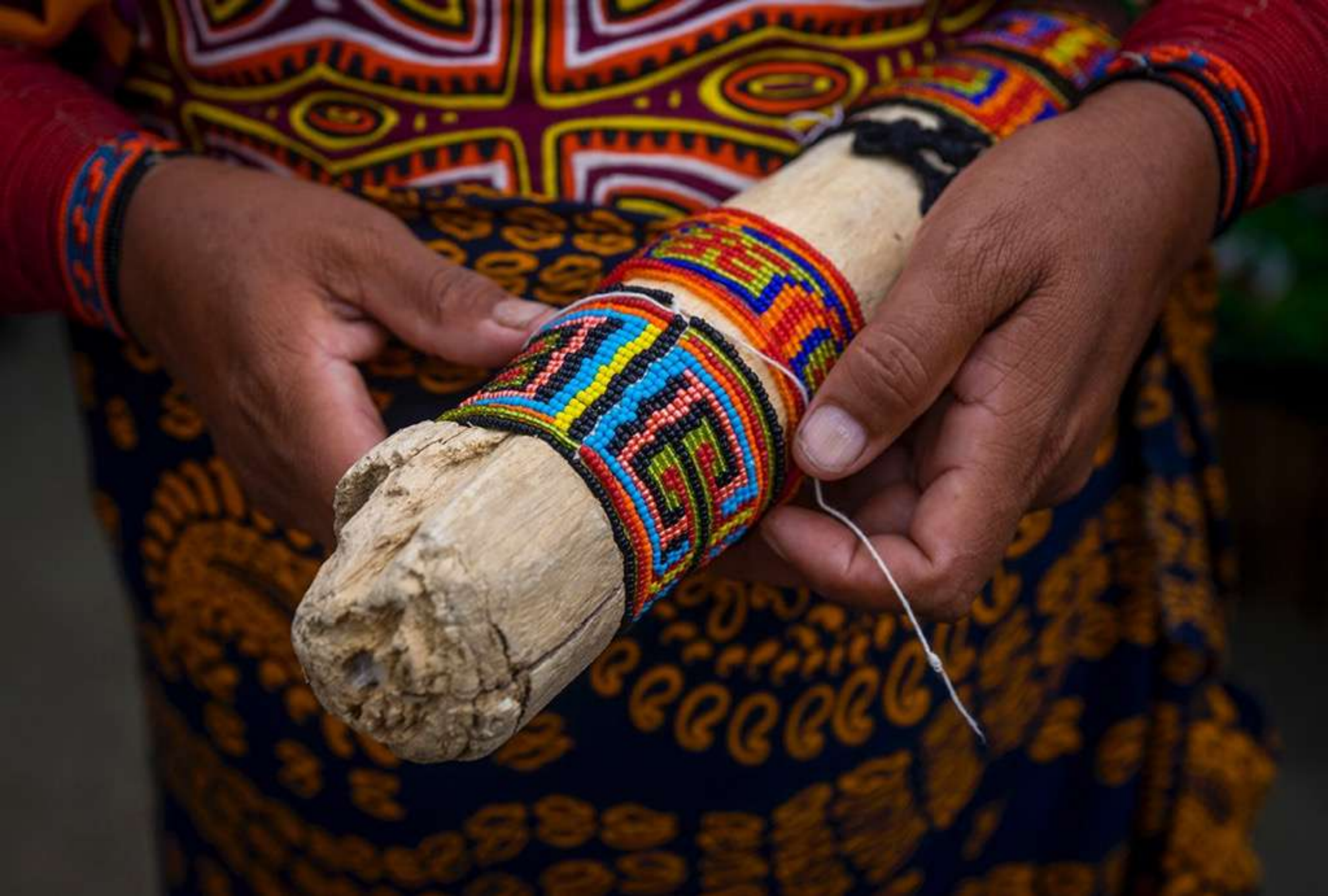
A "winis" is a colorfully beaded accessory. It is made by wrapping the beads first around a piece of wood and then around an arm or a leg. At the age of 15, Kuna girls begin to wear winis which protect them from purbas. Winis are swapped out frequently for novel geometric designs.