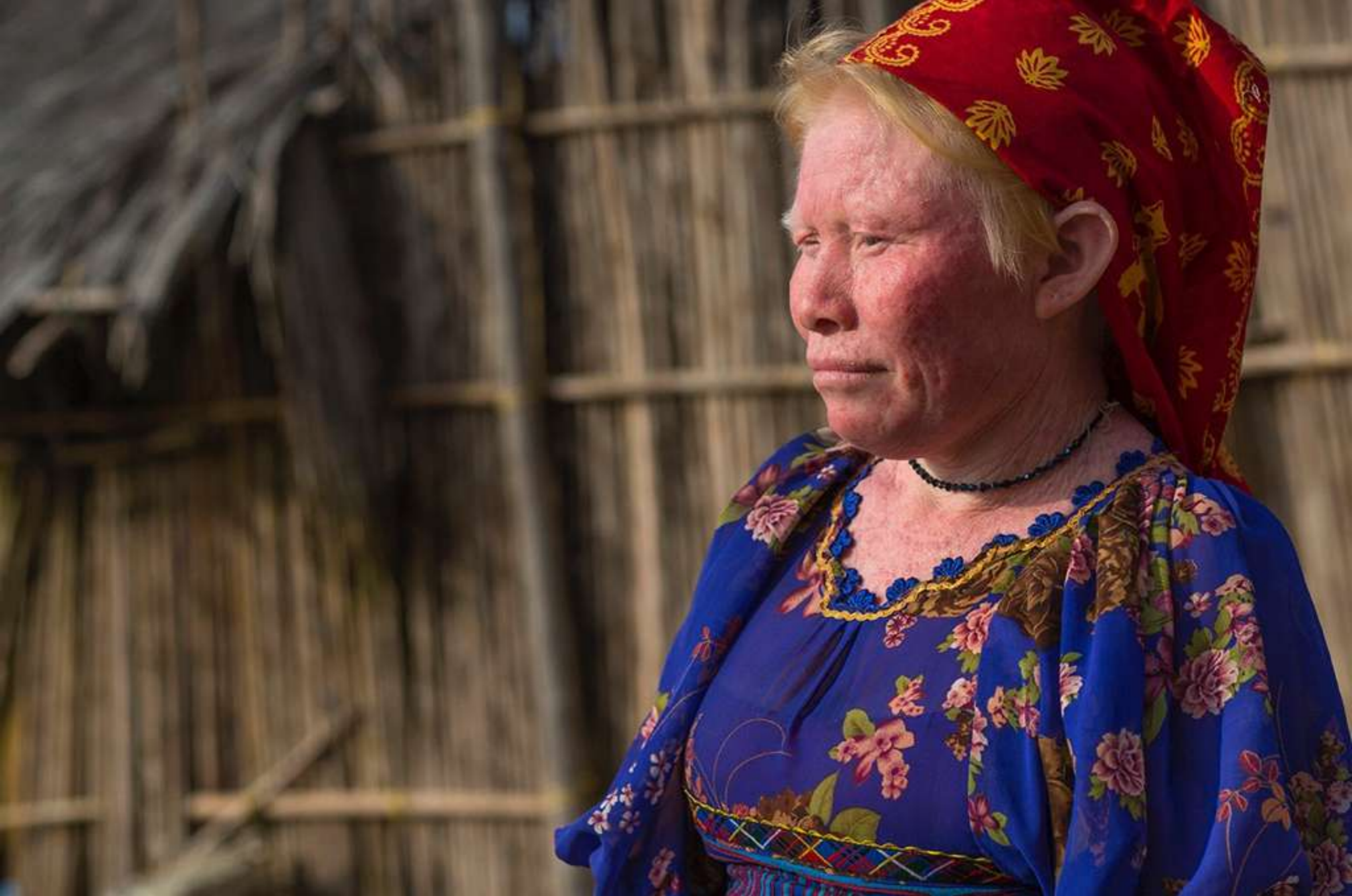
Kuna have one of the world's highest occurrences of albinism with one albino for every 145 births. Locally, these people are known as "children of the moon". Geneticists determined that a gene called Chromosome 15 is the biological root of this abnormality.