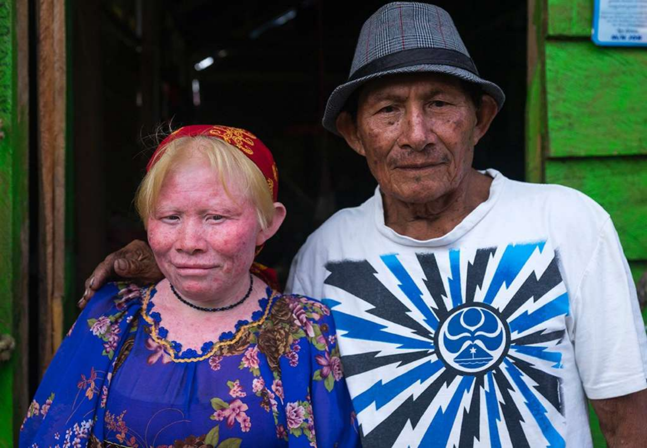
This albino Panama City resident has 9 sisters and 3 brothers, one of whom is also albino. Her father says that albino children are gifts from God.