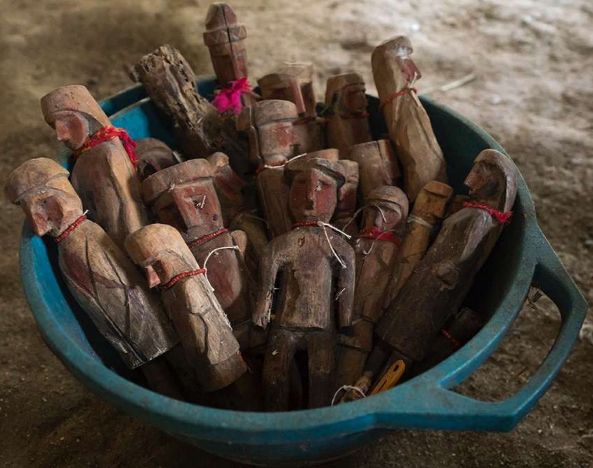
Gatir's parents place wood statues under their boy's hammock. These statues, known as "nuchis", are imbued with good spirits. The Nele employ them to keep the evil spirits at bay.