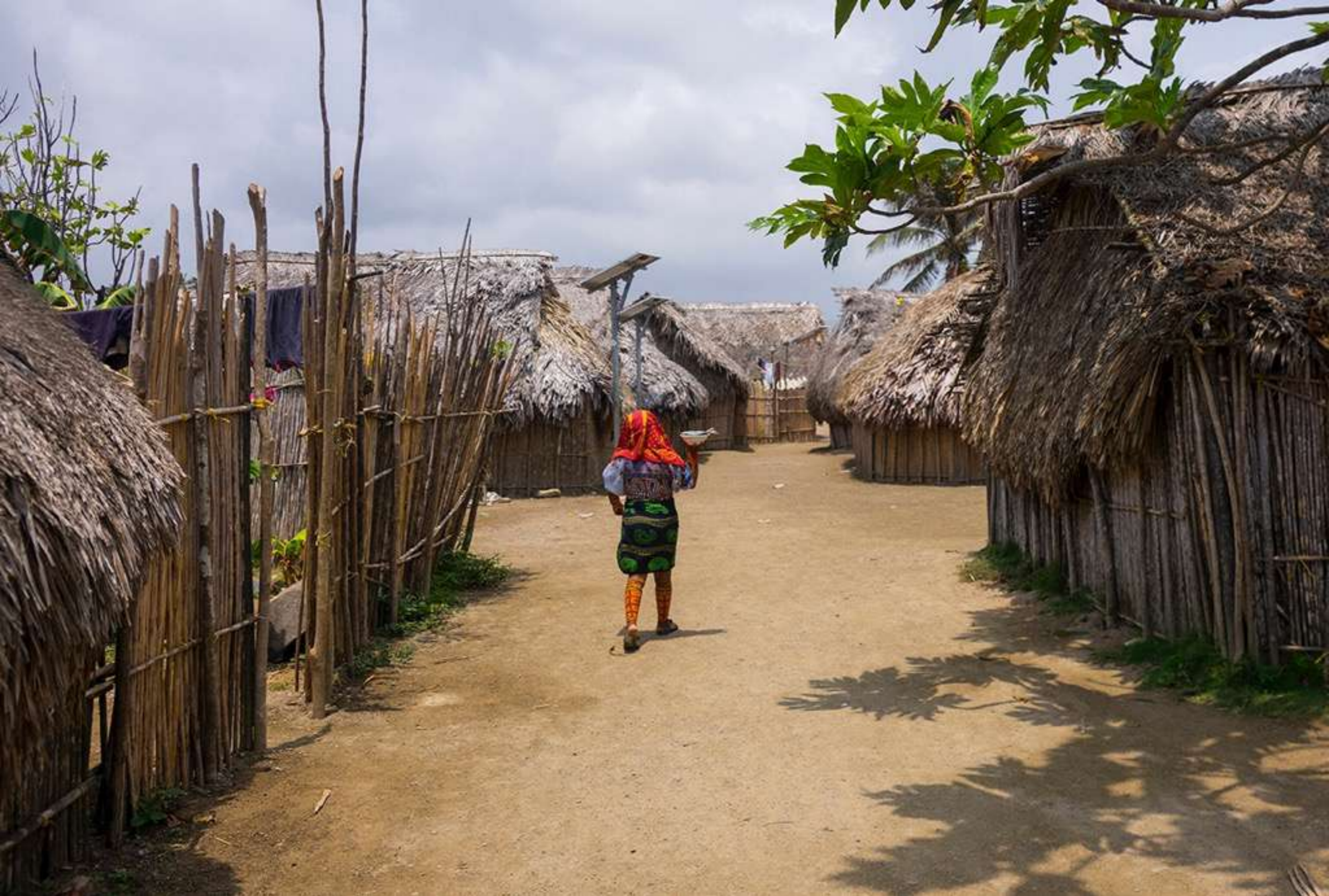
The Kuna community is financially pretty well off despite the fact that they often lack some basic necessities such as plumbing and education. Every fisherman must pay taxes on their catch. Every visitor who enters Kuna Yala (the Kuna territory) must pay an entry fee as well.