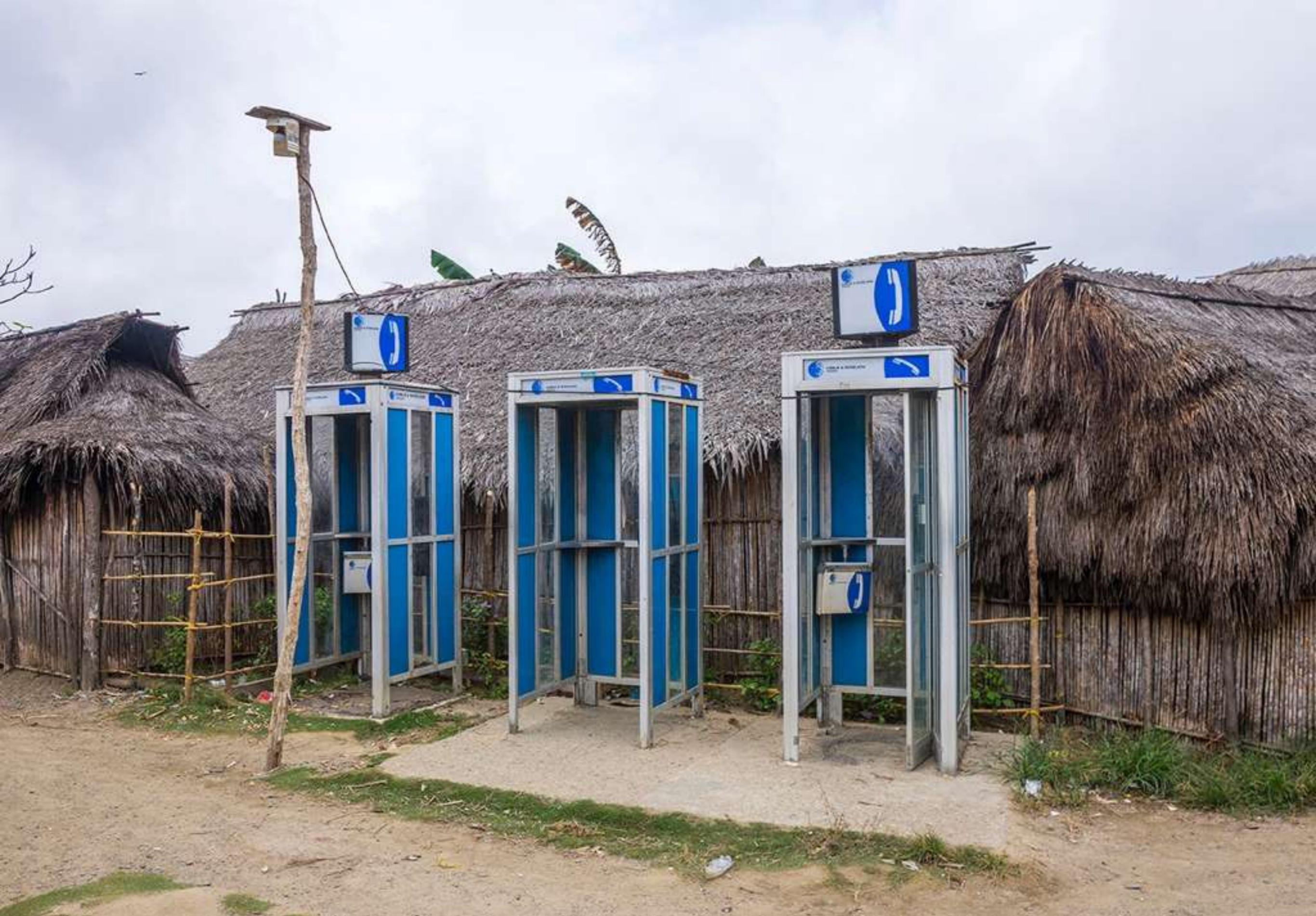
Little by little, modernity creeps its way into the Kuna world. They now have solar-powered pay phones that allow people to keep in touch with their families who emigrated to Panama City for work.