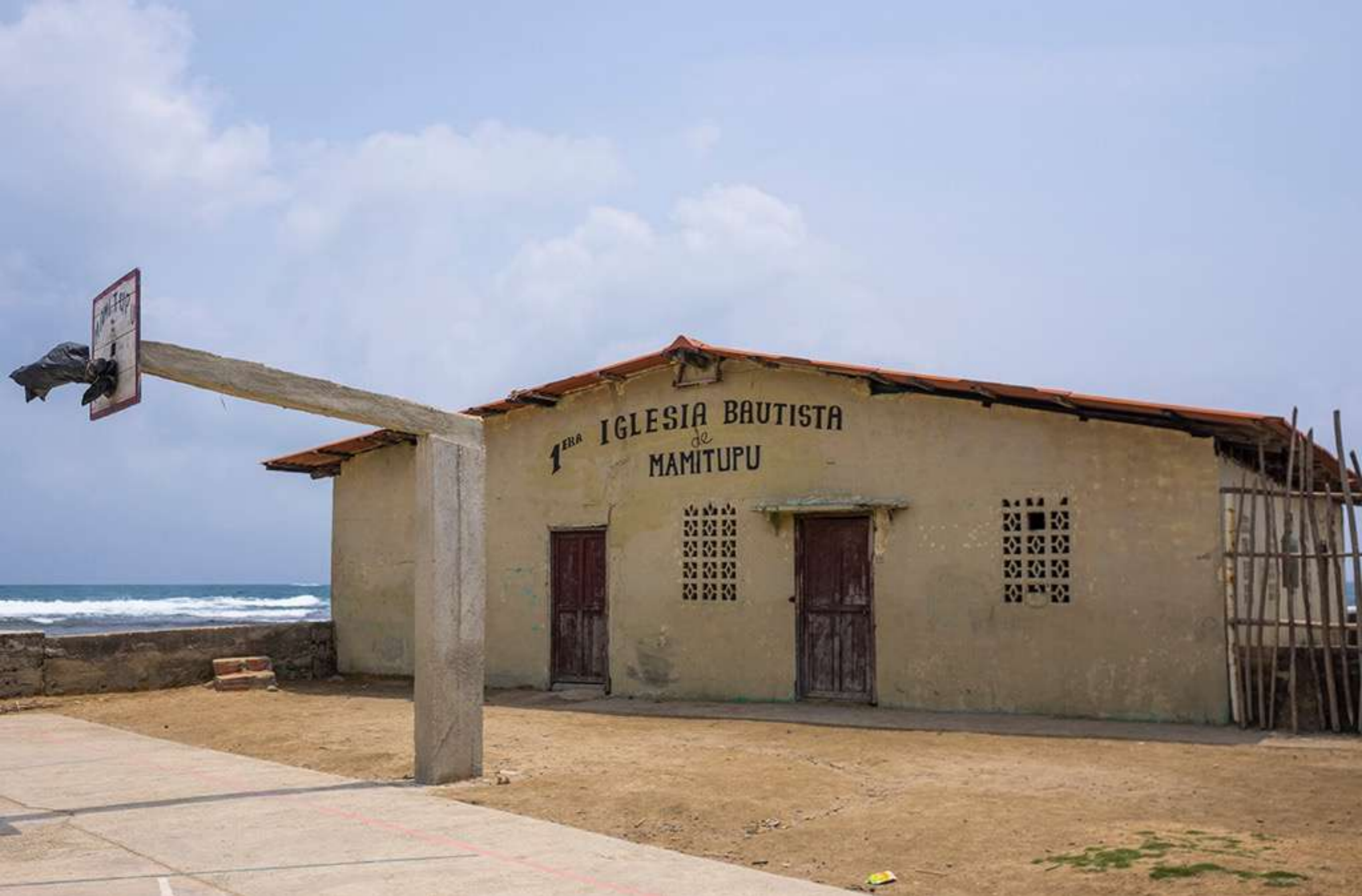
Throughout history, many different religions have tried to convert the Kuna to little avail. The few Kuna that have joined a foreign religion have simultaneously maintained their traditional animist beliefs. This is the First Baptist Church in Mamitupu.