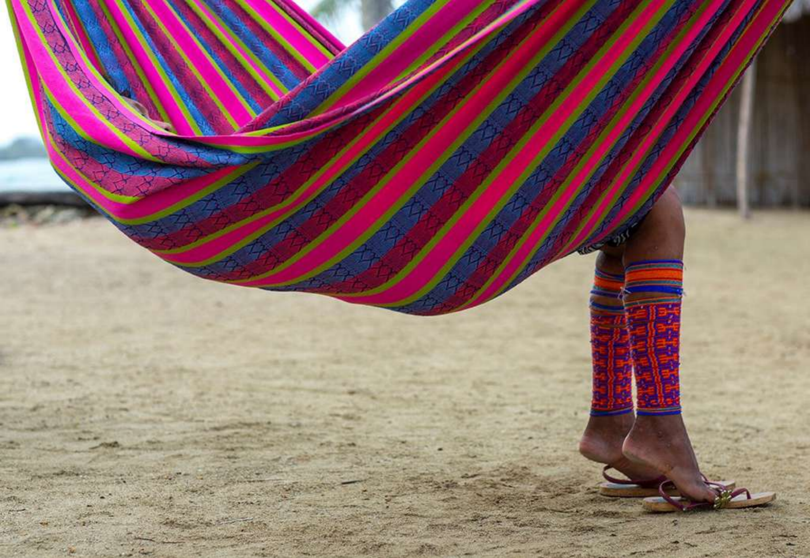
The extra chique Kuna coordinate their winis' and hammock's colors. The society regards thin arms and thin legs as attractive features.