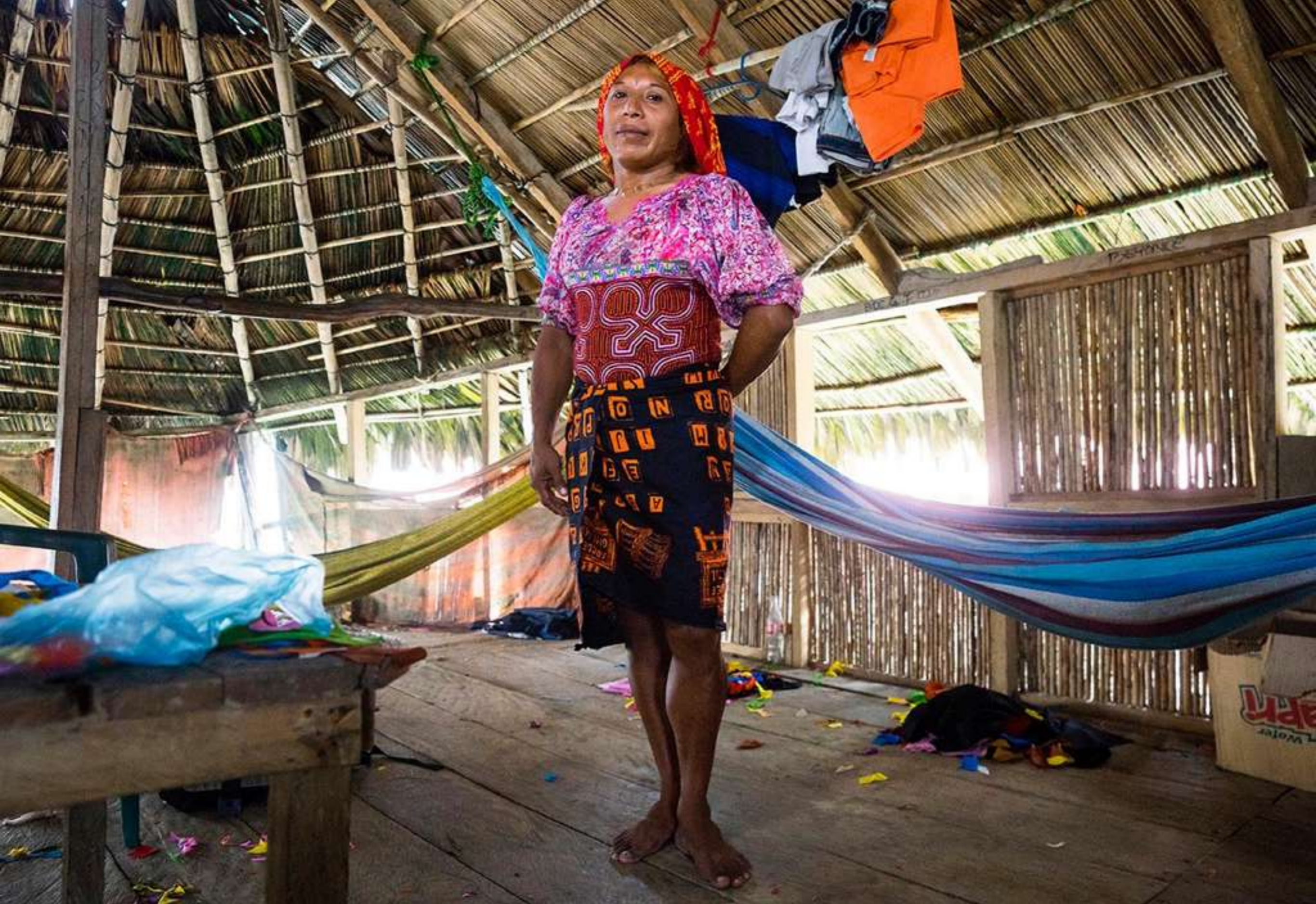
Erme likes to crossdress in the privacy of his home but the village leader has forbidden him to wear women's clothes in public.