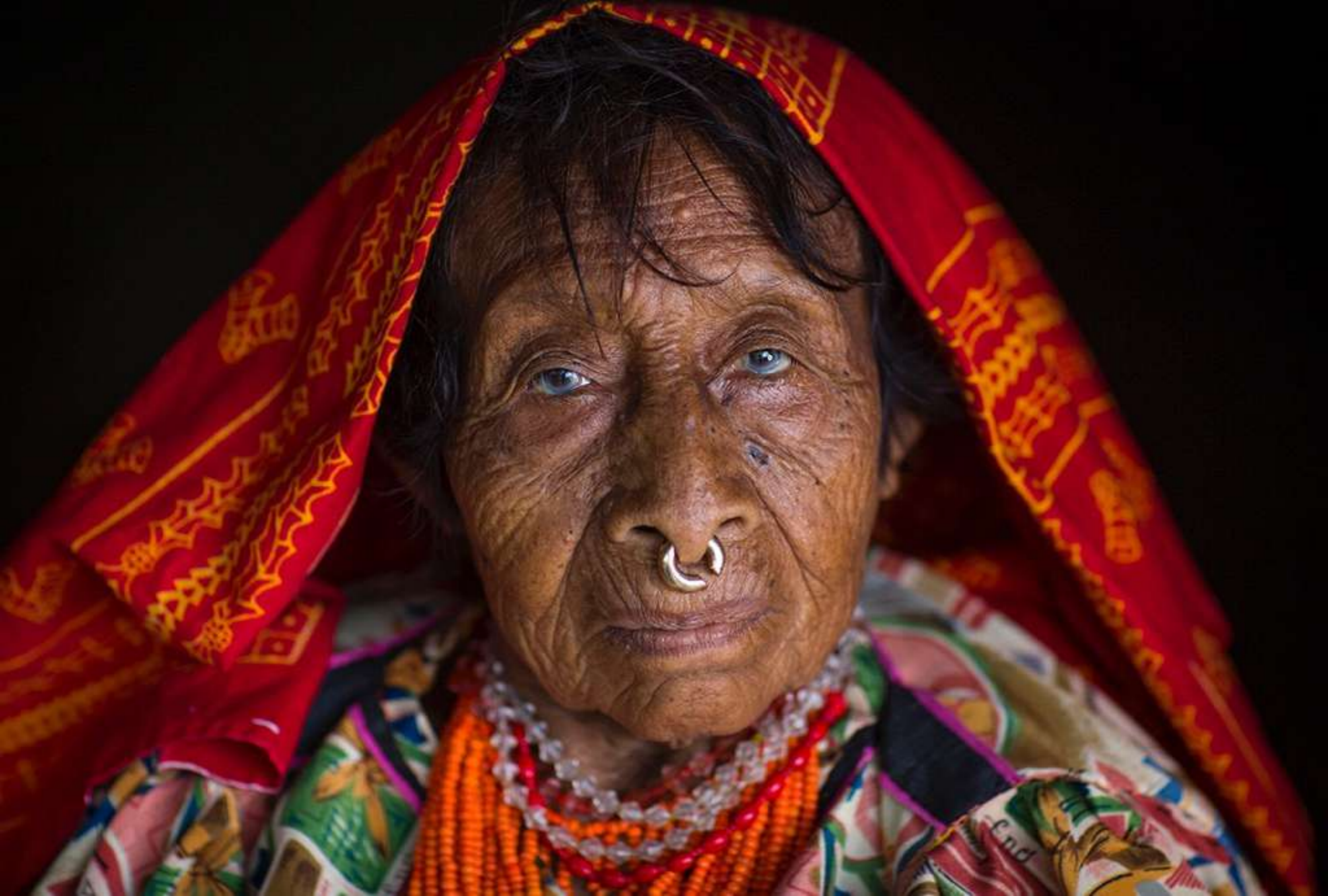
The Kuna are known for their longevity. Many believe it is due to their high consumption of cacao. Blood pressure is also very low on average.