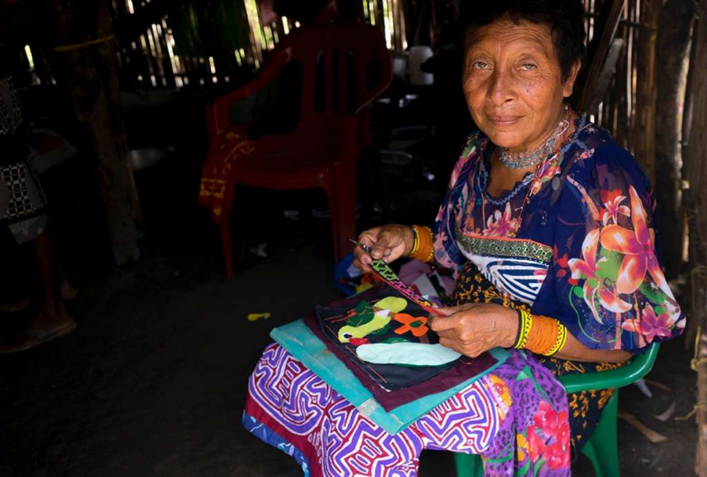
A Kuna woman receives her name when she begins menstruating. On the day of her first period, she cuts her hair short. This is one of the most important ceremonies in her life. From that day forth, she will never grow her hair long again. Elderly women dislike having their picture taken. They believe that once it appears in a magazine, the paper will inevitably be burnt, and their soul will fade away with the smoke.