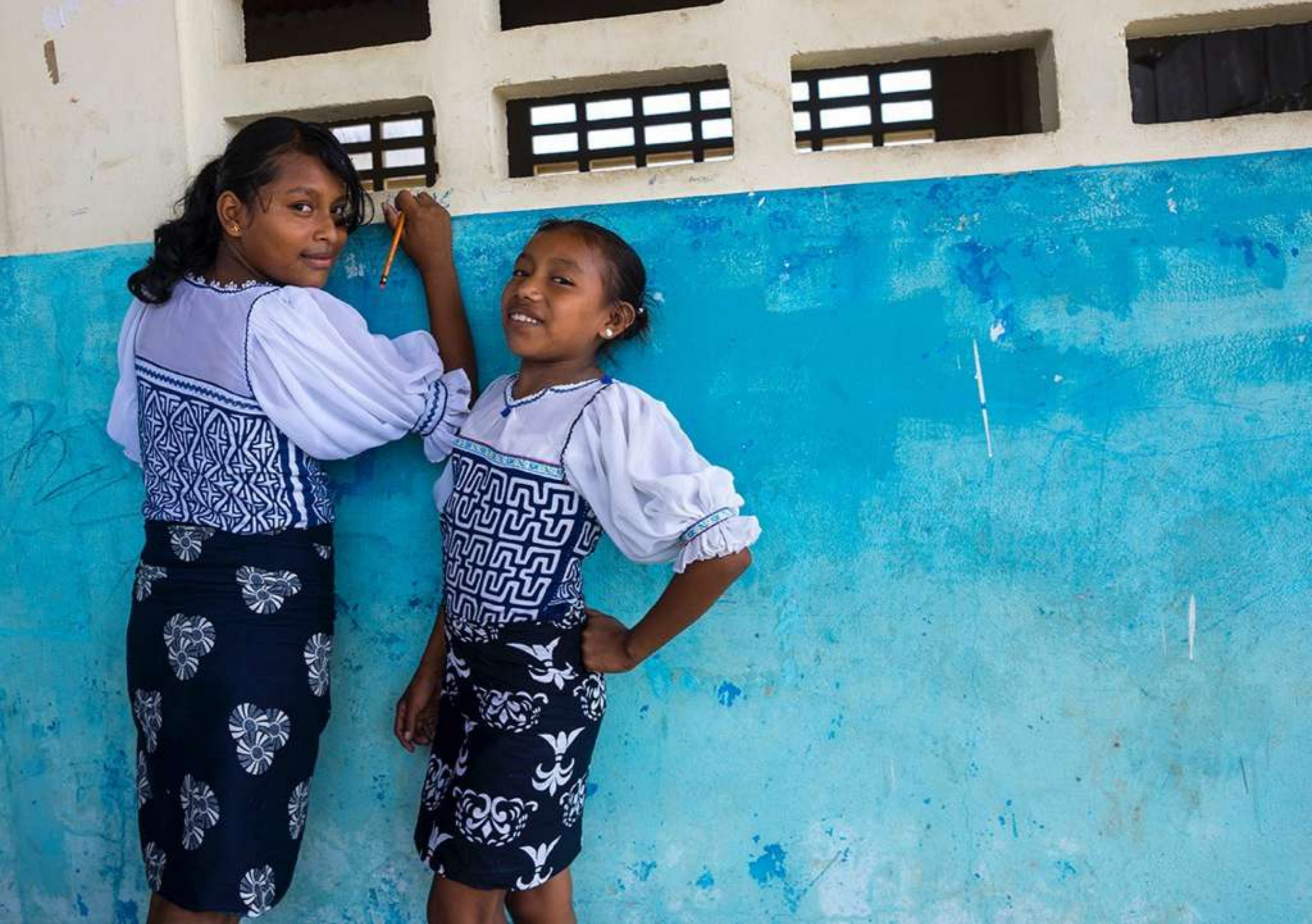
Even school uniforms are influenced by the mola art.