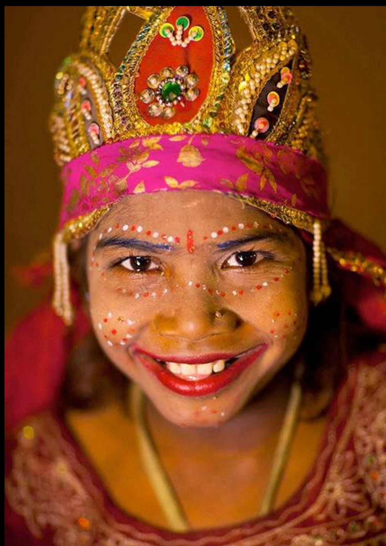
Little girls dressed up as Hindu divinities.