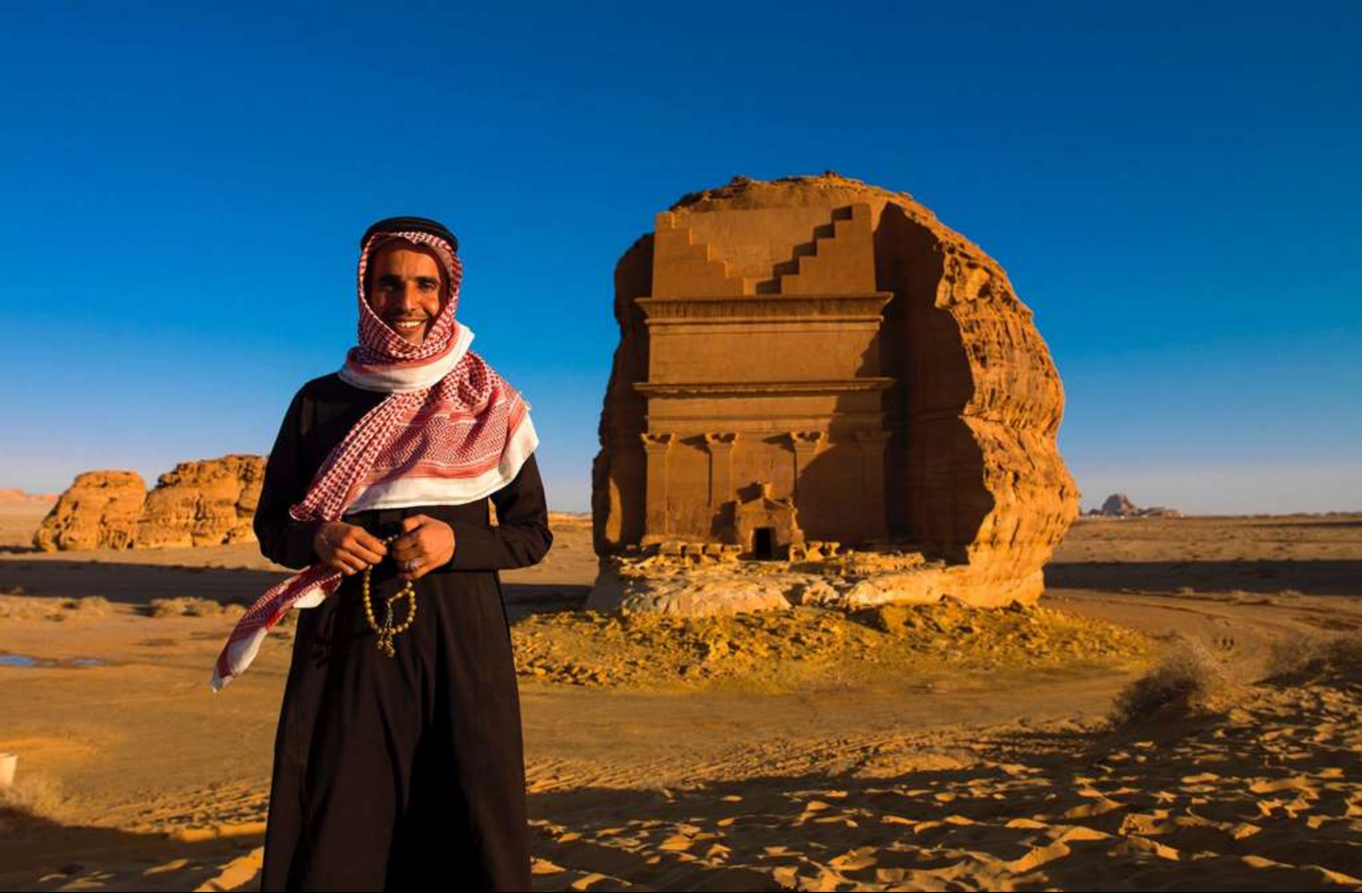
Madain Saleh is a sister city to Petra, Jordan. It is a UNESCO World Heritage site that is home to 111 perfectly preserved Nabatean tombs. The magic of the site also lies in the total absence of tourists, Coca-Cola sellers or souvenirs shops.