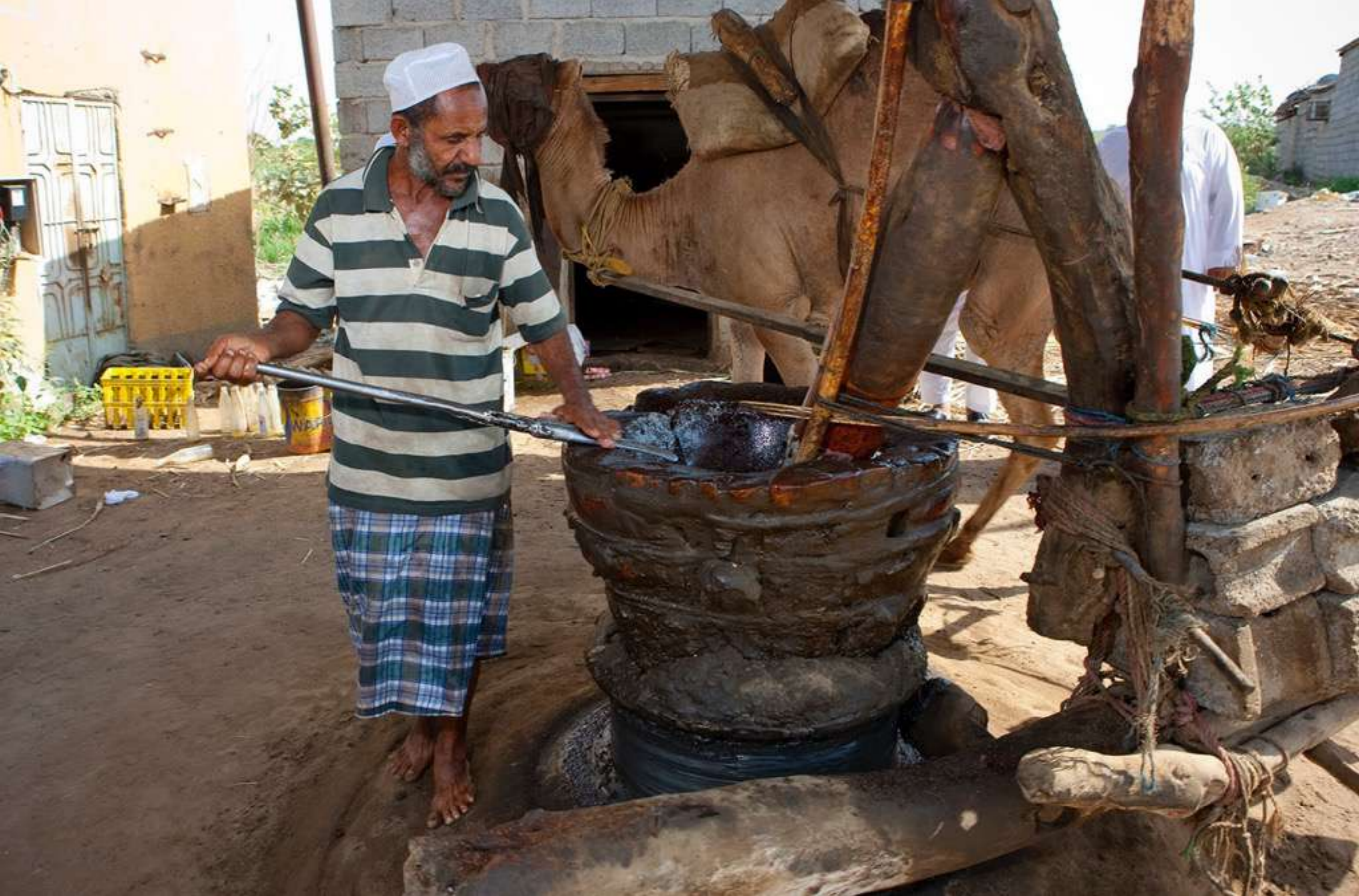
Many imagine the Kingdom to abound with luxury buildings and signs of wealth, but outside of the cities, the country remains rural and in some places, you can see scenes that are reminiscent of « biblical » times, like here with a camel turning the mill for the pressing of sesame oil.