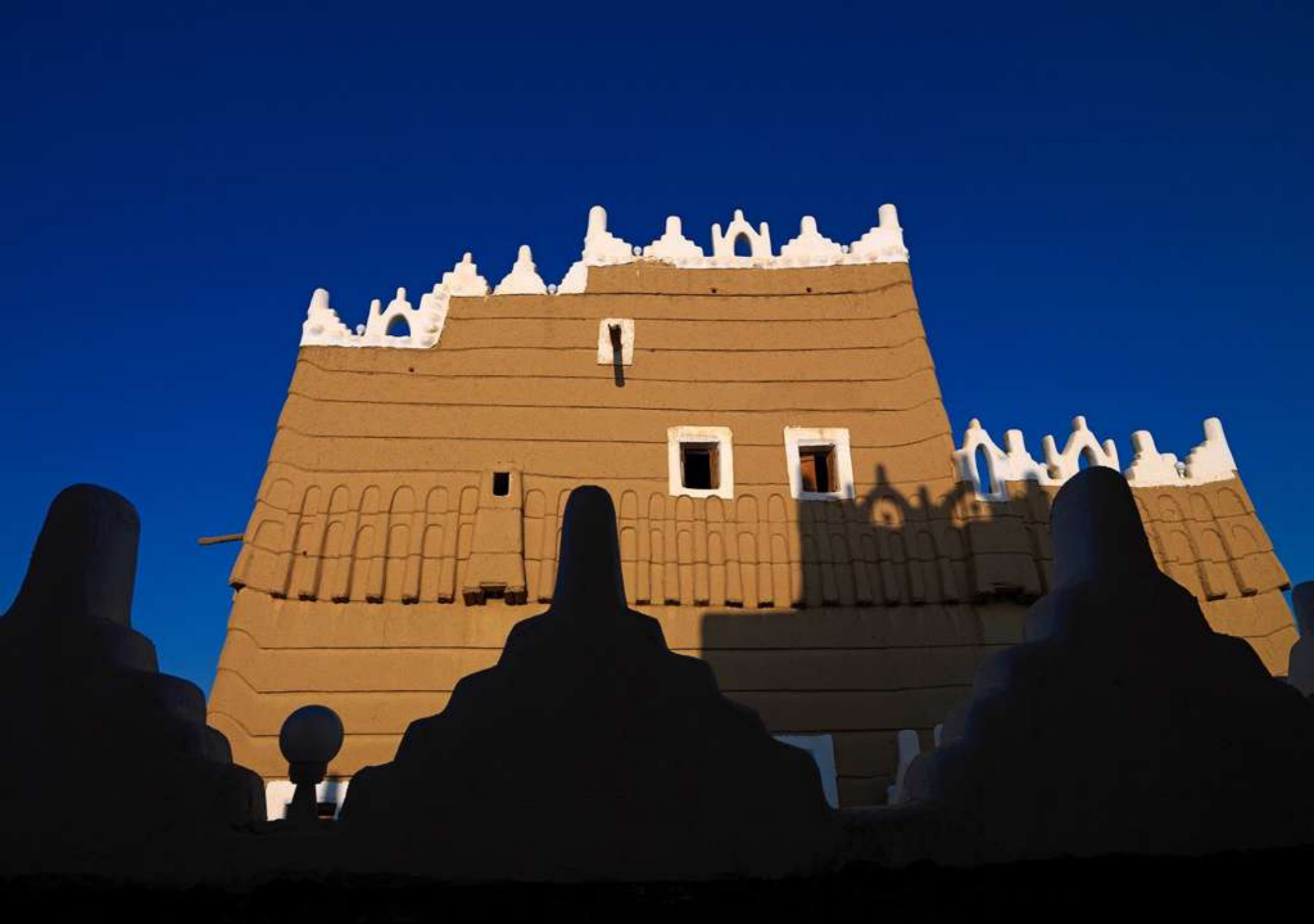
Heritage conservation is a priority of the Saudi government. The forts were all renovated to perfection.