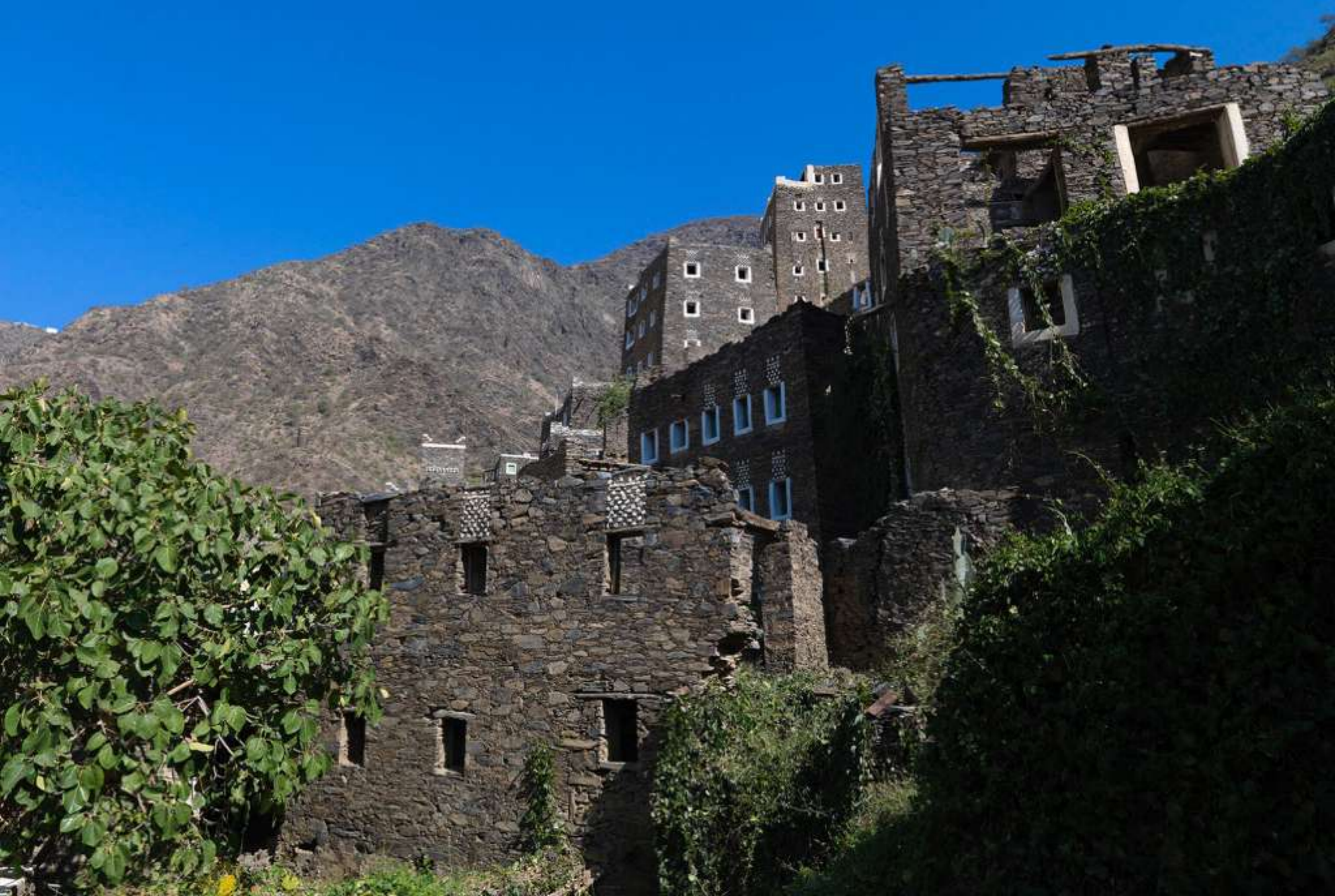
The mountain village of Rijal Alma, which is made almost entirely of stone, used to be the flower men's home. But most of them have left their old houses for easier access to water and the whole village has been turned into a tourist attraction.