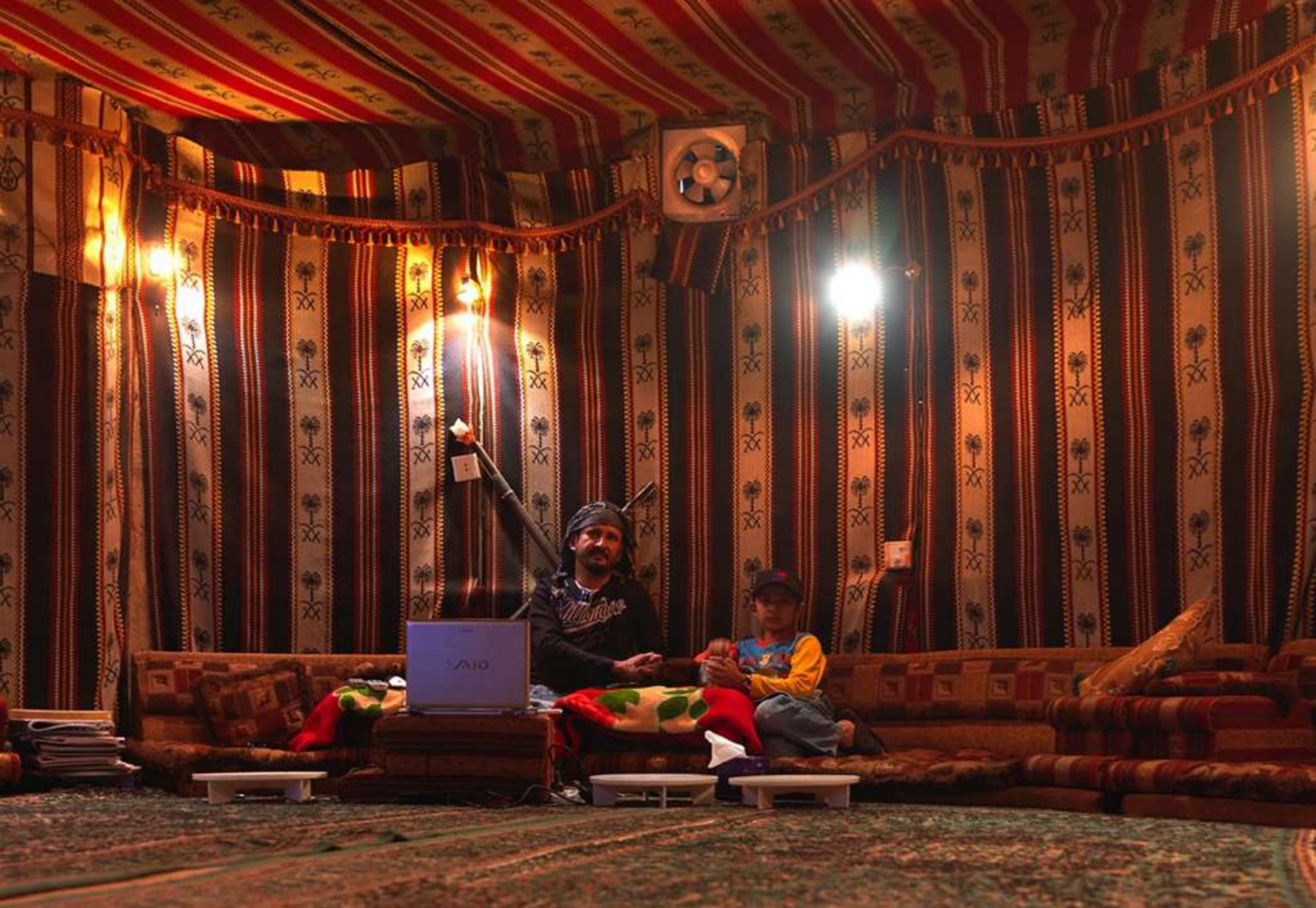
No, this father is not in the desert. His house is at the top of Al Fifa mountain, with the best view in Saudi Arabia. But the real fun for him is to be in a room where he has set up... a Bedouin tent.