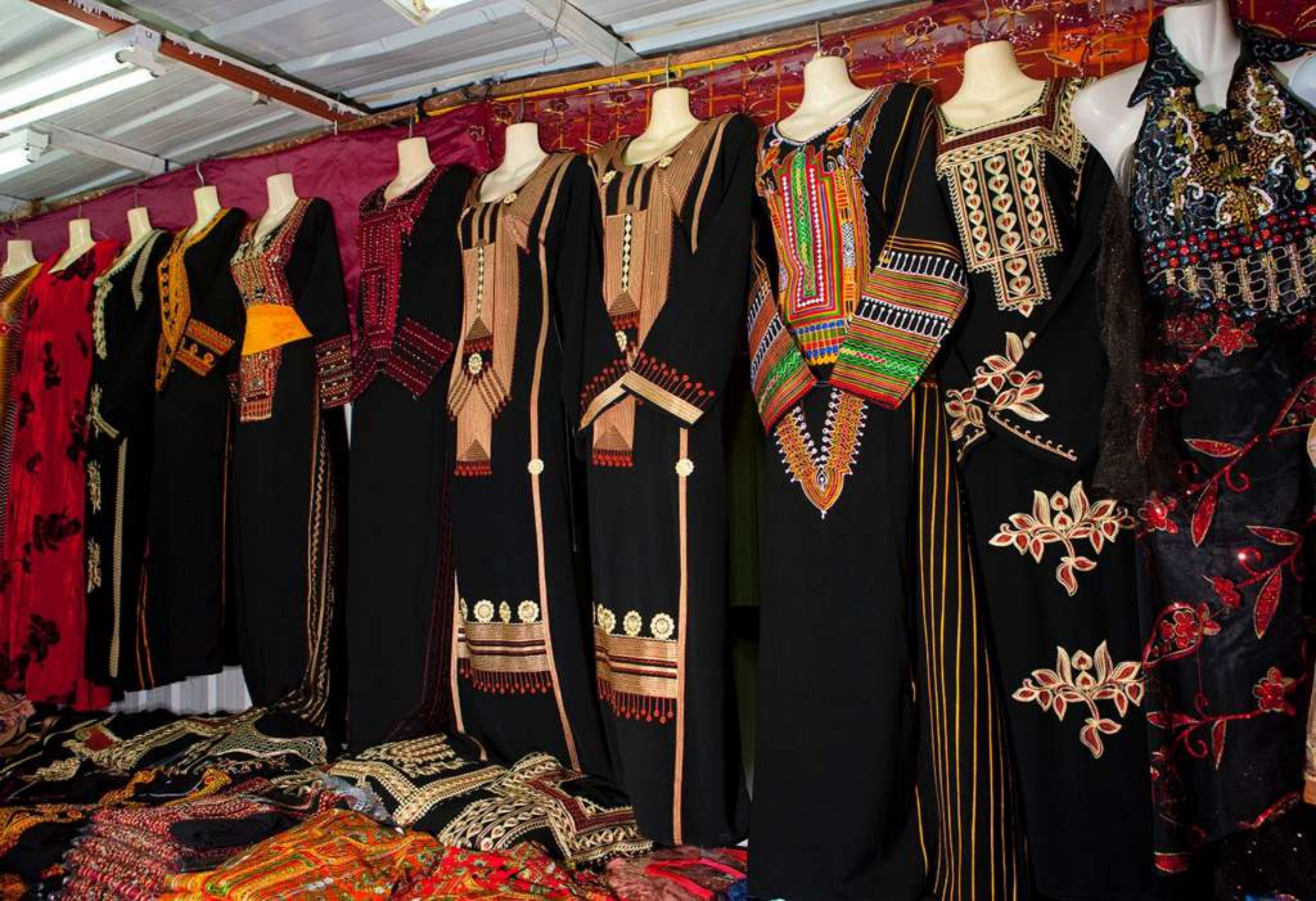
In the souk of Abah, the traditional colorful dresses that are worn under the abayas. Saudi Arabia is home to more than 10 Victoria Secret stores. Advertising is prohibited and the staff is exclusively male in the stores.