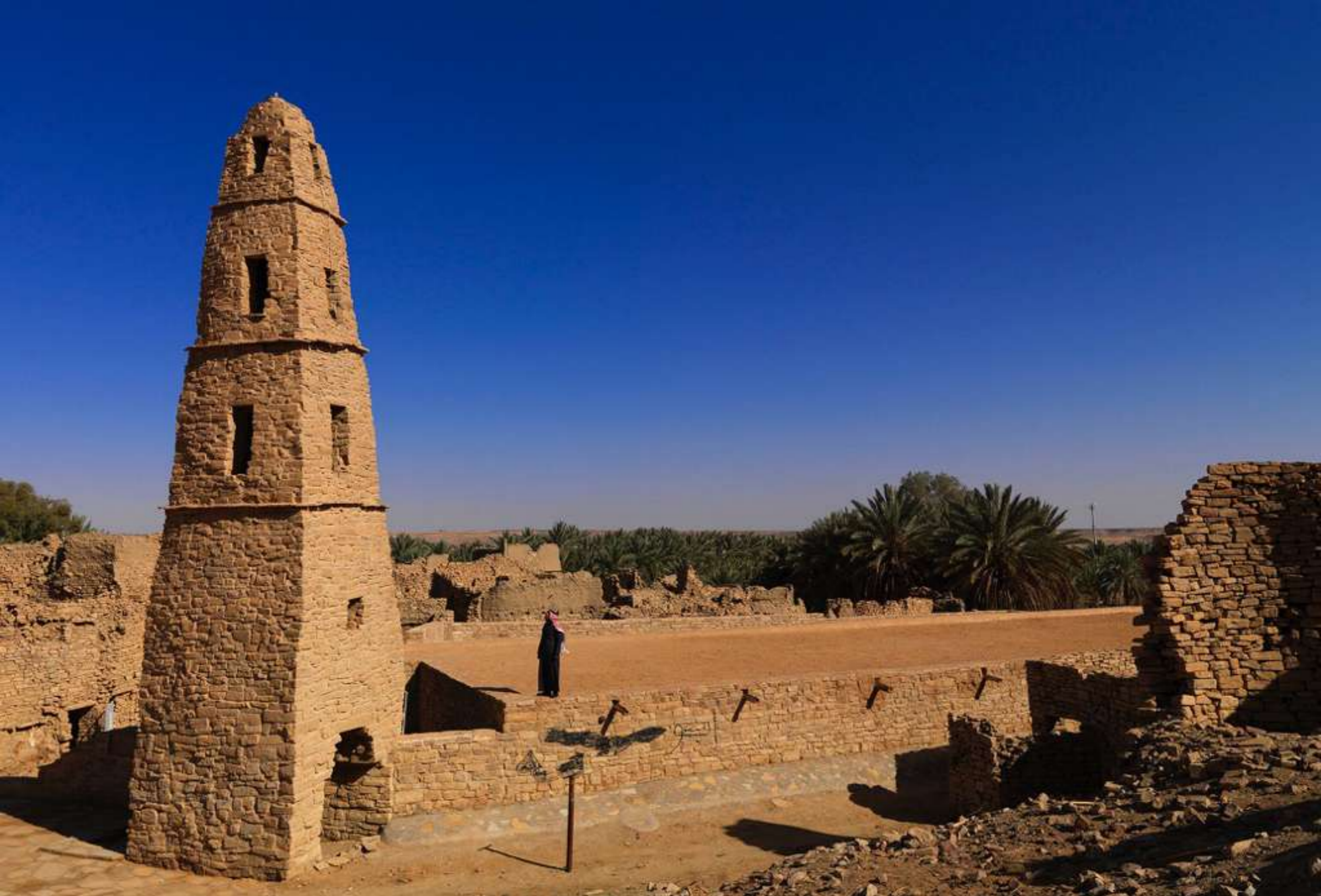
The Omar Ibn al-Khattab mosque was built with stones in 633 and is located in the town of Dawmat al-Jandal, an important crossroads of ancient trade routes connecting Mesopotamia with the Arabian Peninsula.