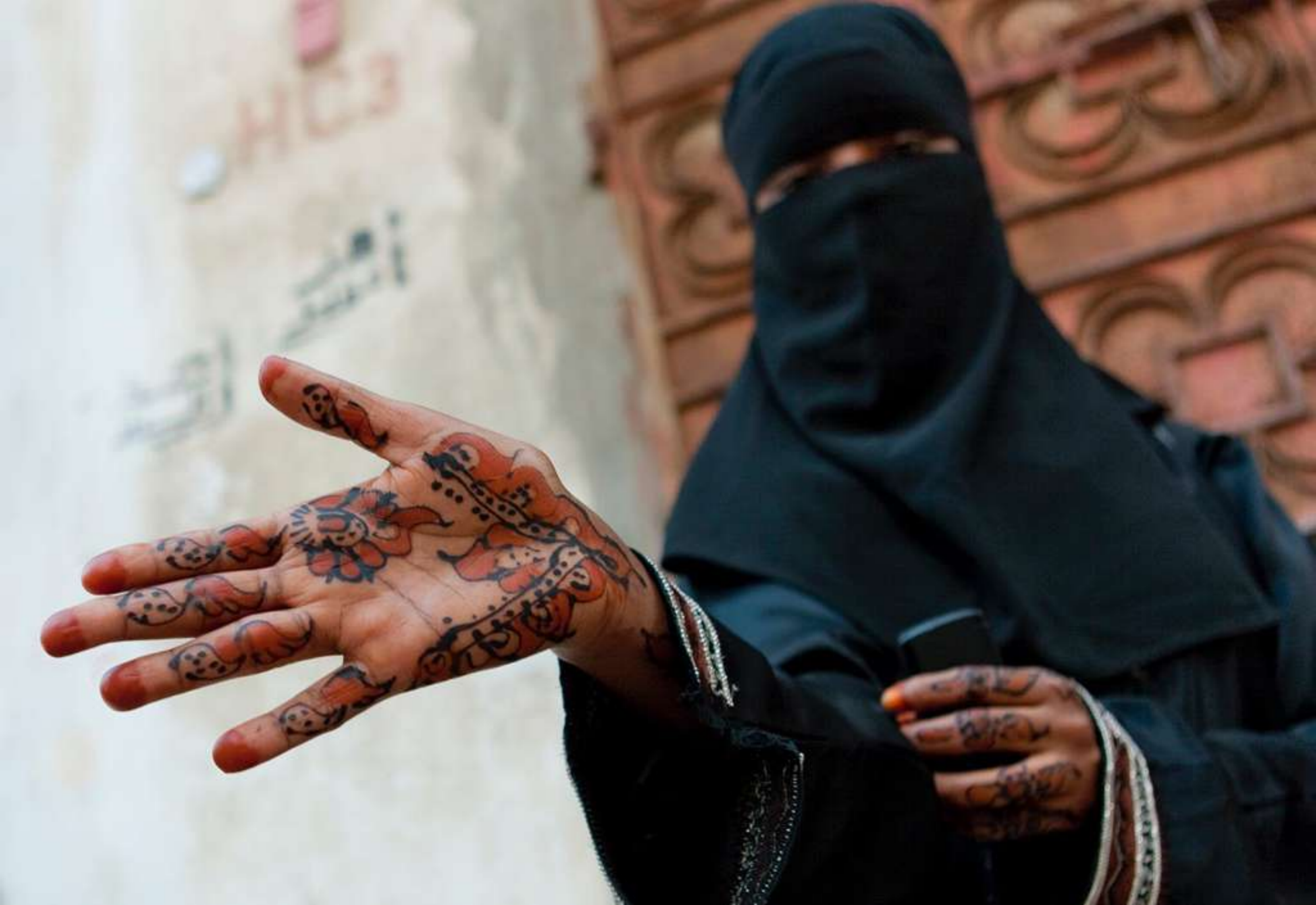
The only women you will be able to talk to in the street: emigrants, who are all Muslim. Pictured here a Somali girl in the streets of old Jeddah.