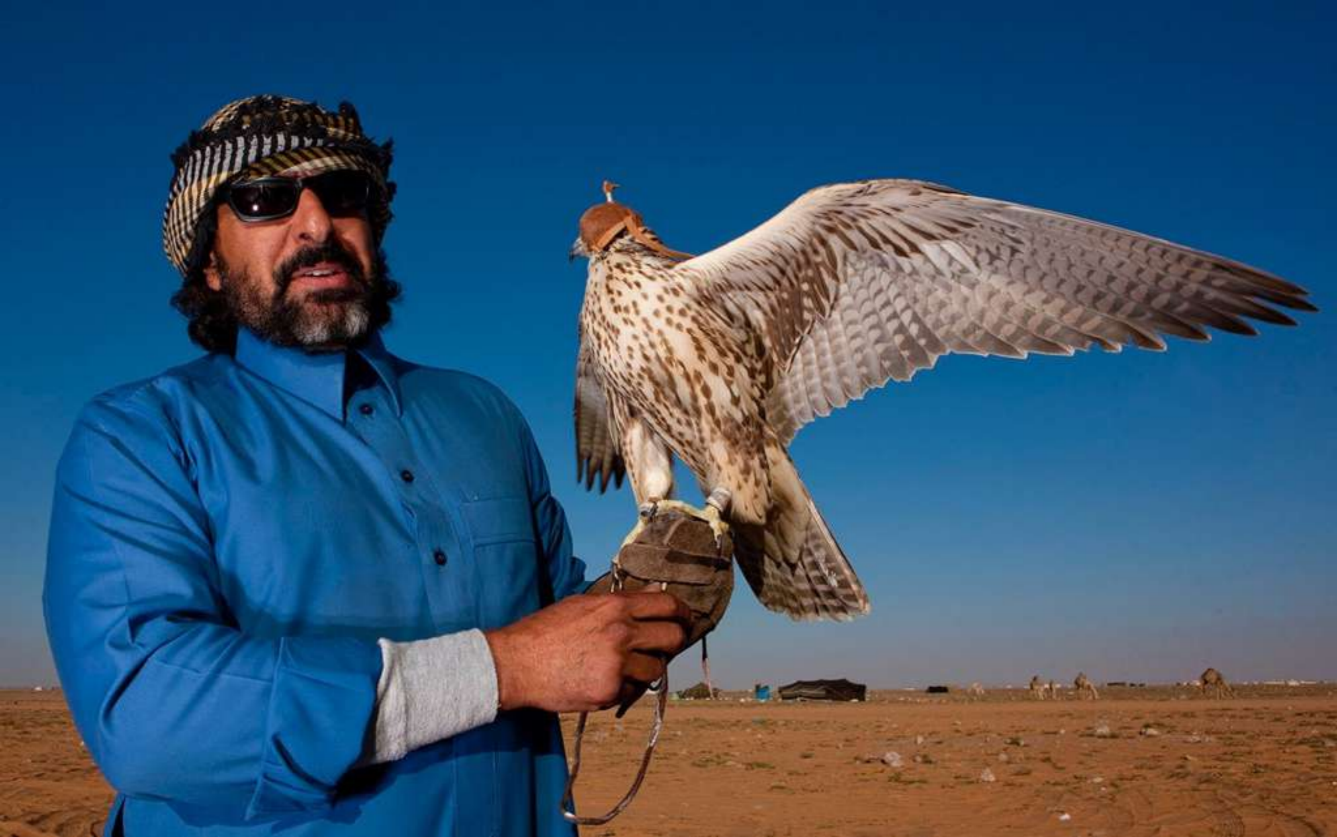
Falcon hunting in the Al Jouf desert. A pigeon is released into the air before a falcon chases it down. The owner jumps into his four-wheel drive to try and follow his bird of prey. But the hunt is short-lived – in less than a minute, the falcon has killed the pigeon. It receives its head and heart as a reward. The owner never leaves his pet out of his sight, and for good reason: the falcon cost him 20,000 dollars.