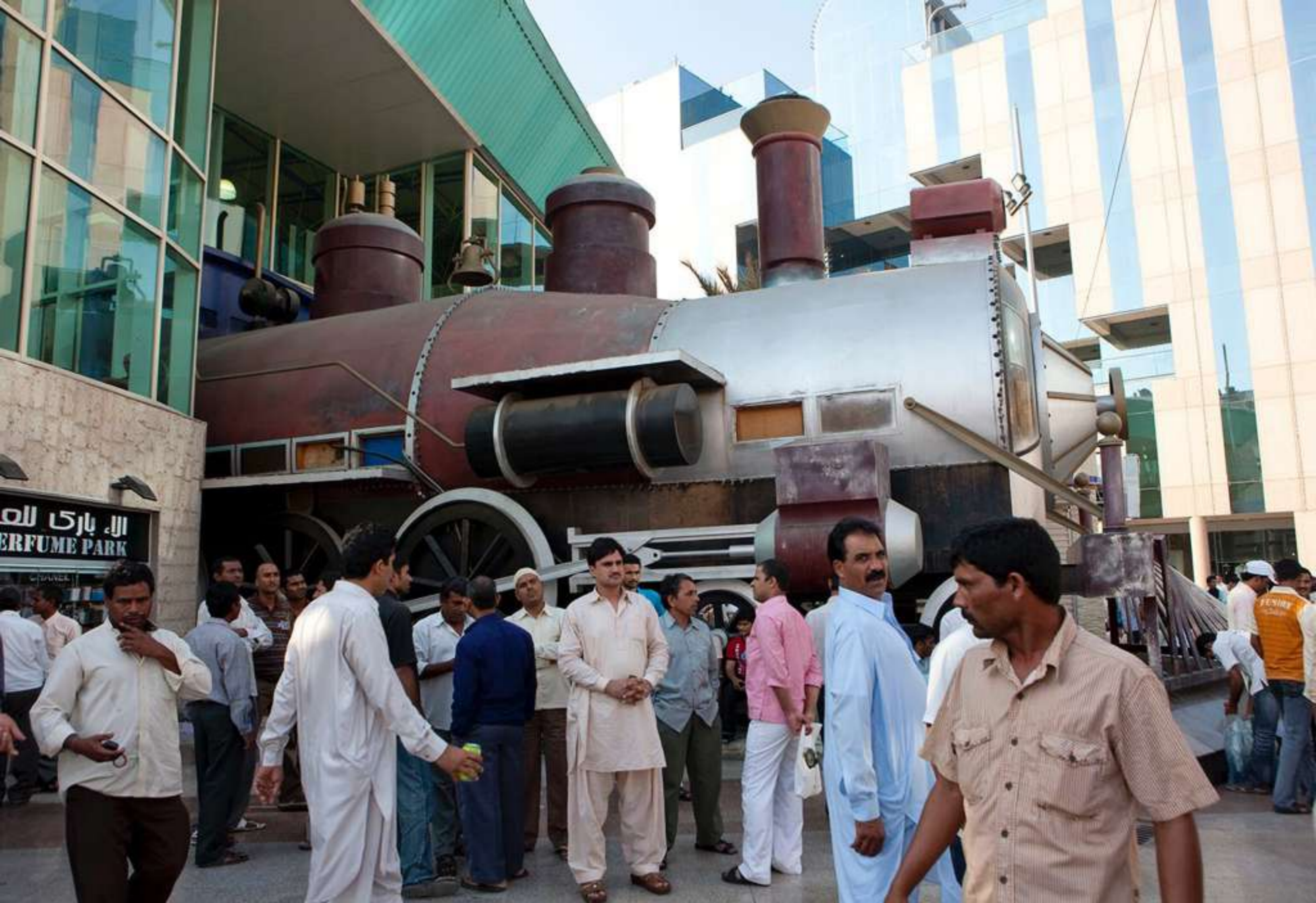
Extravagance is one of the characteristics of urban design in Saudi Arabia. Here, a train coming out of a store in Jeddah, in the main shopping street.