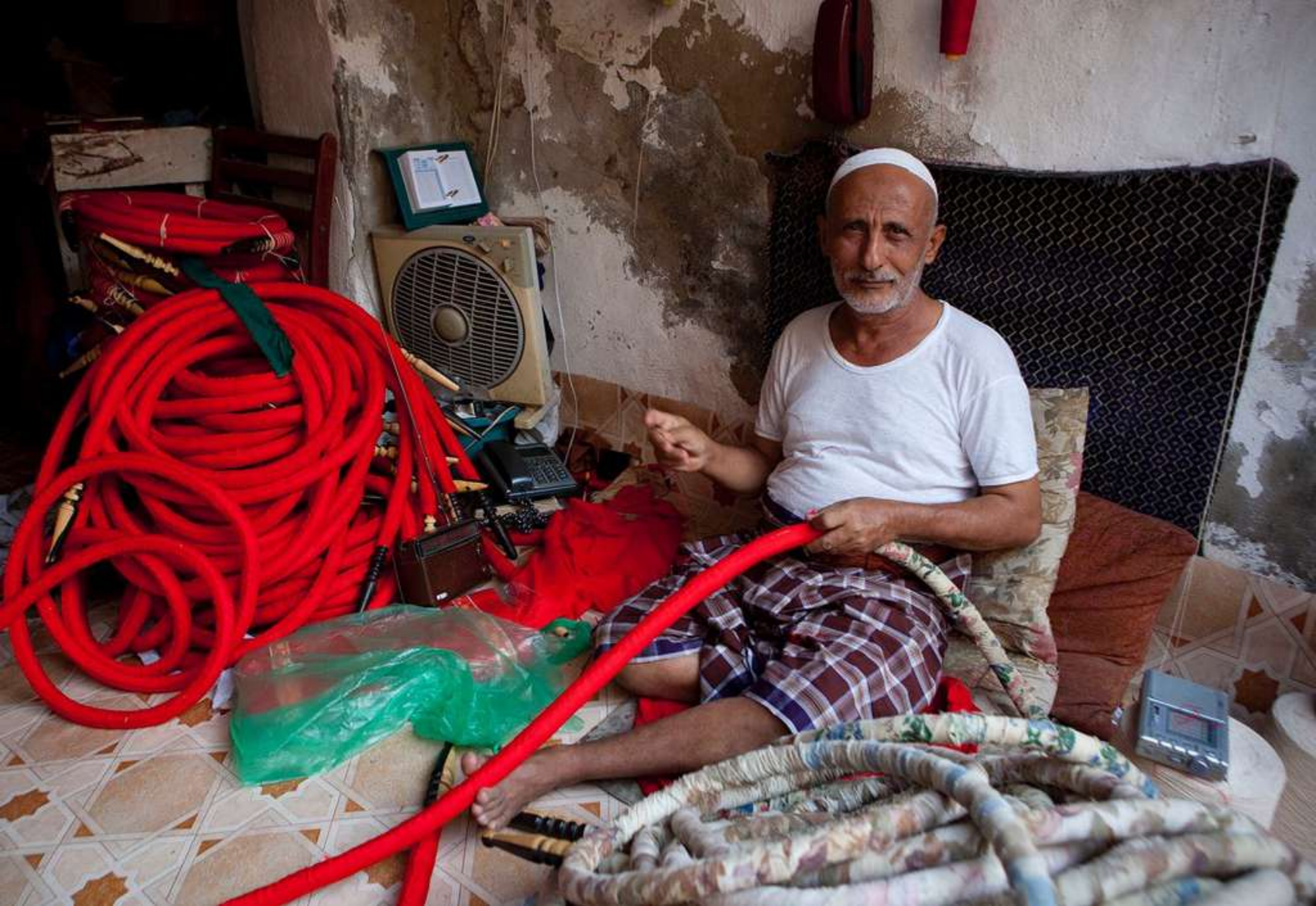
The old souk of Jeddah is the best place to see craftsmen still carrying on local traditions, like the making of the shisha for smokers.