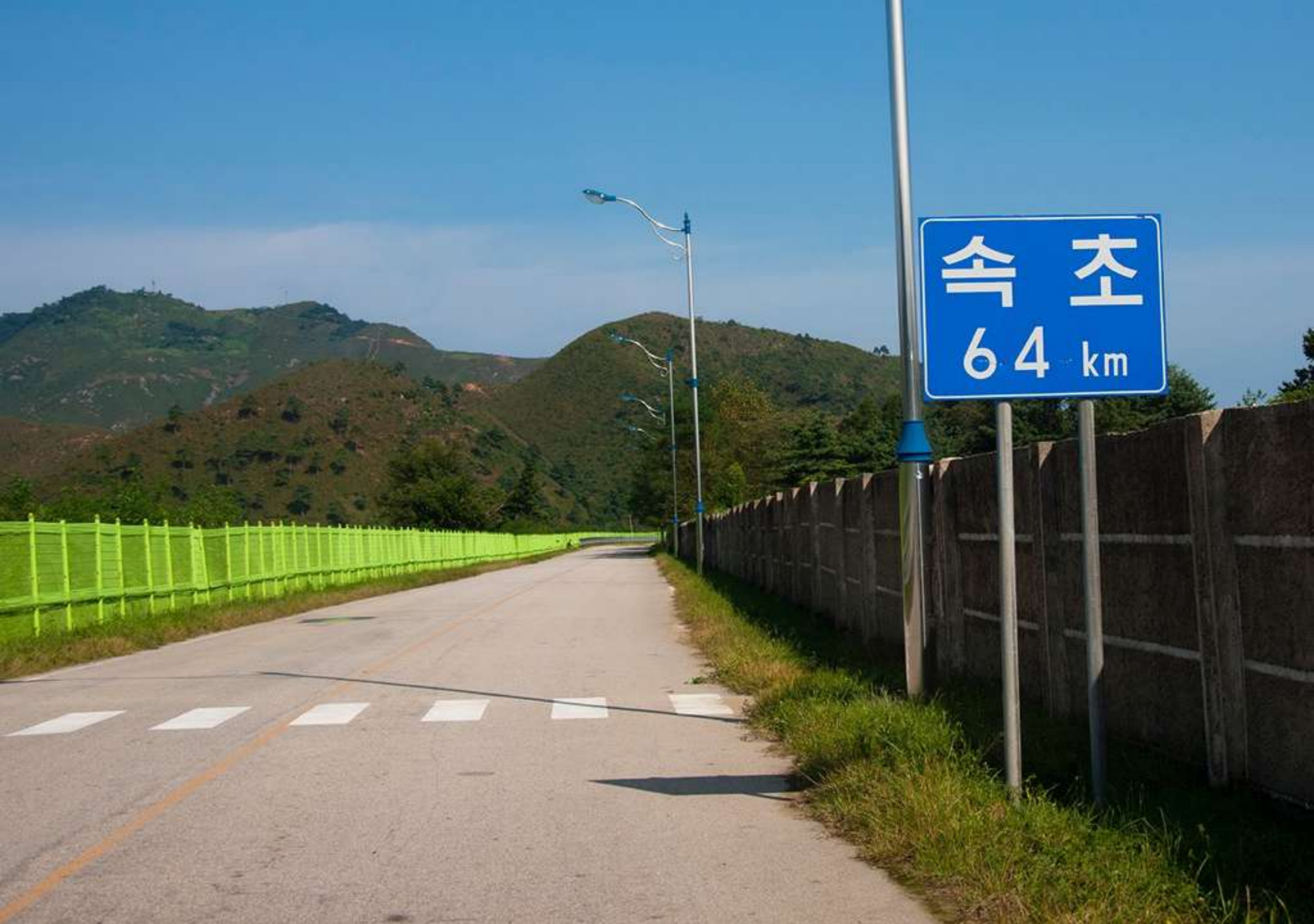
A sign saying that Seoul is just 64 km away from North Korea.