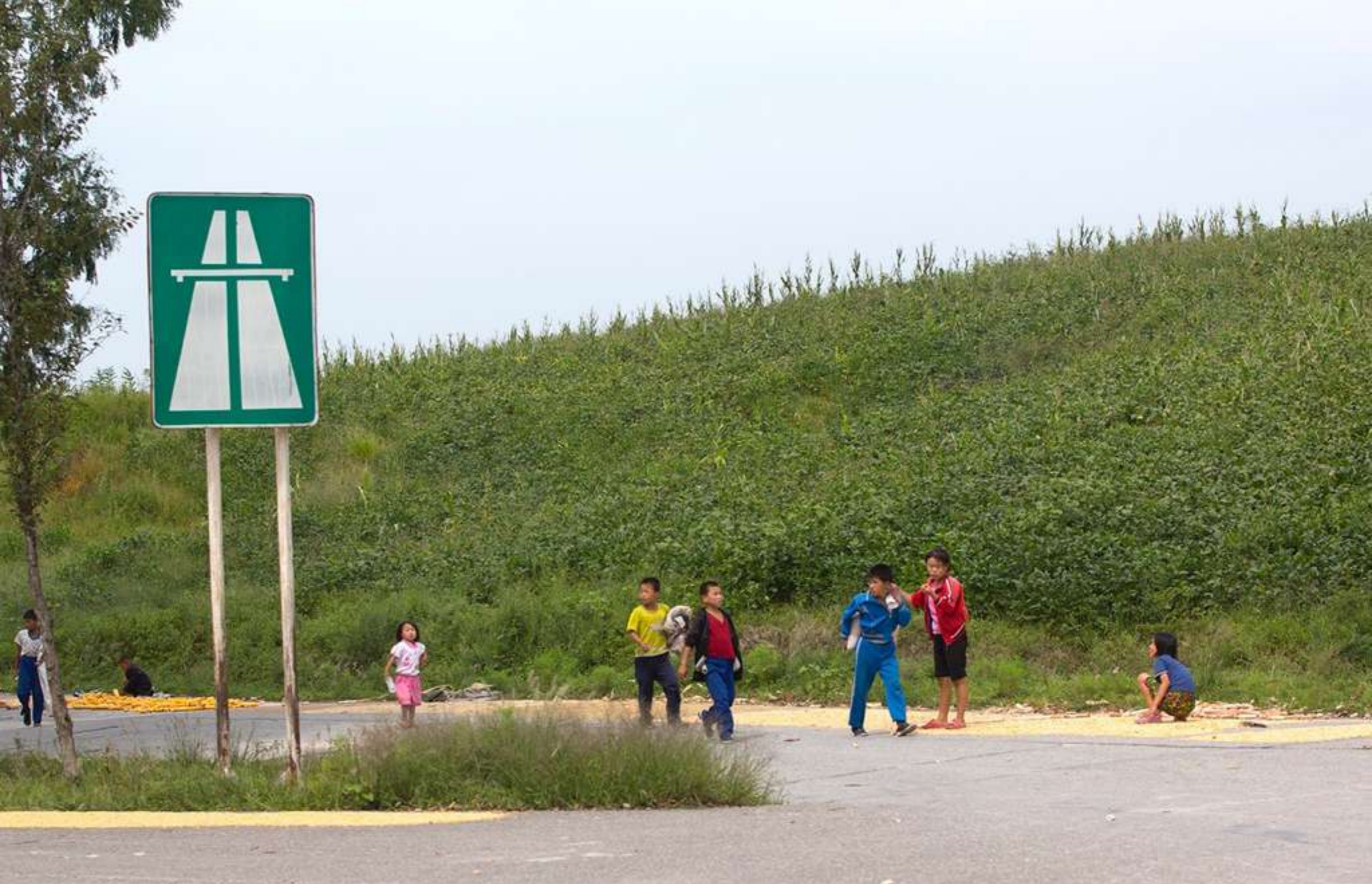
A highway junction is so rarely used by cars that kids can even dry corn on the road! Getting on the highways is a very good way to see scenes of local life, even though the bus driver drives at very high speed trying to hide the reality from foreign visitors.