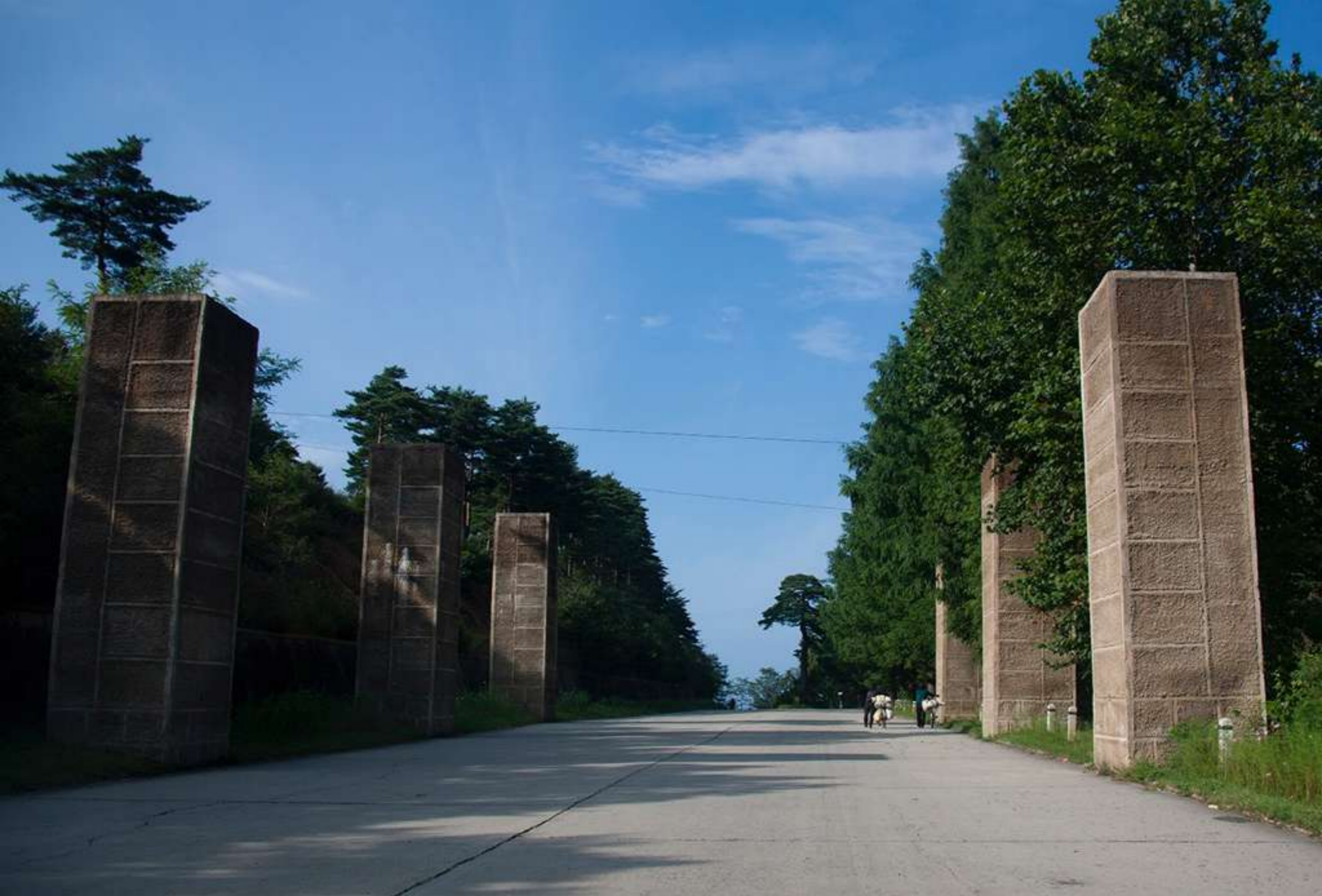
All along the highway near the south korean border, you can see those huge cement blocks. They can be used to block the highway in case of American invasion.