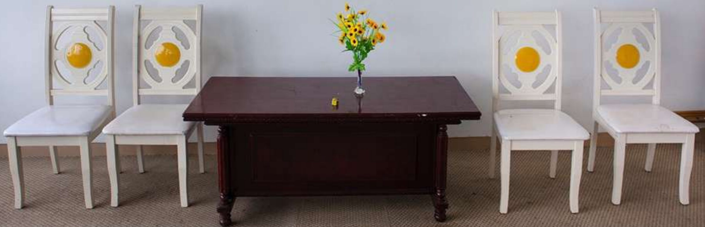
A nice and relaxing room in a Highway.