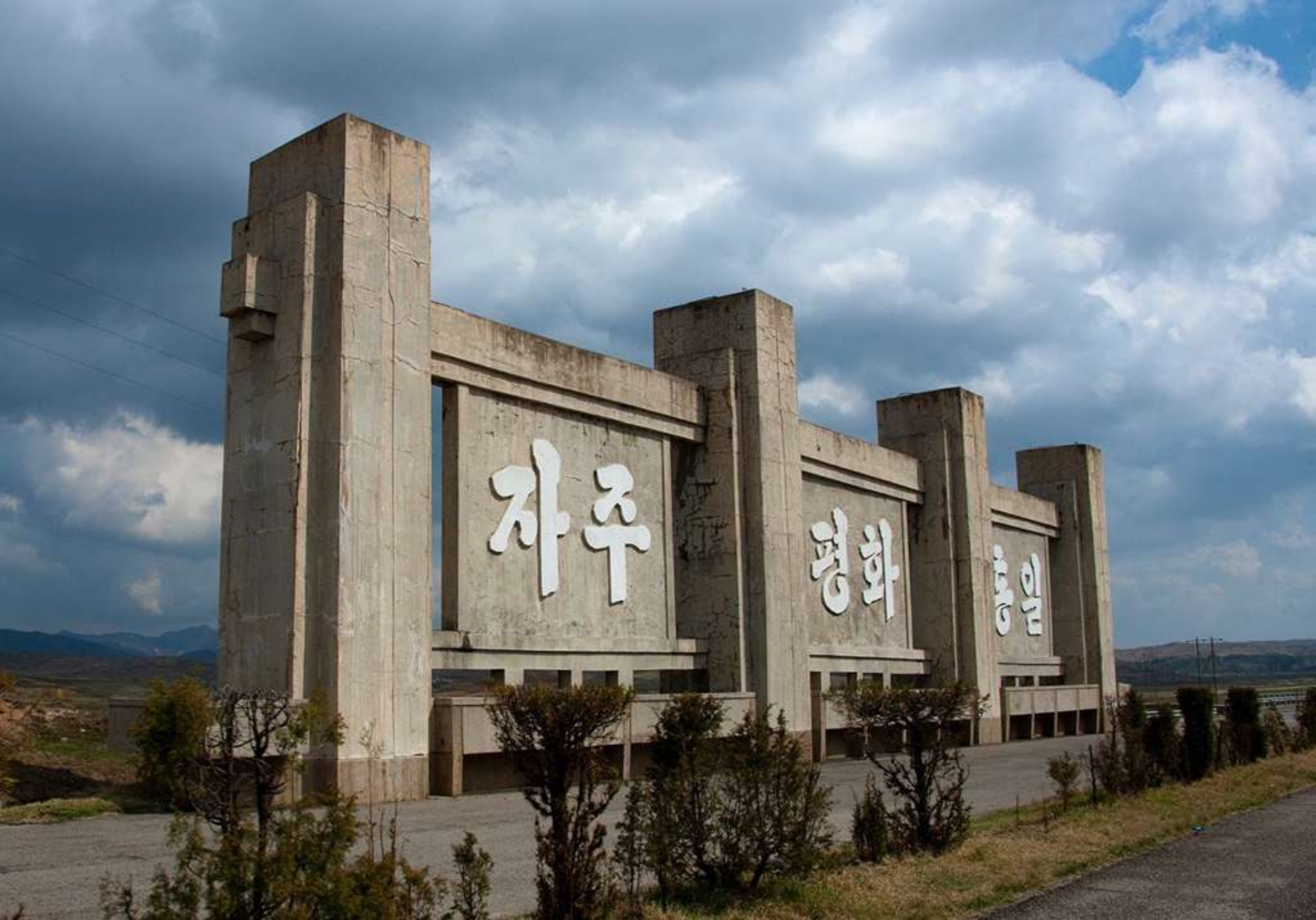
«Independance, peace, reunification » on the cement blocks of the DMZ highway.