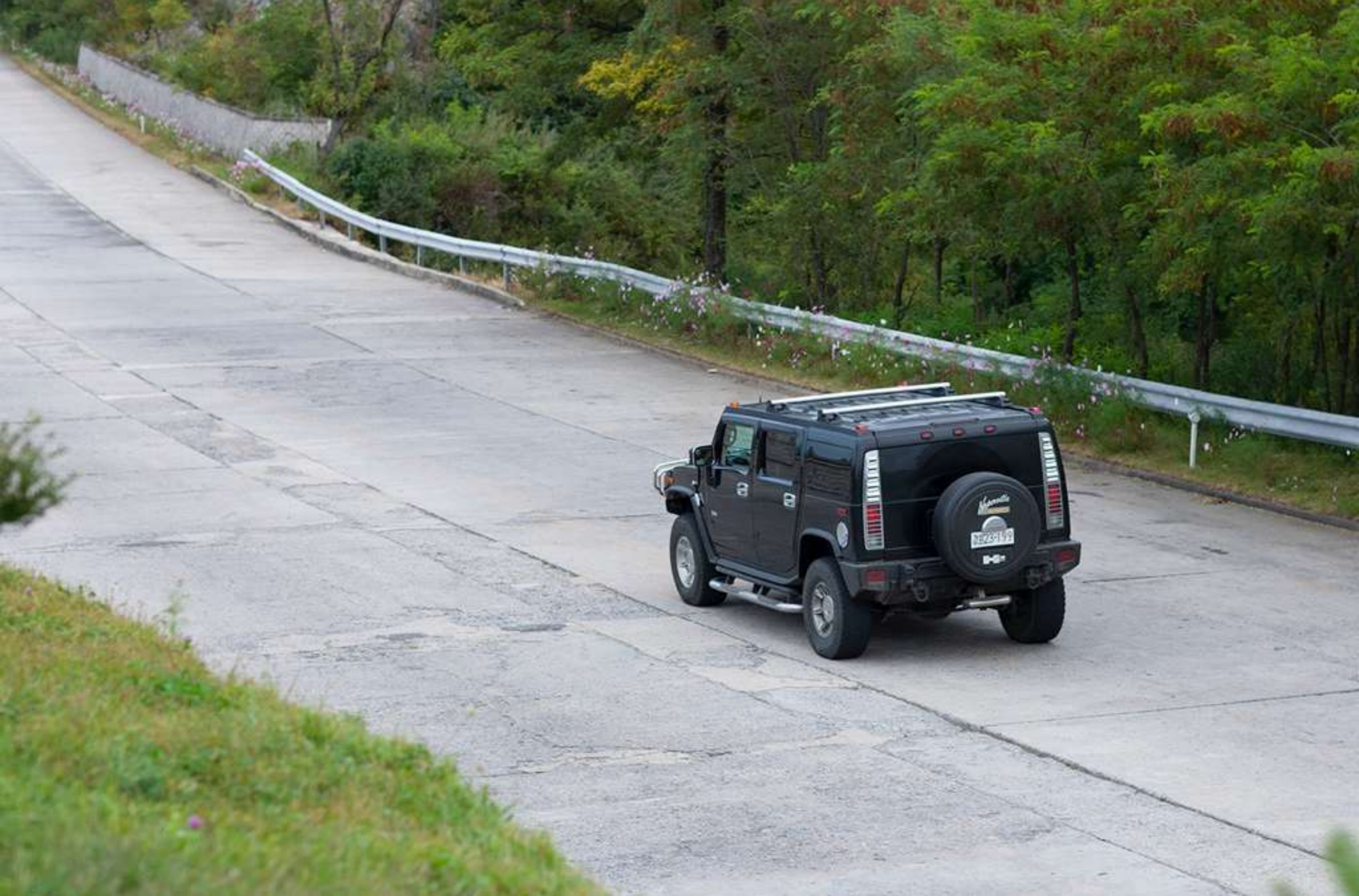
I hardly see cars on the highways of North Korea during all my six trips. Now I am lucky enough to spot an American... Hummer! My guides are rather annoyed as they know how symbolic this car is in their country, where everything is rationed out ... It is the first time that I hear them criticizing something from their system.