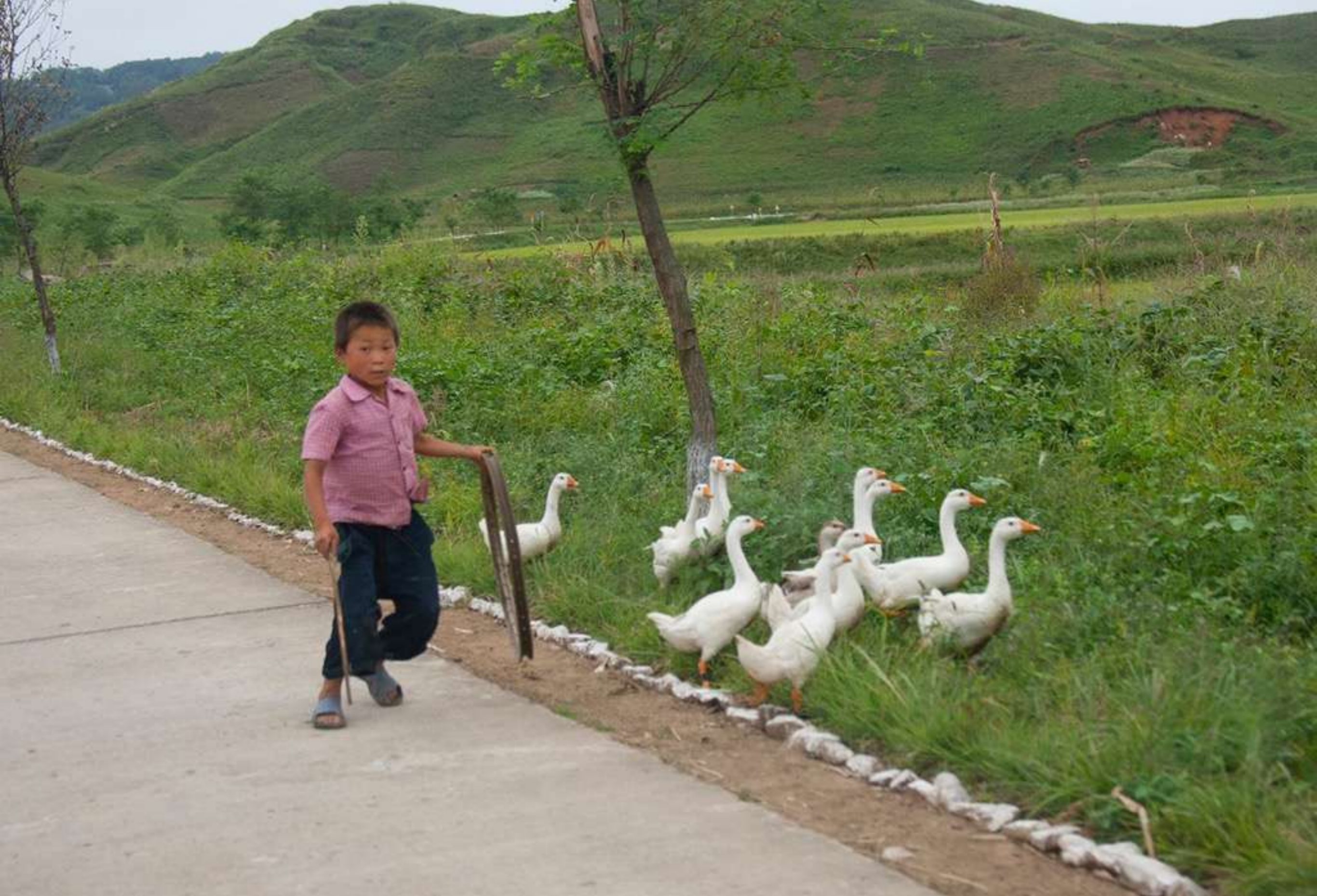
A kid with his geese on the highway side. Most of the time people use the highway for their daily activities. Therefore they got so surprised to see cars or buses on it.