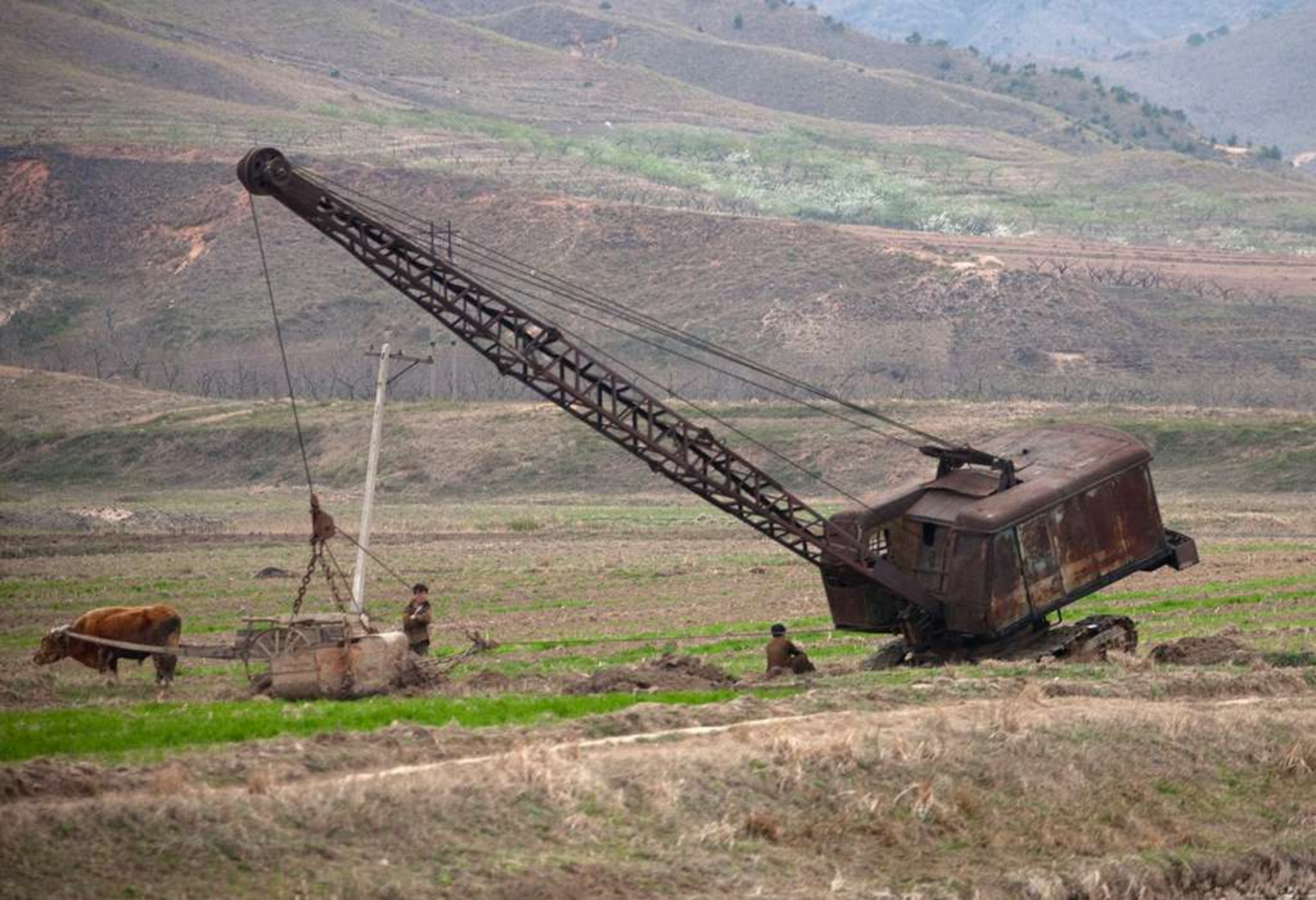
The trips on the highways allow us to see the reality of the countryside, and the lack of development. it seems time has frozen in the 50s..