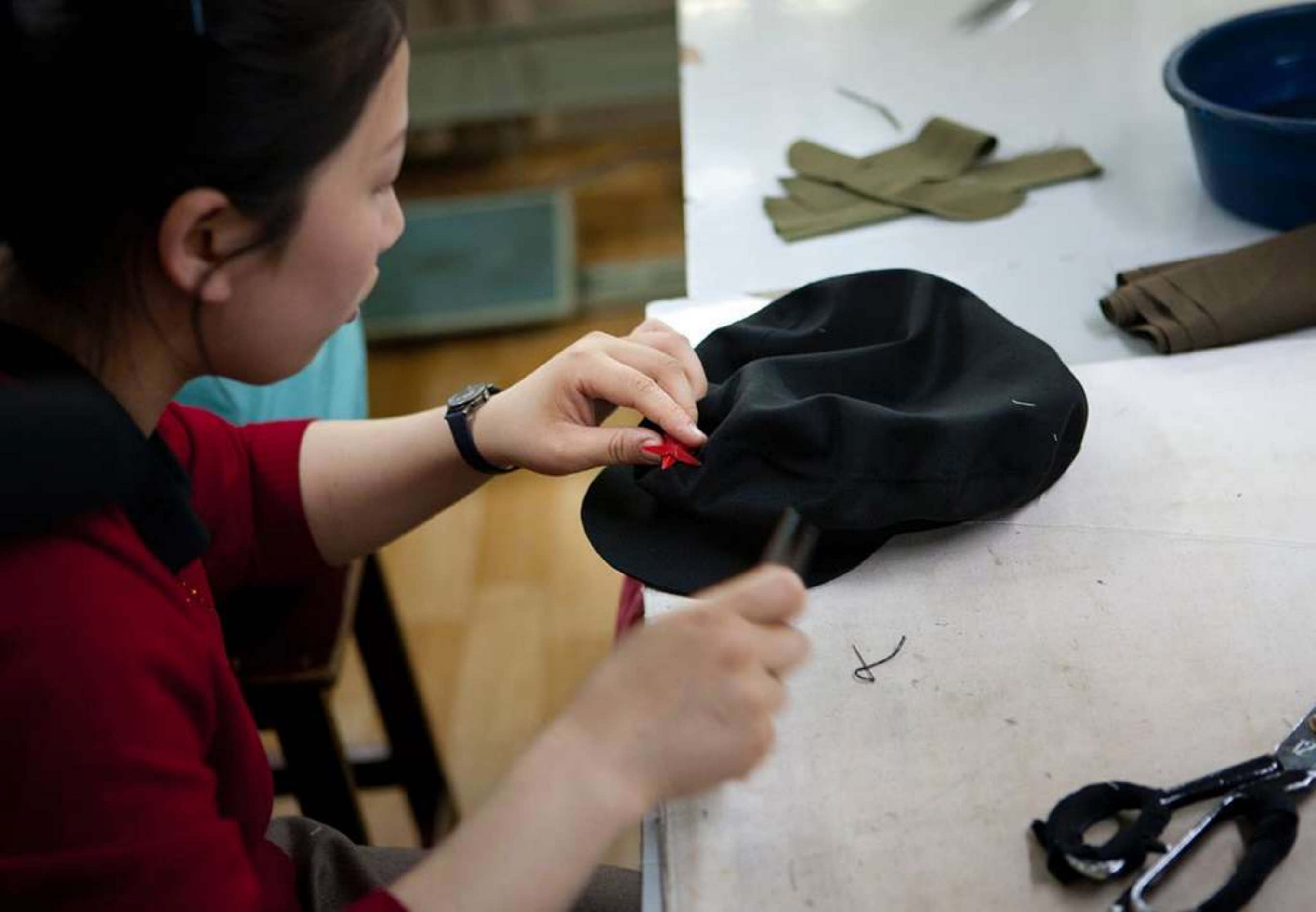
A tailor makes a cap with the iconic communist red star. She told me that sometimes there are not enough red stars, so they cannot produce the foreseen amount each year. This cap is worn by both men and women from the Worker's party.