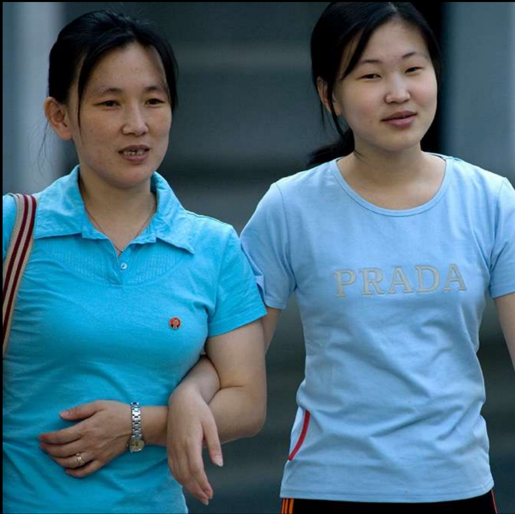
Clash of civilization... Kil Il Sung Vs Prada...