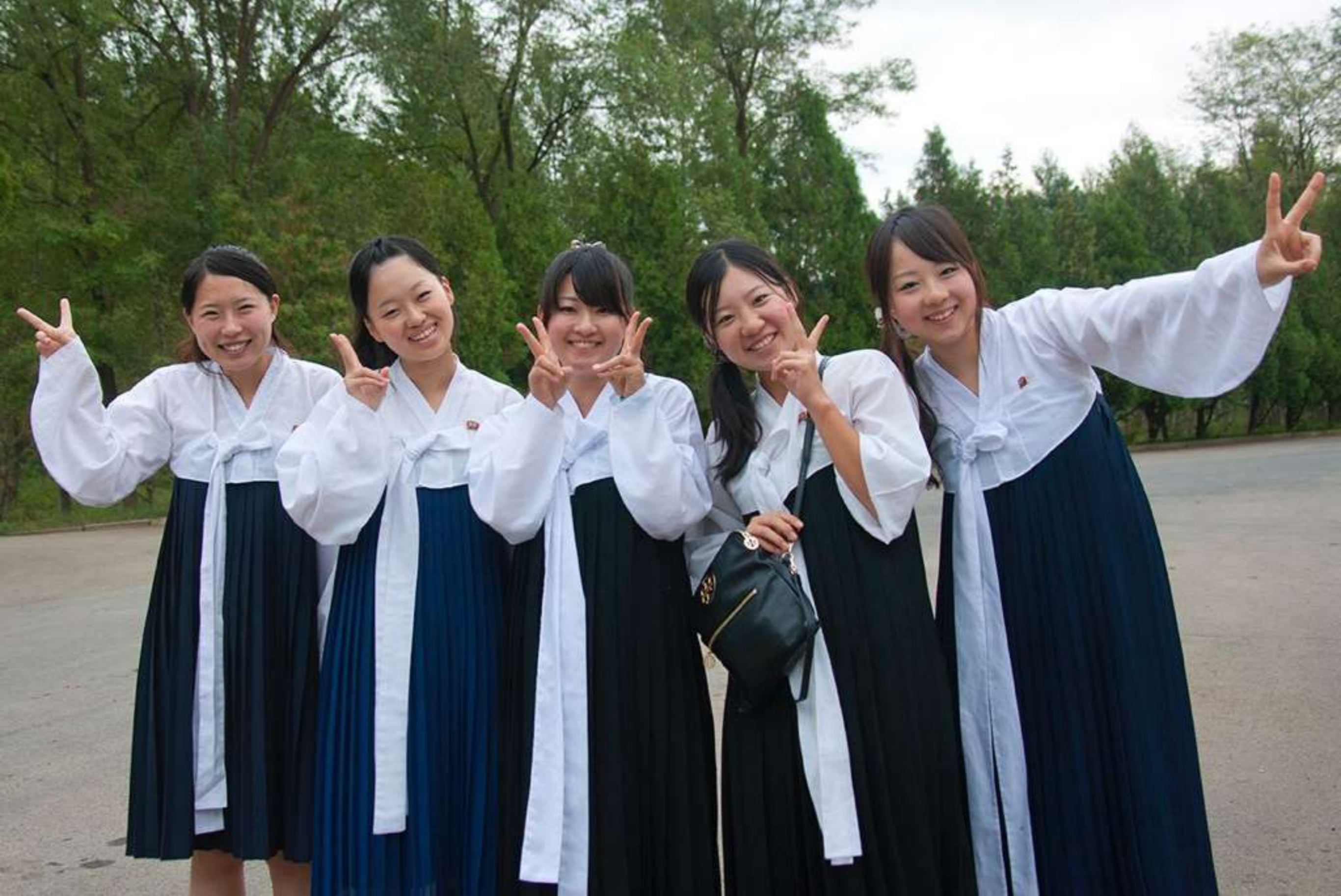
These girls are the daughters of North Koreans who live in Japan. They came back for a visit in Pyongyang but were asked by the officials to have a traditional hairstyle - nothing crazy like the Japanese girls like to have!