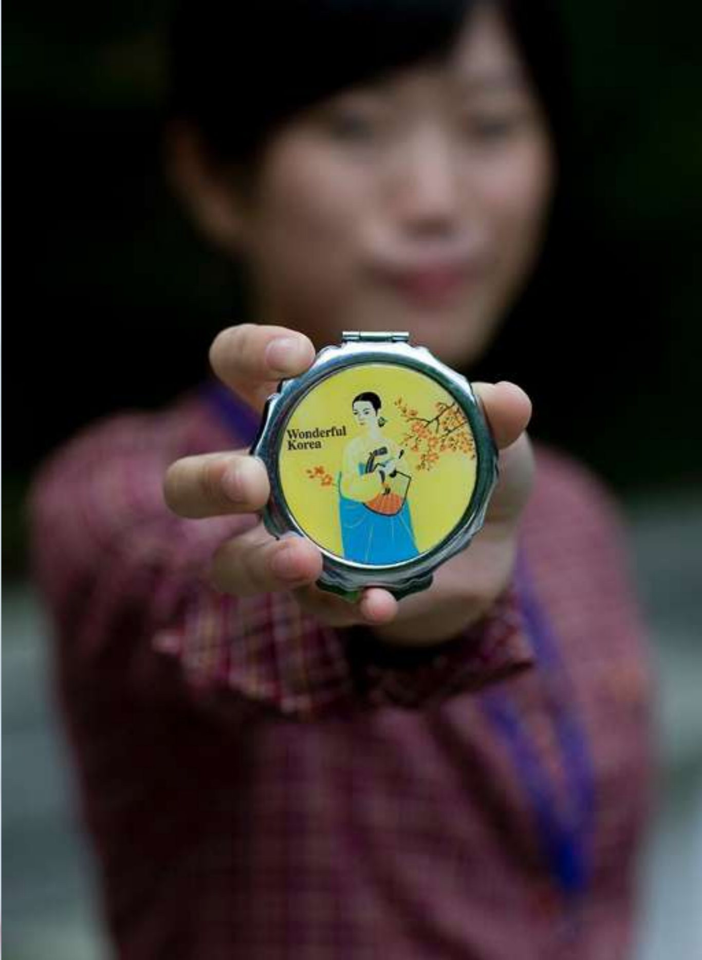
Very white skin is seen as an attractive trait in North Korea. Darker skin signifies that you work in the fields and are part of a lower cast. Girls use rice powder to make themselves more pale.