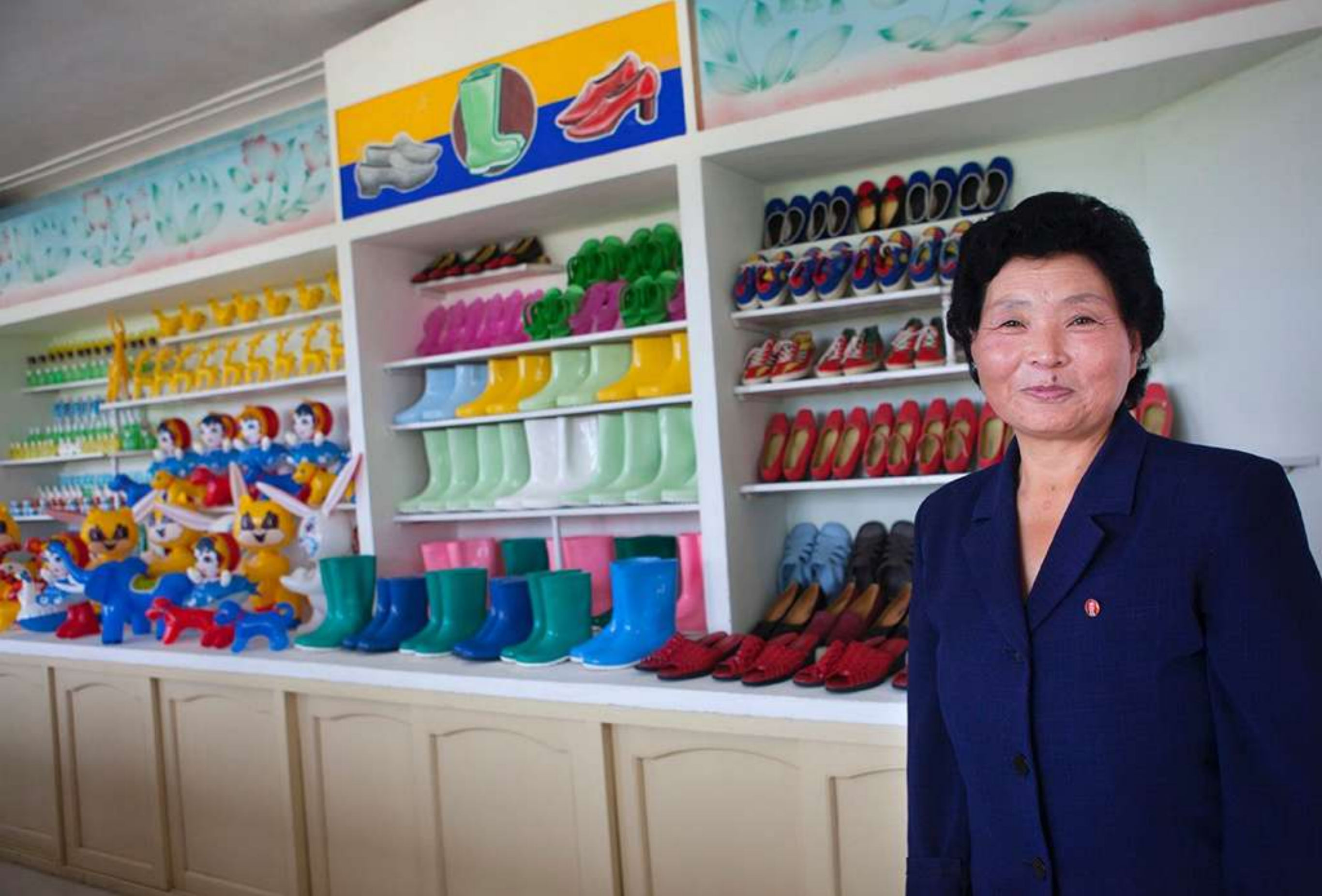
In a village near Hamhung, this shop shows the few clothing options available to the people. Their choice of footwear is limited to boots and simple shoes.