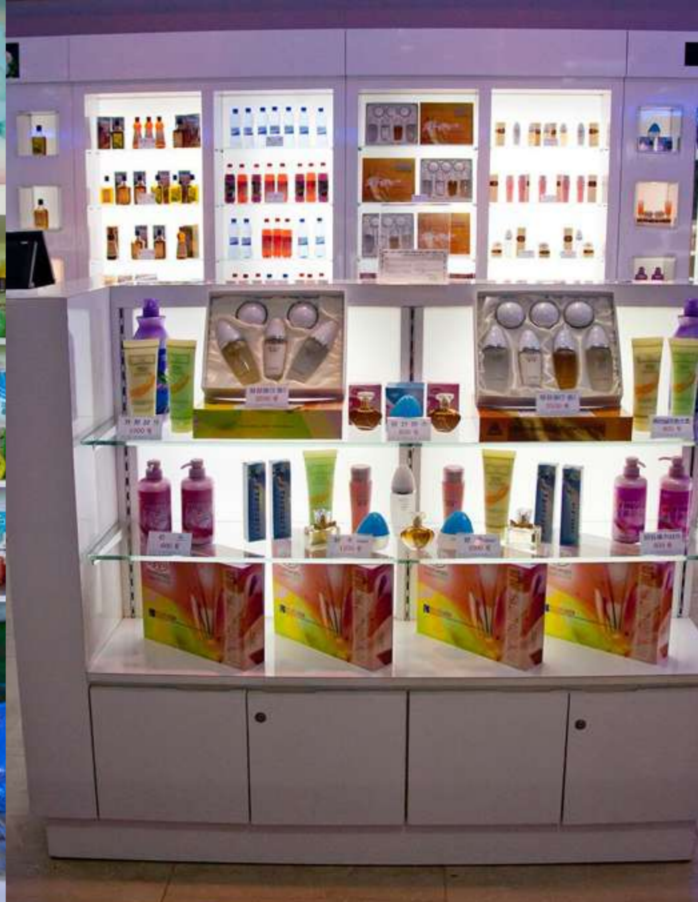
On the left: cosmetics in a village shop. On the right: the cosmetics section in Kungang, the zone created by South and North Koreans where divided families were supposed to meet. Only a few people go as the intermingling has been stopped.