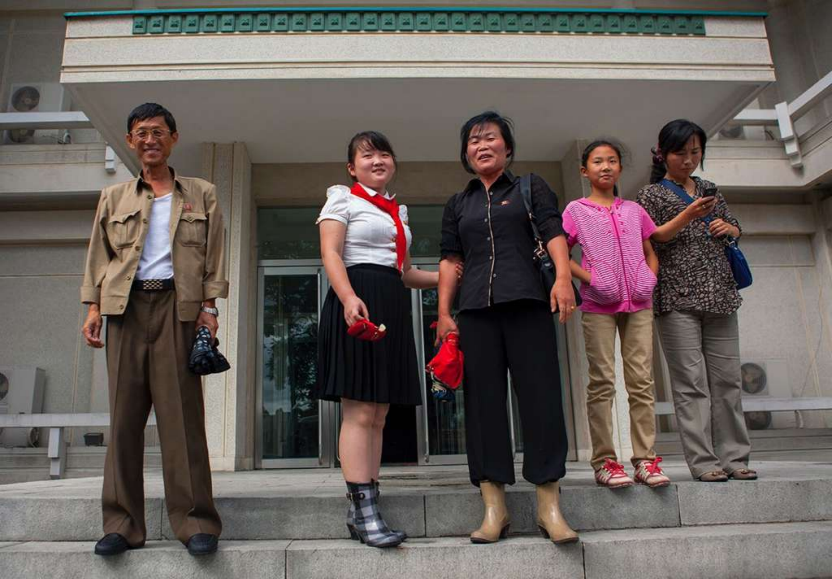
An upper class family leaving an expensive restaurant in Pyongyang. The bright colors from the Chinese clothes are easy to spot on the teenager while her sister proudly wears her Pioneer uniform. The mother has kept her boots.