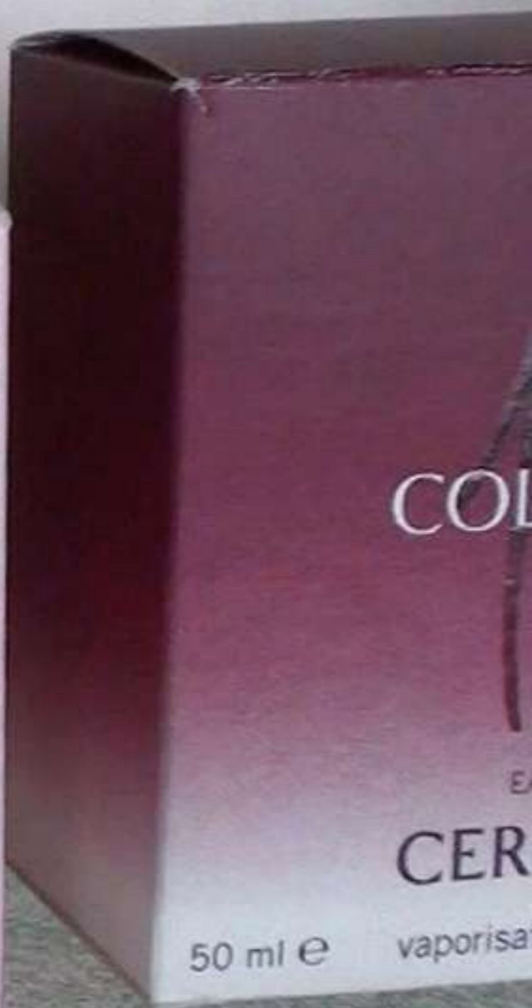
Every north korean woman will tell you she dreams to buy a perfume from Paris... They'll have to wait a little bit...