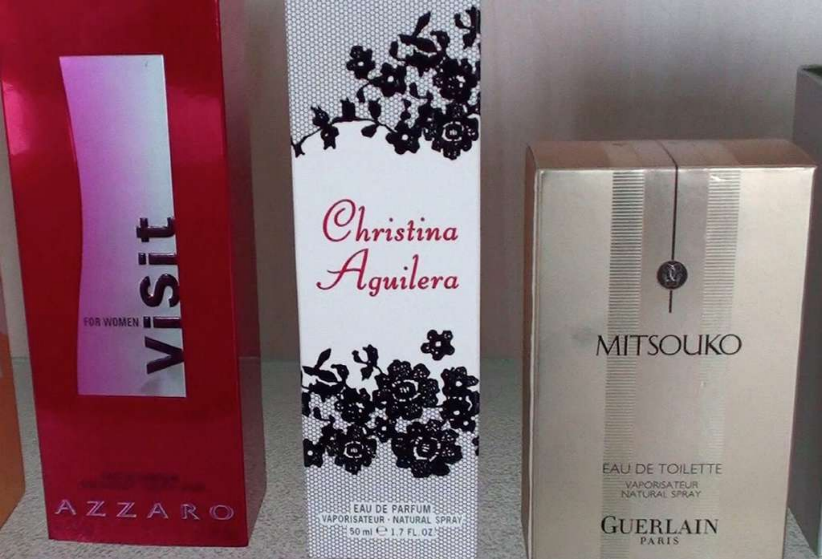
In a shop of a luxury hotel in Pyongyang, high end perfumes can be bought with euros. Most of these products however are made in China.