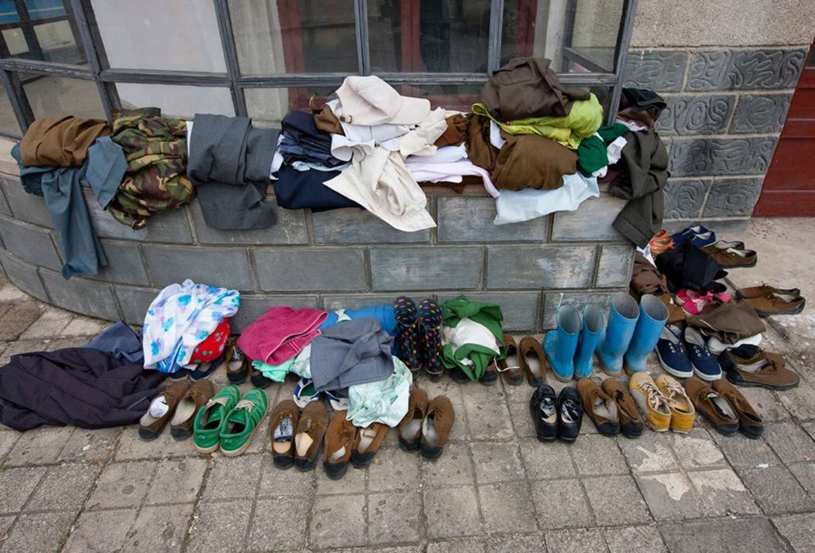
These shoes belong to the extras on a movie set. Since there is no changing room, I could see what they wear.