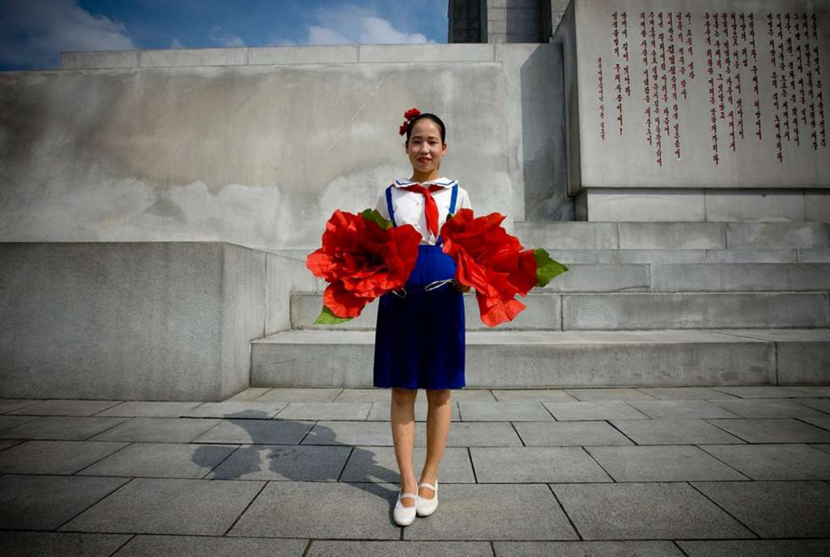
A pioneer girl wears this uniform from the ages of nine to fifteen. Proud of this outfit, many children wear it outside of the school hours. They love to customize their look with unique hairstyles and jewelry. Students who refuse to wear the school uniform will be subject to punishment.