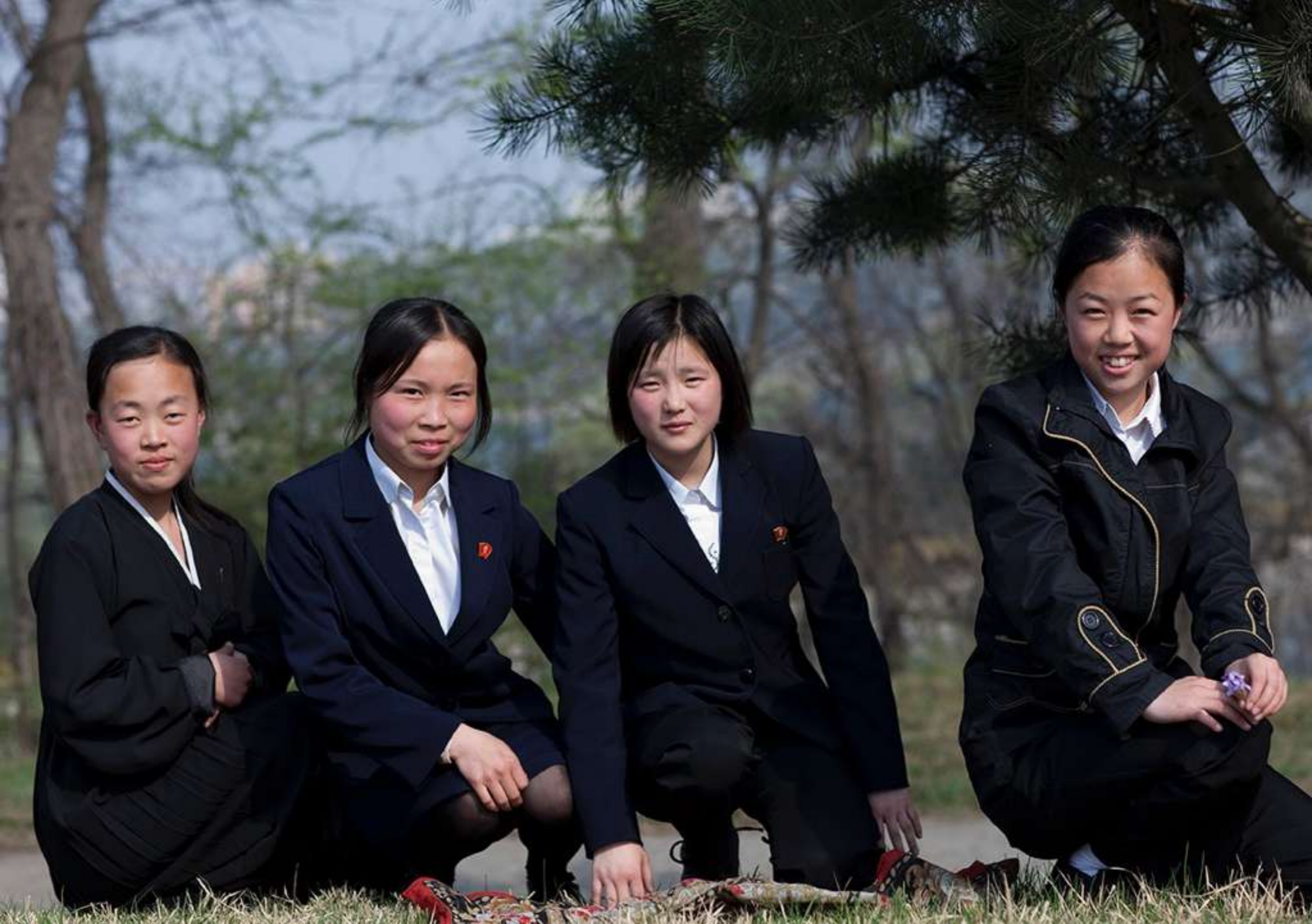
After graduating from the pioneers, the girls will become students and will have to wear these black suits.