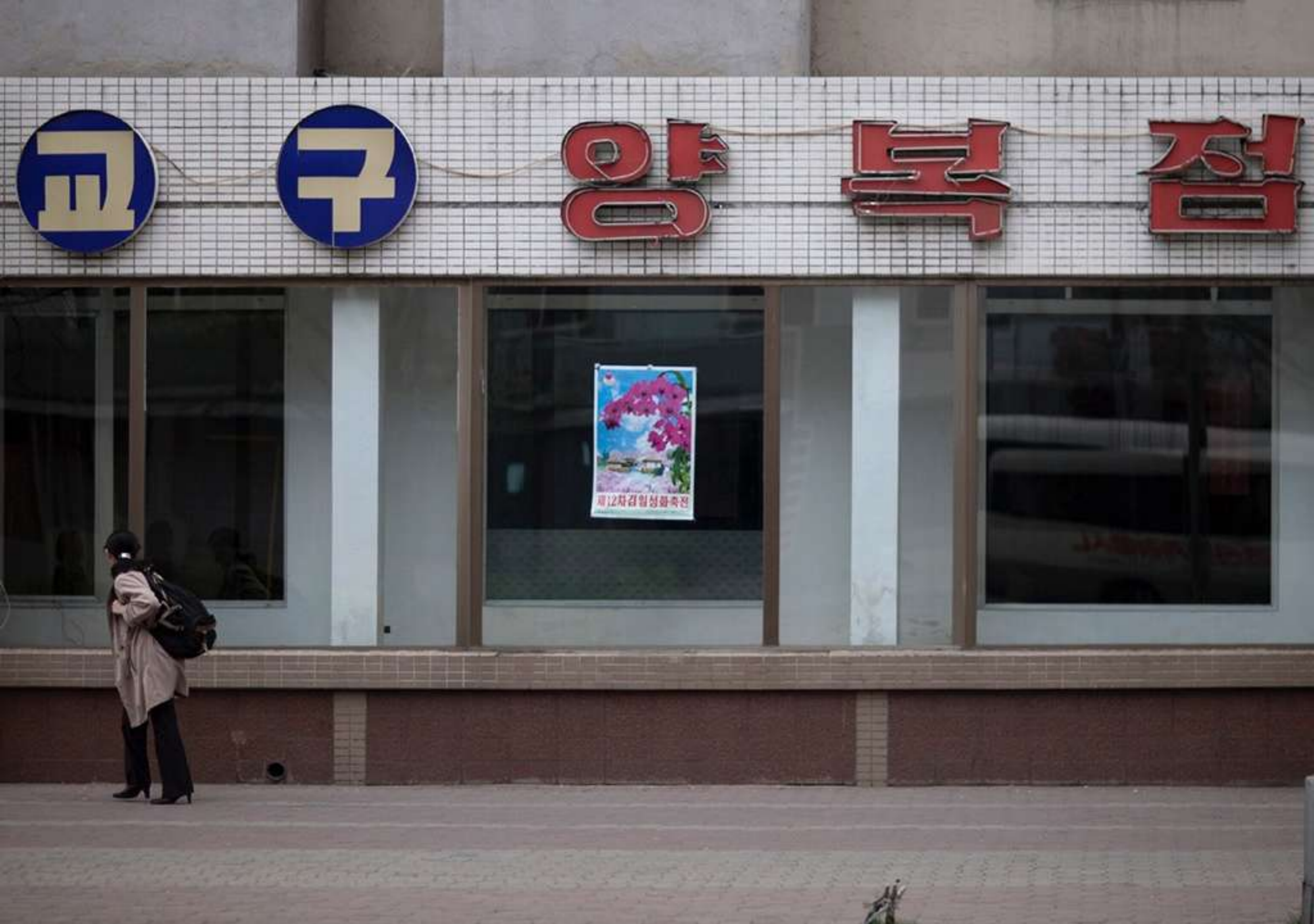
North Koreans do not decorate their businesses. This sign only indicates that it is a tailor.