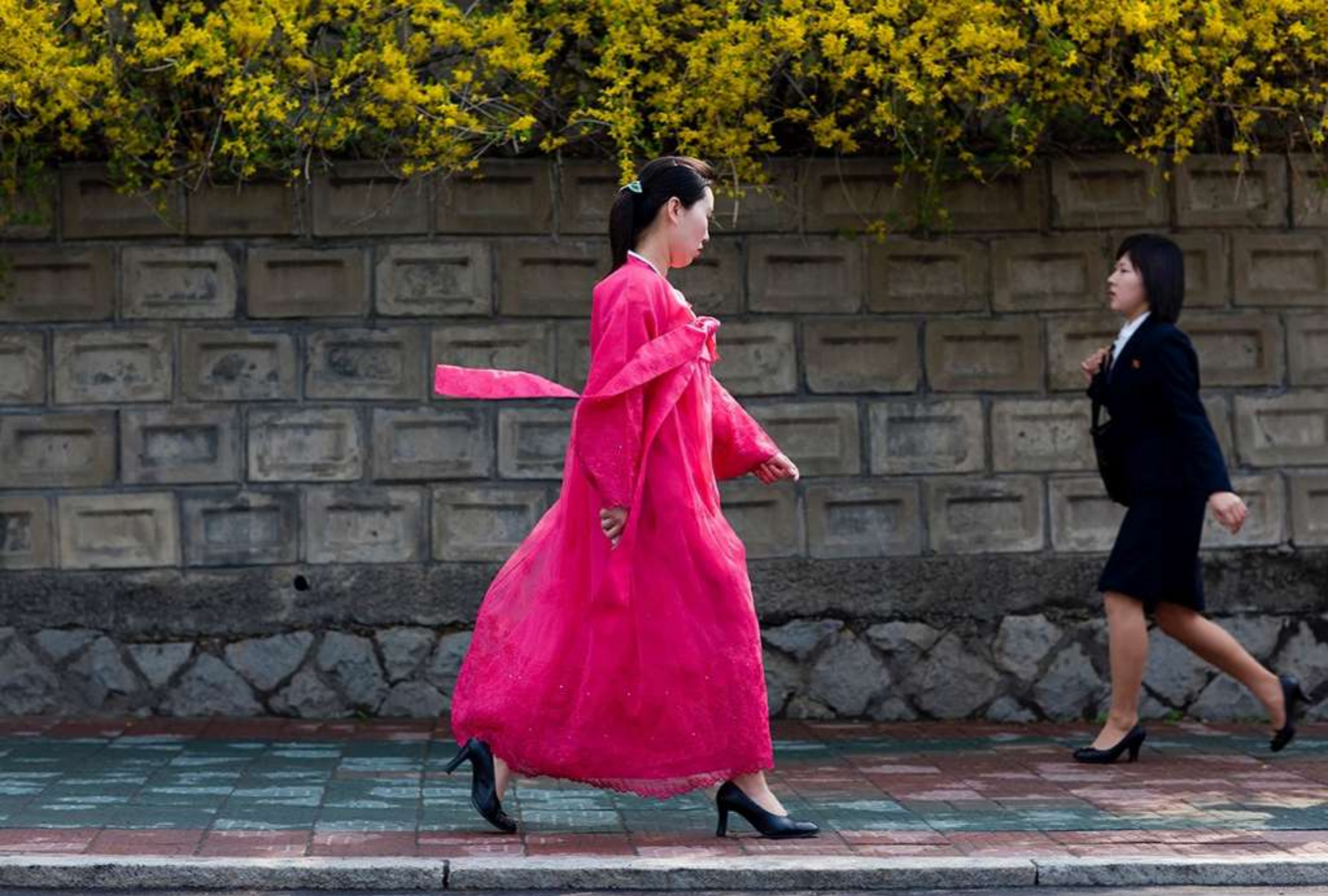
Many women still wear this colorful, traditional kimono-like dress known as the “choson-ot” on a daily basis. It is called “hanbok” in South Korea.