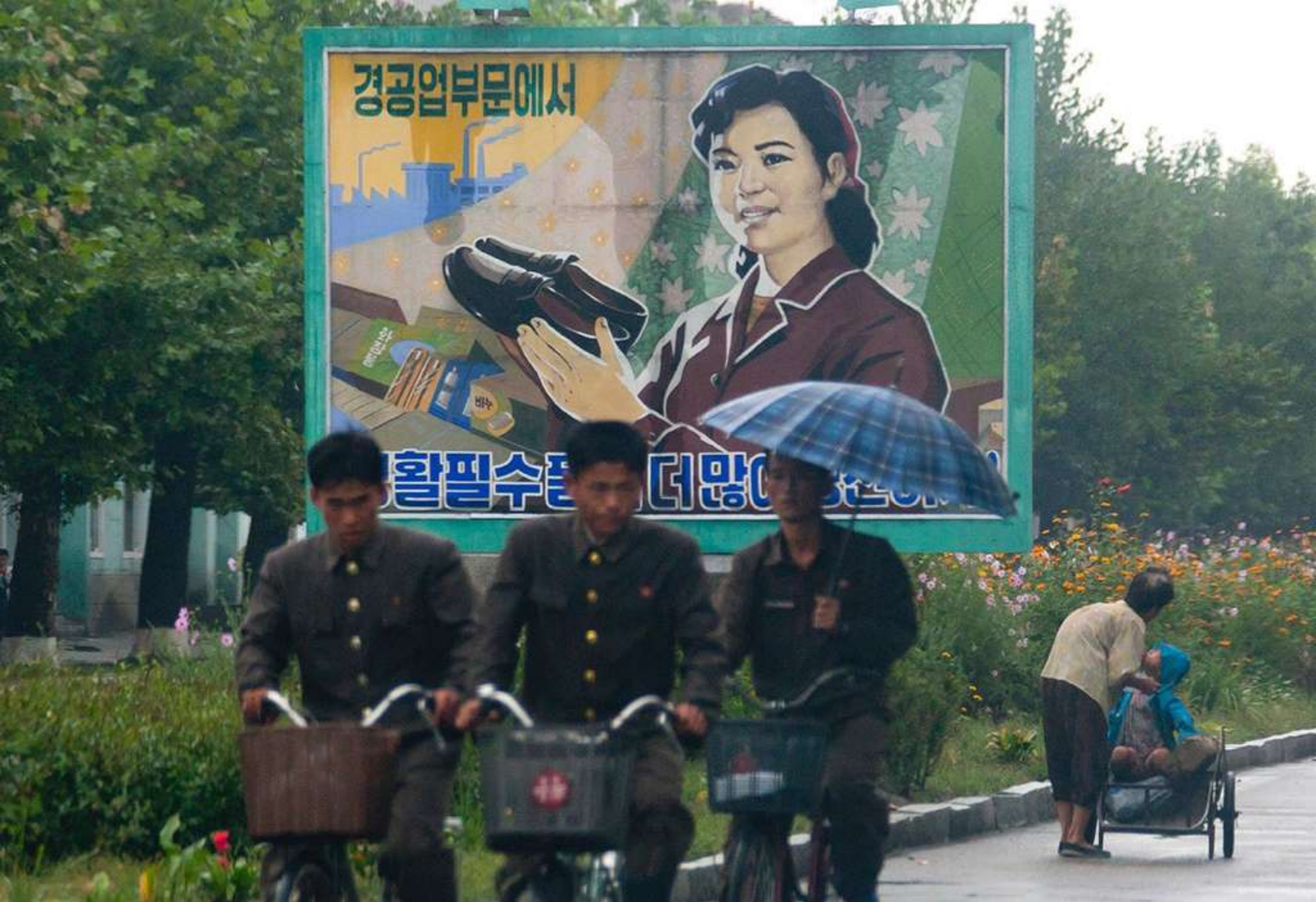
Advertising does not exist in North Korea, but the propaganda billboards sometimes promote fashion by depicting the latest shoes produced in a government factory.