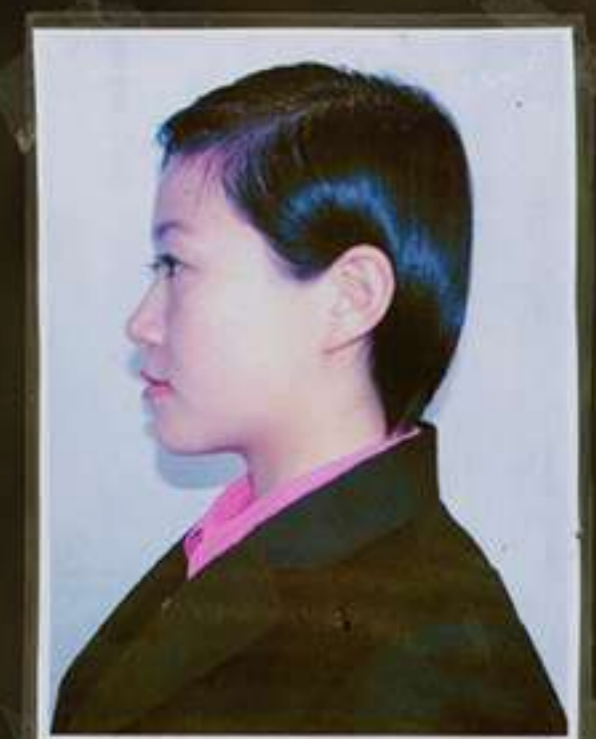
Even the haircuts are regulated in North Korea. This started with Kim Jong Il's utterances: 'Let us trim our hair in accordance with Socialist lifestyle'. Female students must keep their hair short or plaited.