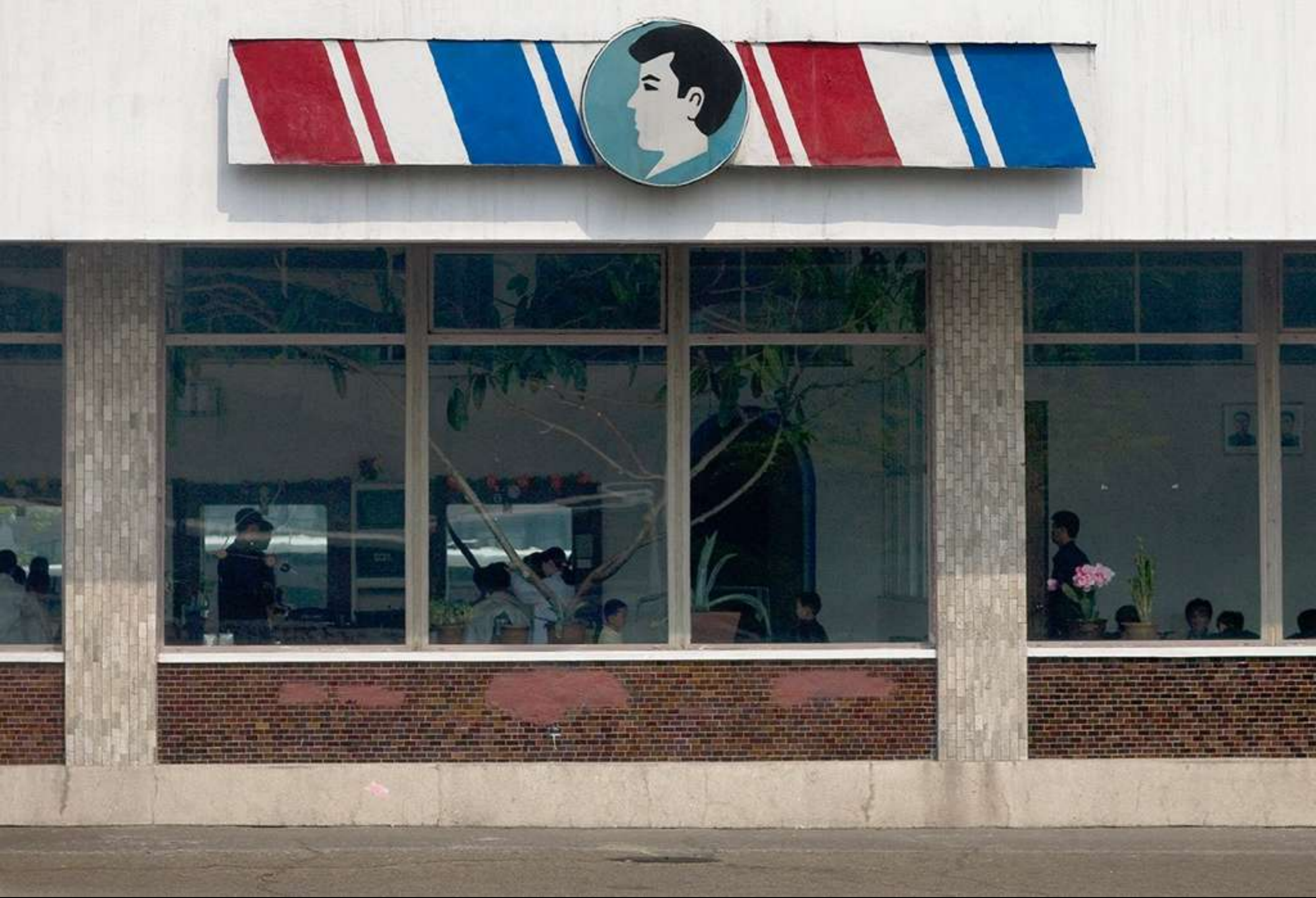
A hair salon in Pyongyang. Kim Jong Un launched a new style: slicked-back hair with the sides cut high at around an inch above the ears. Some say his grandfather had the same haircut in his younger years.