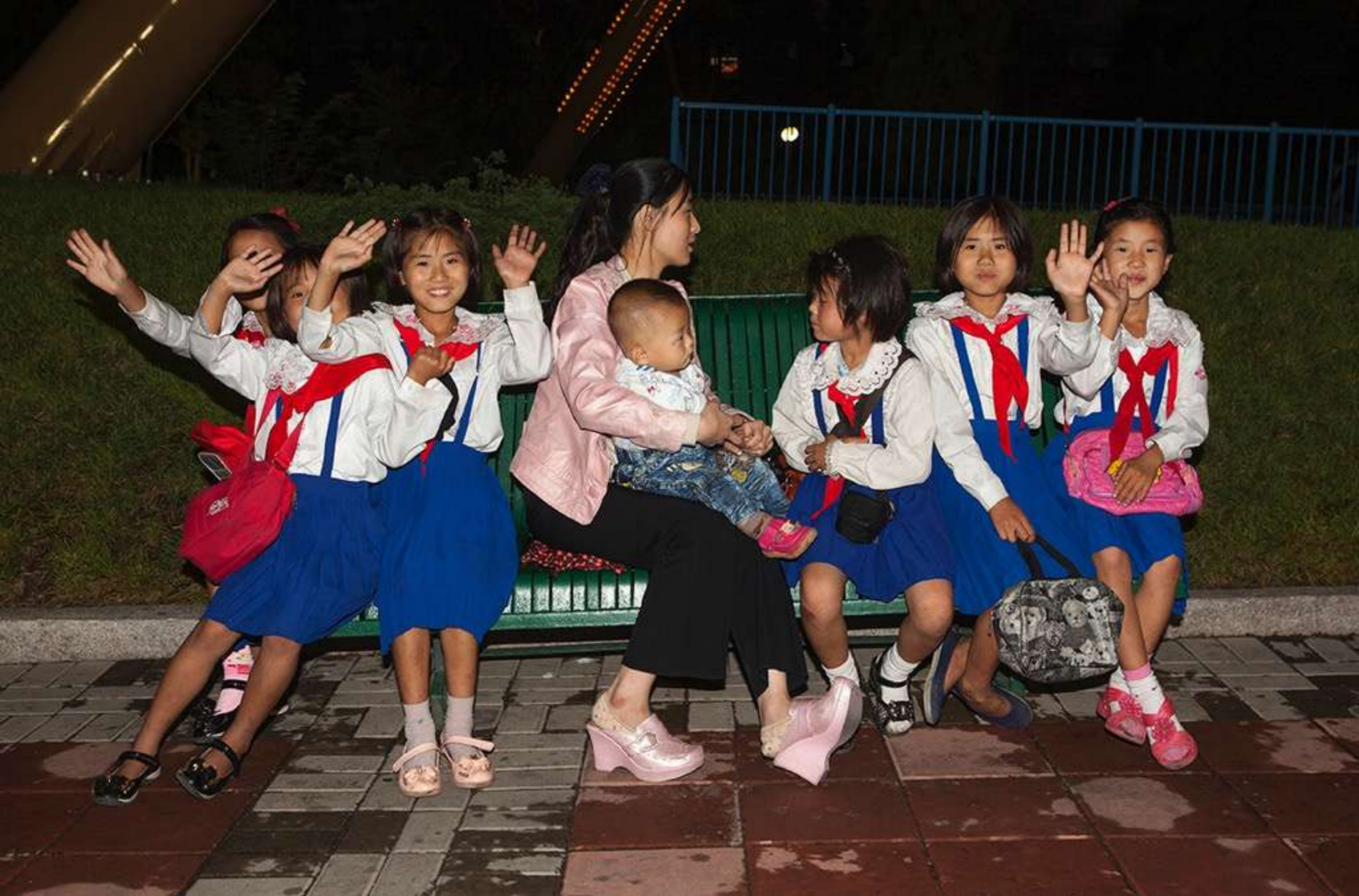
The mother here can be seen wearing some brand new shoes that could not be found just a few years ago in North Korea. These platform boots are Chinese and have started to change the way North Korean women look. They love to dress like this when they are on vacation or at amusement parks.