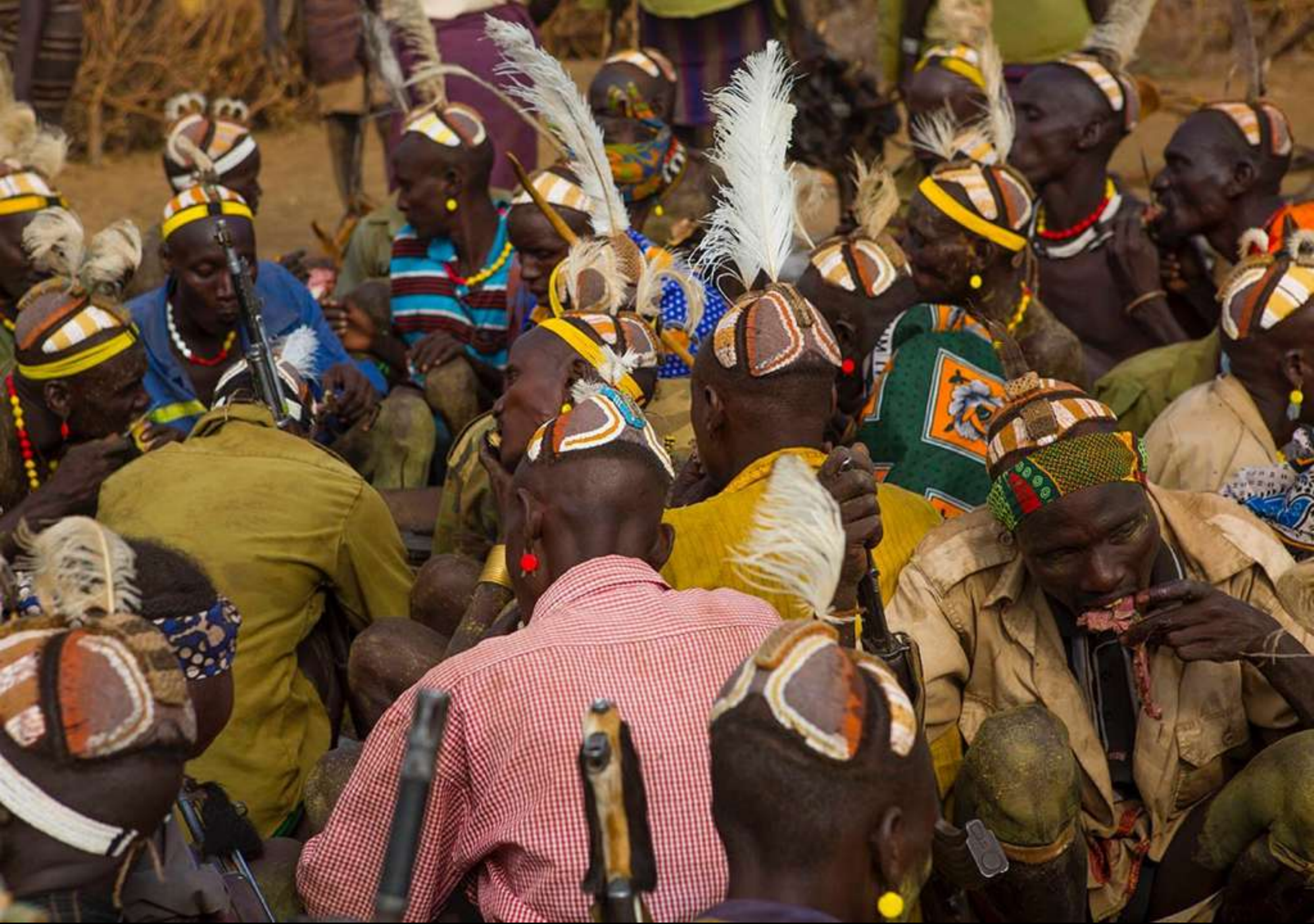
The best BBQ meat is offered to the chiefs and the warriors. Without setting down their Kalashnikovs, everybody eats.