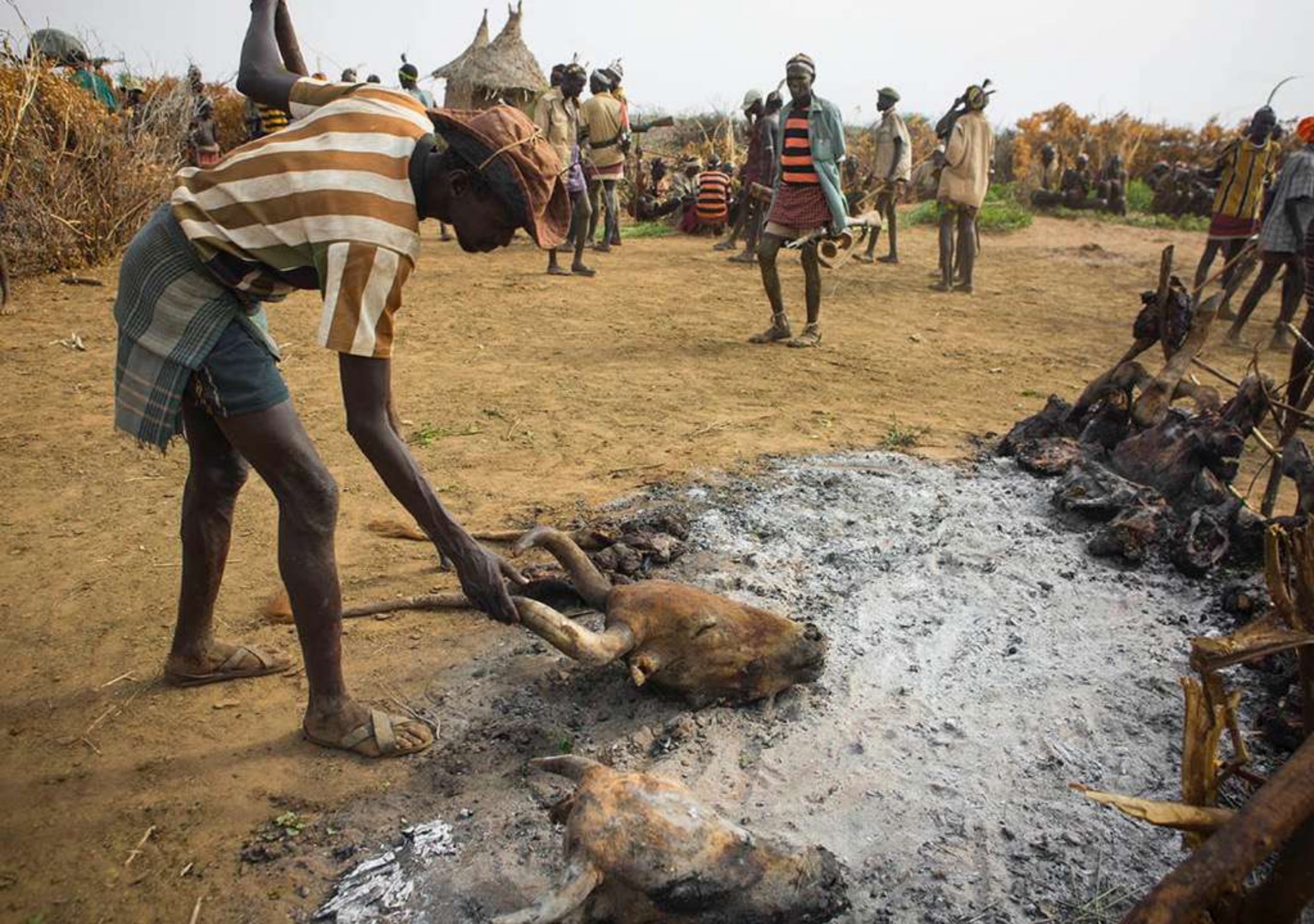
They start to kill some cows for a giant BBQ, complete with dances and chanting.