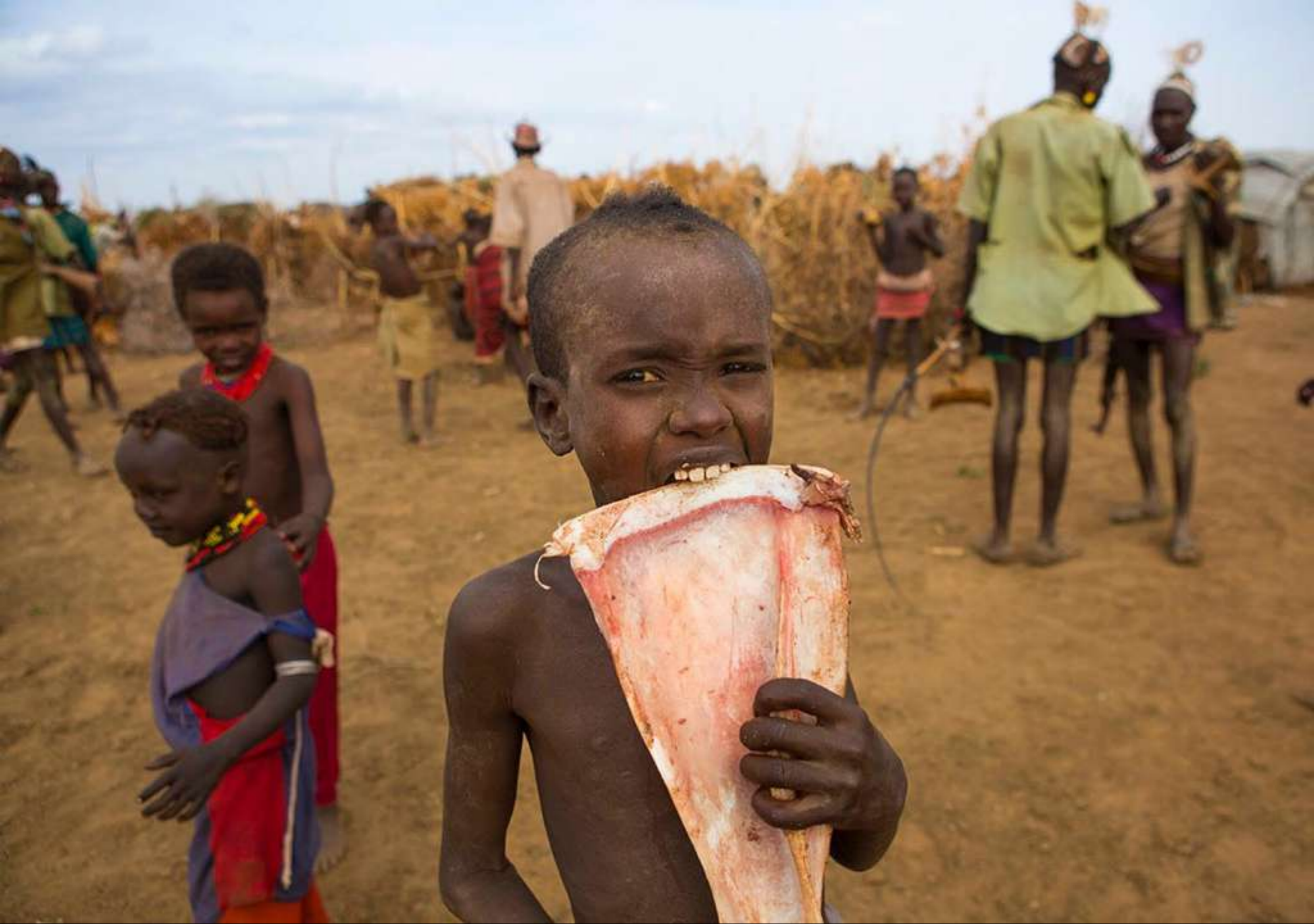
The kids fight to find a good piece of meat, but most of them are just left with the bones.