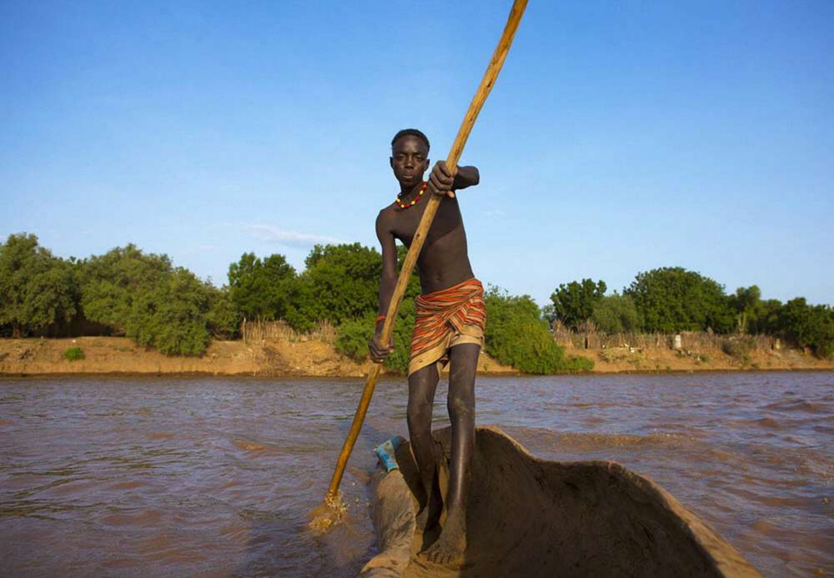
Around the Omo River in the south of Ethiopia, and its fertile lands, now cut off by the Gibbée 3 dam, and siphoned off to irrigate the new giant farms owned by foreign companies, lives the Dassanech tribe.