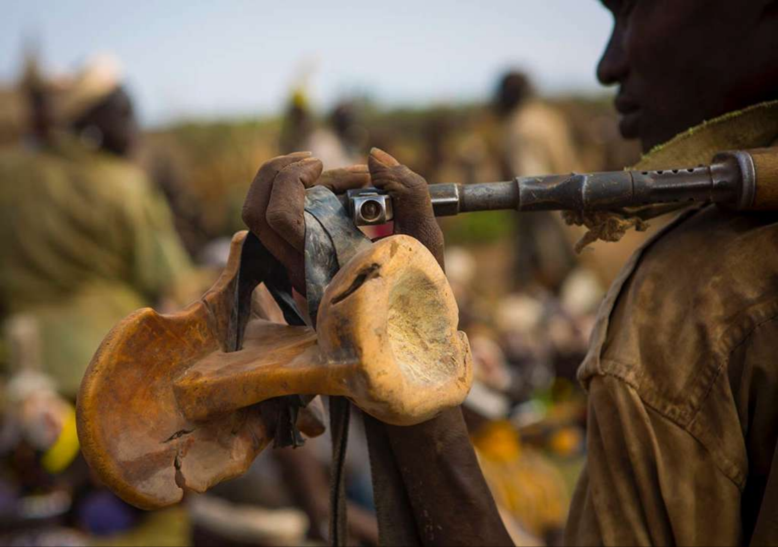
Every man has a gun and a wooden pillow, the two things they never leave home without!