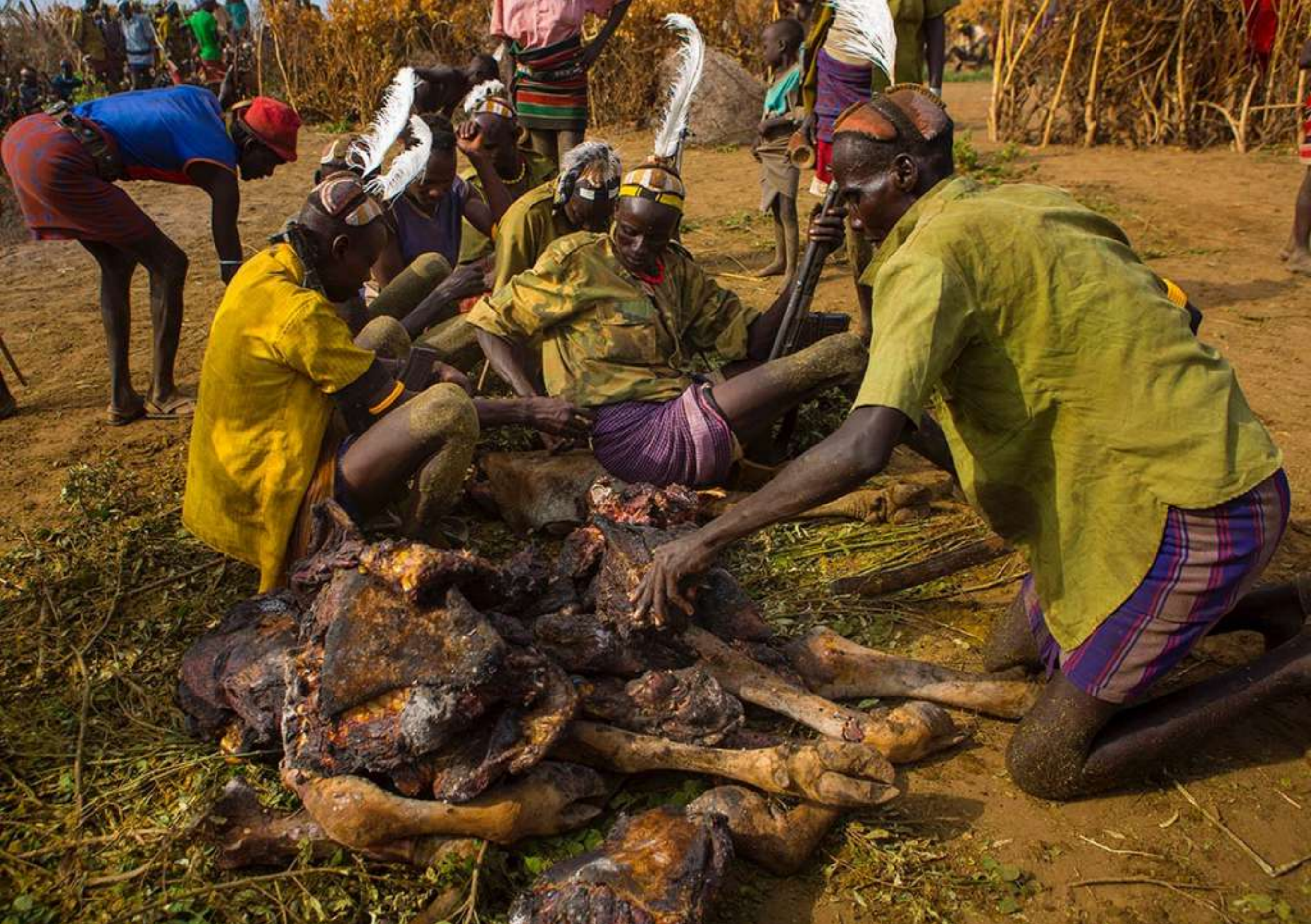
The best parts of the cows are kept in the middle of the camp and carefully monitored. Eating meat is a rare treat, since cows, being very expensive, are hardly ever slaughtered.