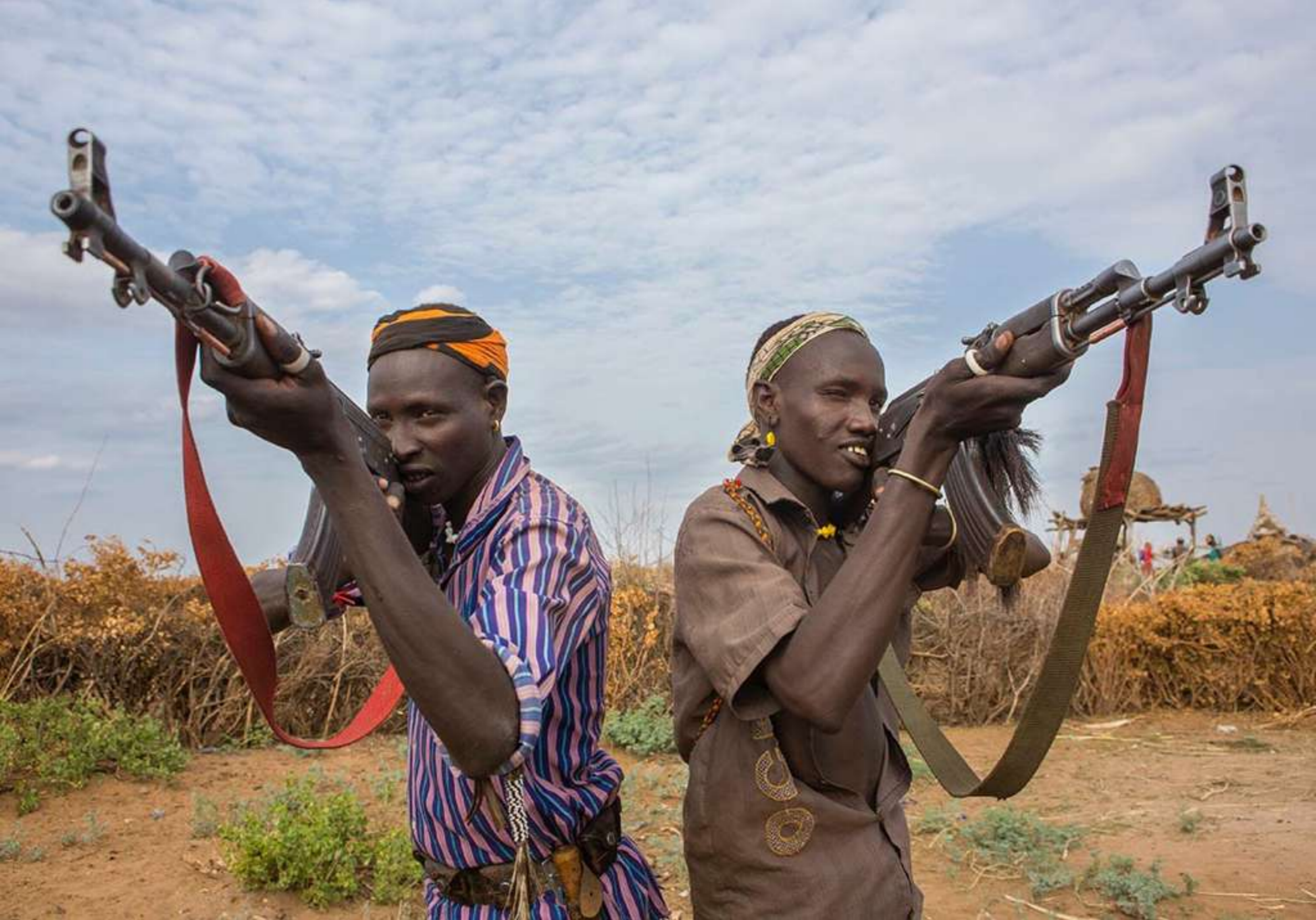
The ceremony starts with dances and gun shots... Real ones!