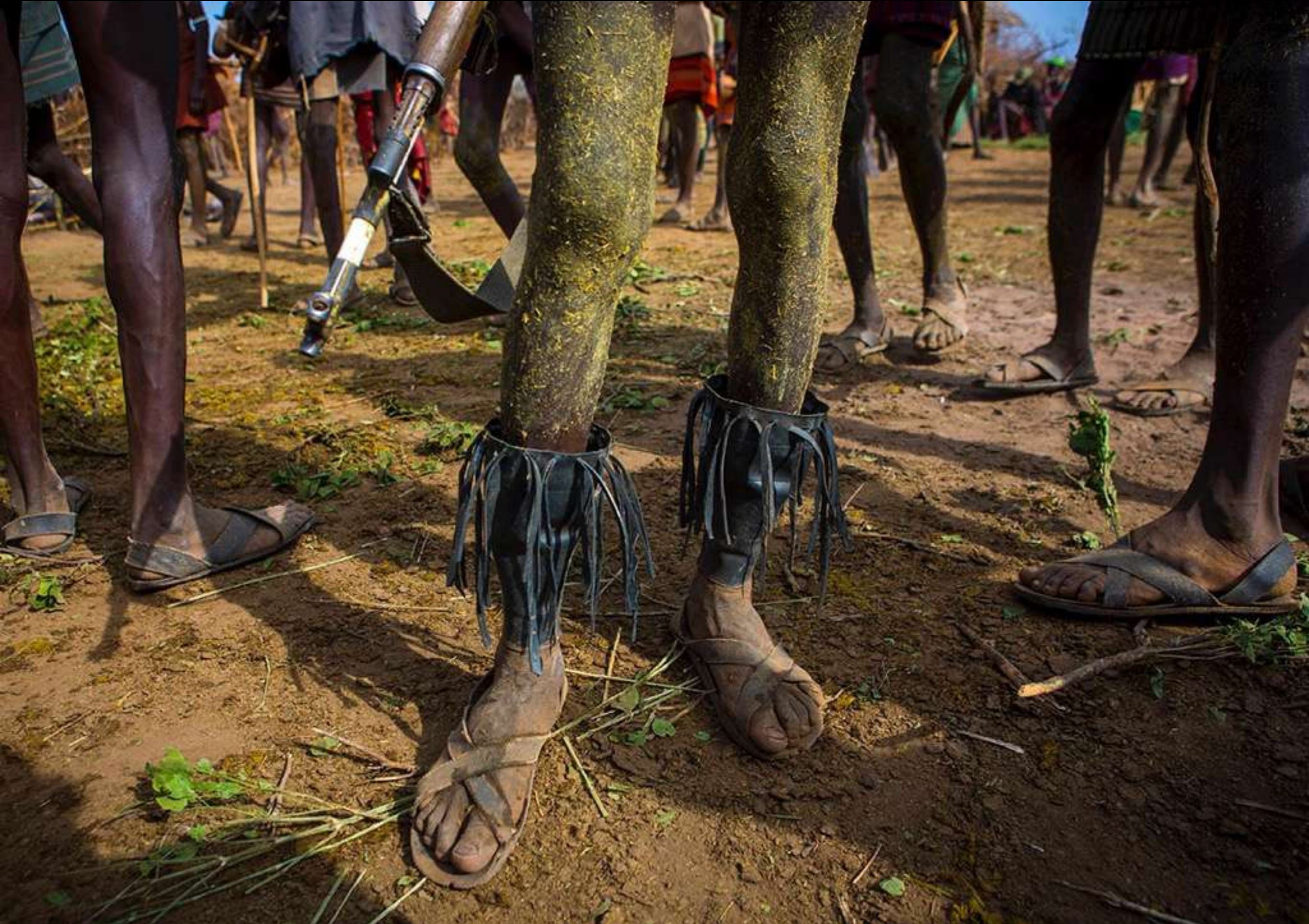
For the ceremony, the men use to wear the nicest clothes. They love to recycle everything they find. The latest fashion is to use half plastic shoes to make this decoration.