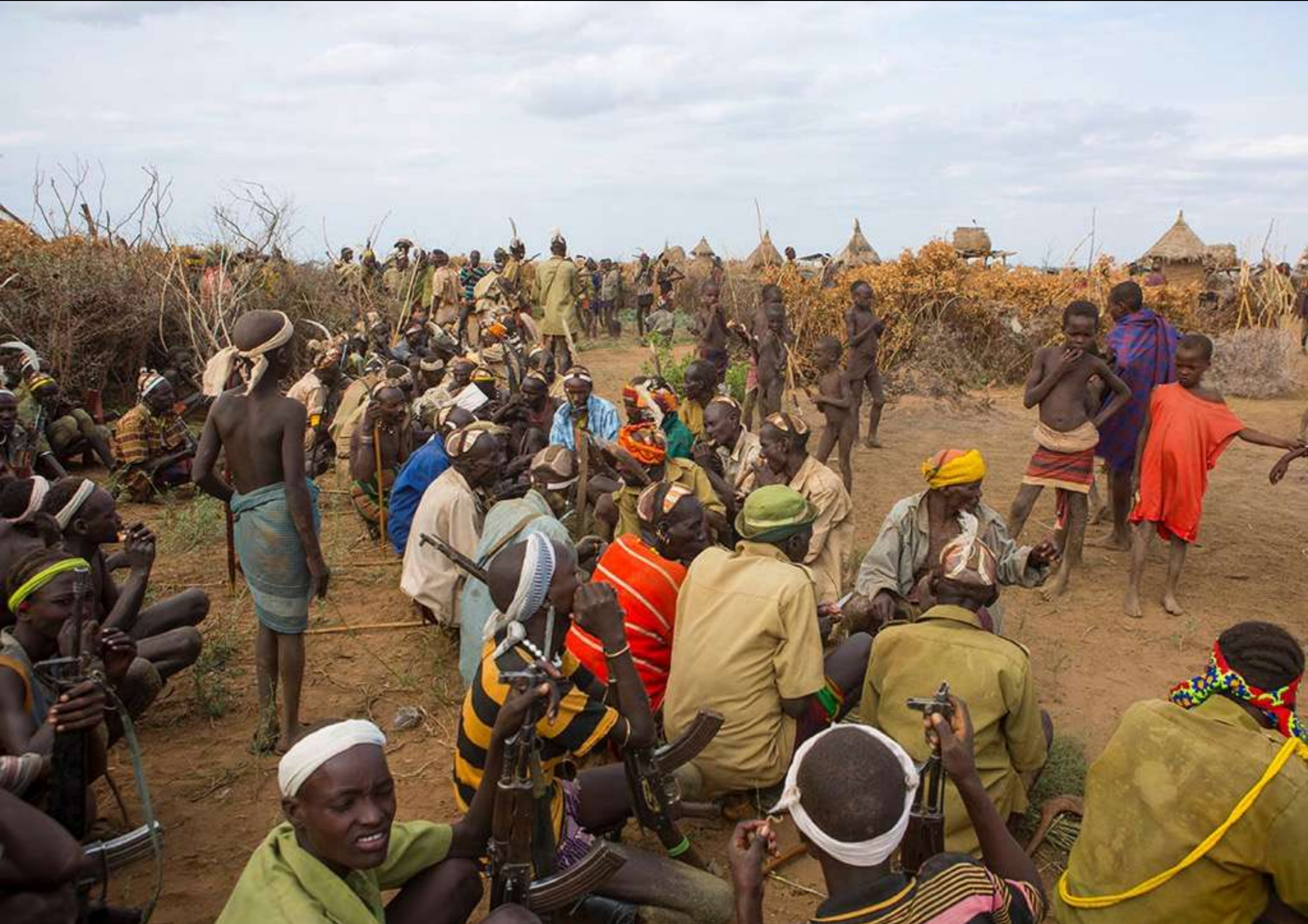
Once everybody has the new "all natural" make up on, the men sit in concentric circles. The center circle is comprised of the chiefs and the elders. The second, the young warriors, and around the periphery, wander the hungry children.