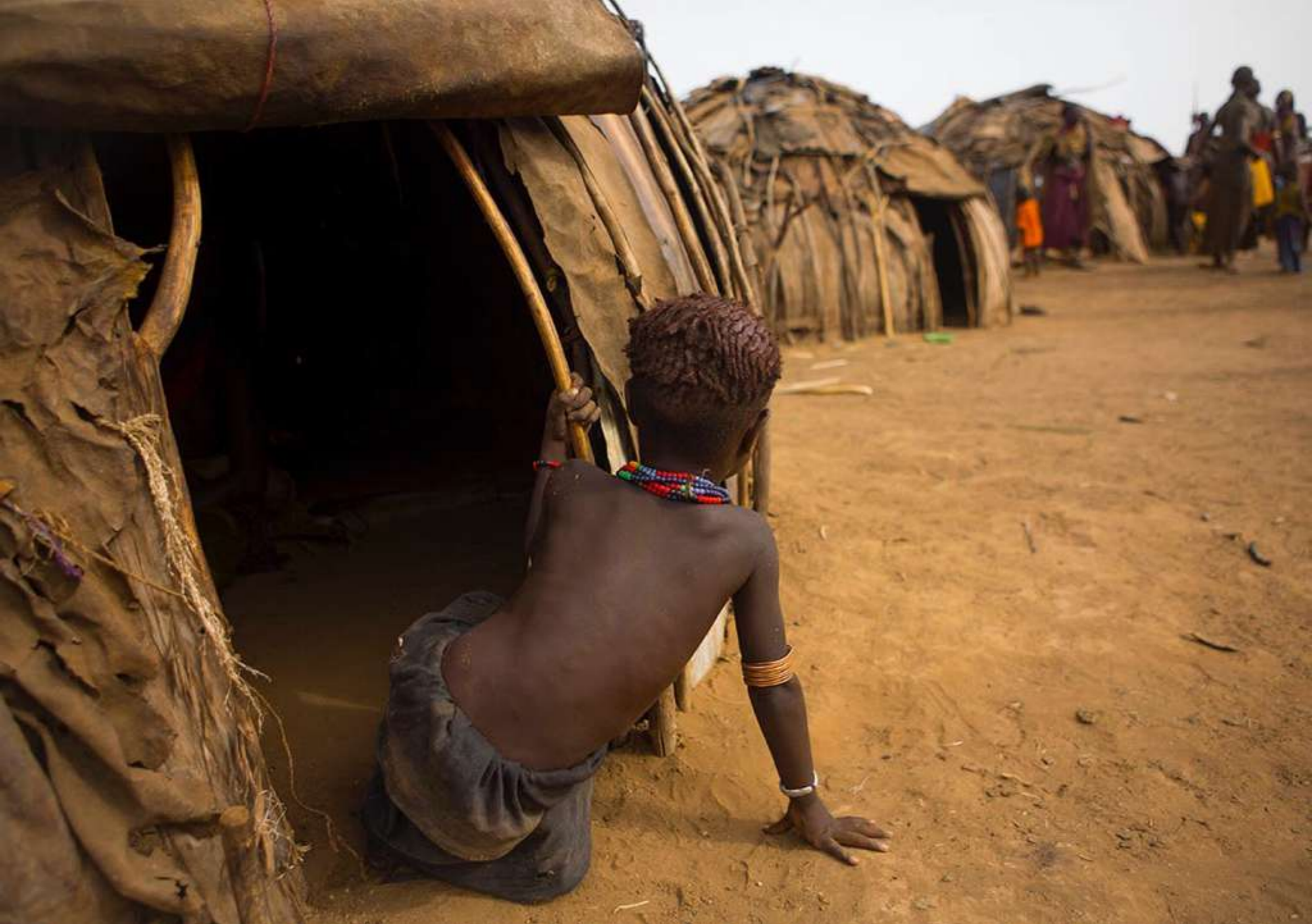
Some kids try to hide in the huts to avoid the ritual!