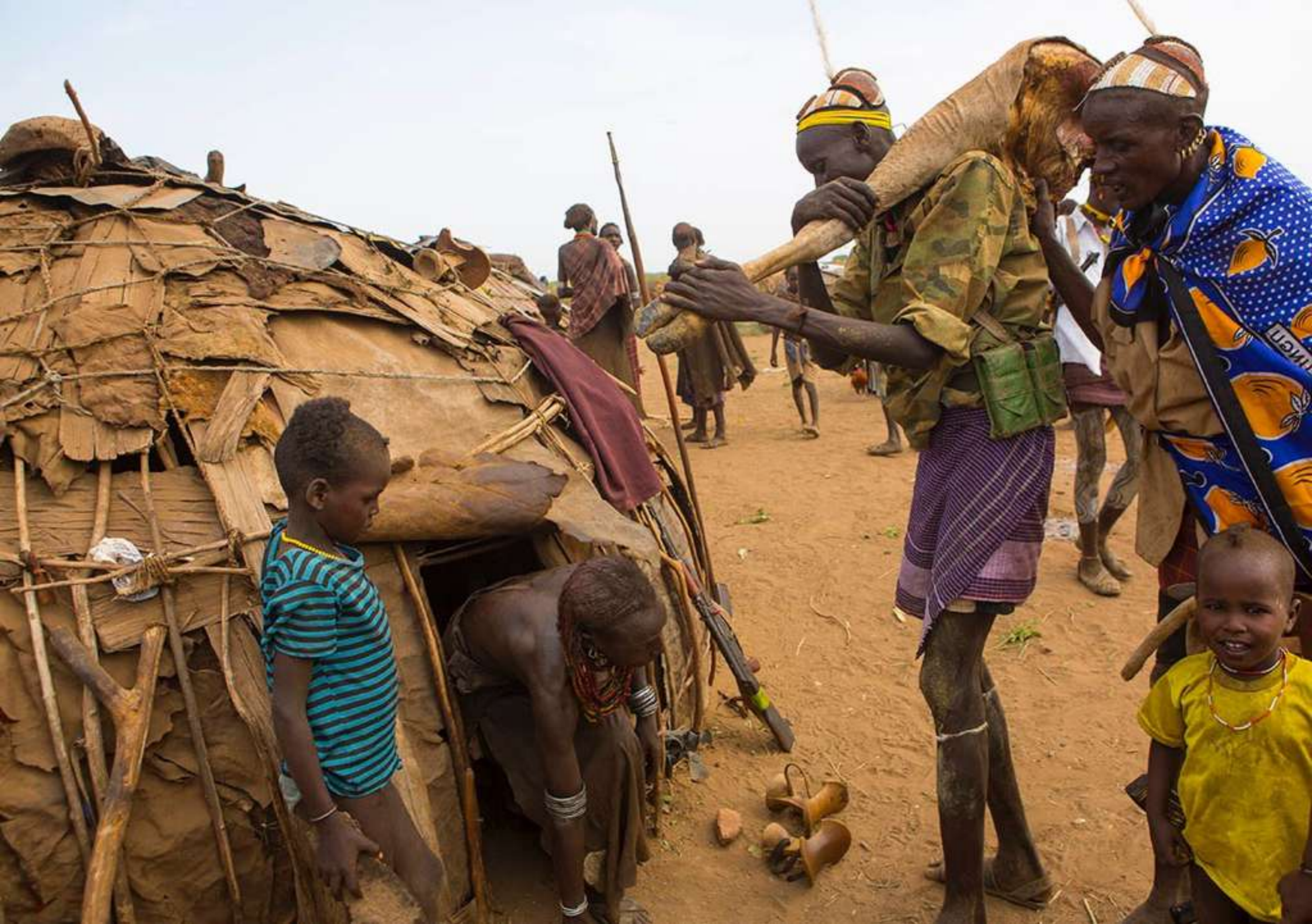
Everybody returns home, the chief of the village goes back in his hut with a cow leg he'll keep inside!