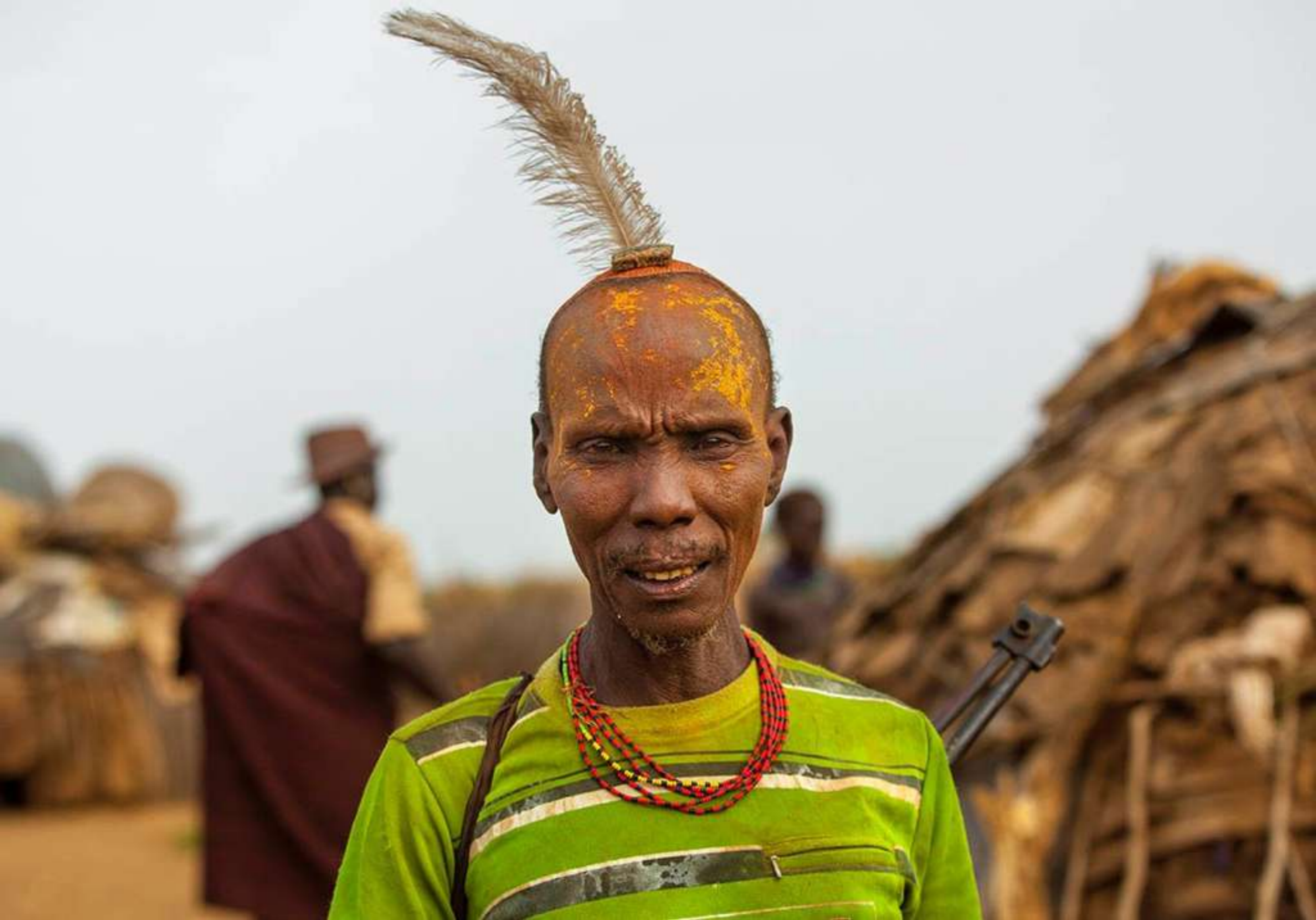
The warriors are proud to be covered by the stomach content. Some wear an ostrich feather in a bun they make on their head. It has a special meaning: they have killed a wild animal or a man. There are few animals left in the area...