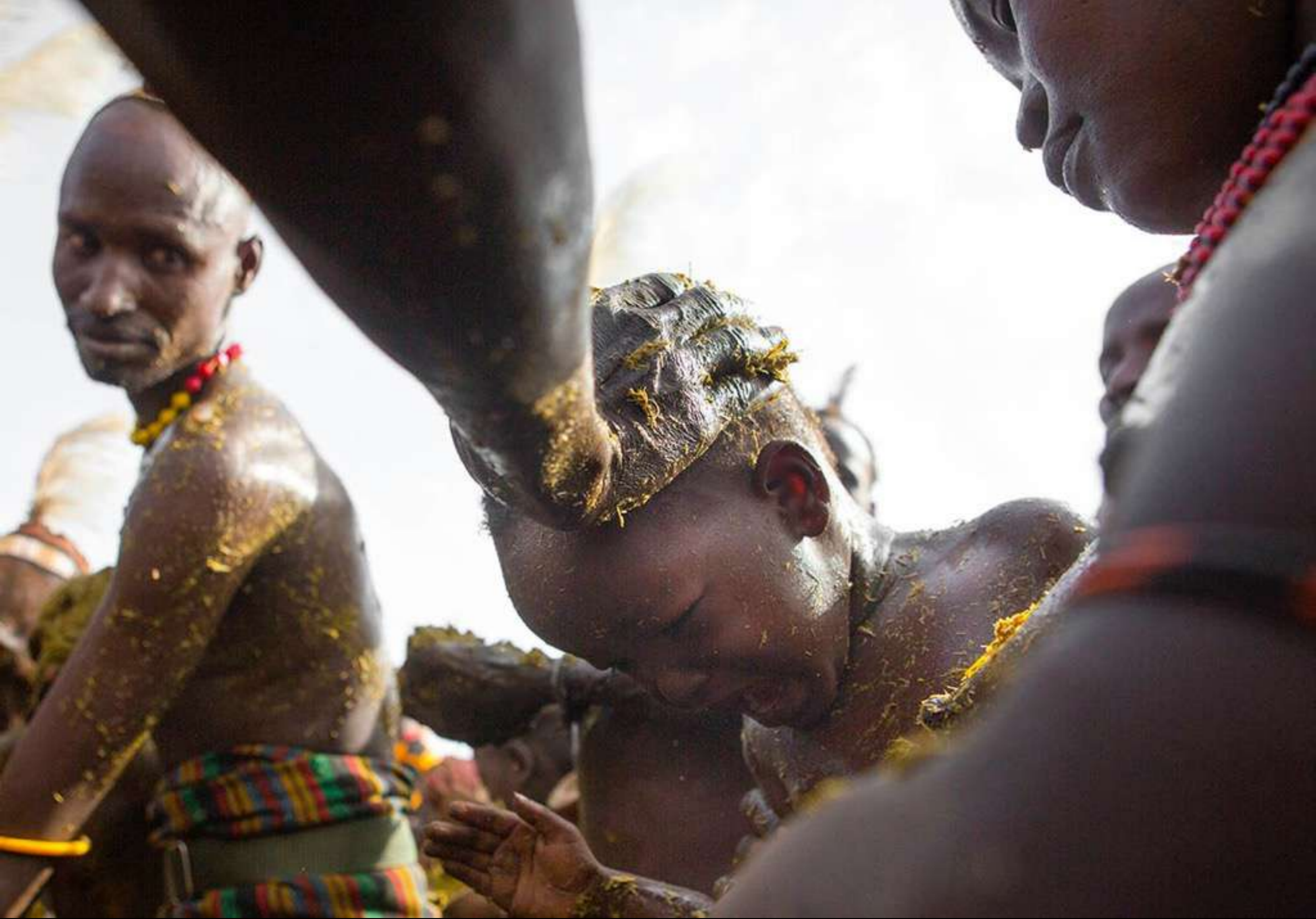
Even the babies must go thru the ritual.