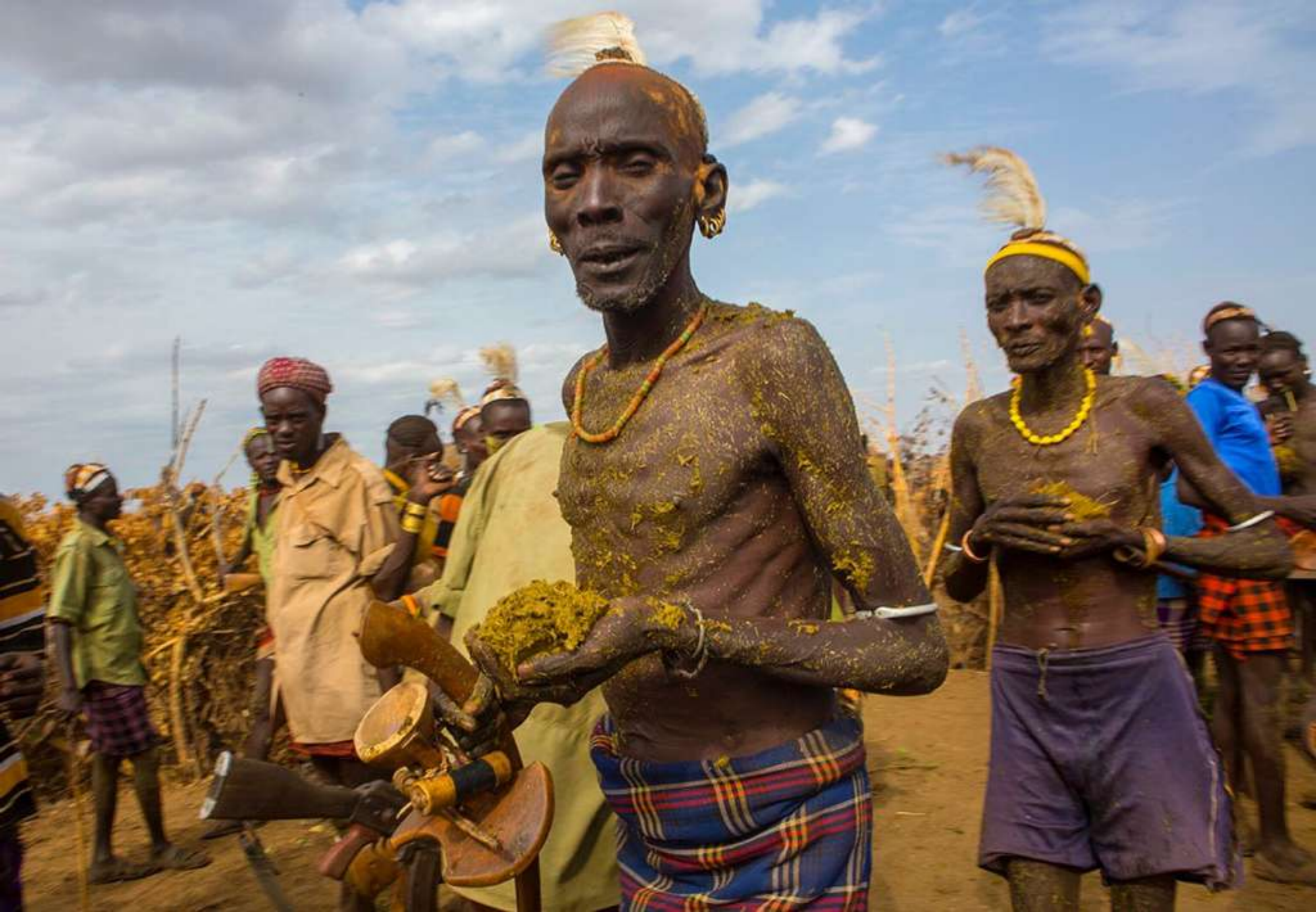
Some men bring dungs to offer them to friends.