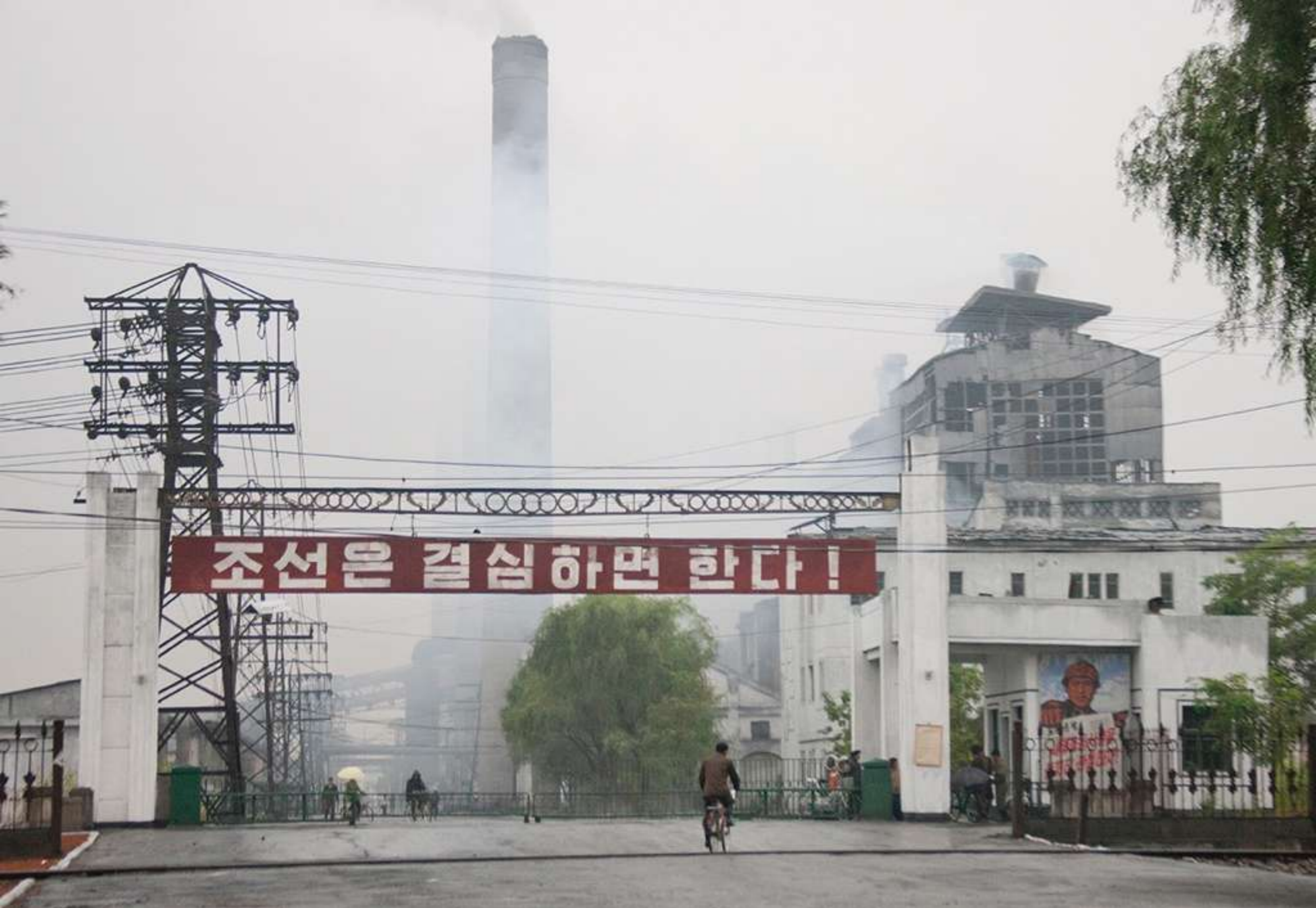
The February 8 Vinalon complex from the bus. This is the factory where they manufacture Vinalon, the pride of North Korea.