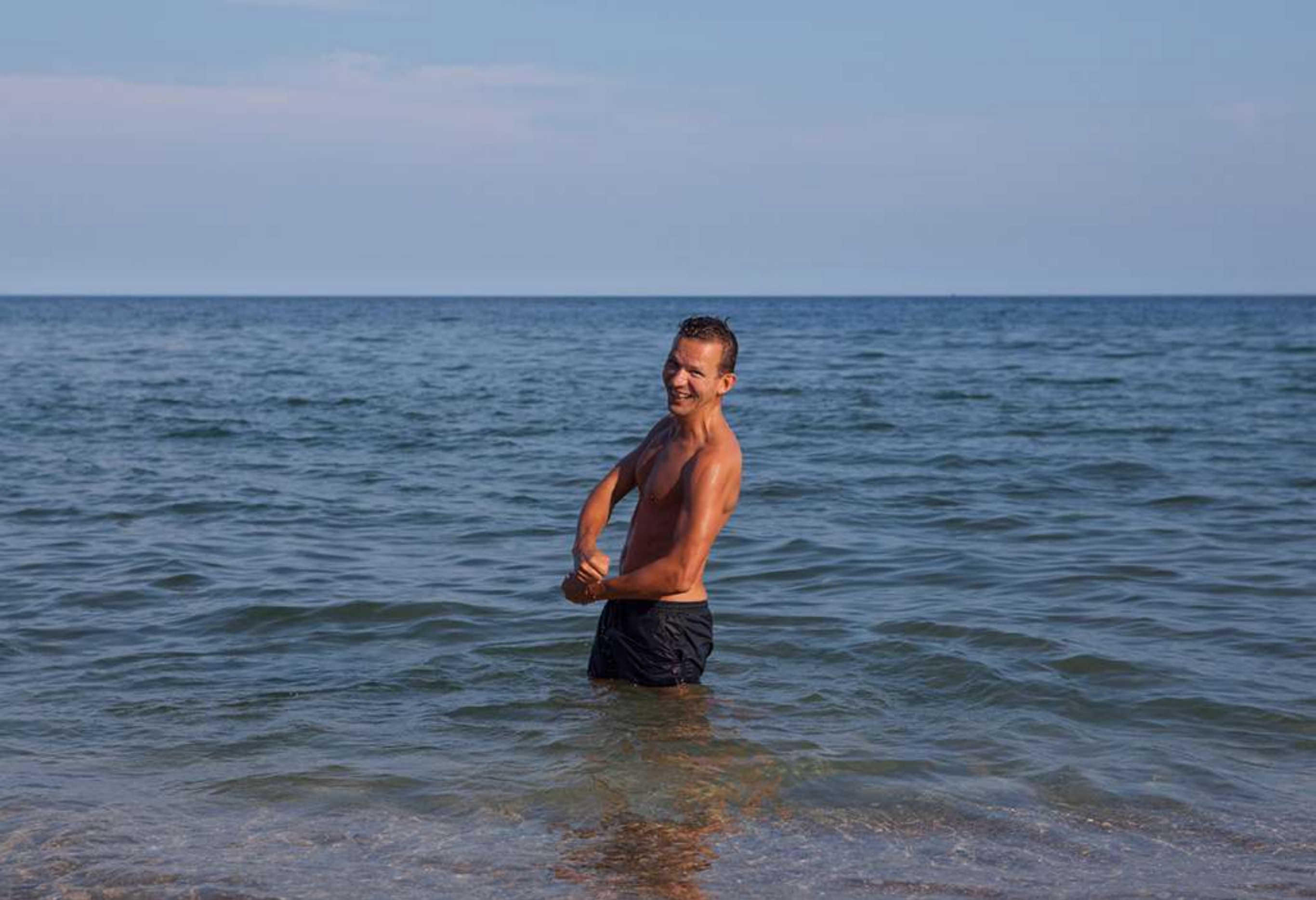
A French tourist is swimming in the sea and it seems that the water is rather warm. He jokes, "With all the chemicals they dump into the sea, it naturally heats up!" I also go for a dip in the sea. The water is surprising clear.