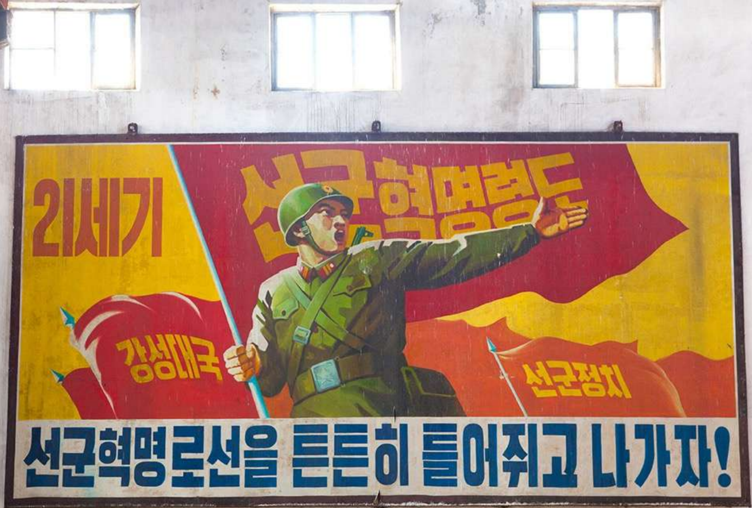
Inside the factory, a propaganda poster says: A strong and prosperous country ...let's take a firm control of the military revolution route and go forward!