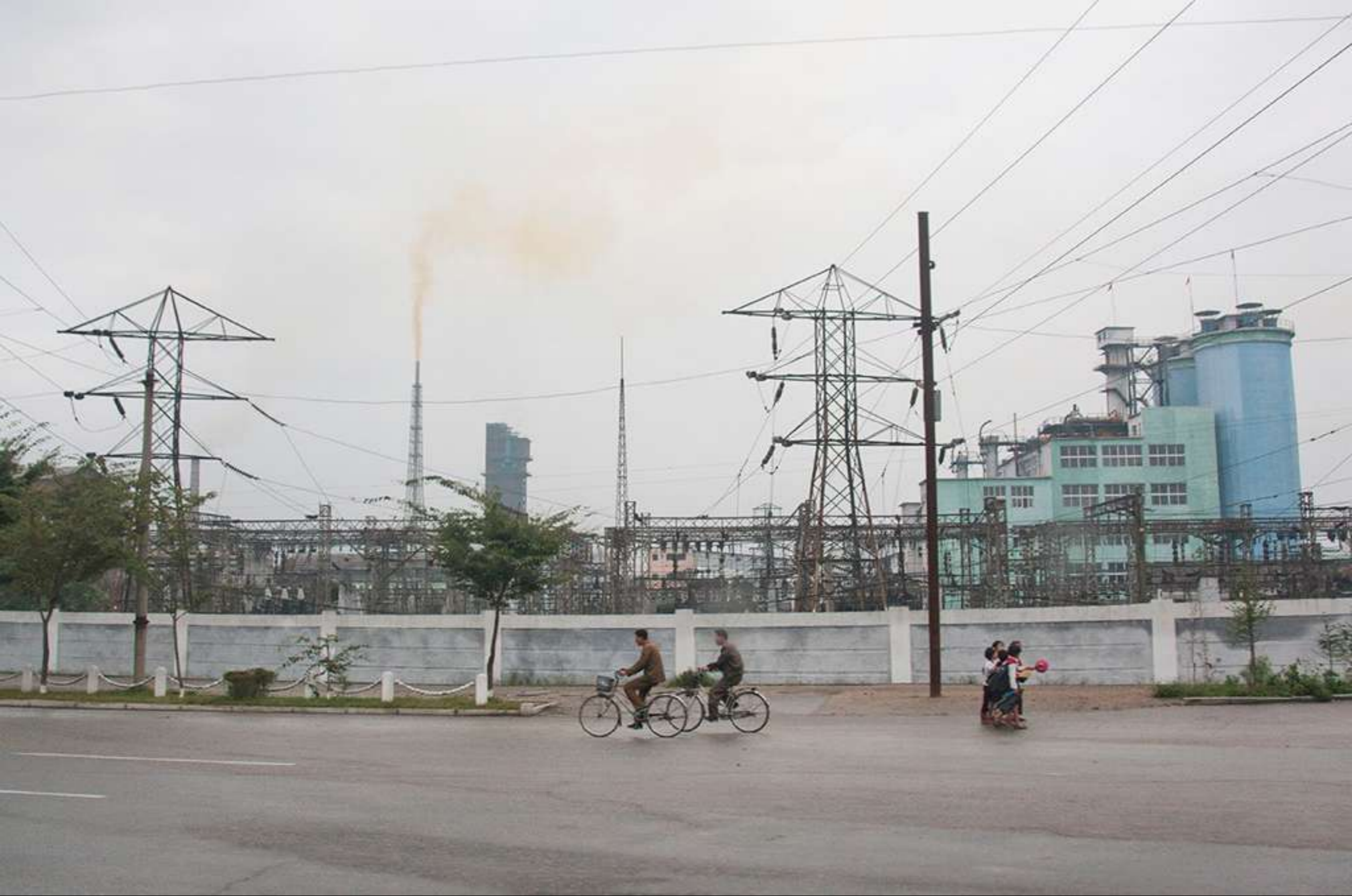
In fact, the view from the top shows a dull city surrounded by the smoke from the factory chimneys as Hamhung is home to the best beach in North Korea but is also an industrial city with many chemical complexes. Everywhere we drive, we see factories when they are not hidden by the chimney smoke.