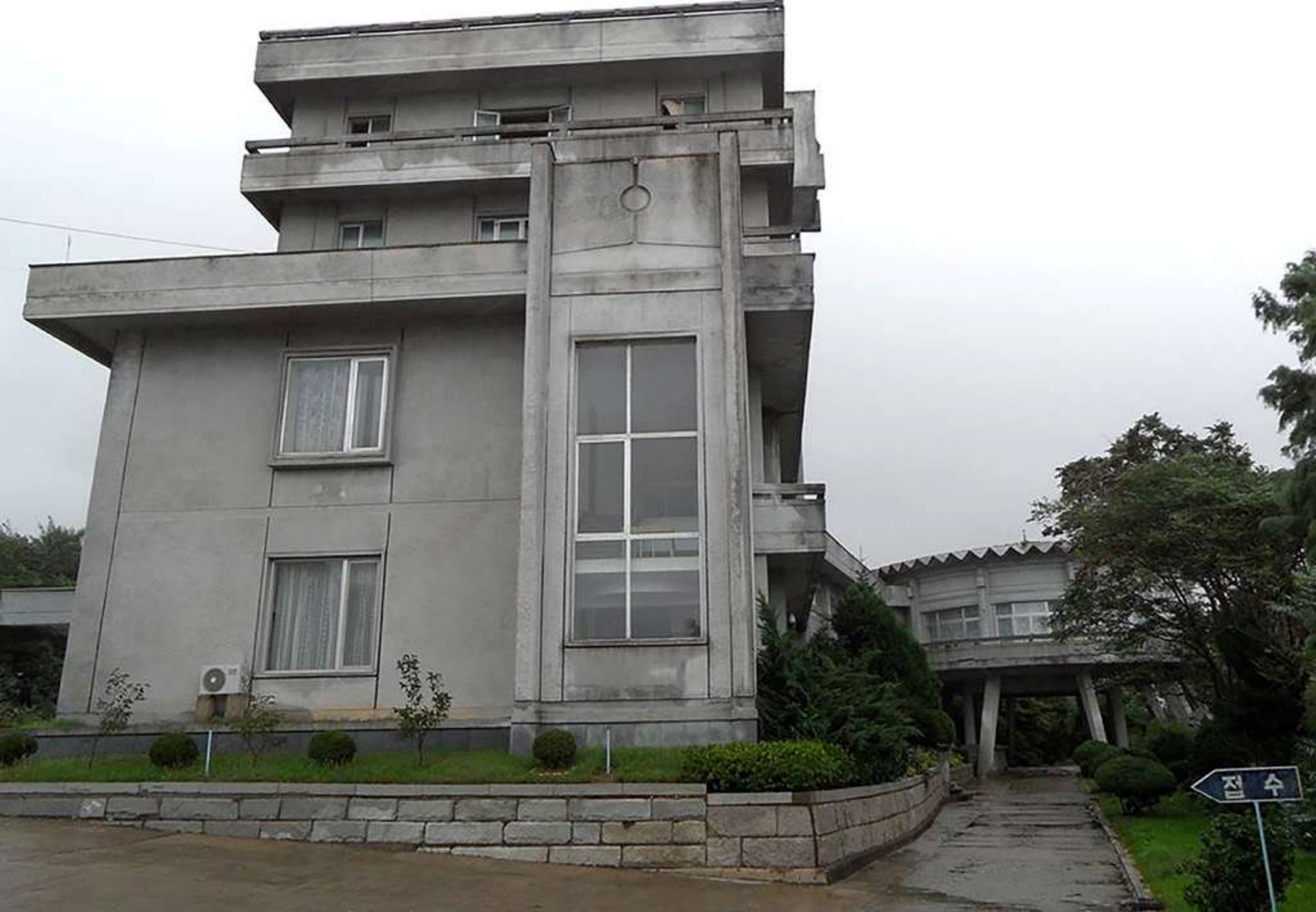
The room is basic in a little chalet with thin walls so you can share everything with your neighbors. The guide invites you to take your shoes off and wear plastic slippers.