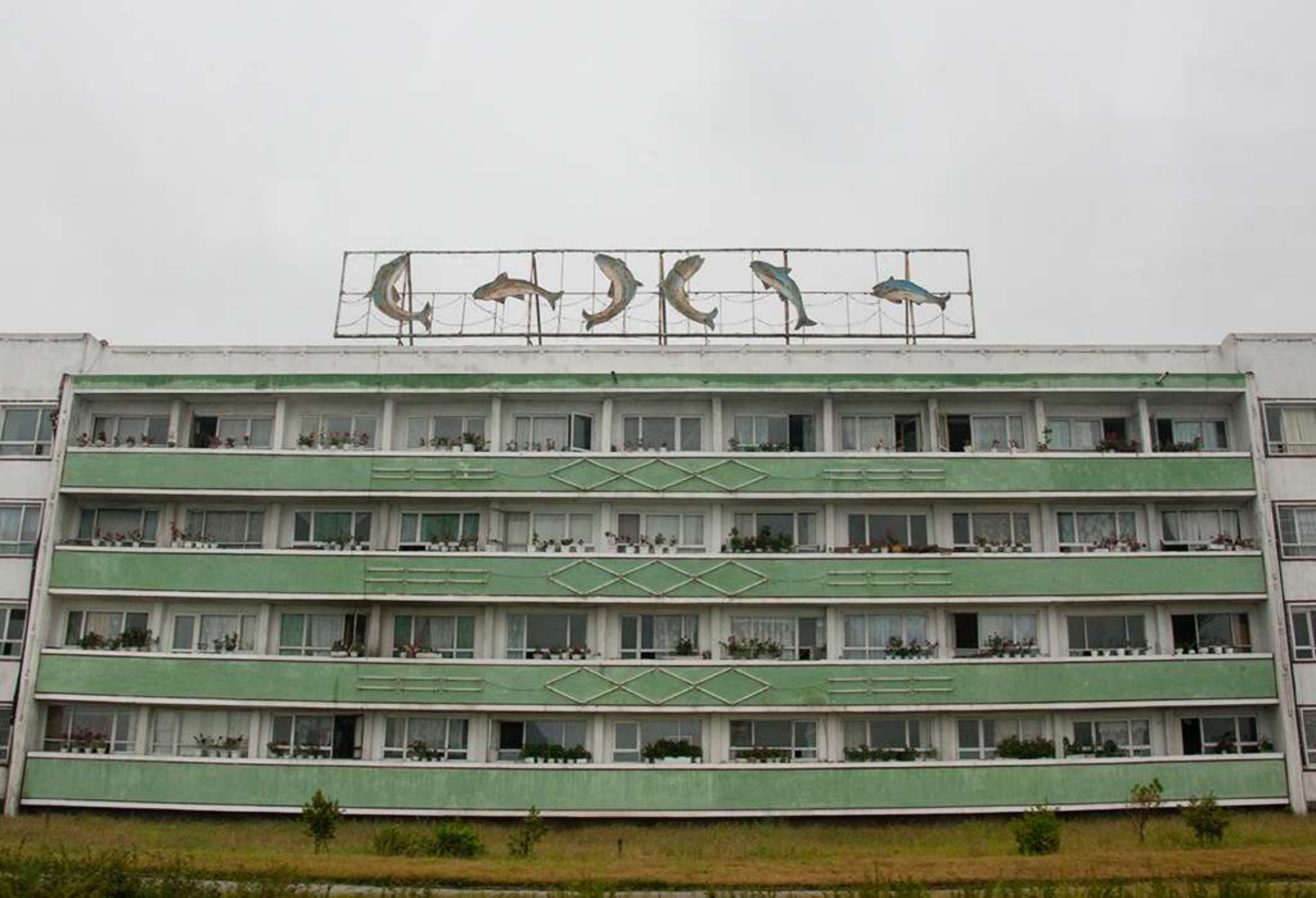
The area is famous for its fisheries. The fish is being dried everywhere and when you pass a residential building, you can smell it, mixed with the local chemical pollution. This is no holiday for your nose...