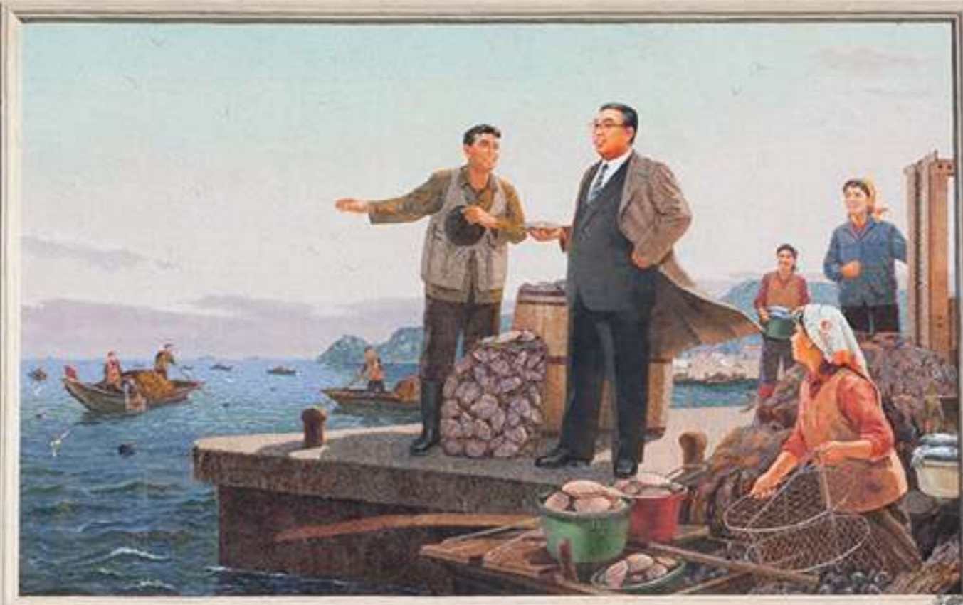
A giant fresco shows Kim Il Sung talking with local fishermen on the shore.