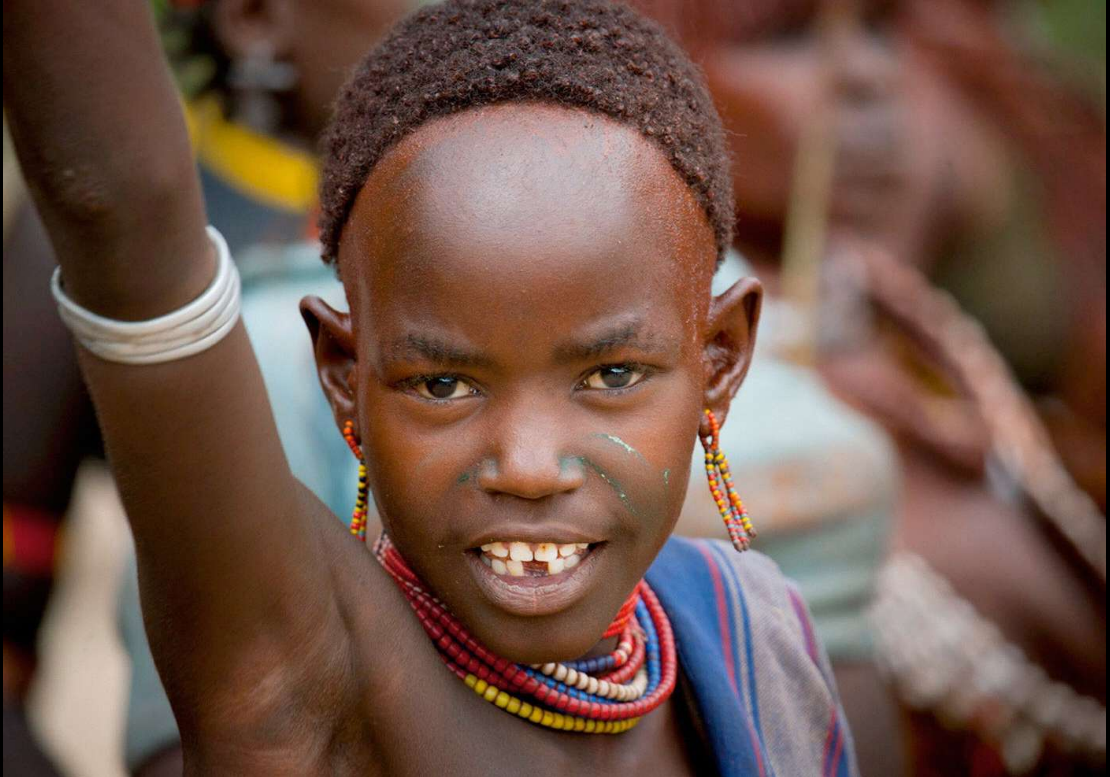
Young girls are discouraged from getting whipped, even if they dance and sing in the ceremony.