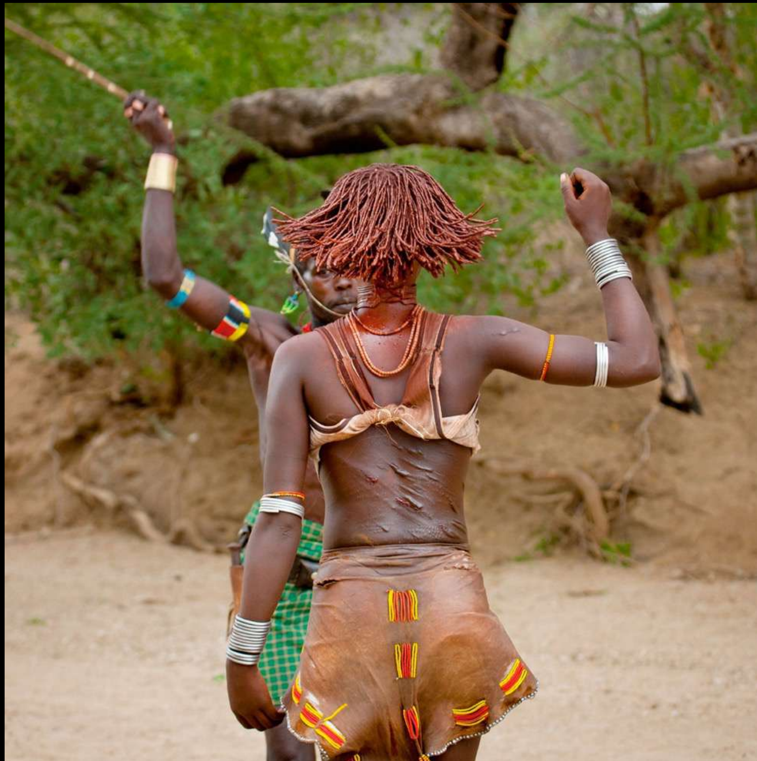
The more abundant and extensive the wounds, the deeper the girls' affection for the boy who is about to become a man. They don't show any signs of pain.