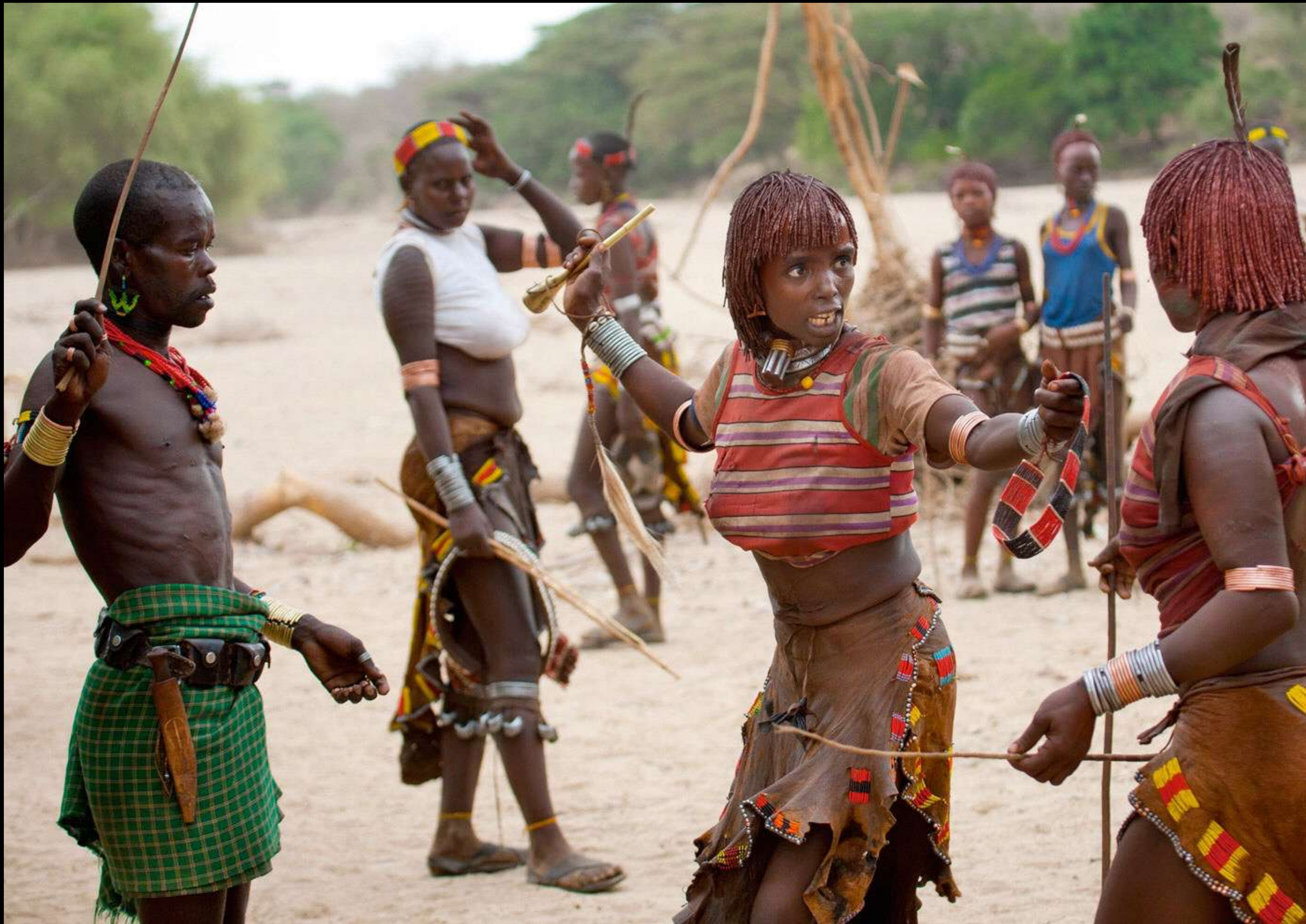
These women fight to be whipped first by the Maza to prove their love and their strength.