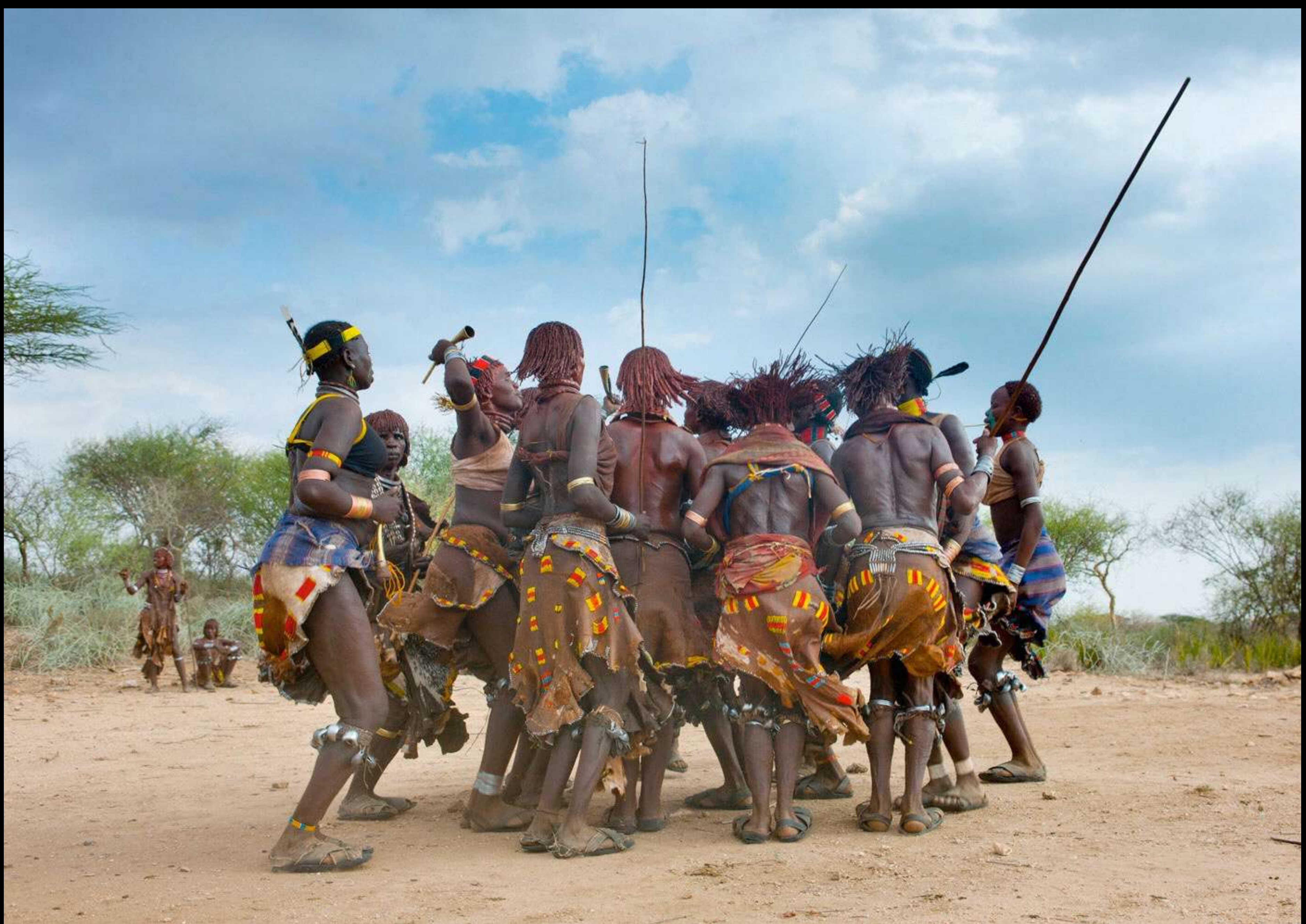
The jumper's female relatives, covered in animal skins, butter, and ocher, dance in a circle while blowing into horns.