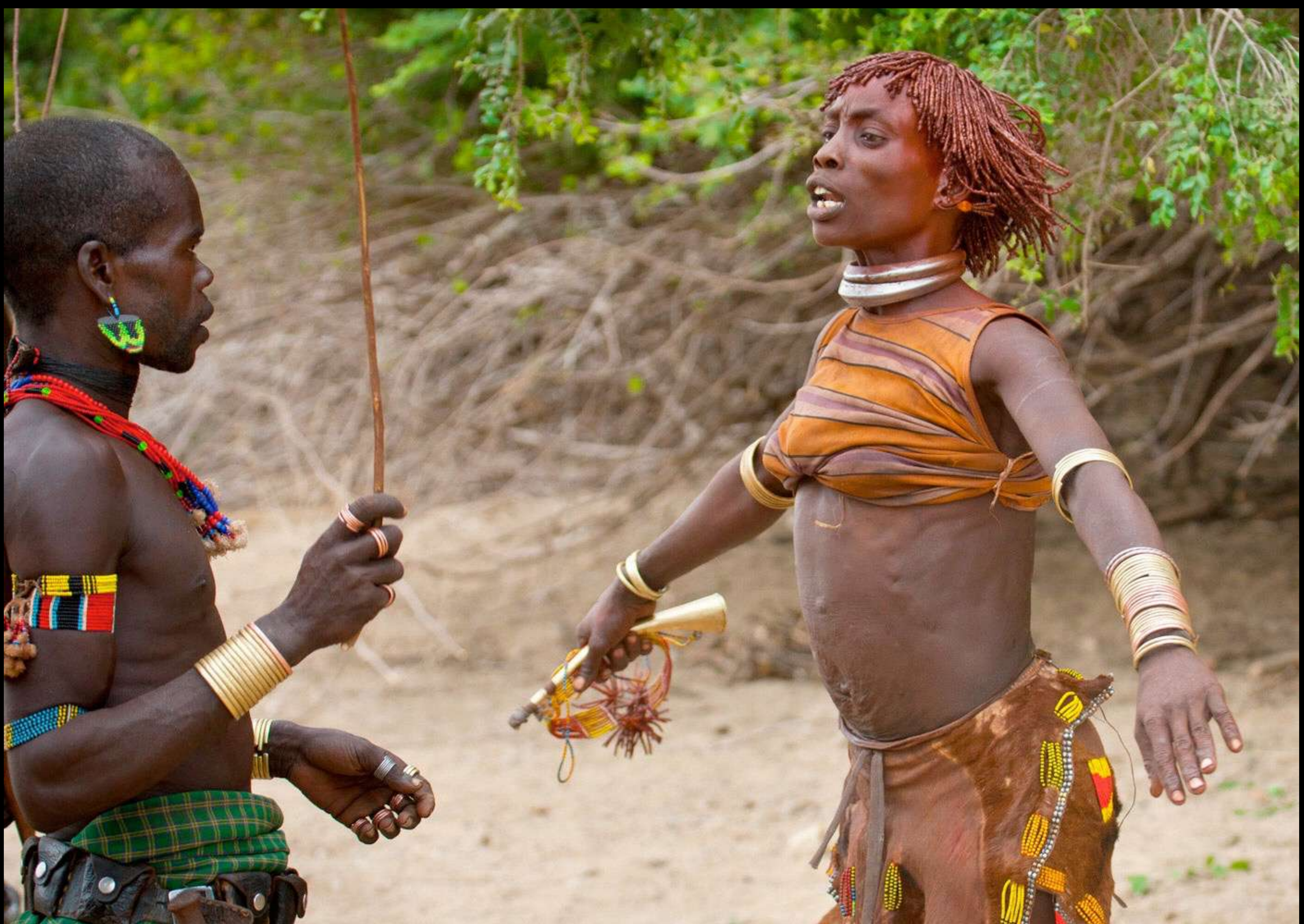
The Mazas seem timid faced with the fervor of the women.