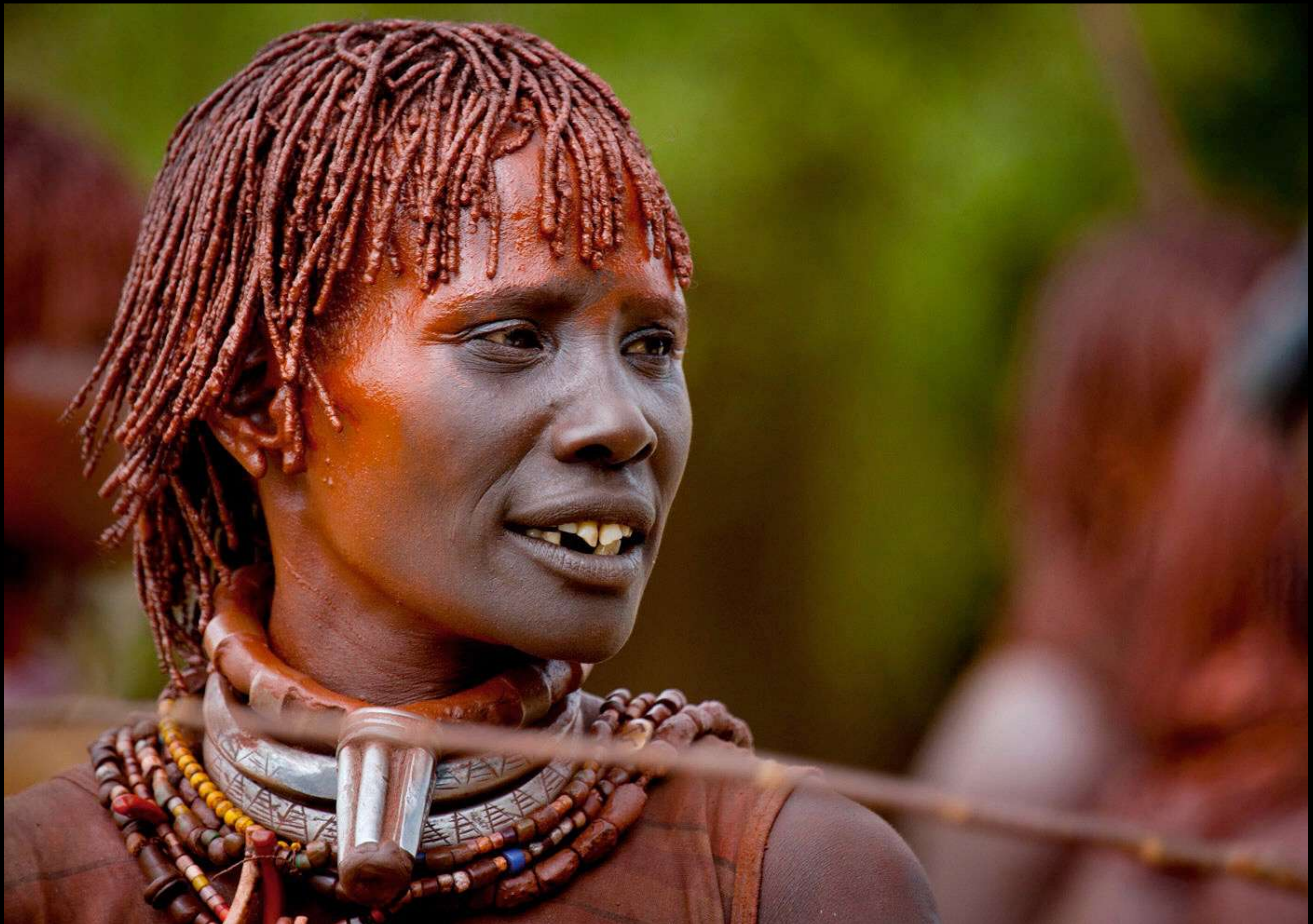
This woman wears a necklace indicating that she is a first wife. Among the polygamous Hamar, the second and third wives are treated like slaves.