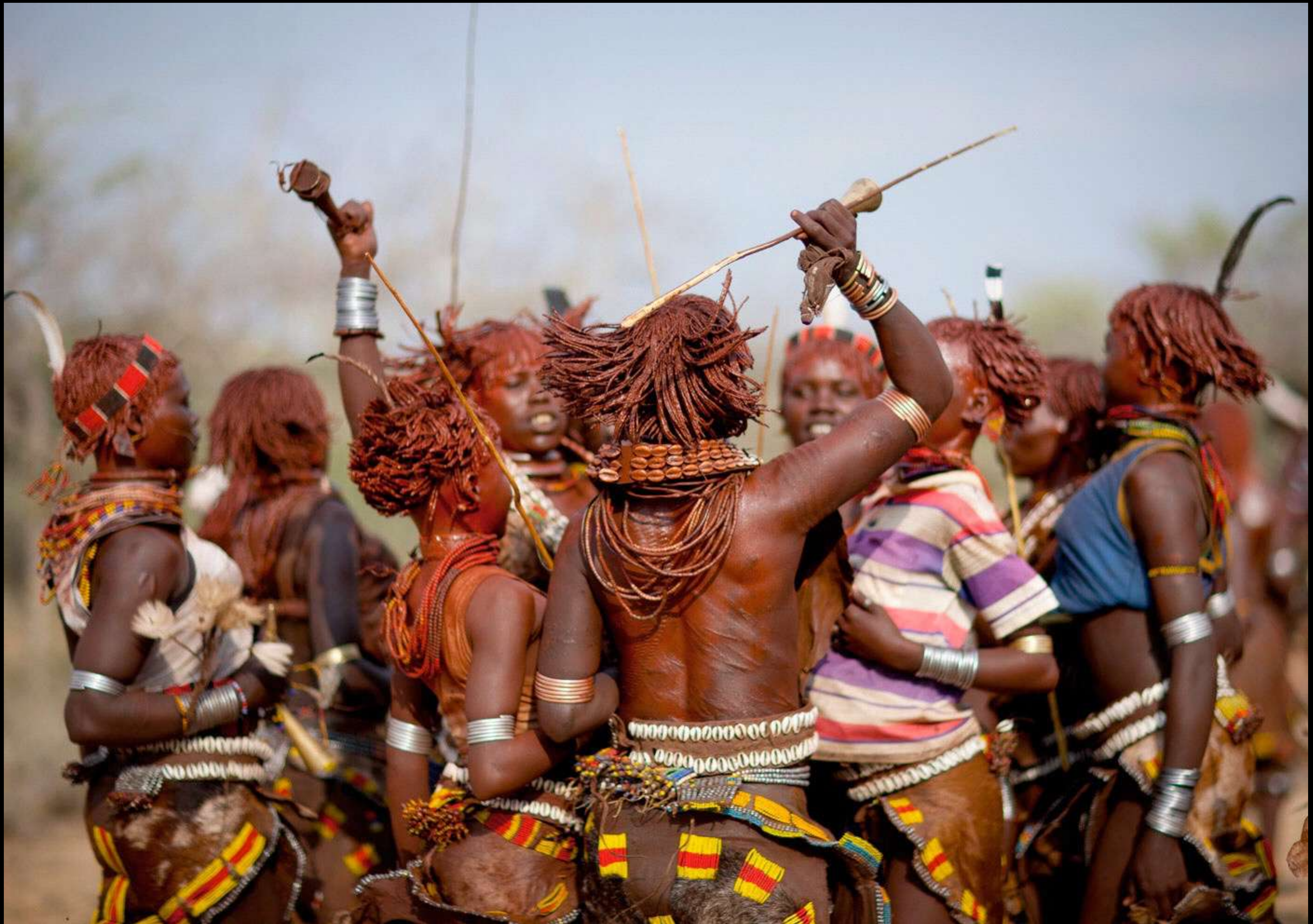
At the end of the leap, a huge dance takes place. The girls choose who they want to dance with and indicate their chosen partner by kicking him on the leg.