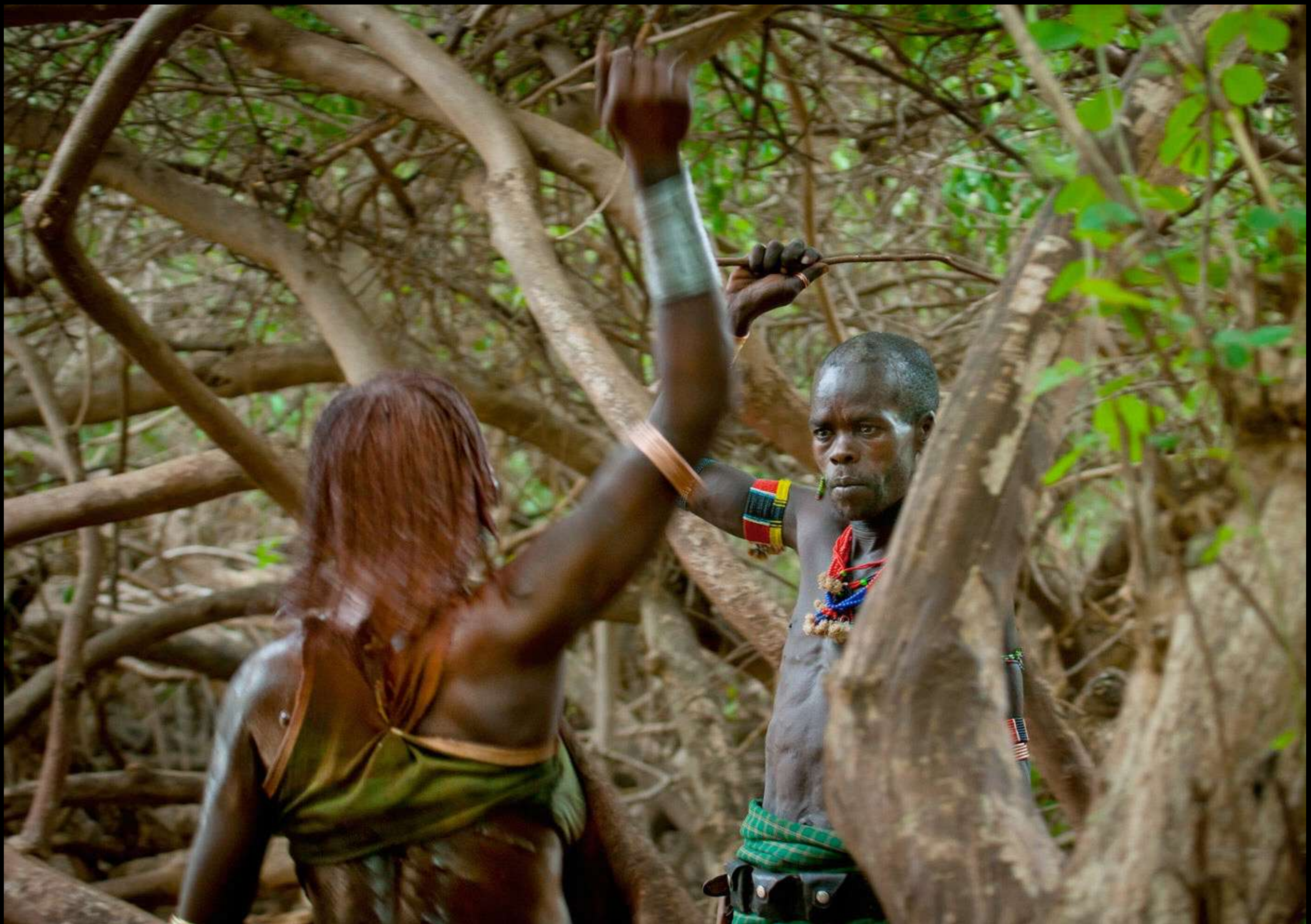
Even while the Maza prepare for the ceremony in the bush, the women keep on harassing them to whip them.