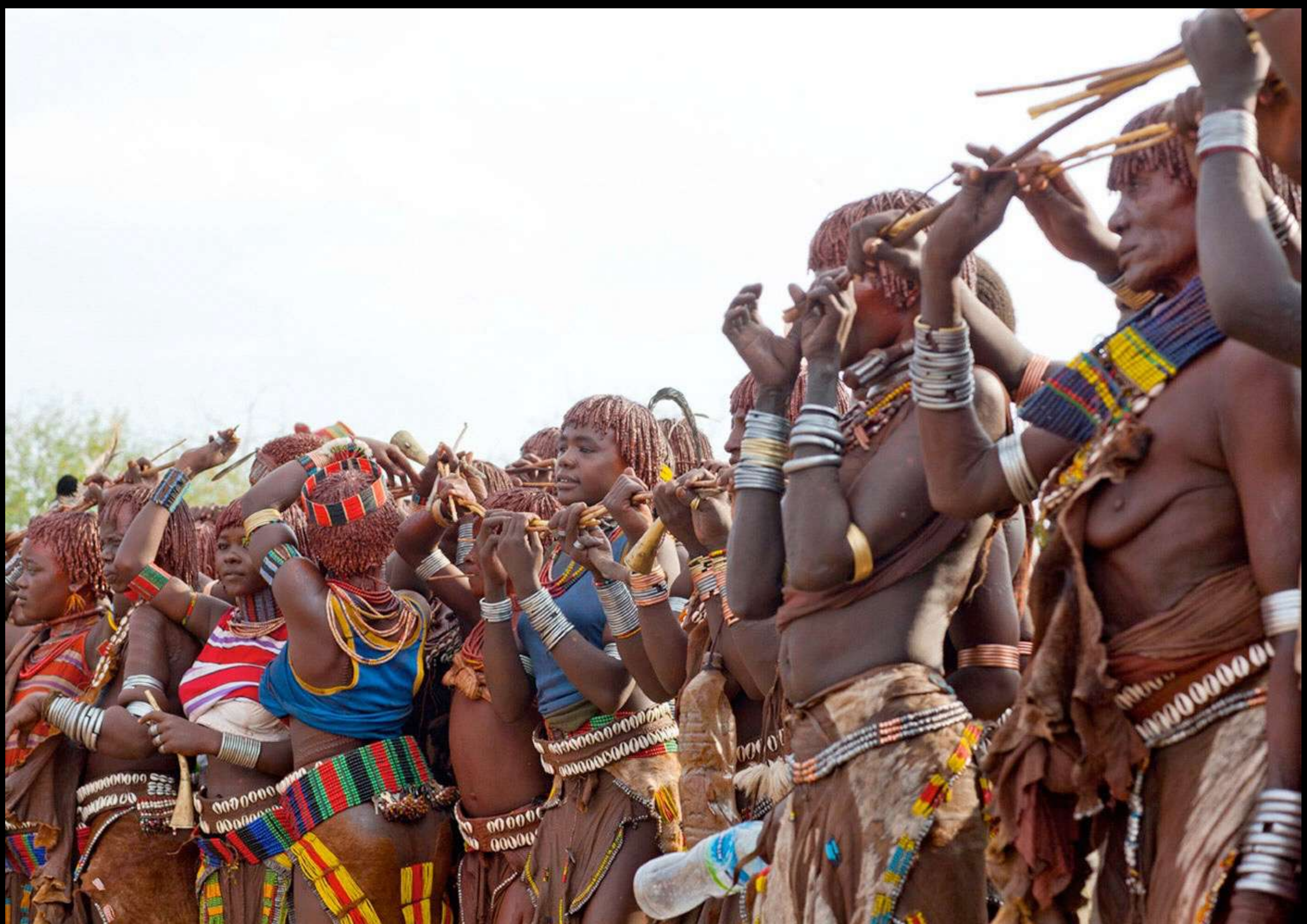
Before the jump, all the women gather together next to the cattle. They raise their hands and whips and sing.