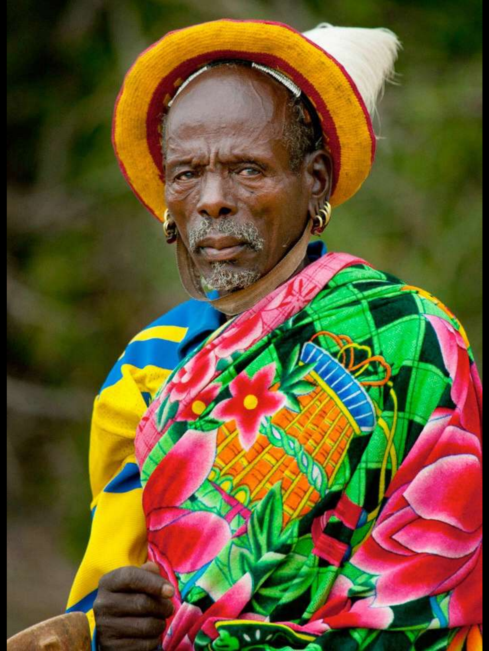
The elders wear their best clothes to attend the ceremony such as blankets made in China. They also cover their legs with a special and expensive green mud. Some tourists are permitted to watch the ceremony after paying a fee. It's a way for the Hamar to cover the expenses of two days of partying (food and alcohol served to hundreds of guests).