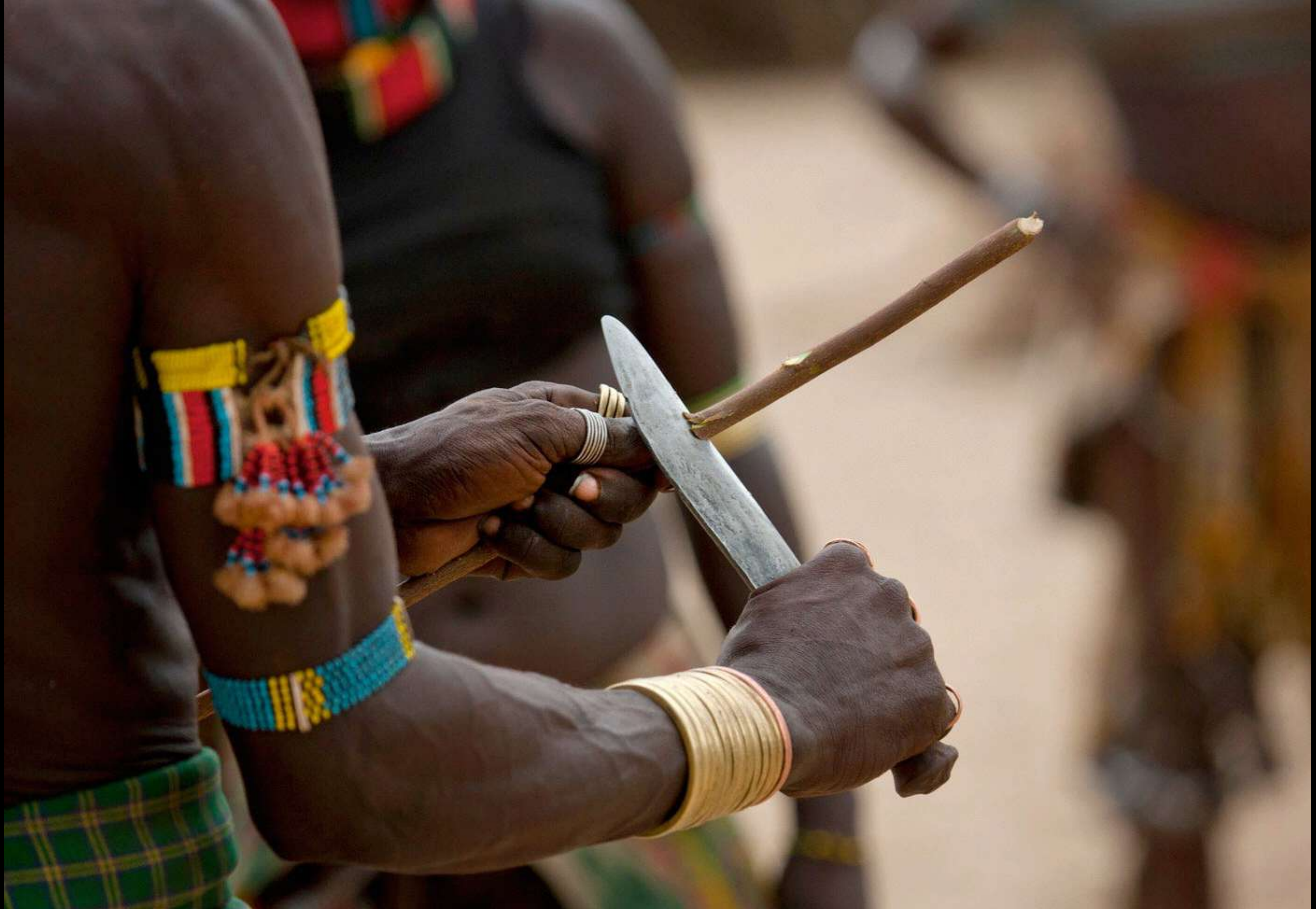
“Mazas” are men who have already leapt across the cattle, but are still single. They live apart from the rest of the tribe, moving from ceremony to ceremony. The “Mazas” whip all the jumper’s female relatives except his mother.