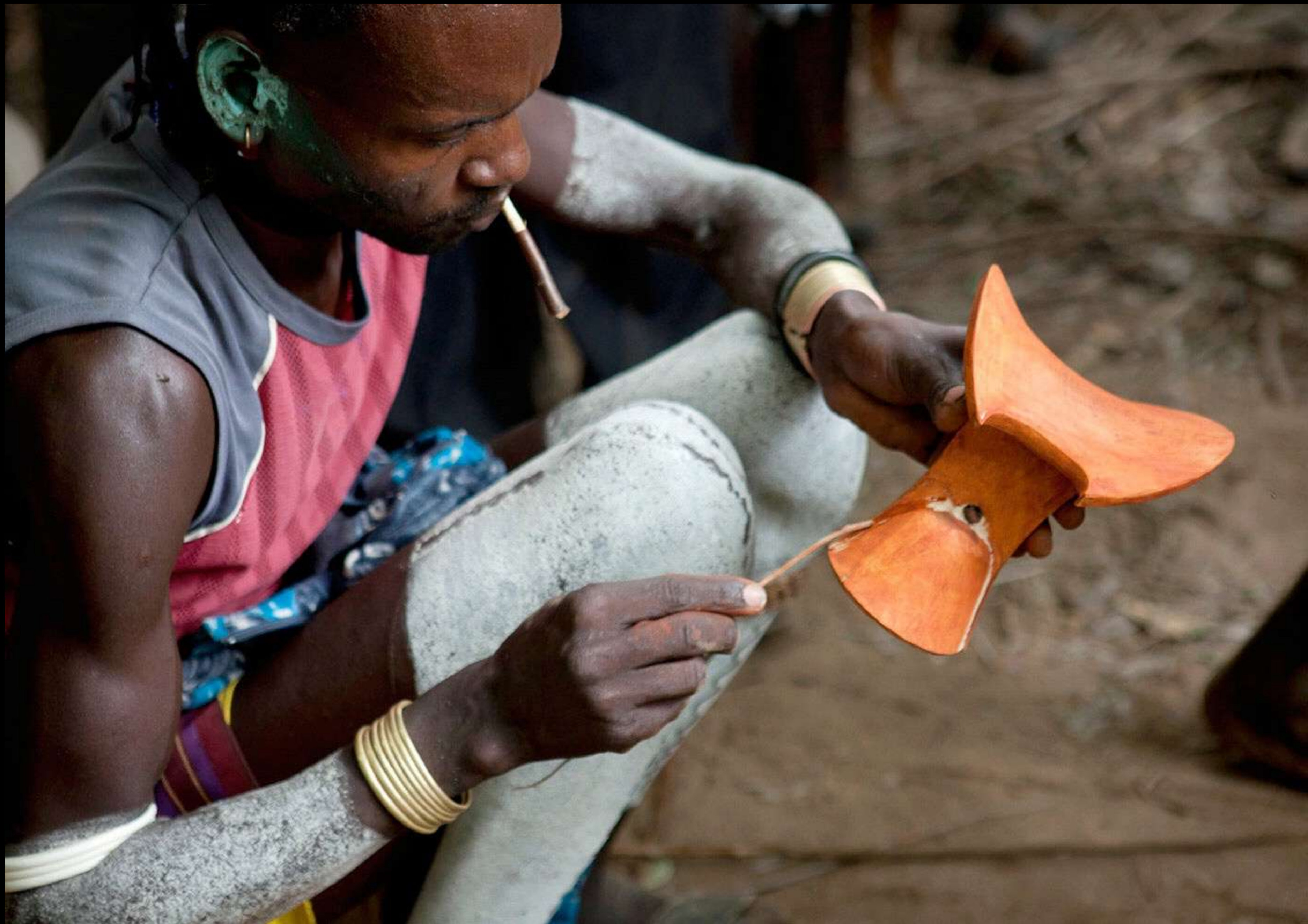
A new seat will be given to the jumper, commemorating the event and symbolizing his new status in the tribe.