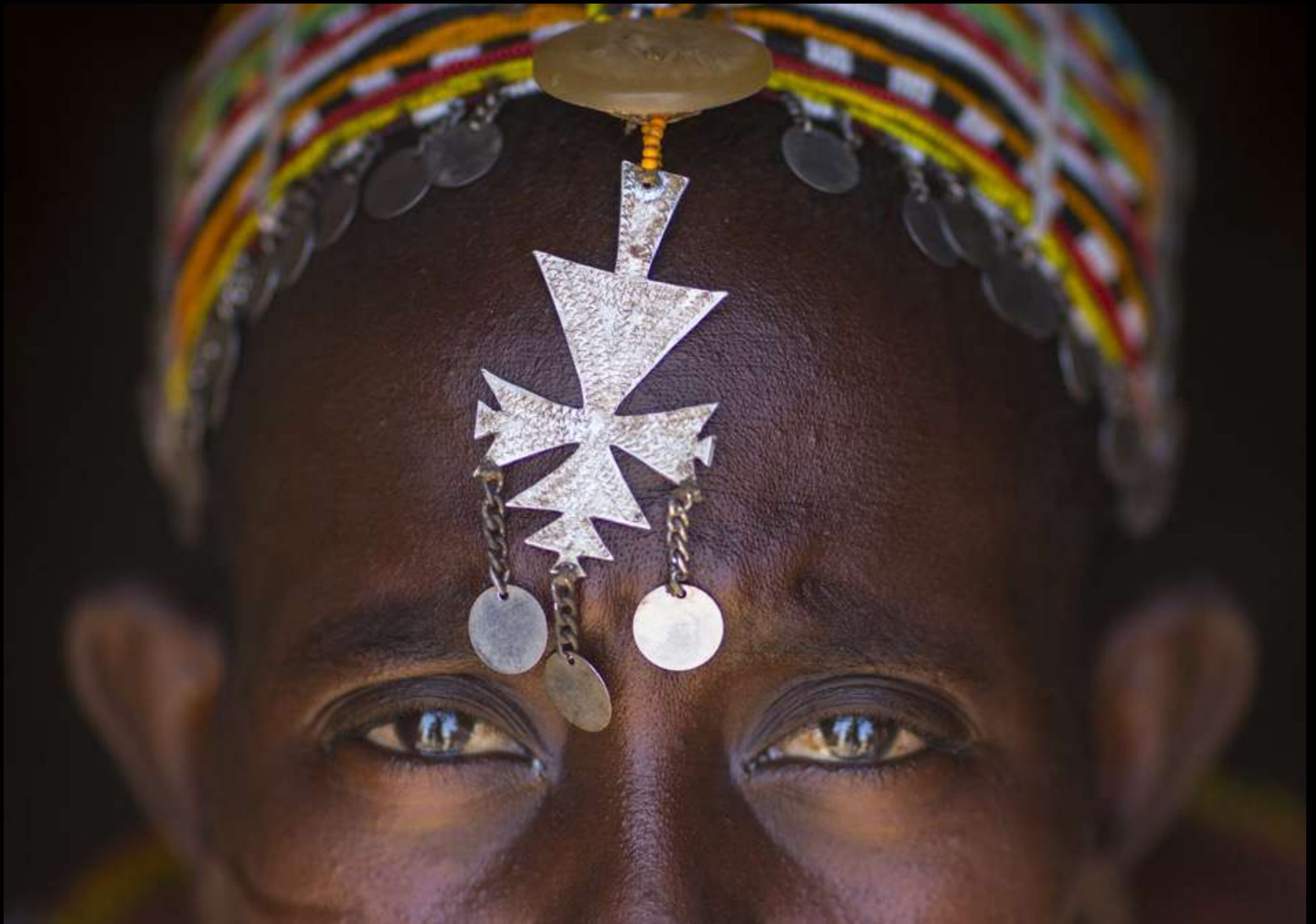
Women like to wear an cross shaped ornament on the top of their head