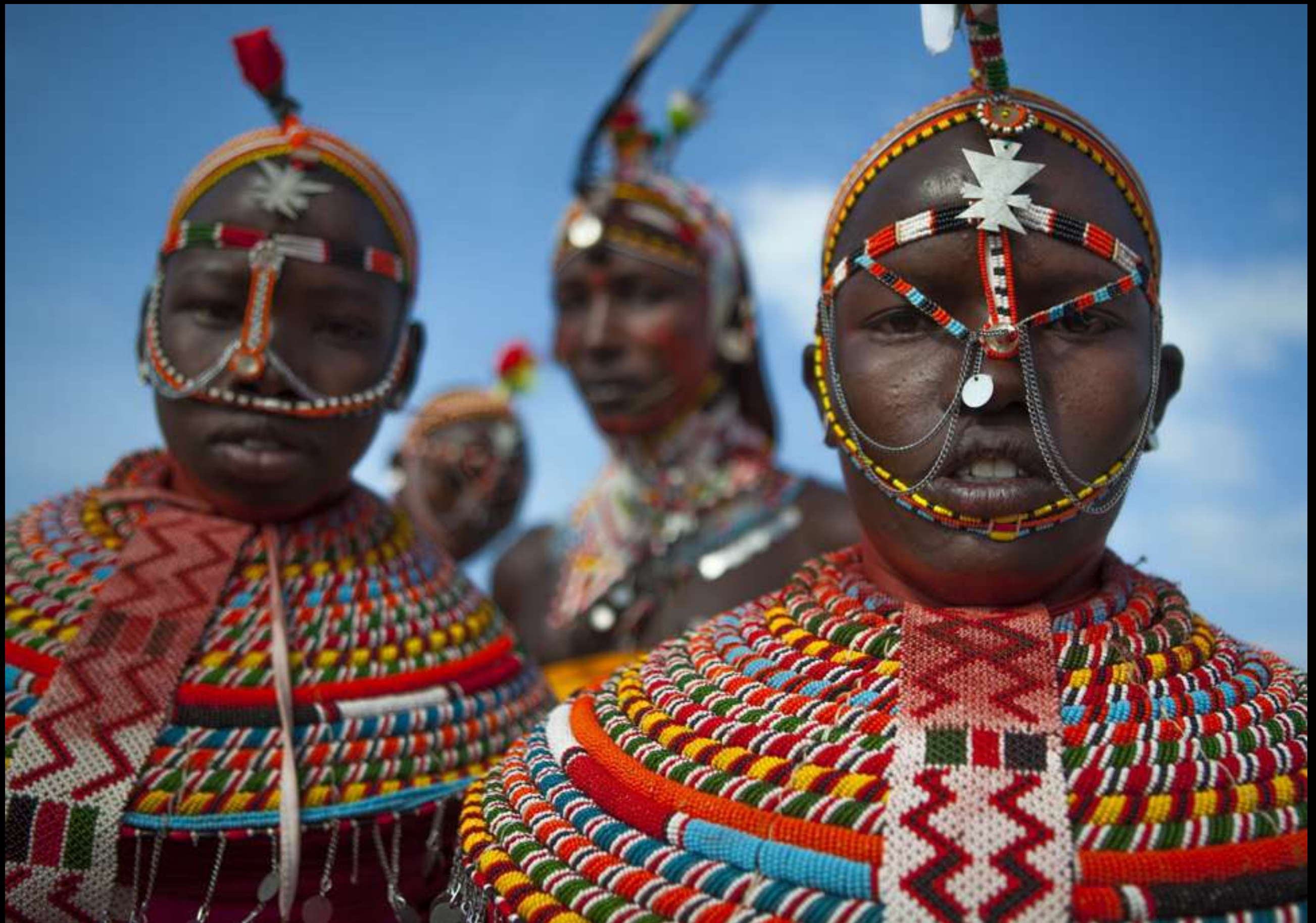
The cross has no religious significance, even if most of them are now christians.