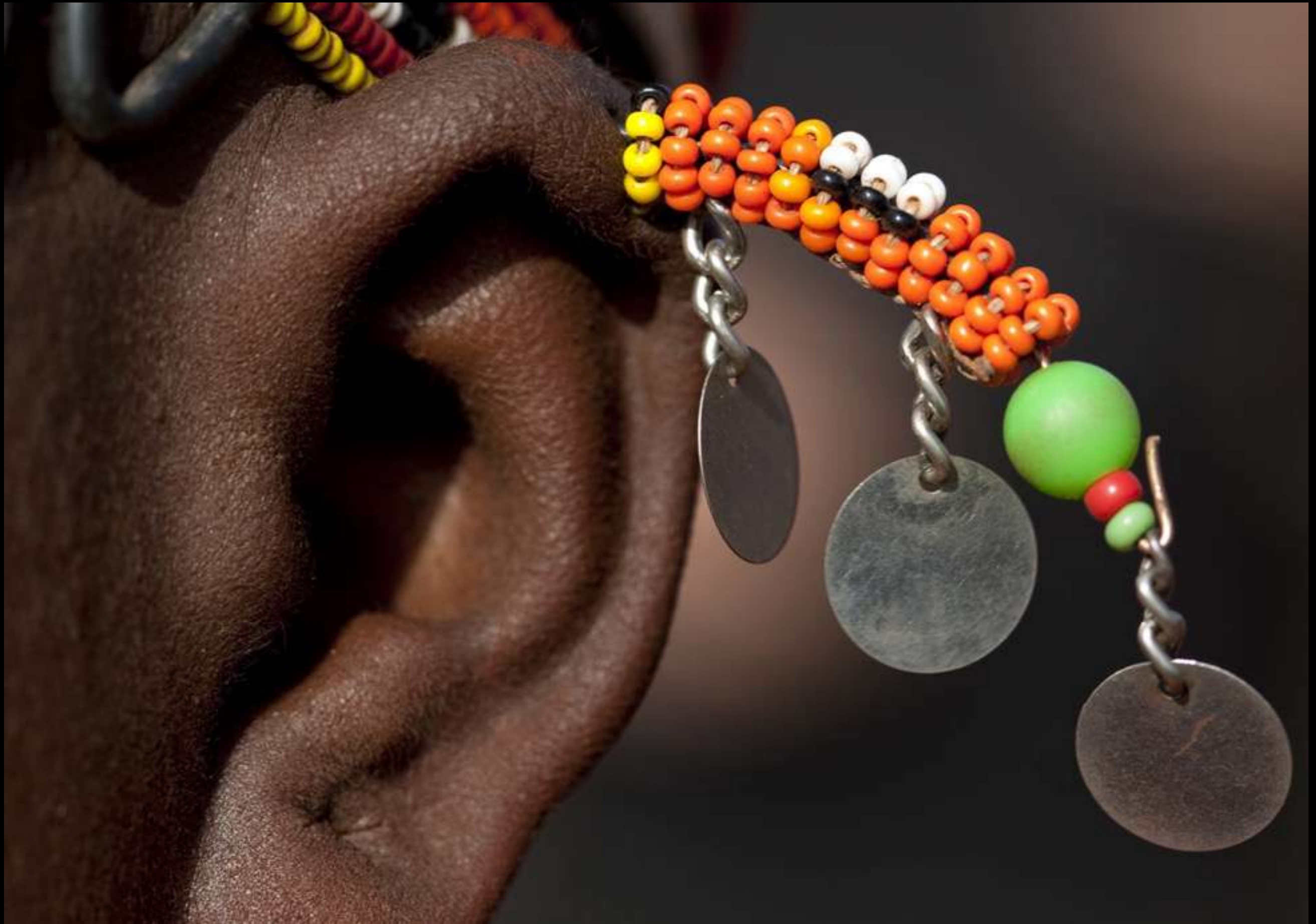
This strange earring is called Lodin, or Nshidai.