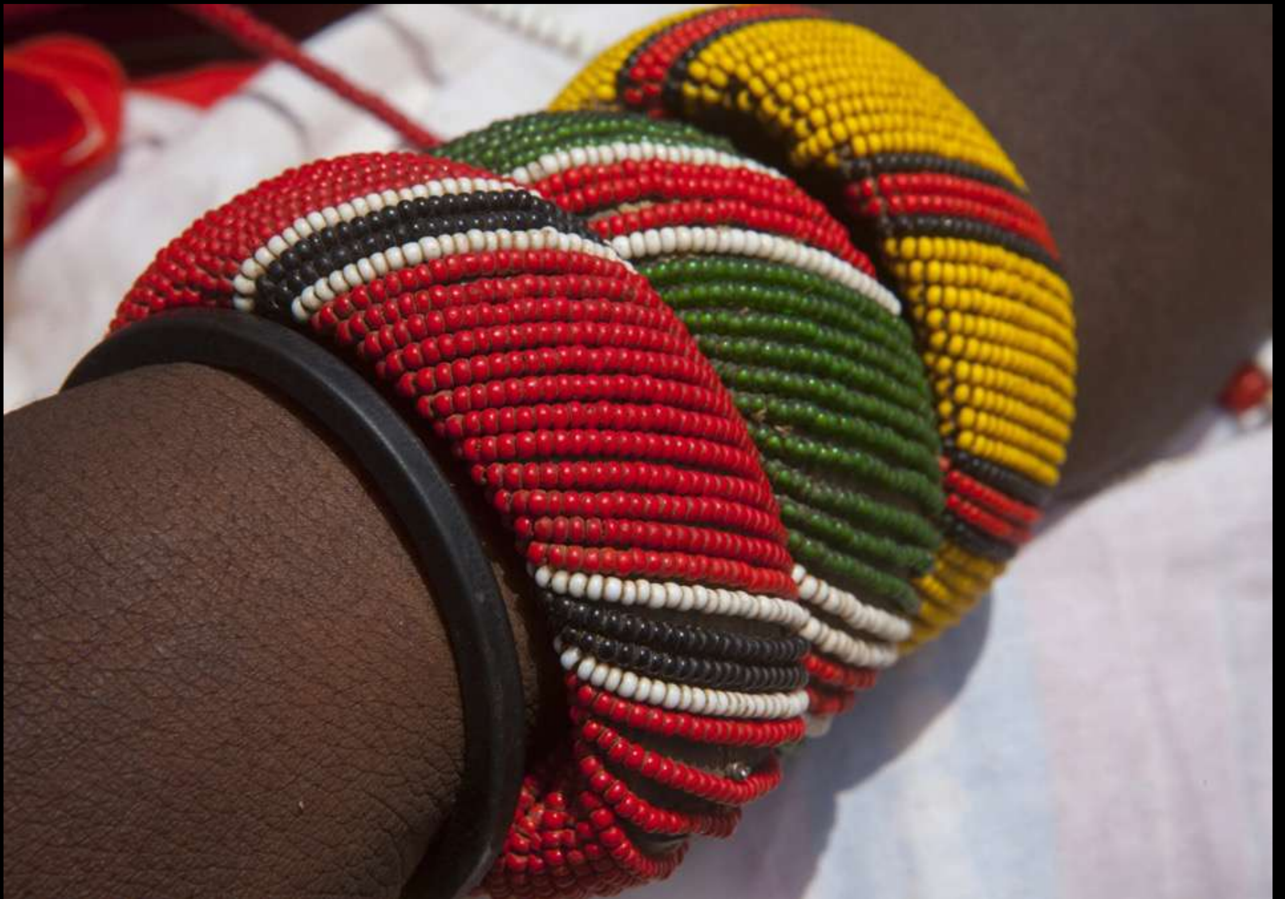
Marnay bracelets are worn by everybody : adults people... Made of beads and inner tubes !