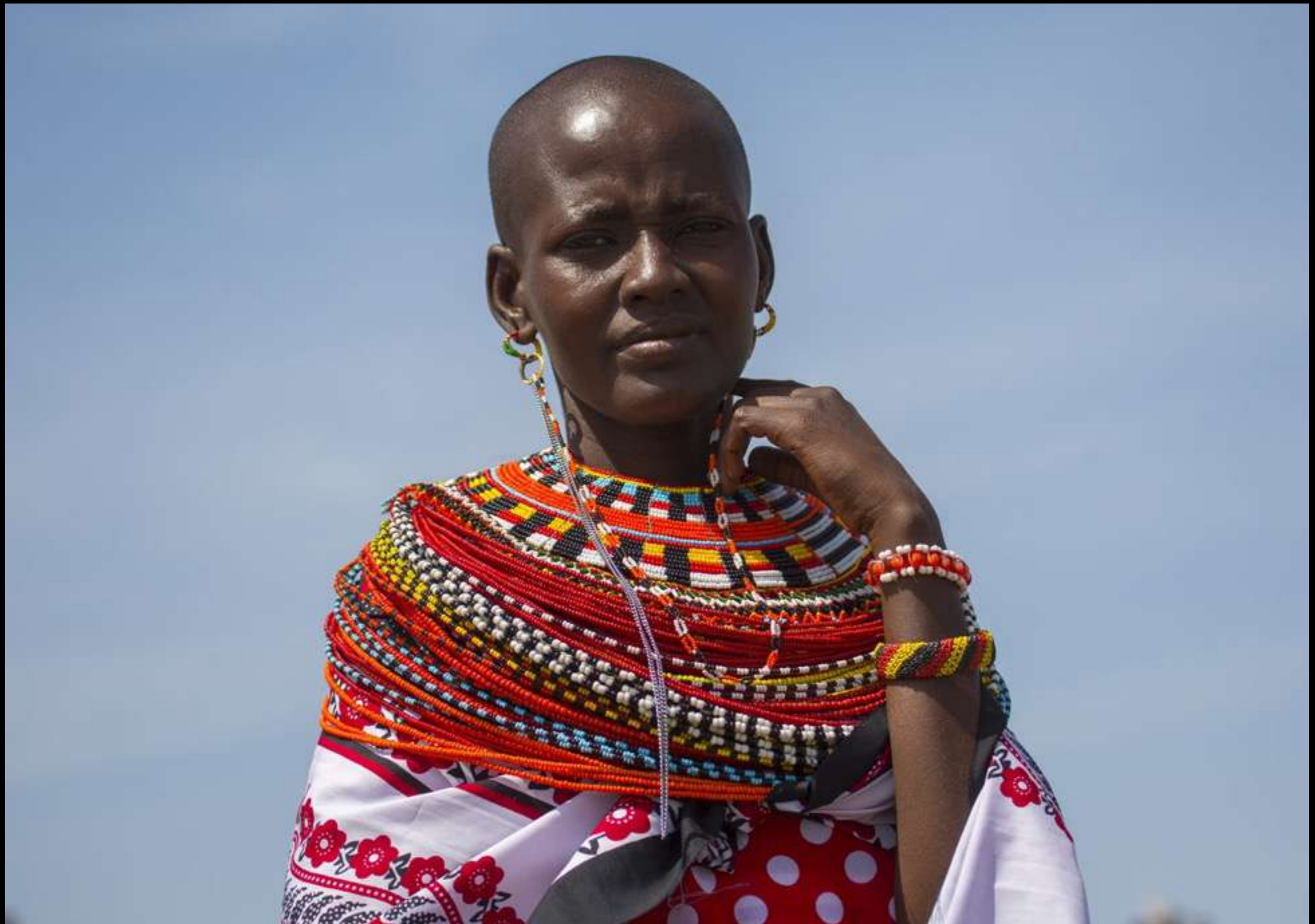
This woman wears the Nkaiweli on her left ear: a special earring that means she has already 2 or 3 of her sons being circumcised.