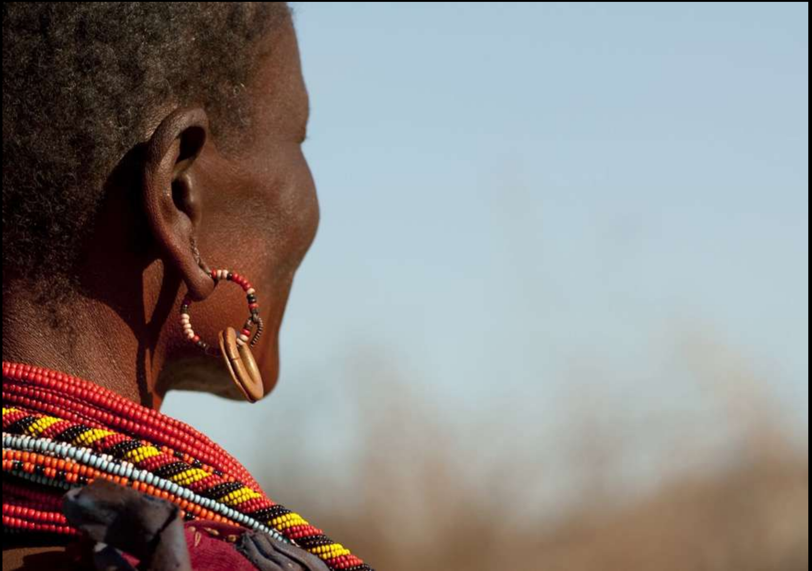
The women wear a brass earring to indicate they are married.