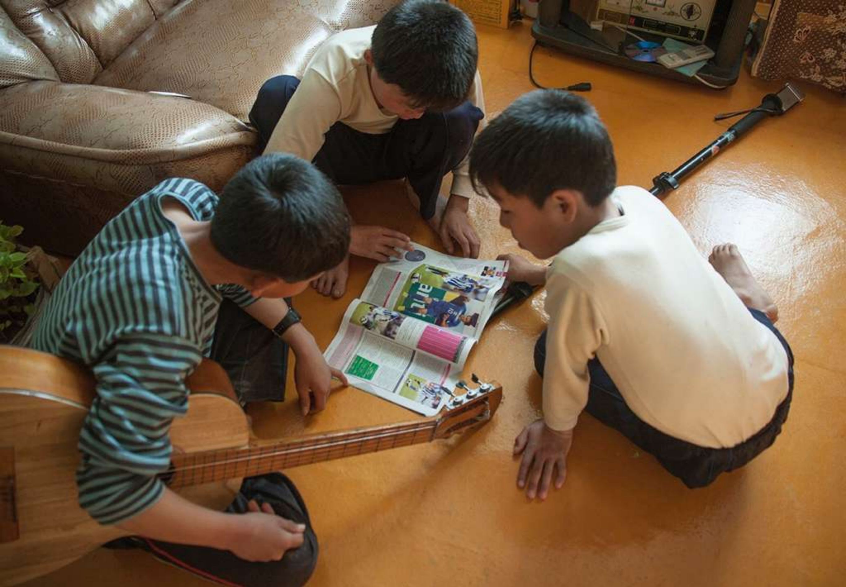
To thank the teens, I offer them a French football magazine. Inside, they find photos of their national team and beam with excitement.