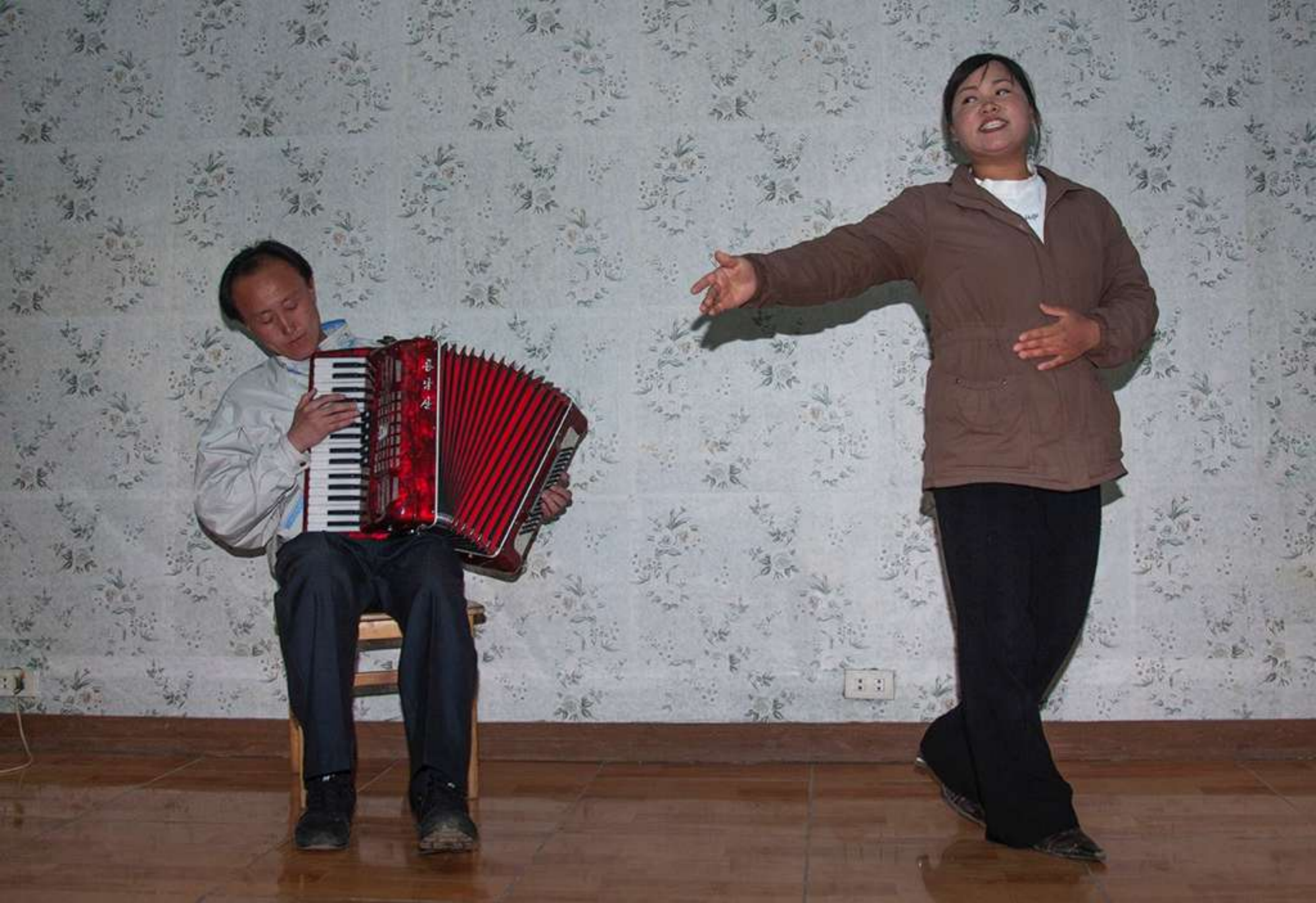
it is time to enact the North Korean version of "The Voice". Under the light emitted from my LED, everyone begins singing. The program ends with our rendition of the "International Worker's Anthem"