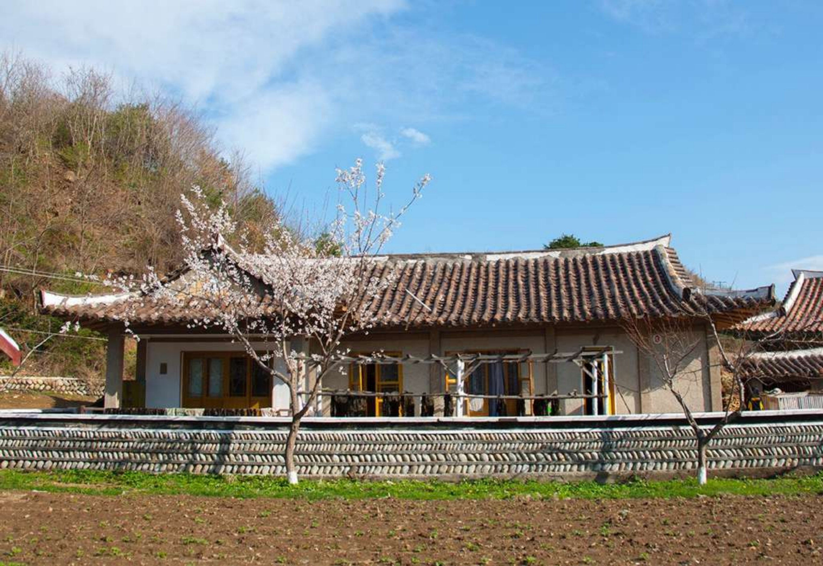
Jung Pyong Ri seems to be a community that has received ample government funding. Only 23 families resided here.