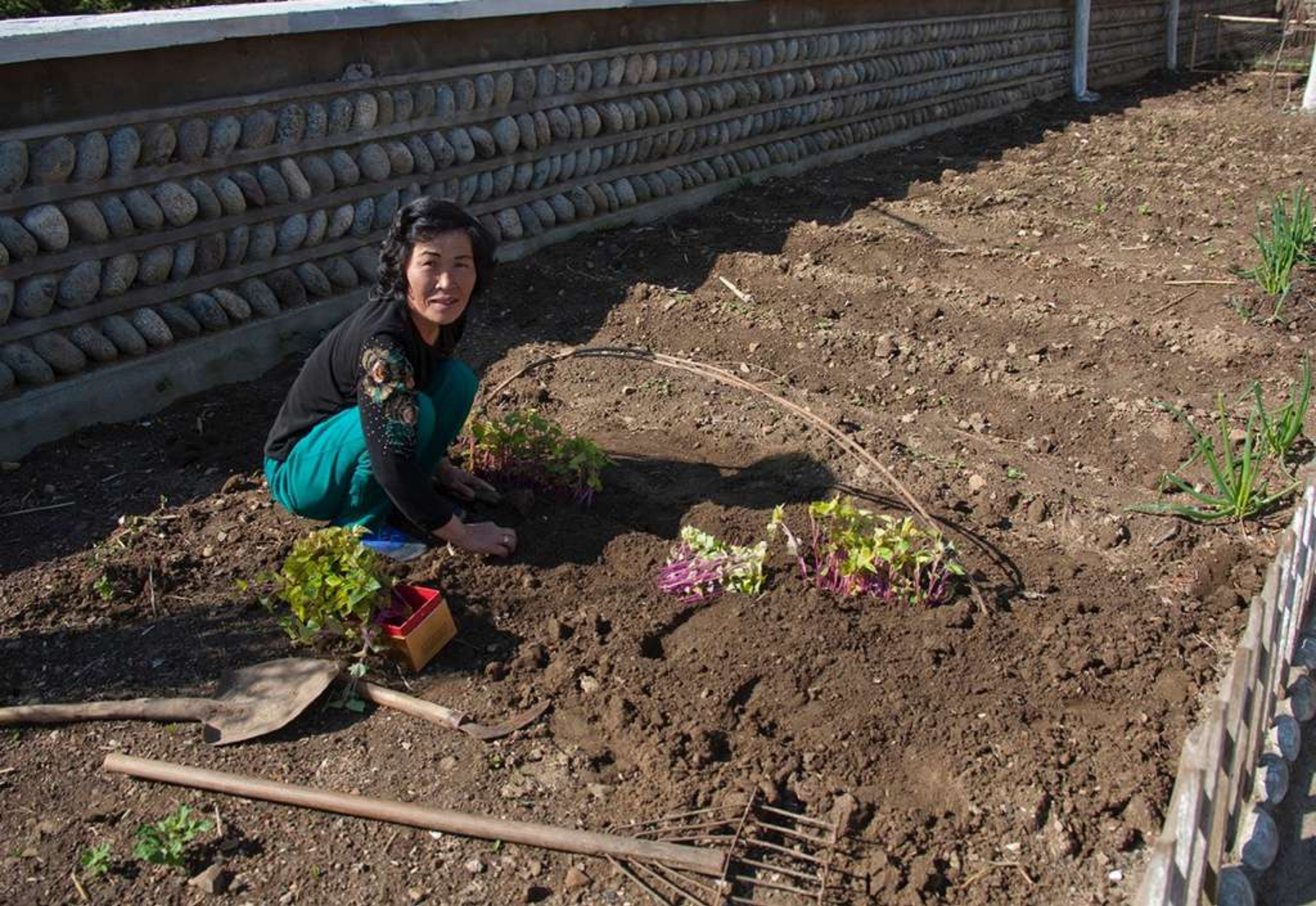
Private garden. North Korean can now gardening and sell or keep the vegetables and fruits they grow in front of their house.