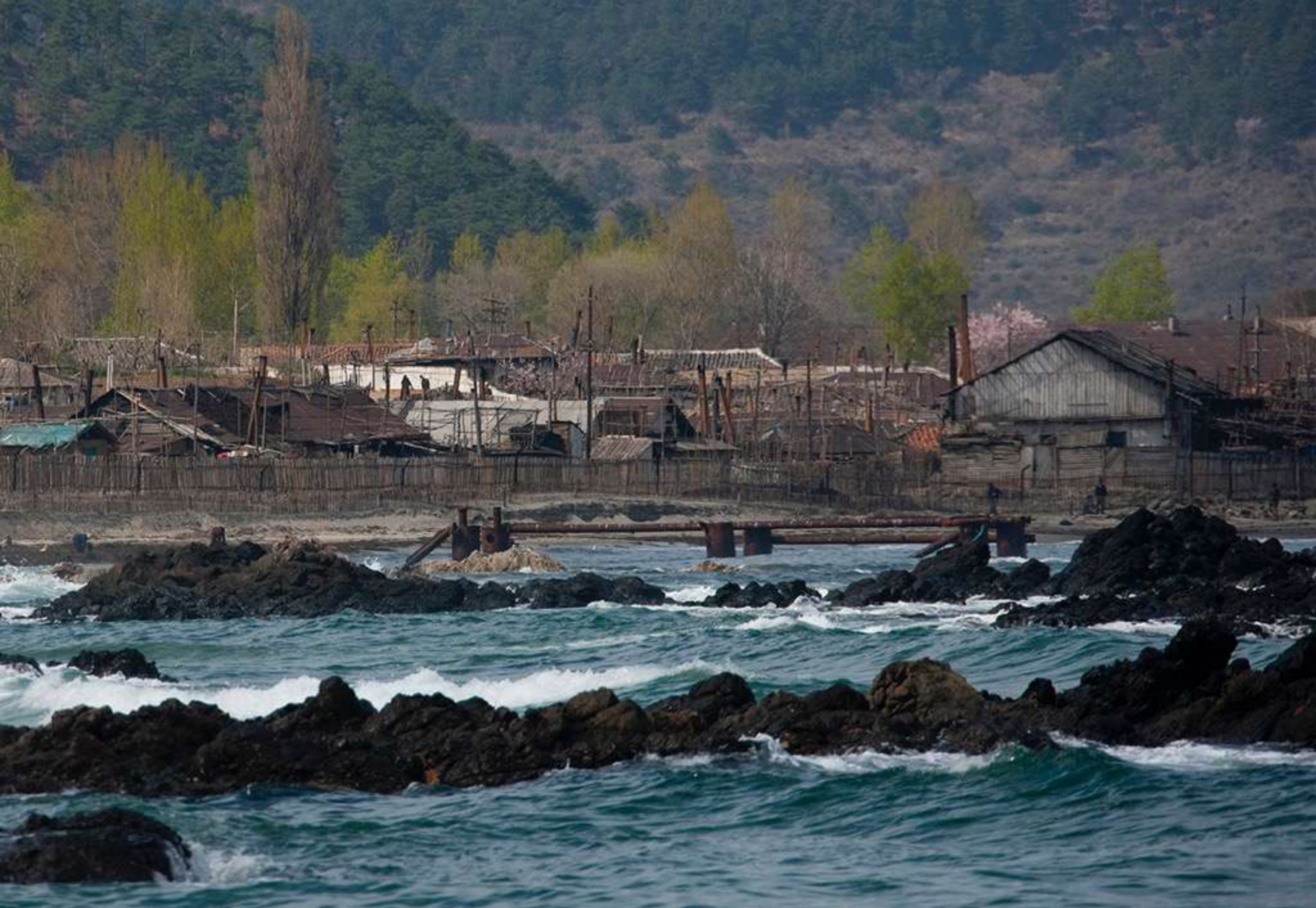
I ask my guide to go see the neighboring village but he claims that it is not worth since it's exactly the same as the one I'm currently in.