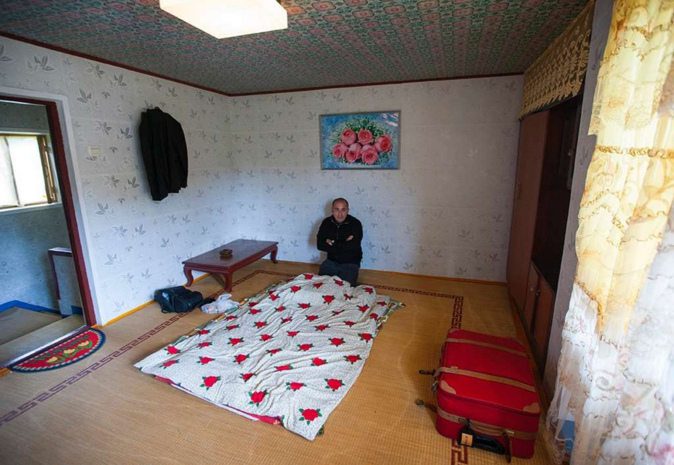
My room is quite satisfactory, very clean, with wallpaper from the 60s. It's only missing one thing: a bed. Apparently, I'm going to sleep on the floor on something resembling a very light futon.