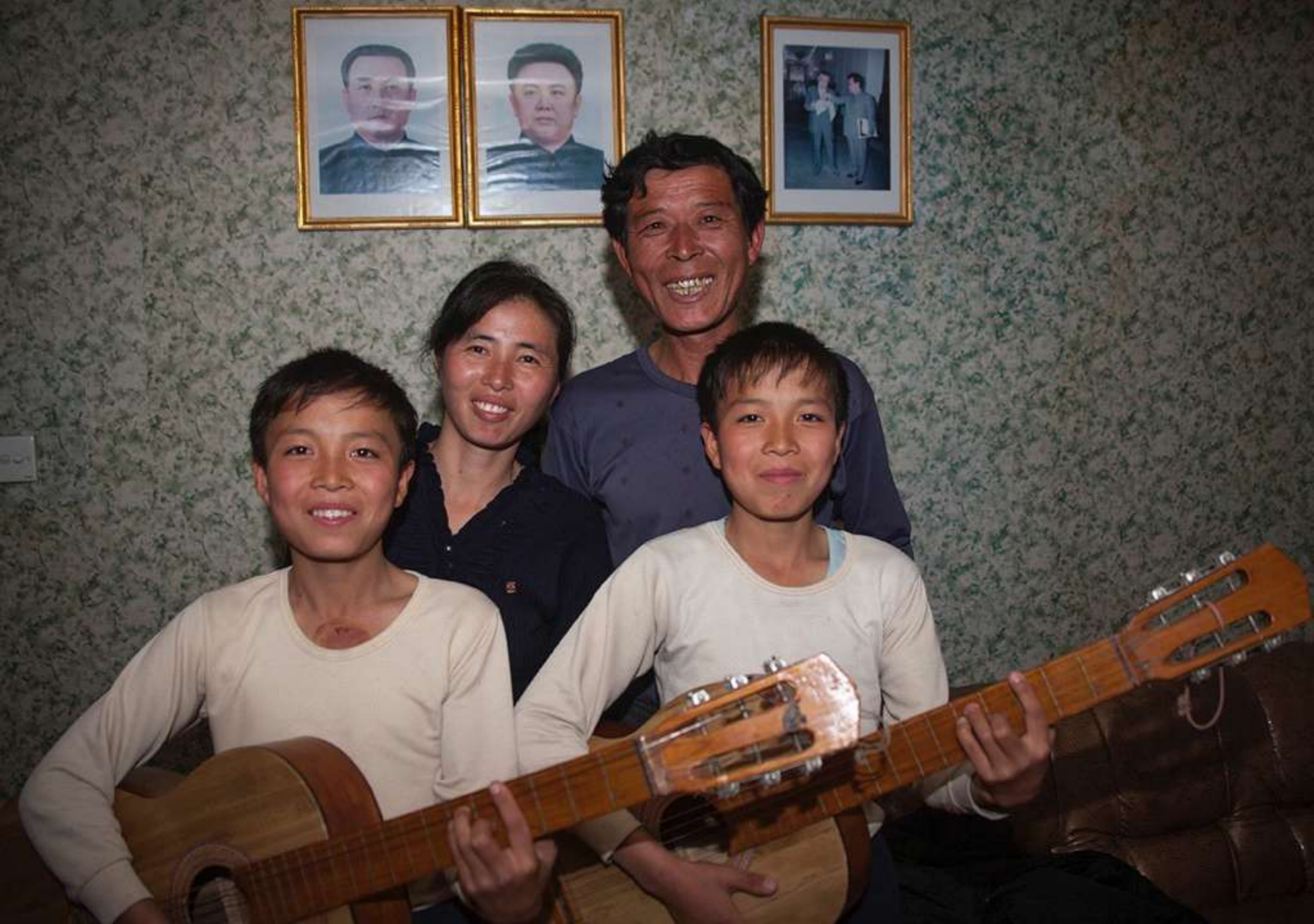
the night ends with music. Young twins perform, but their guitars strings are so old that they cannot be tuned.