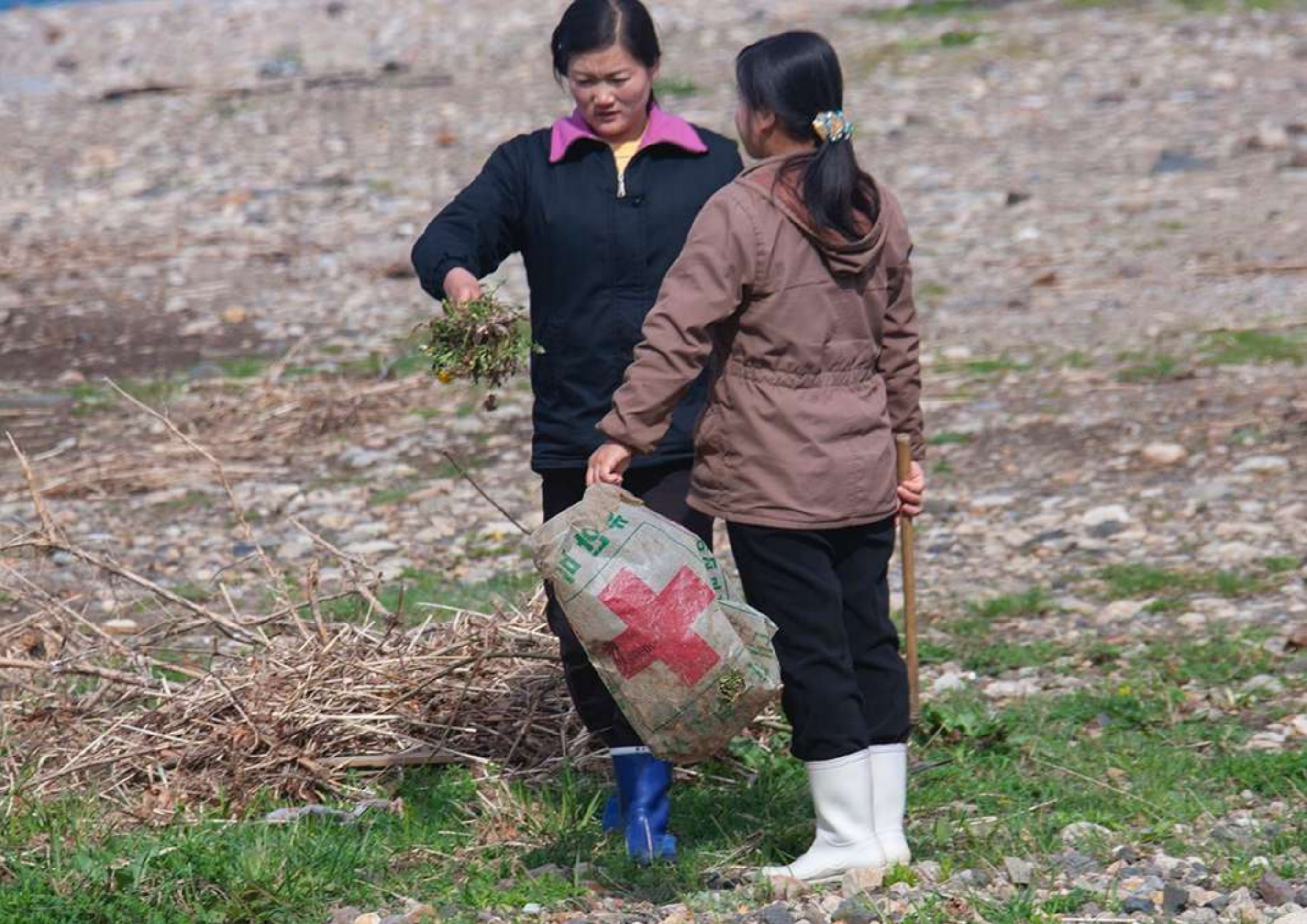
I see some girls picking grass in Red Cross bags to eat for lunch.