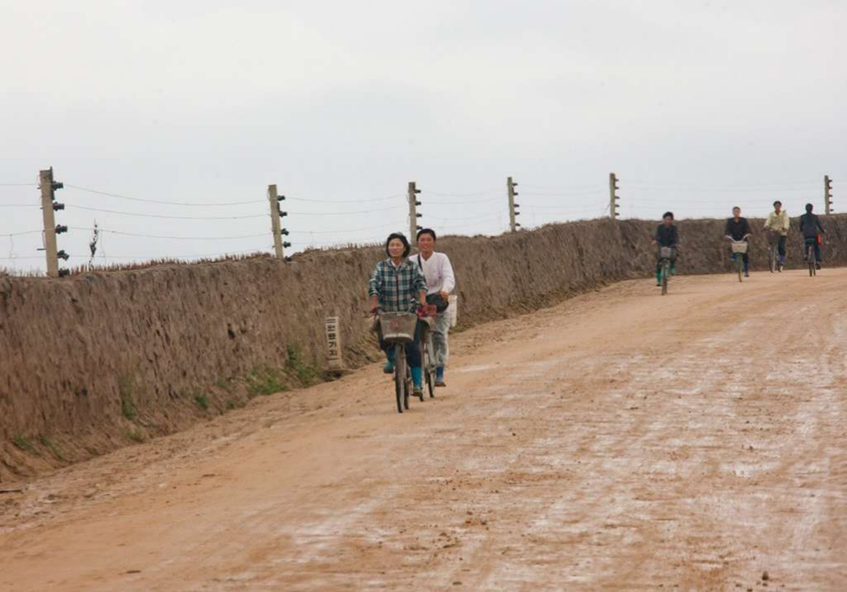
The roads on the east coast are very muddy and filled with potholes that workers have tried their best to fix. . I see an electric fence lining the beach as an attempt to stall possible Japanese invasion.