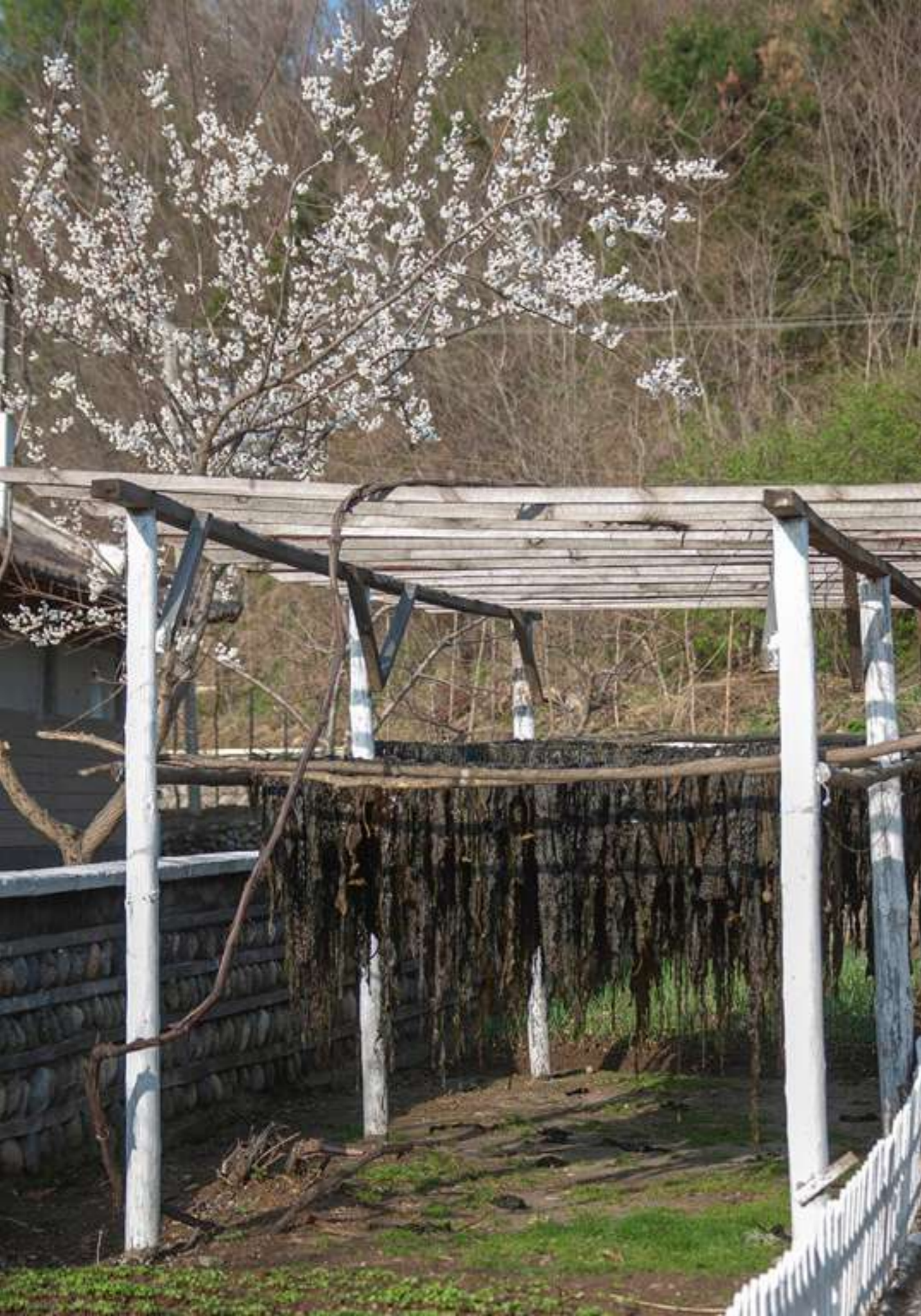
Drying weeds in the garden