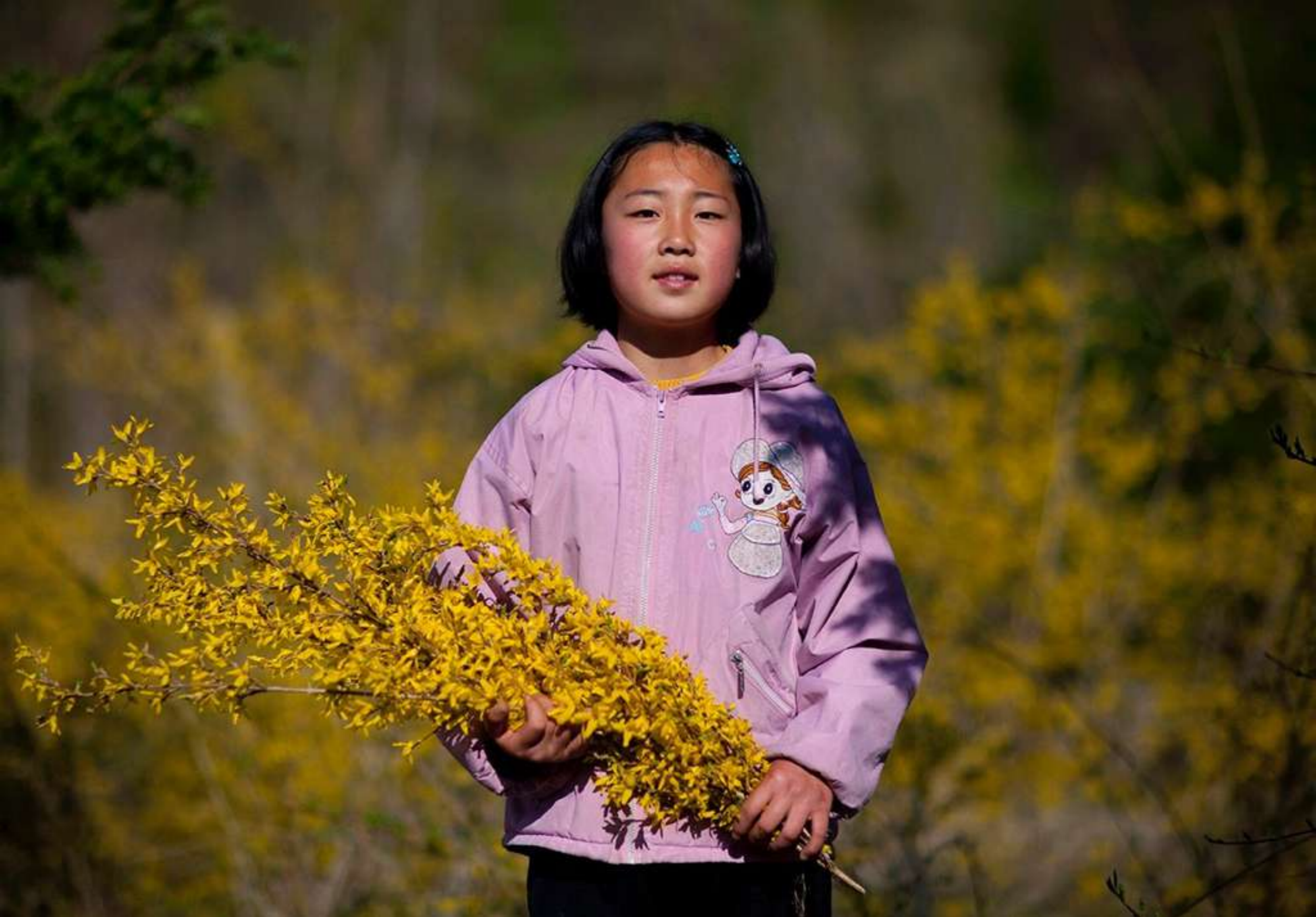
I also see girls picking flowers for a bouquet