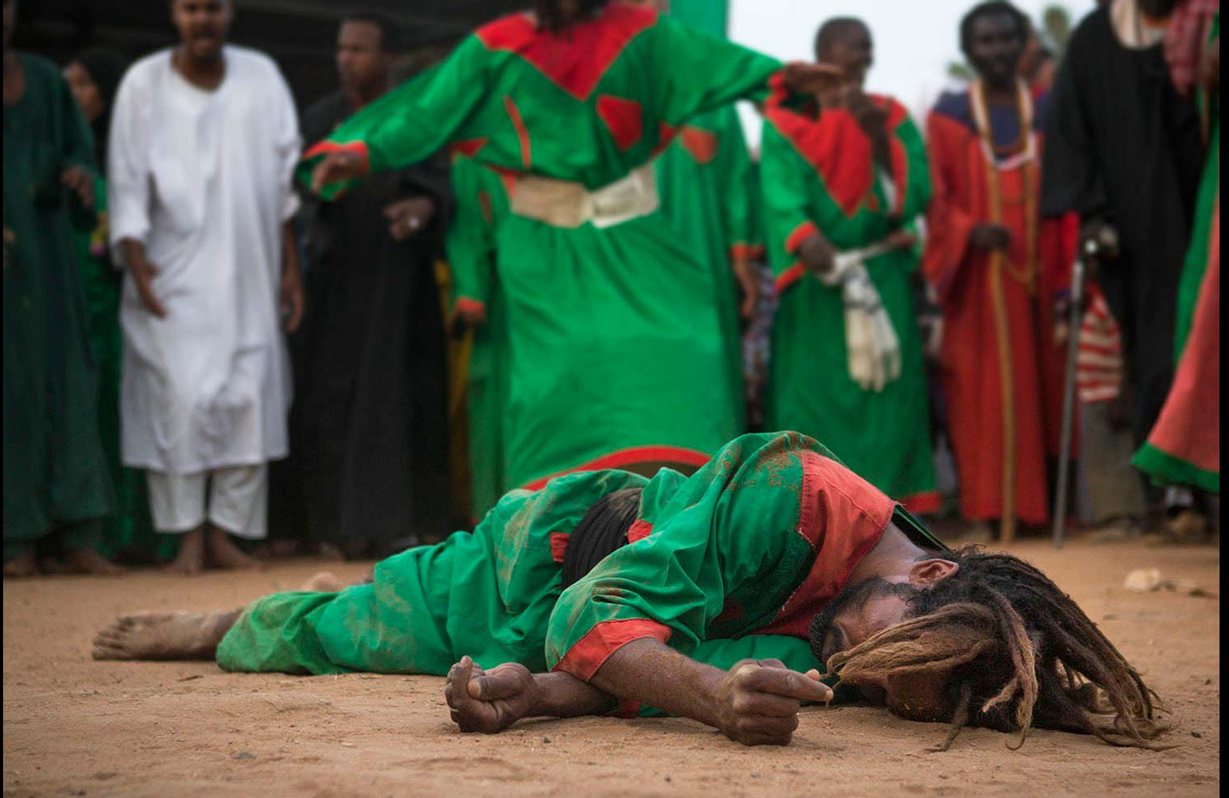
The sufis start spinning, arms spread out wide, and their eyes half closed. They will do so until they wear out, under the spell of devotion and egged on by the crowd's cheers...until they collapse!