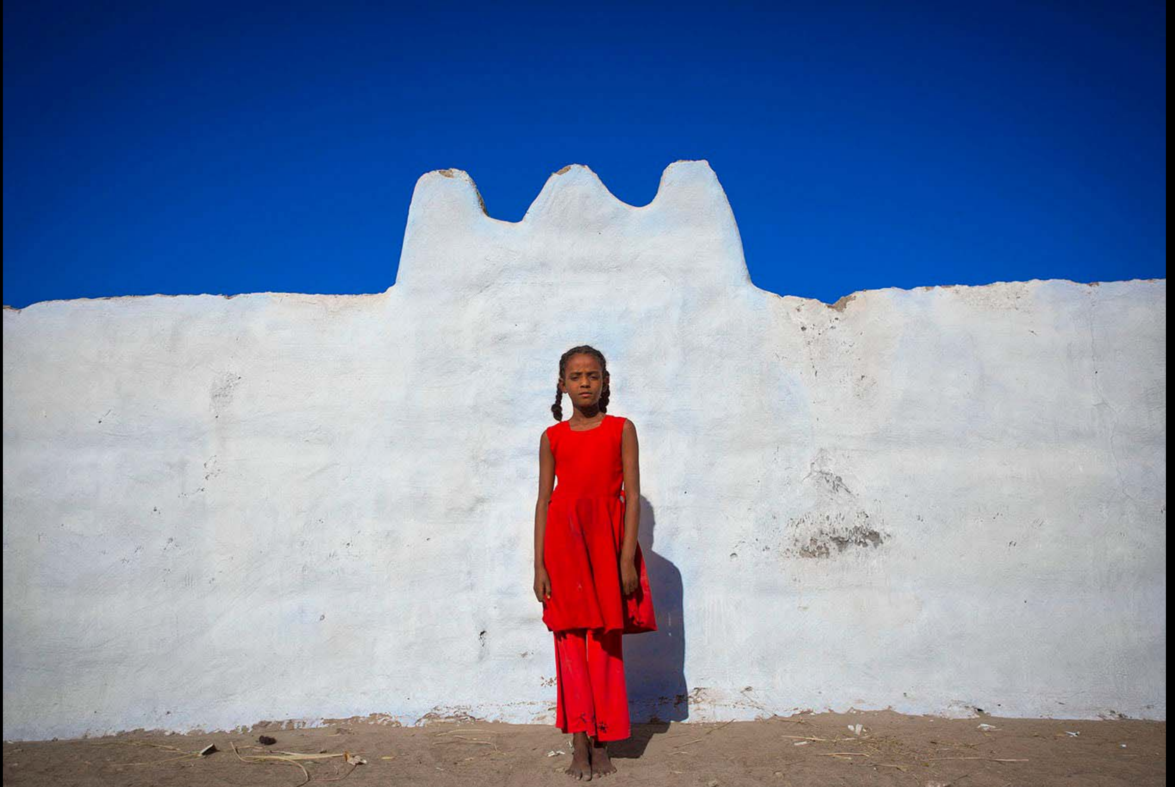
Nubian houses. They are short and split into two: one side for men and guests, the other side for women.