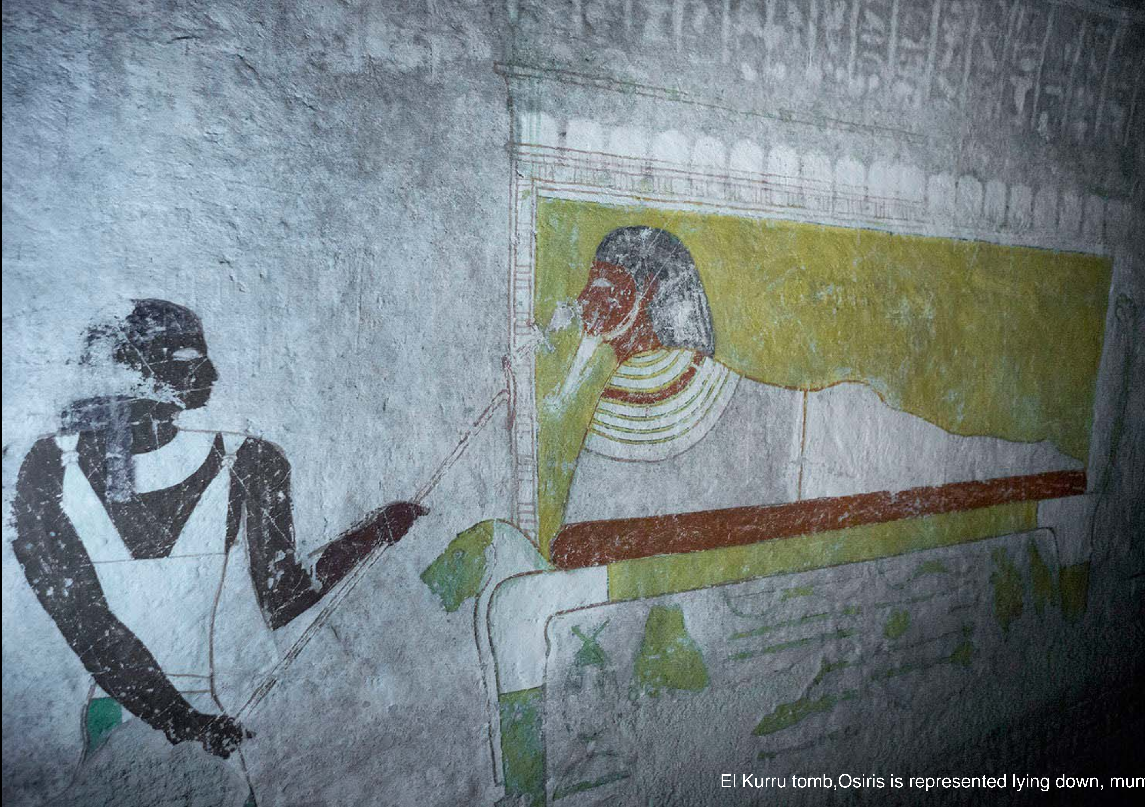
El Kurru tomb, Osiris is represented lying down, mummified.