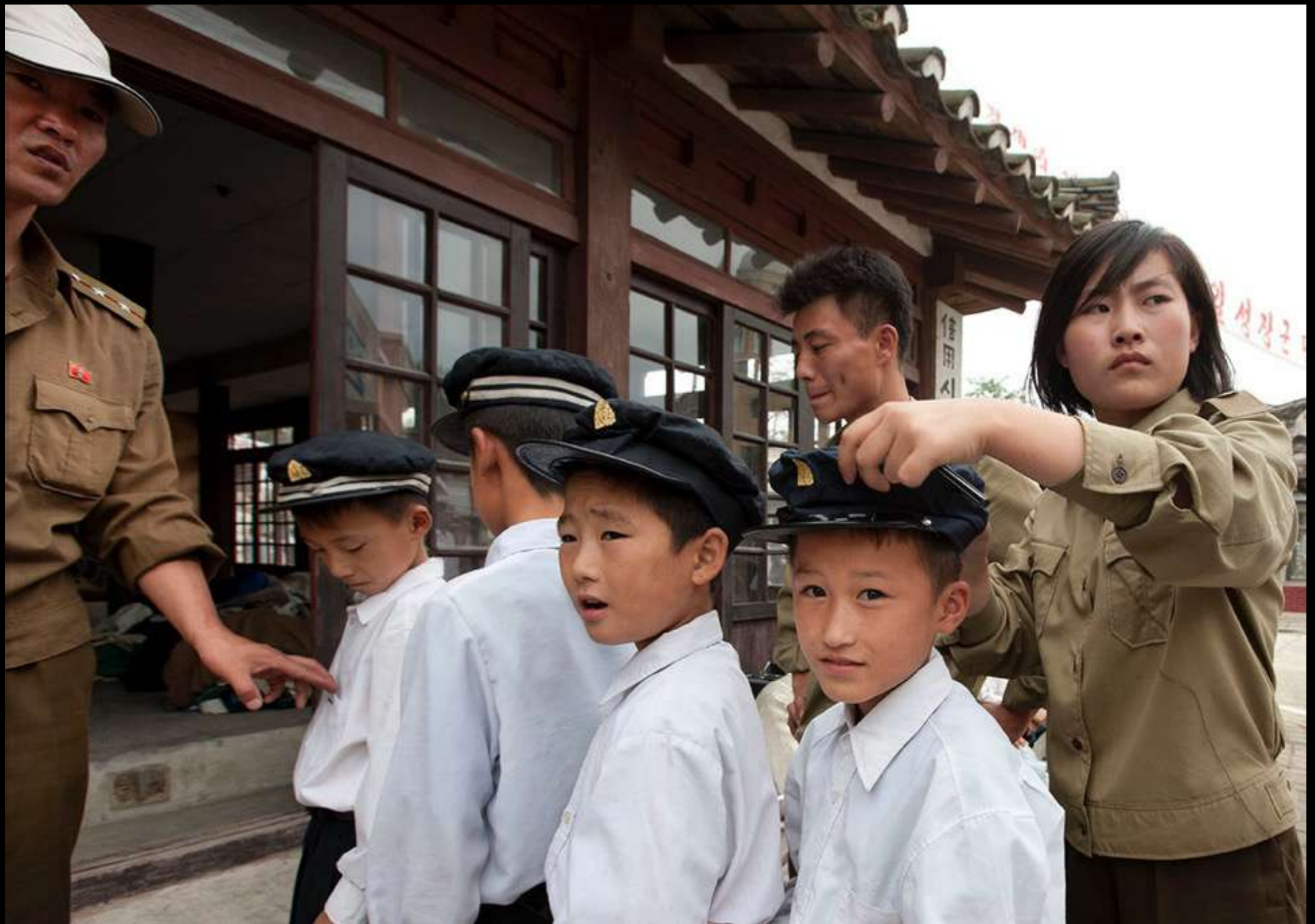
A variety of people are acting in this particular movie. Schoolchildren dress in uniforms from the past.