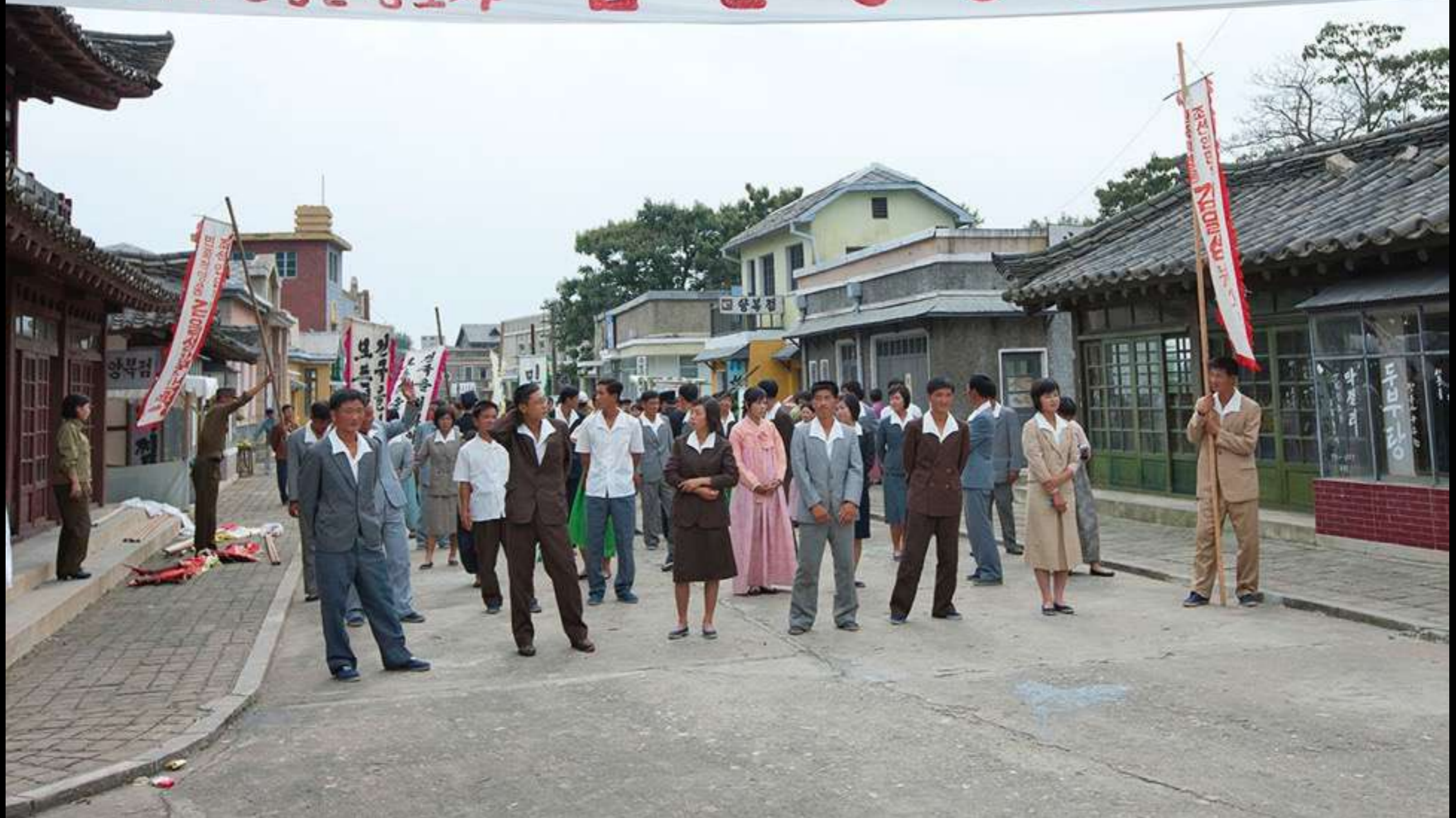
The only protests in North Korea take place in the movies!