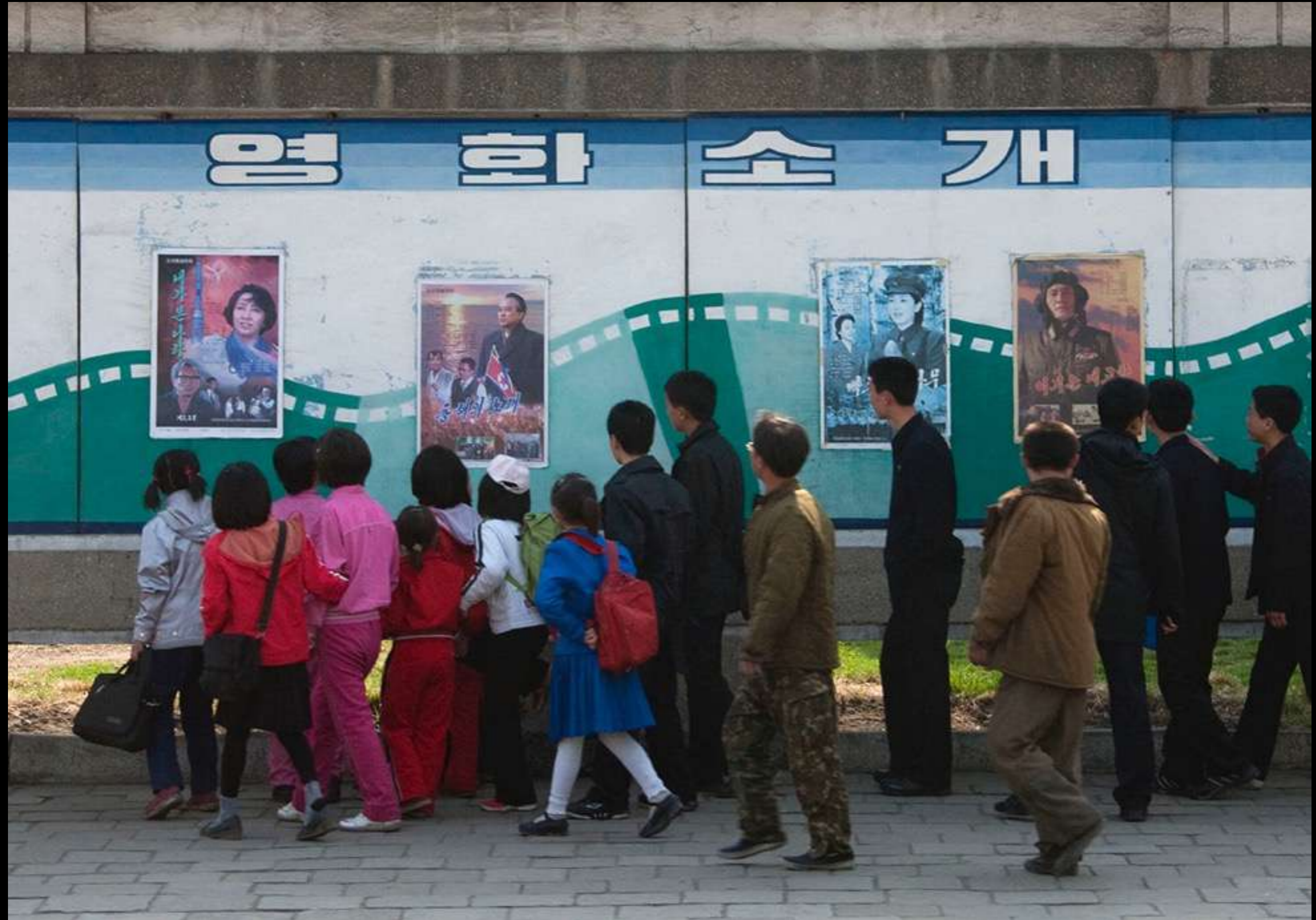
I am always surprised to see people staring at these panels since they hardly ever change. Perhaps they look at them hoping for something new.