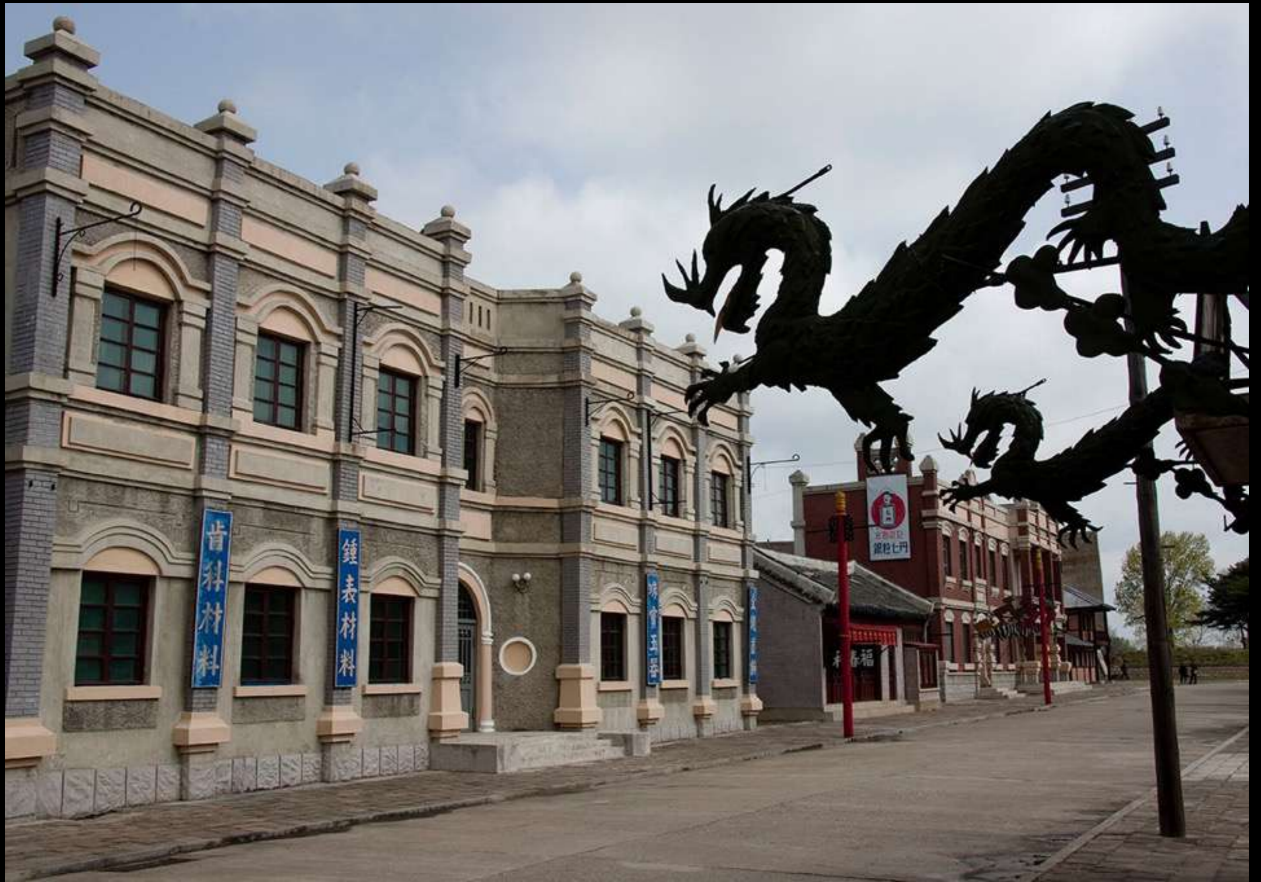
The Chinese Quarter at the Korean Film Studio in Pyongyang.