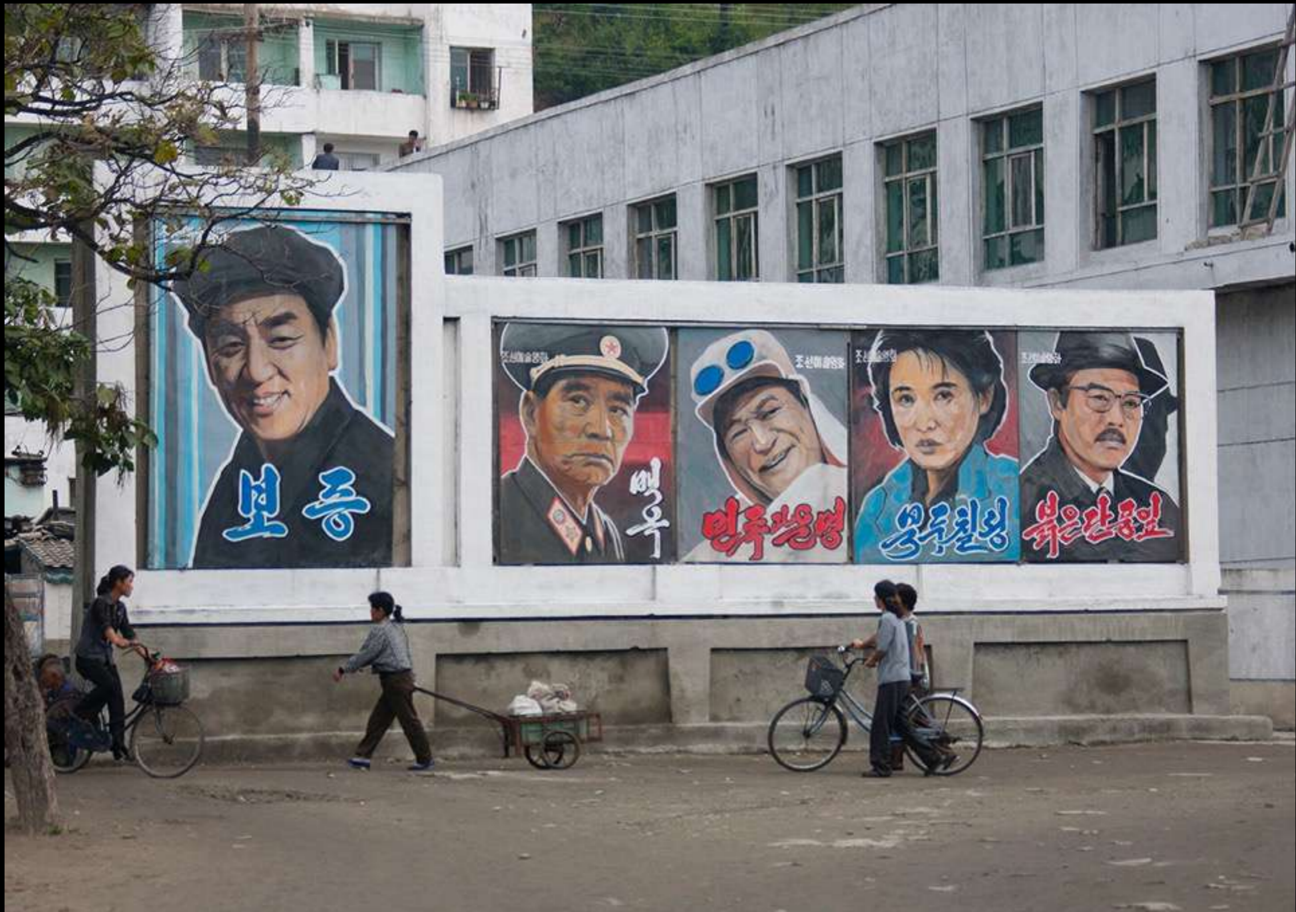
Easy to guess who are the good guys and the villains.