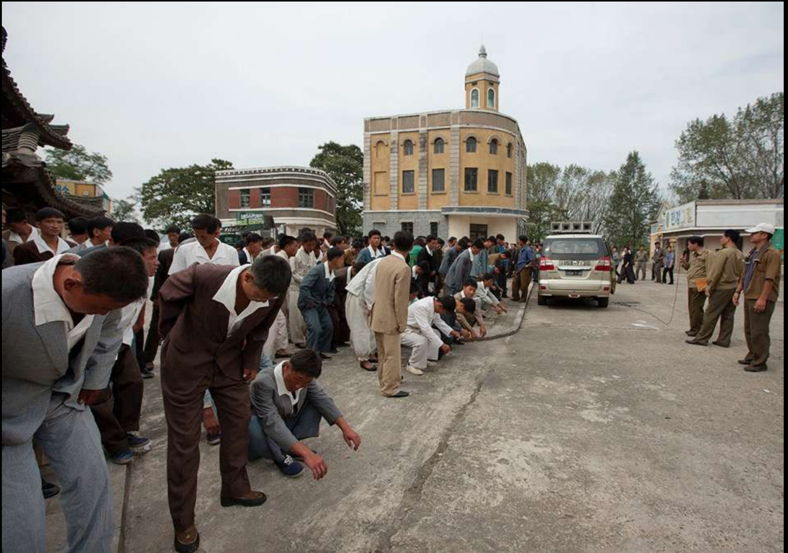
It is said that Kim Jong Il visited the Pyongyang Film Studio more than 600 times. Here, they are shooting a movie shooting with hundreds of actors.