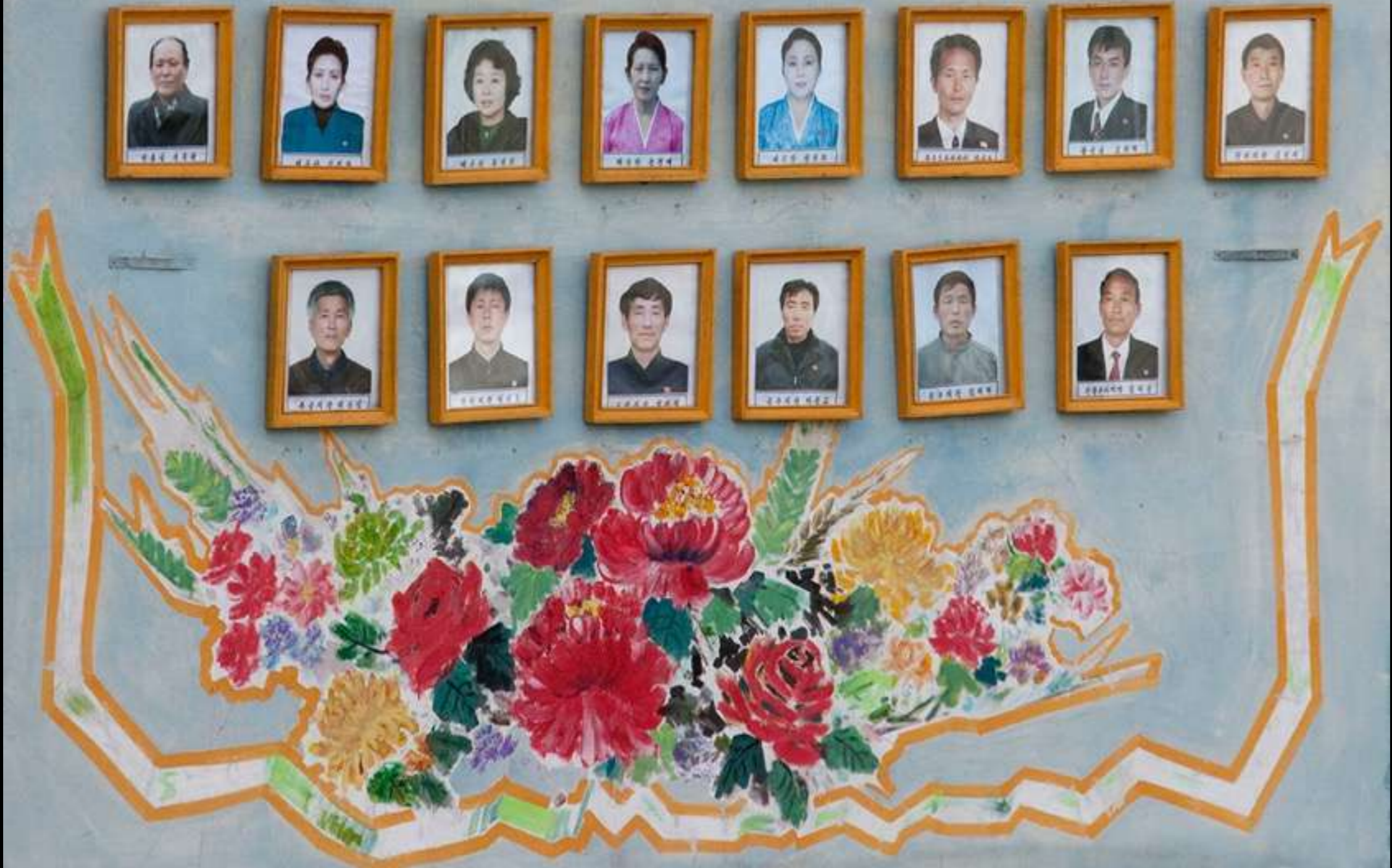
A billboard at the entrance of Chollima studios shows the best actresses of the year, a kind of North Korean Oscars. The difference is that the actors are all employed by the state!