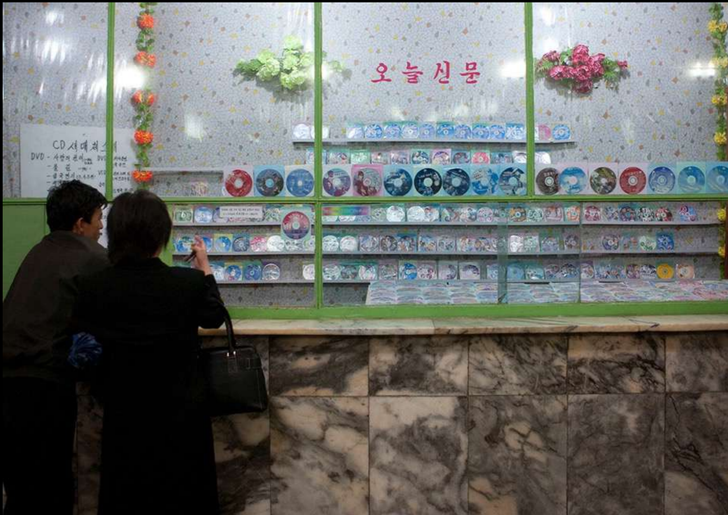
A DVD shop in the subway. As more and more North Koreans have DVD players, they also manage to get foreign movies.