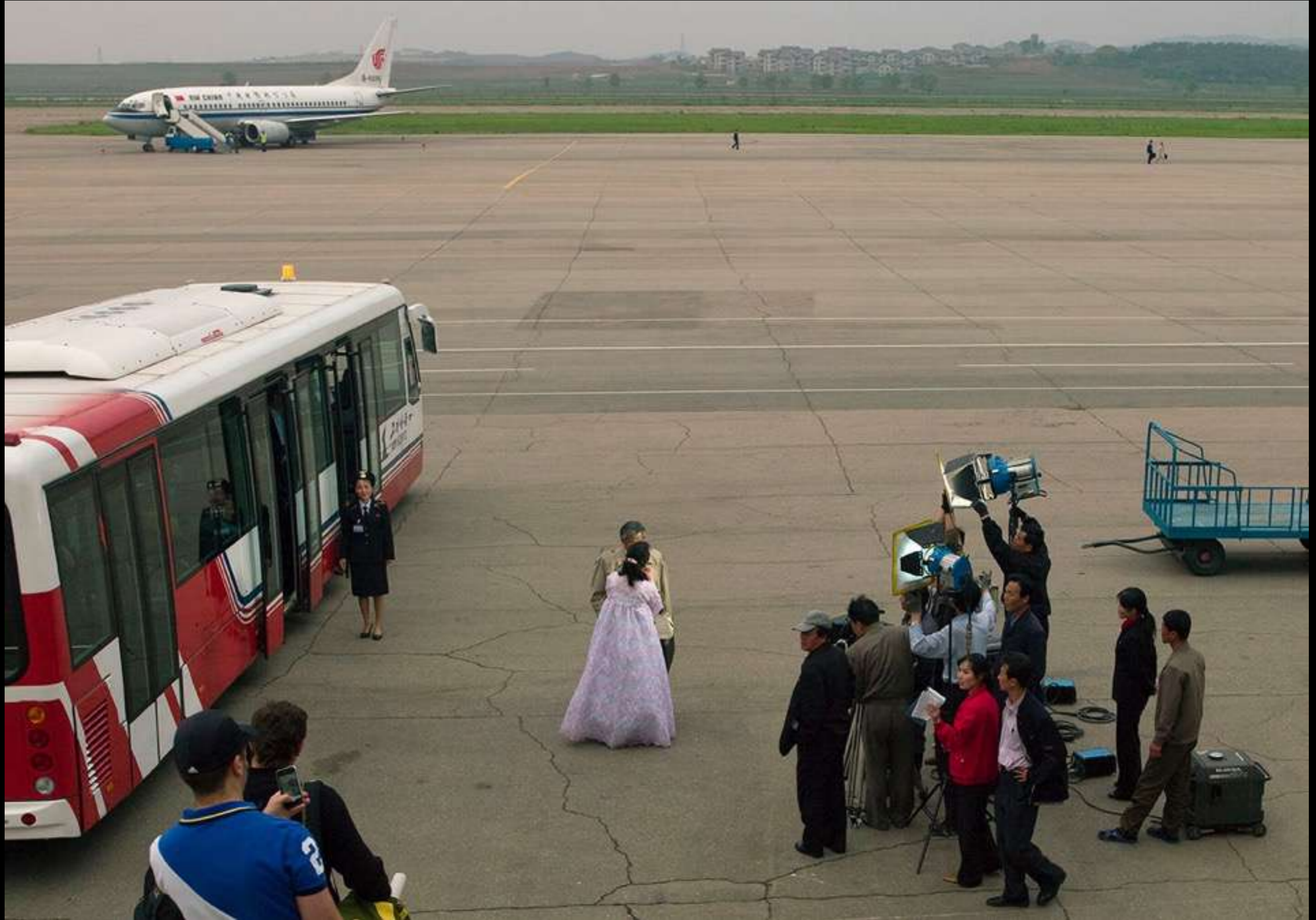
Shooting a movie at the Pyongyang International Airport. I was on my way out of the country when I was asked to wait in the lounge and then to go down the stairs very slowly. I discovered I was an extra in a film! They like to include tourists in the movies.