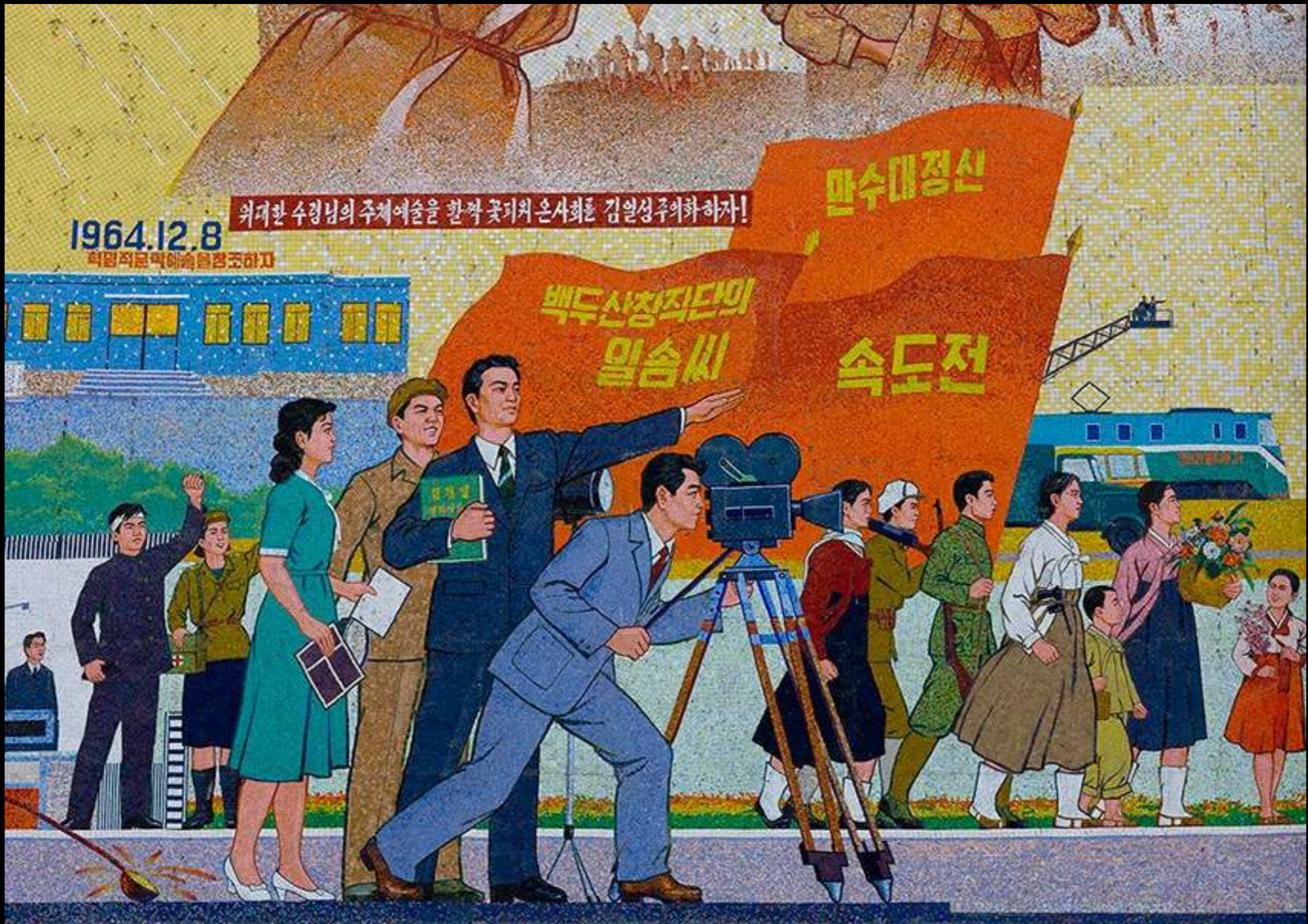
Chollima Movie Studio, North Korea - a giant fresco welcomes the visitors.