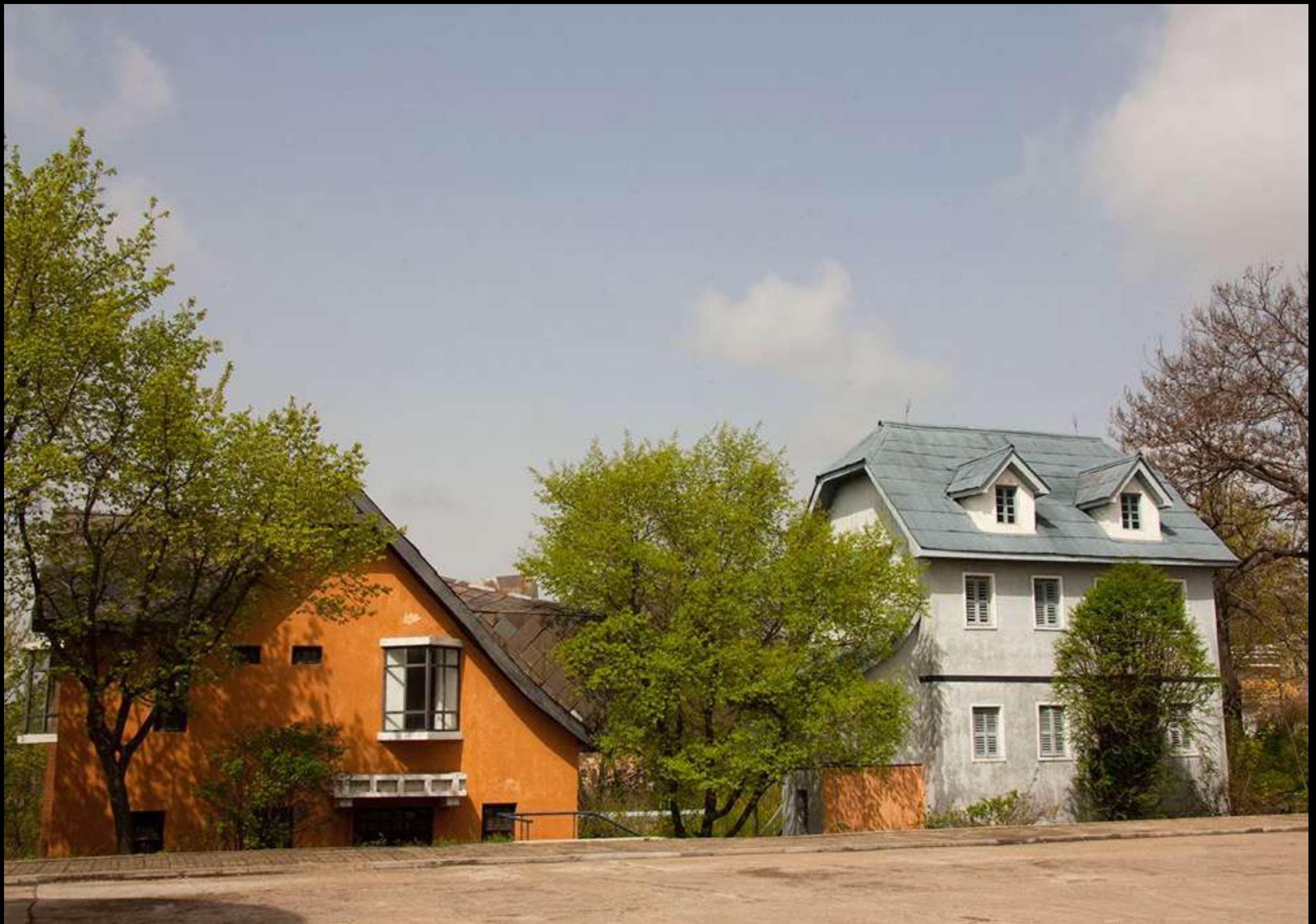
English cottages at the Korean Film Studio in Pyongyang.