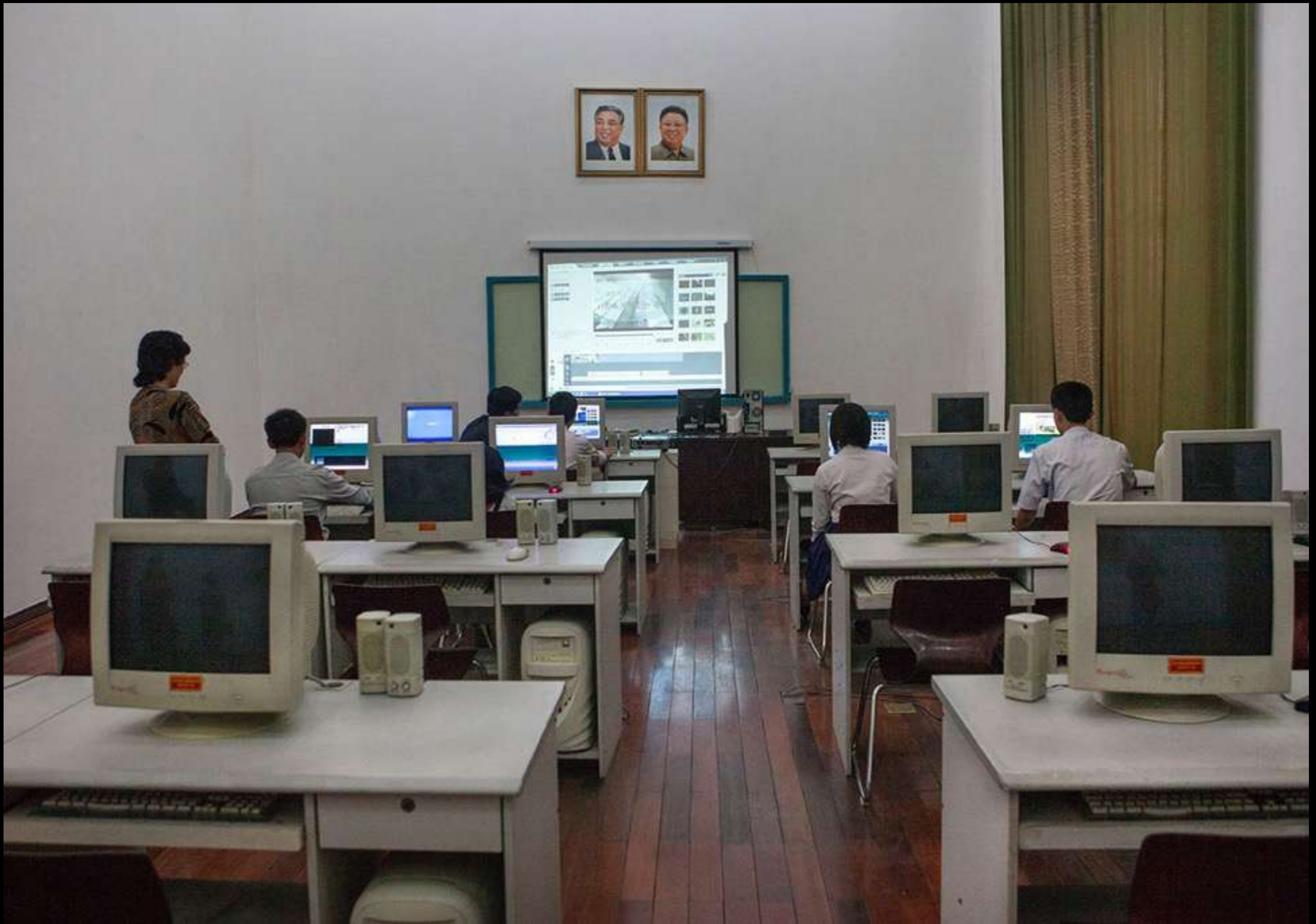
Video Editing class In Mangyongdae Palace, Pyongyang.