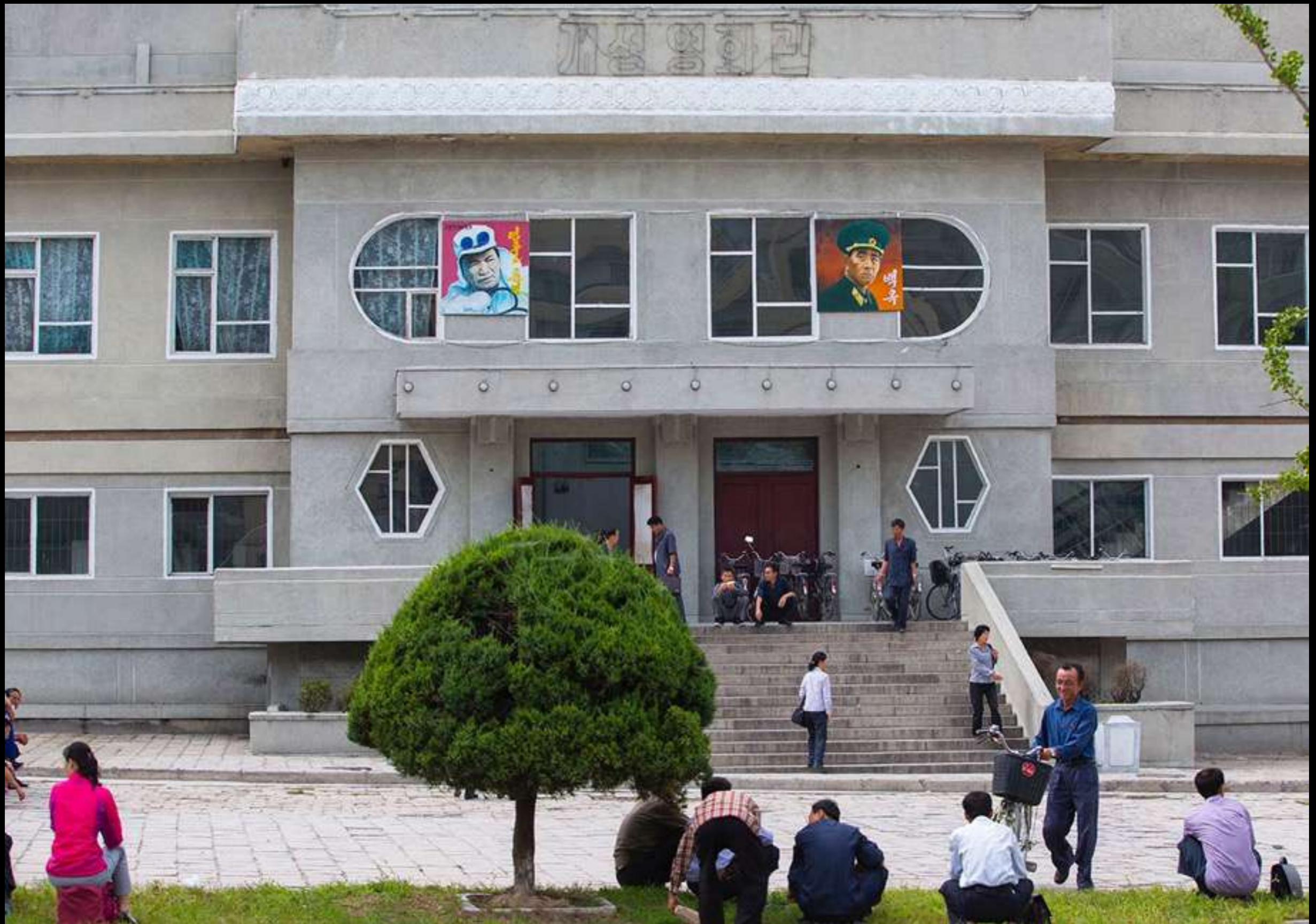
A movie theatre in the countryside. Usually, the people do not pay any entrance fees. Since there are not many opportunities for recreation and fun in the remote areas, the films are shown for free. My guide told me that it can sometimes be tough to get into the theaters since so many people want to see the movie. Some must stand during the picture as all the seats are occupied.