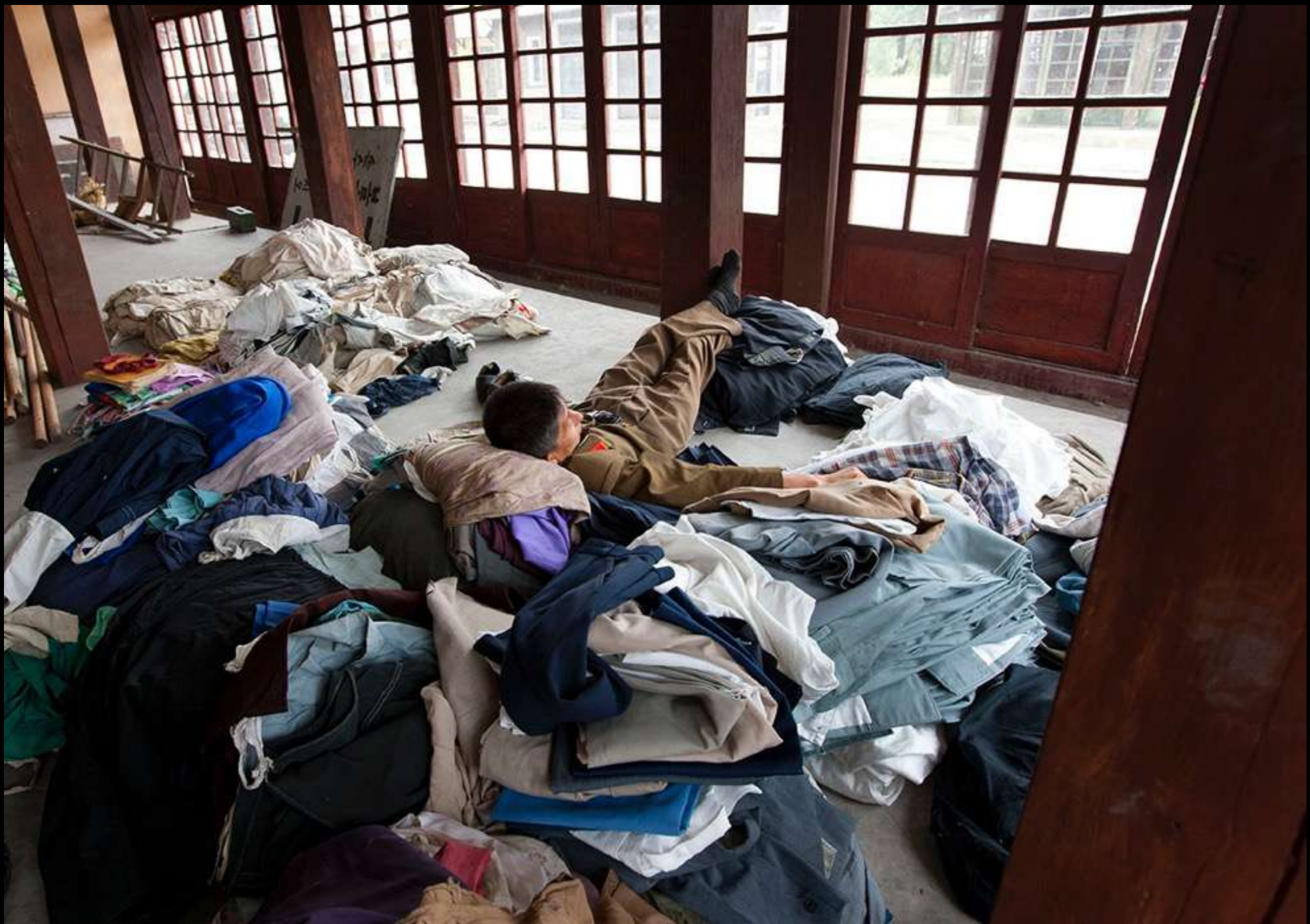
The cloakroom of the movie set. A soldier (real or fake, hard to say in North Korea) takes rest. This was one of the photos that got me banned from the country!