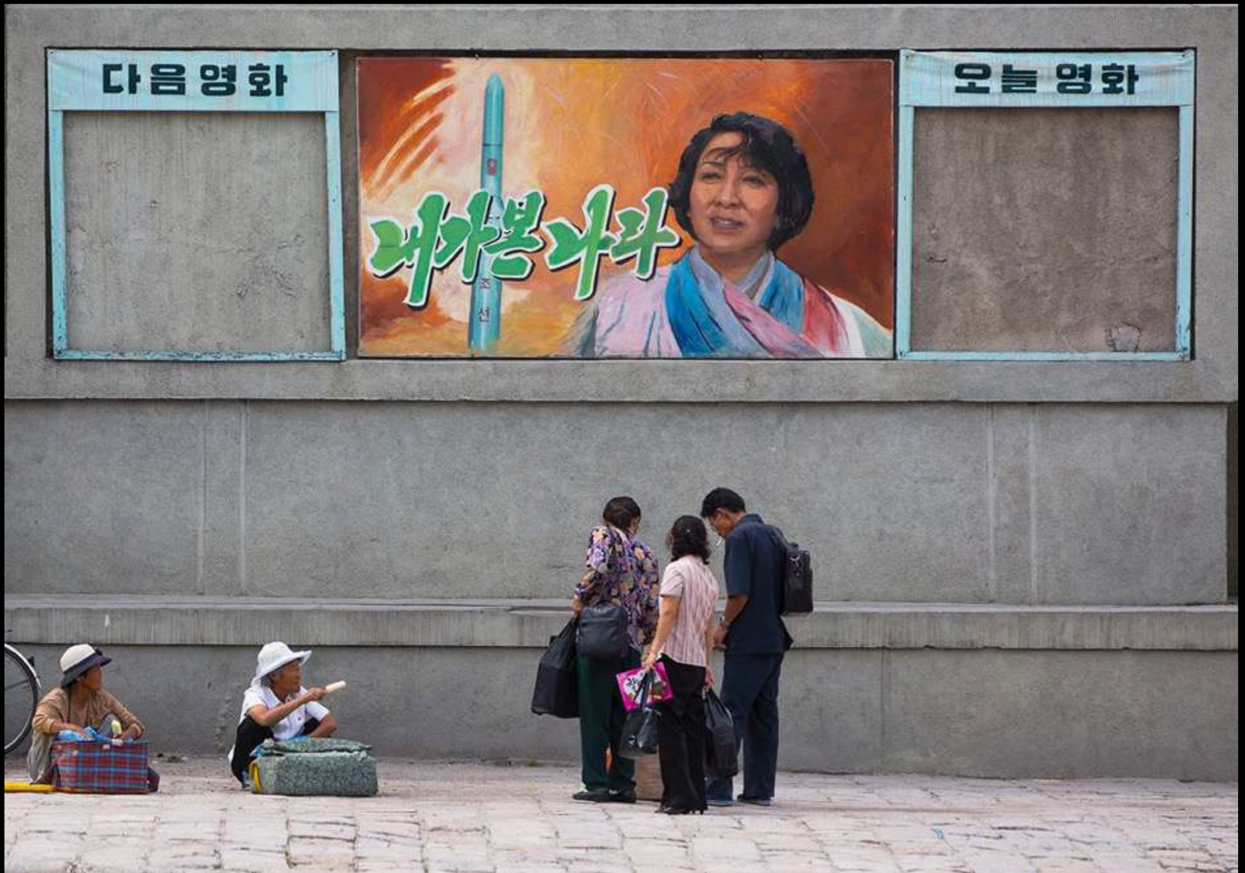
In the southern city of Kaesong, the movie “posters” are painted on the walls, and will stay up for a long time. The women selling ice cream are not from the movie theatre.