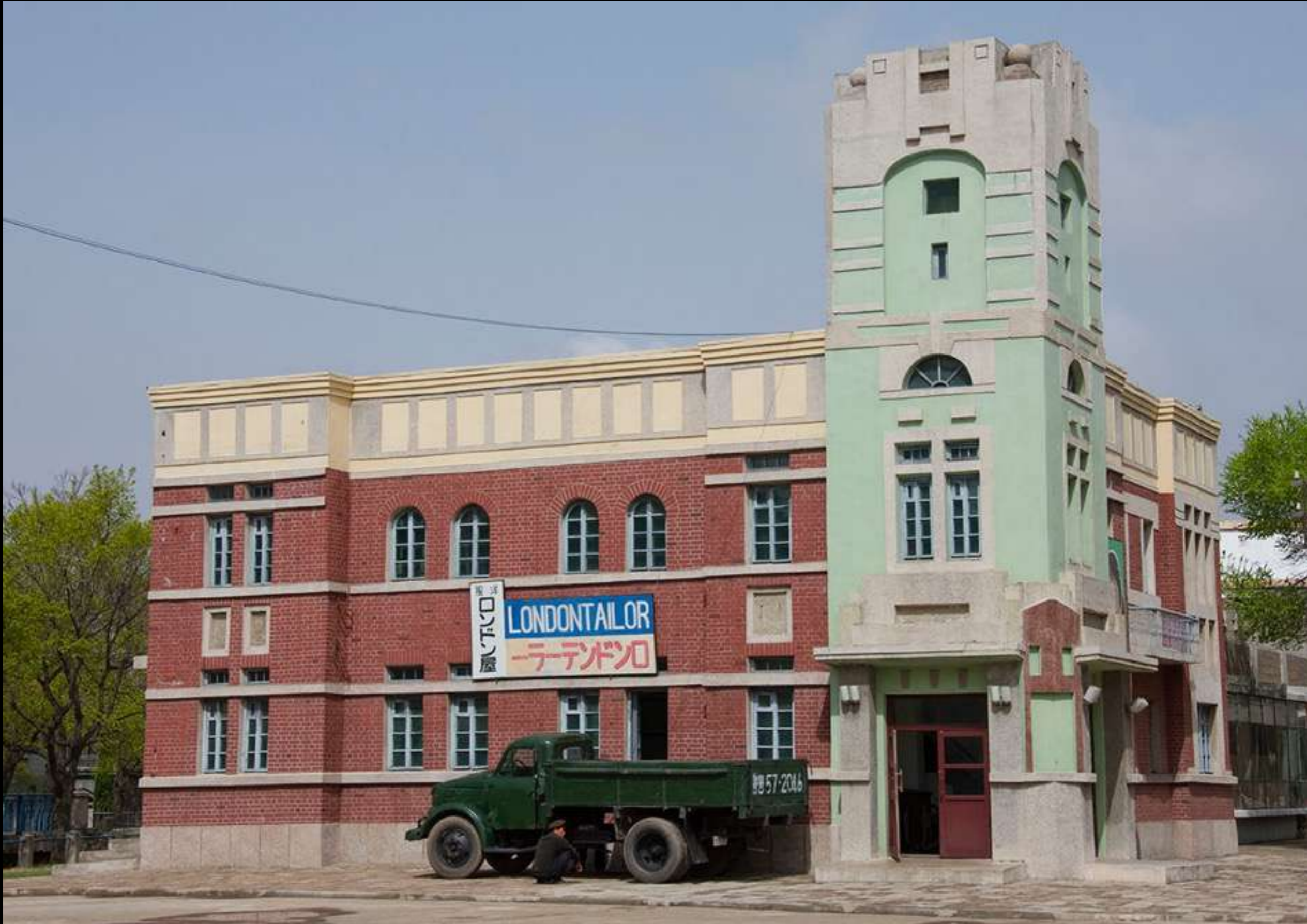
Korean Film Studio in Pyongyang North Korea. All the revolutionary and historical movies shown on DPRK TV and in cinemas around the country are made here. Tourists can visit the mock-up sets of various countries and periods (English cottages, Japanese bars, the Chinese quarter, etc).