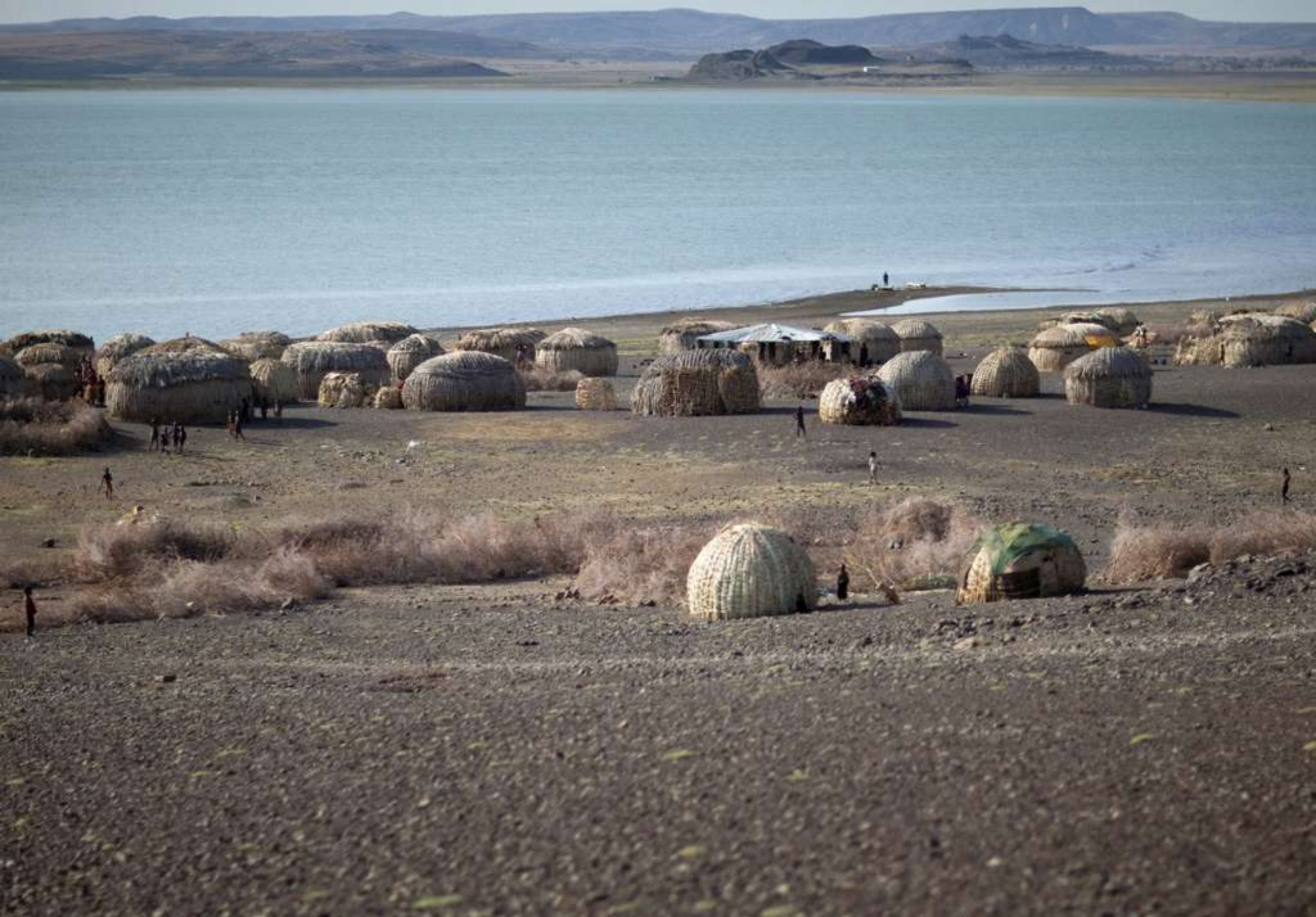
The El Molo live around Lake Turkana, the largest desert lake in the world. The El-Molo are the smallest ethnic group in Kenya, numbering only 200 pureblooded people. They are the shortest and poorest of Kenya's ethnic groups.