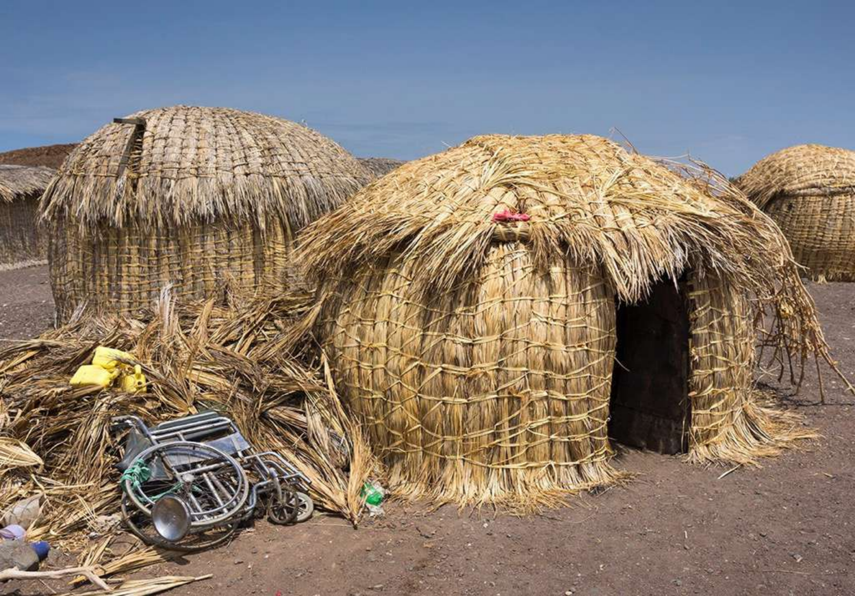
Salty alkaline water from the lake, malnutrition, and unbalanced protein-rich diets result in an array of health issues for the El Molo. There are many with bone deformities, even children.