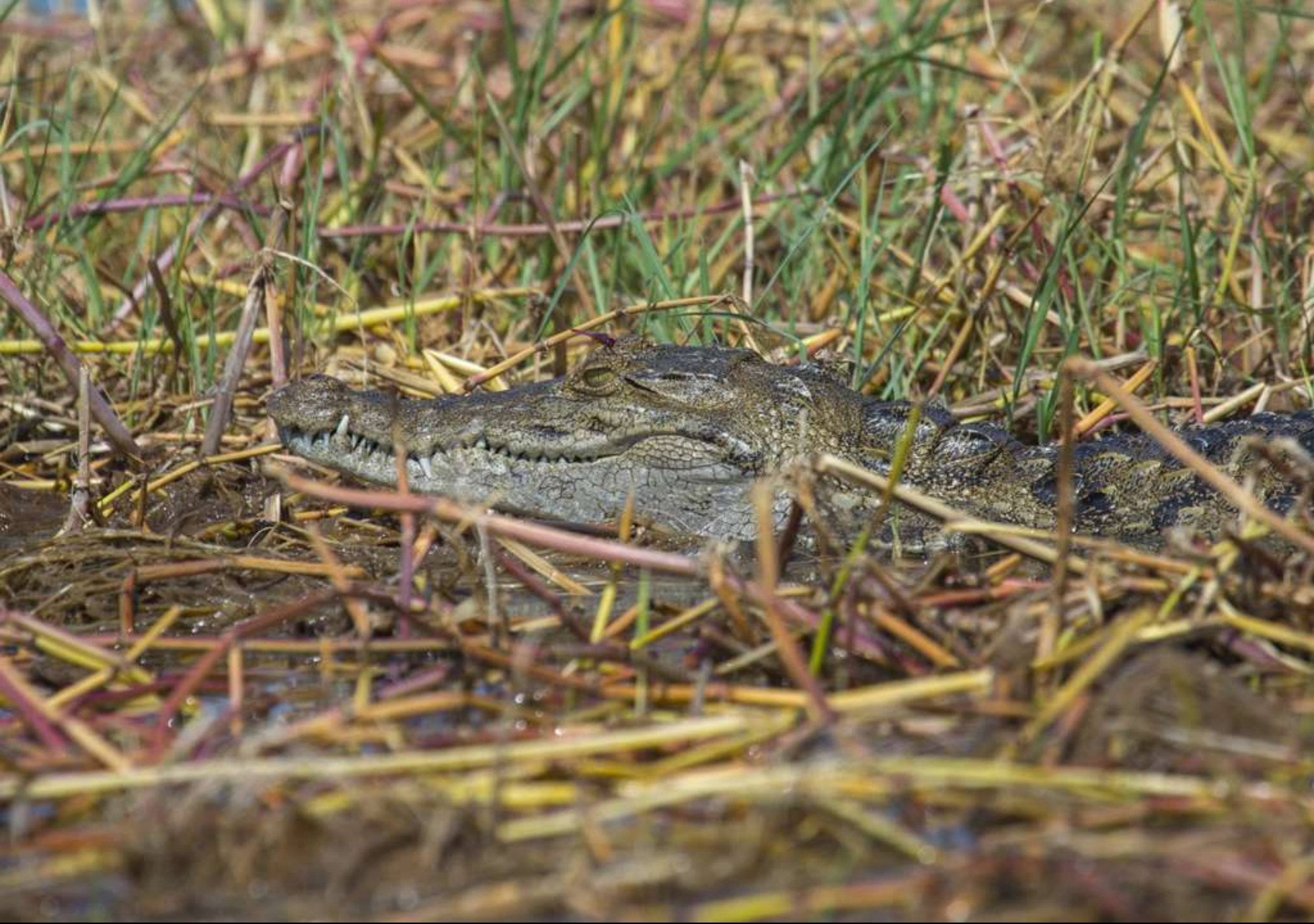
The El Molo sometimes eat crocodile meat, especially when they are entertaining guests. There are 10,000 crocodiles in the lake and accidents still happen when the El Molo men go fishing.