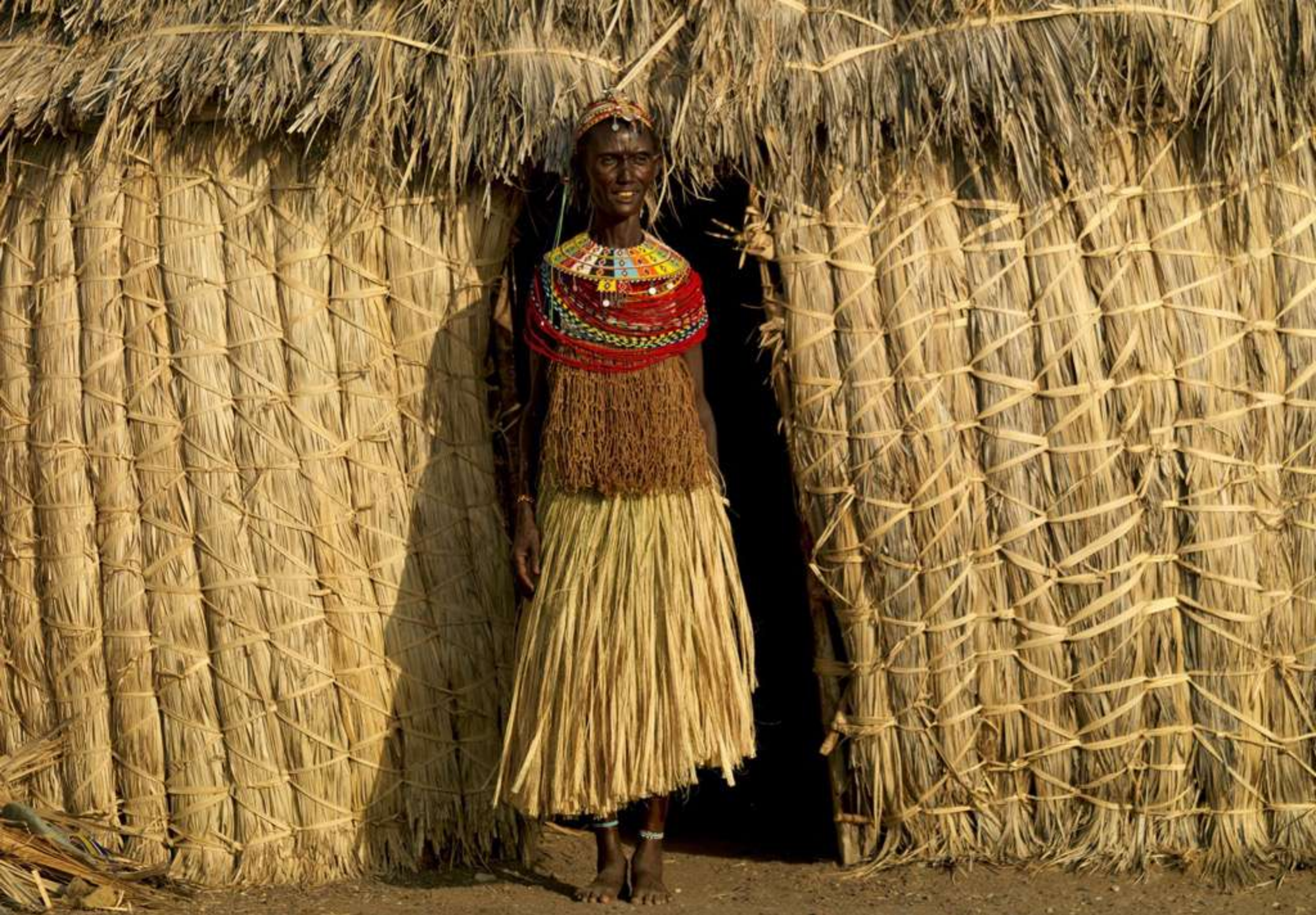
They have always been a peaceful, quiet, and non-violent - unlike their neighbors. They are against killing people and raiding for cattle. They are now gathered into two villages, Anderi and Illah, with 200 and 100 inhabitants respectively.