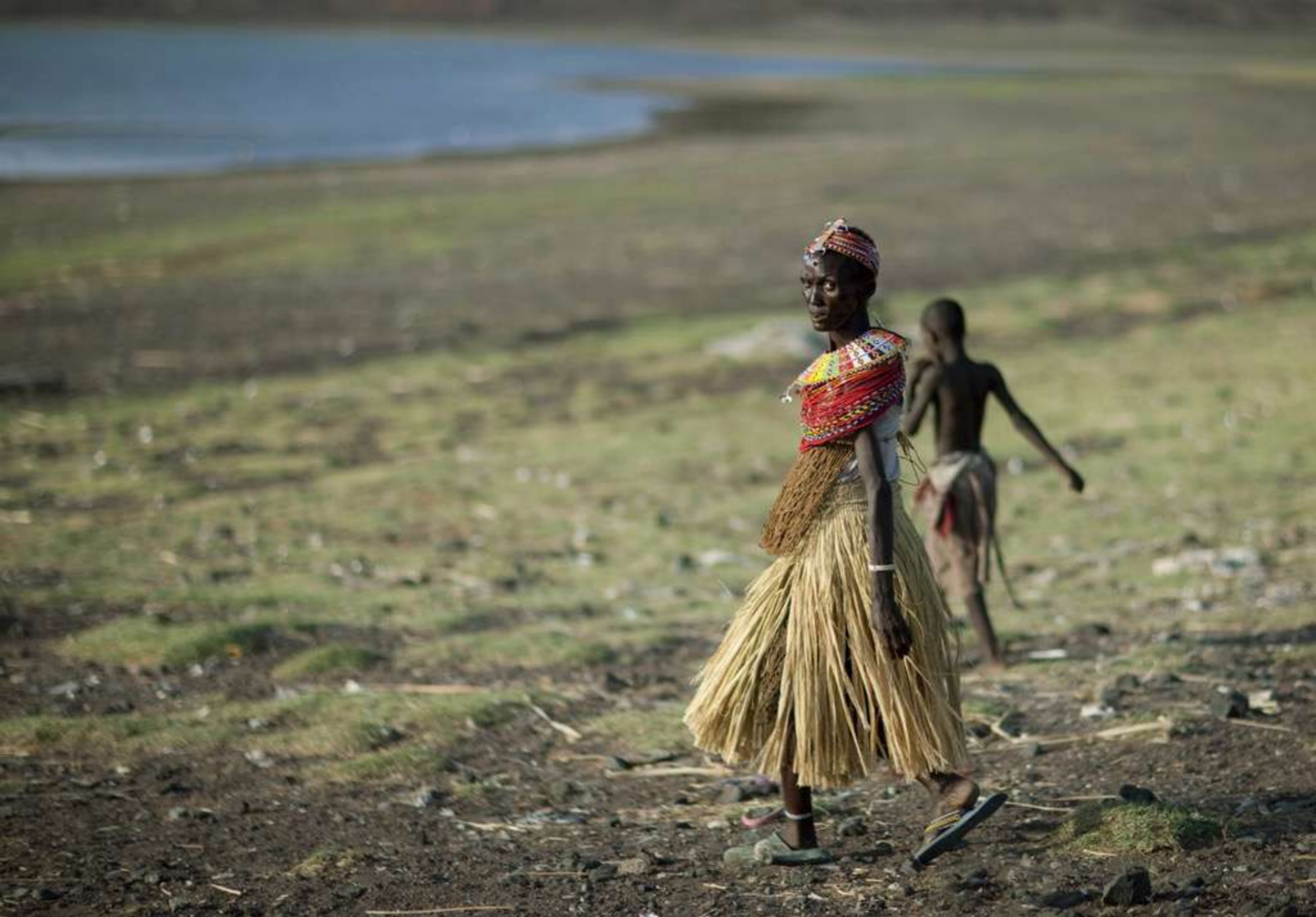
The El Molo language is now extinct. The last man to speak it died in 1974. They had 8 words just for the wind. Researchers trying to rebuild the language have recorded 600 words.