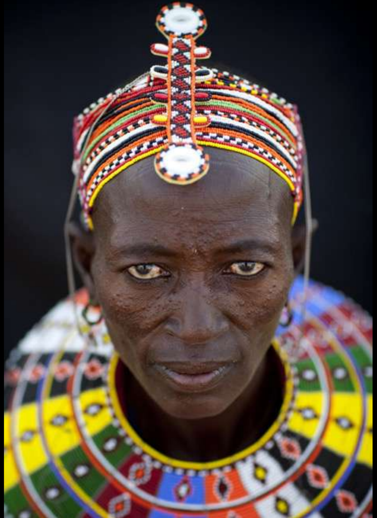
The El Molo wear necklaces and bracelets made of colored beads. Nowadays, only the elders dress in a traditional way.