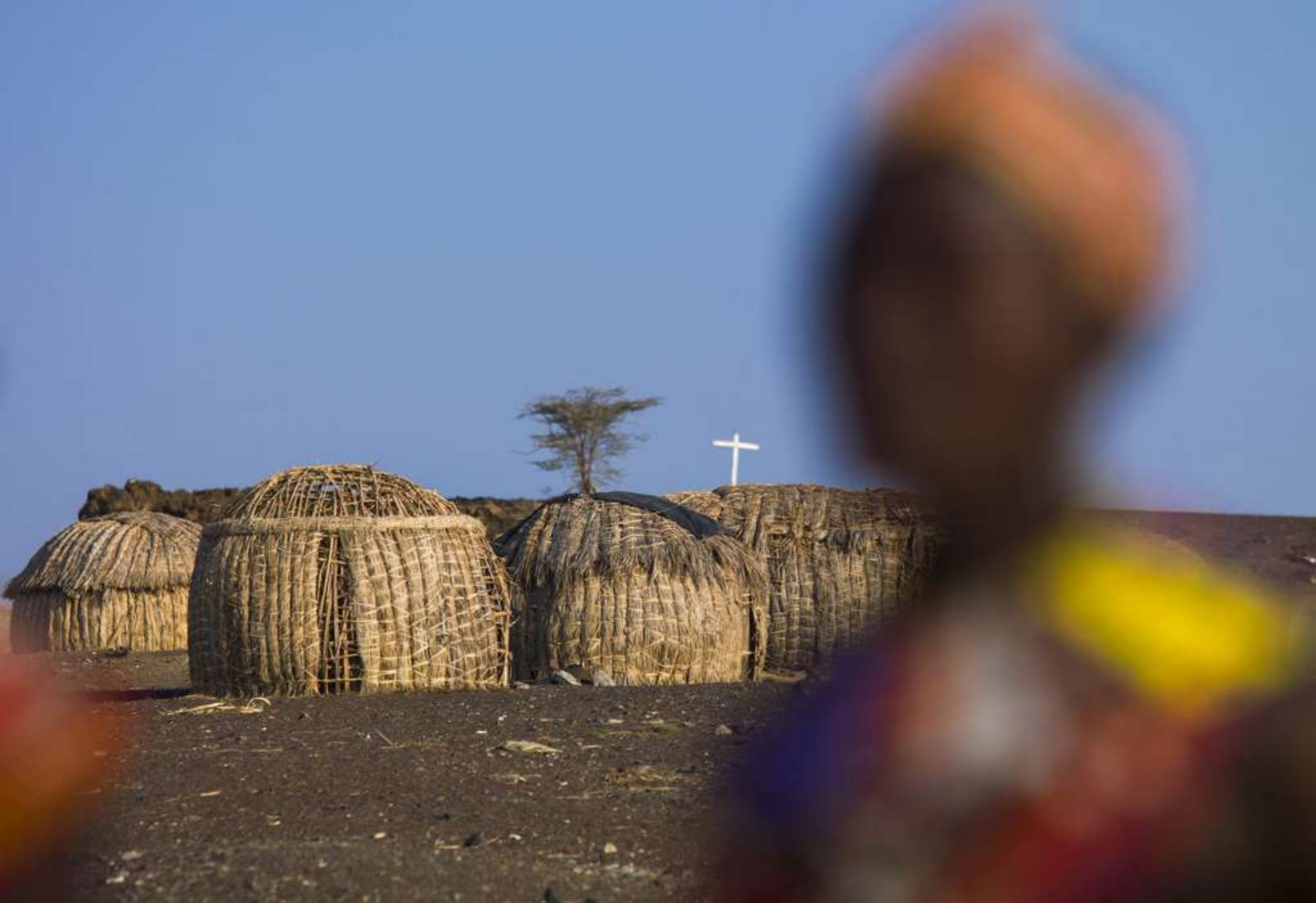
They all became christians in the 60s when the missionaries arrived. This protected them from the pastoralist enemy tribes who were constantly invading them.