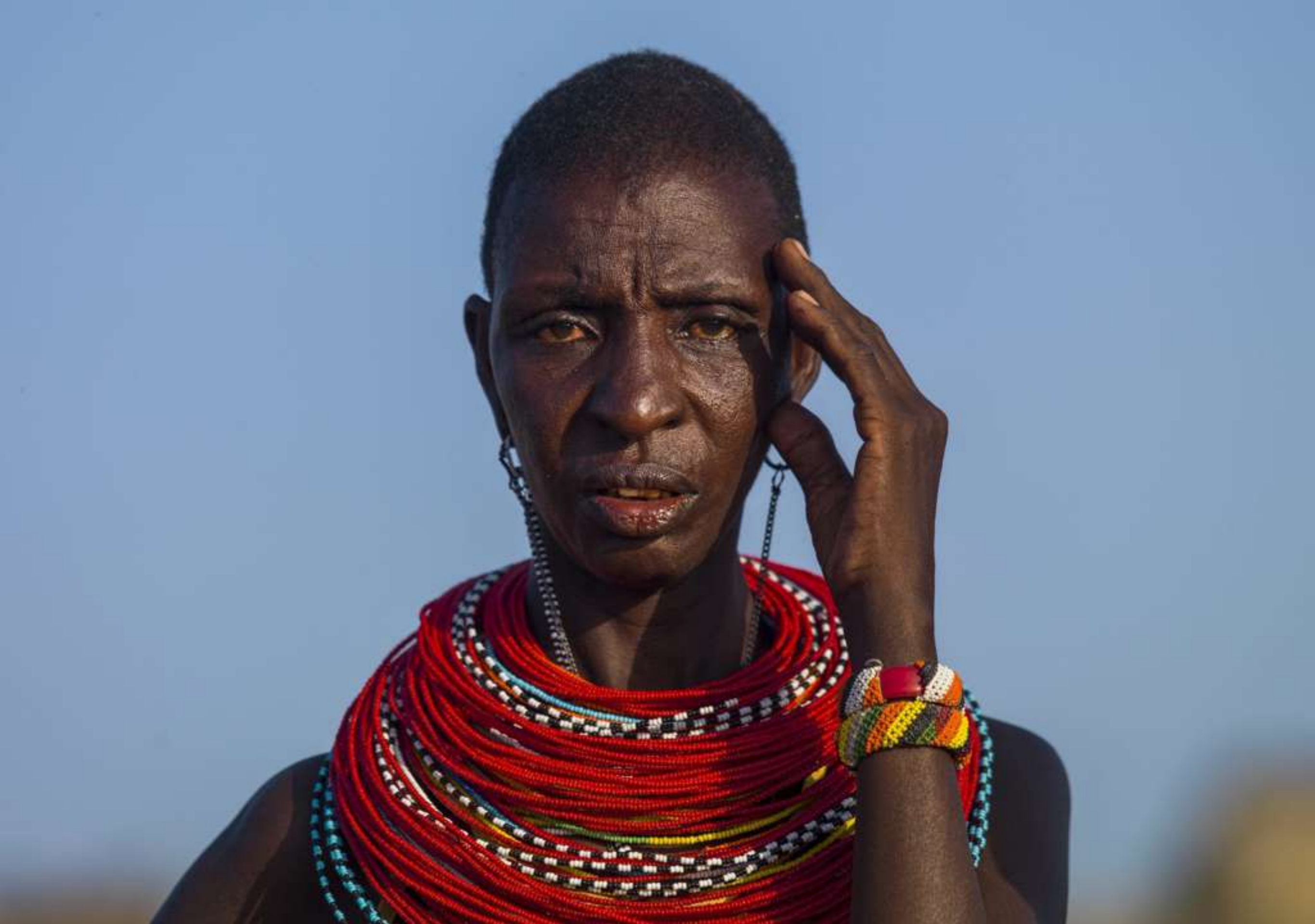
Their brown colored hair reveals their dietary deficiencies.