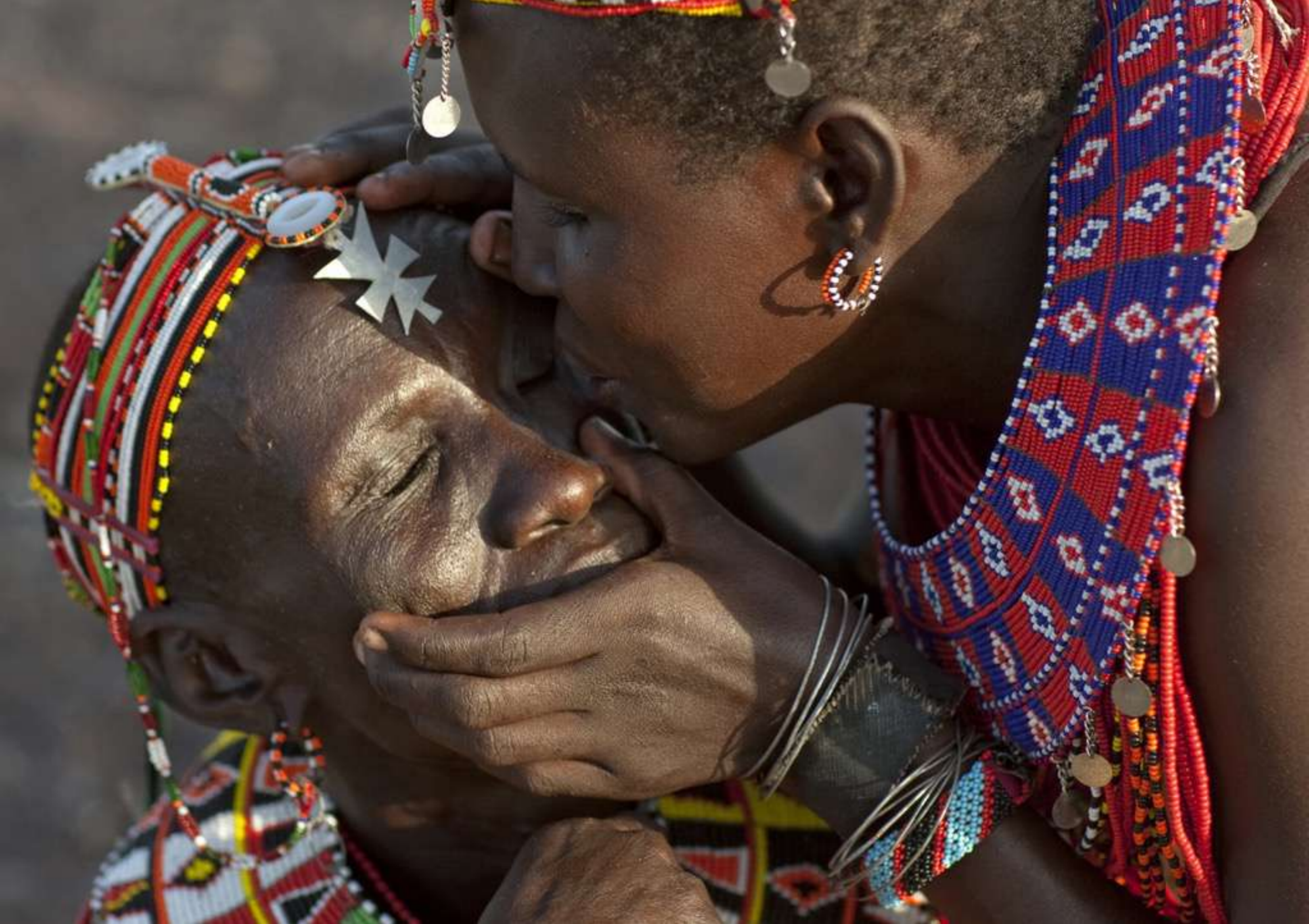
The winds are very strong in the region. The El Molo remove the dust from the eye of a friend by blowing into it.